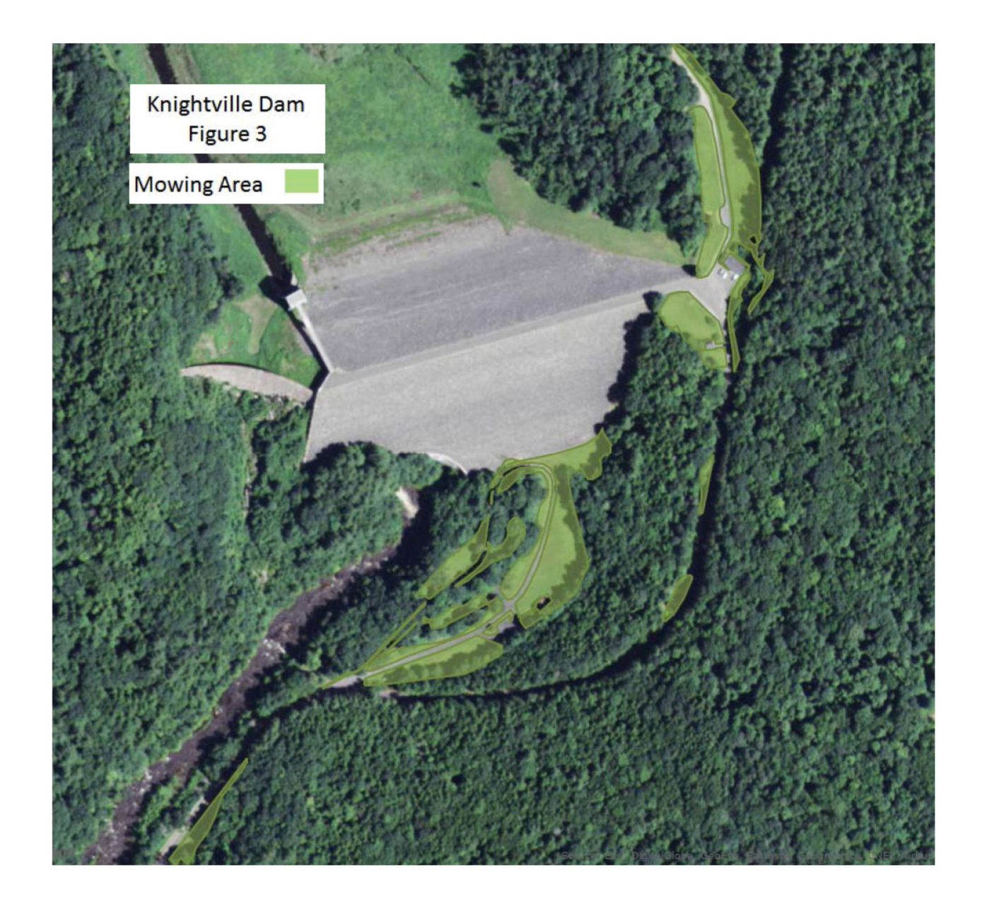
Figure 3: Knightville Dam mowing areas