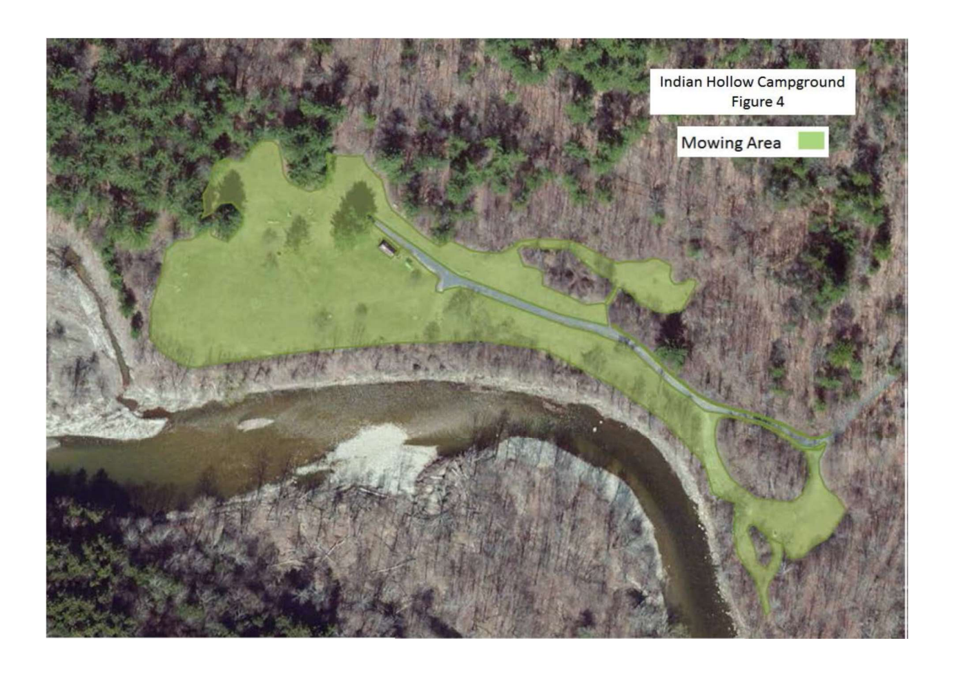
Figure 4: Indian Hollow Campground mowing area