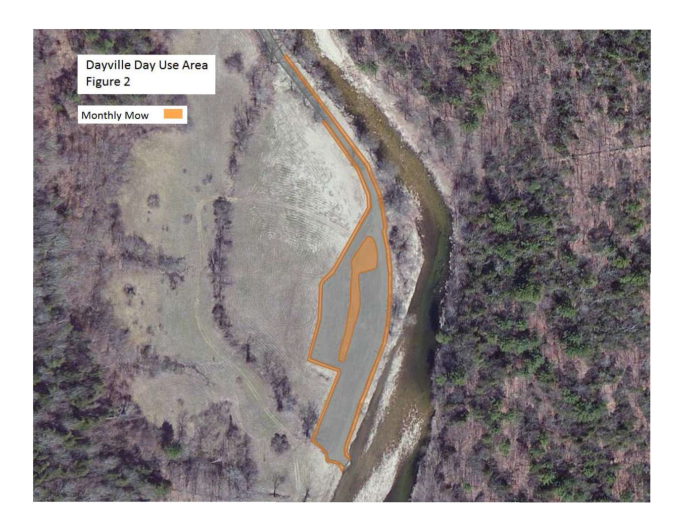
Figure 2: Dayville Canoe Launch mowing area