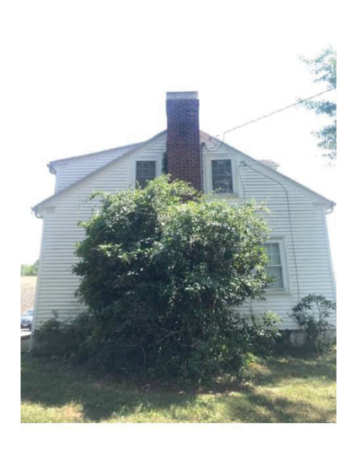
Side Exterior – West Facing