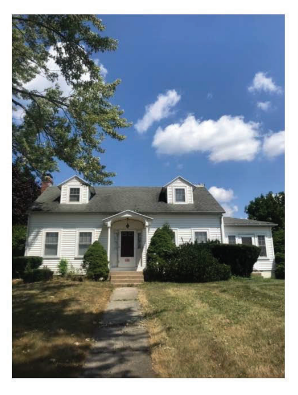
Front Exterior – SW Facing