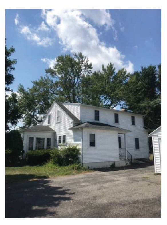
Rear Exterior – NE facing