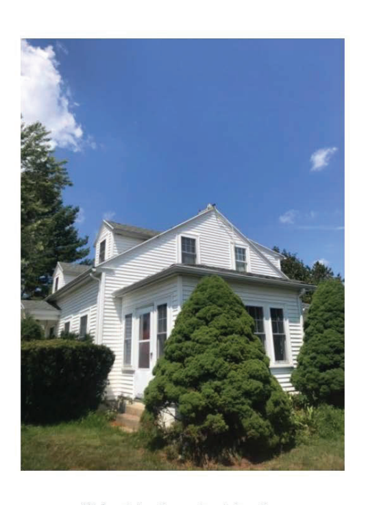
Side Exterior – East Facing