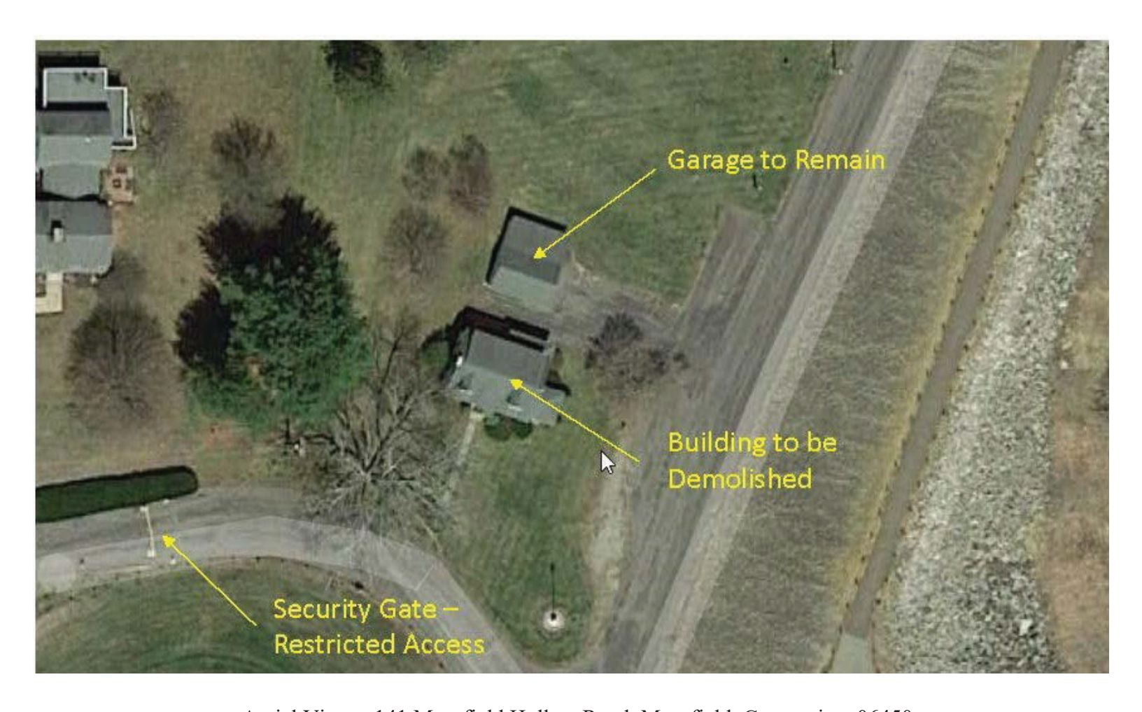
Aerial View – 141 Mansfield Hollow Road, Mansfield, Connecticut 06450