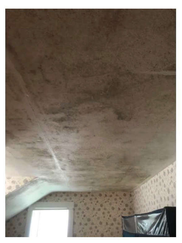
Typical Mold – 2<sup>nd</sup> Floor Bedroom