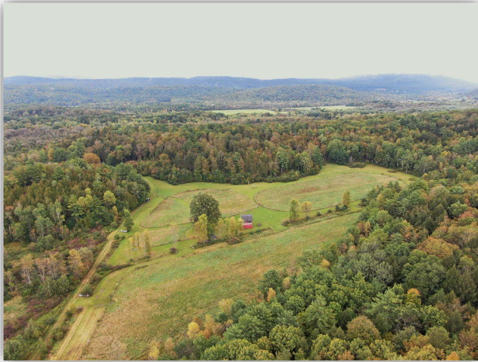
Otter Creek (Twin Oaks) Brandon, Vermont 2021.

Annual Report – January 1, 2021– December 31, 2021