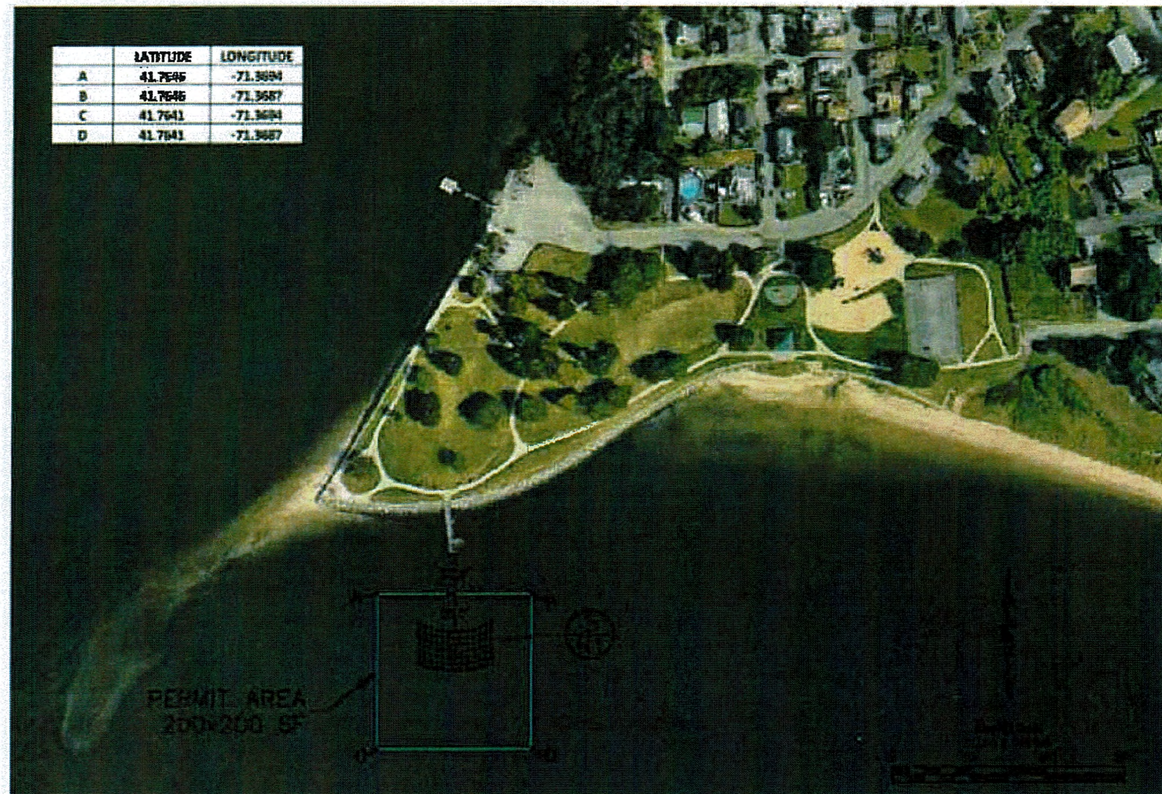
Figure 1. Sabin Point Park Fishing Pier, Sabin Point artificial reef area (teal line).