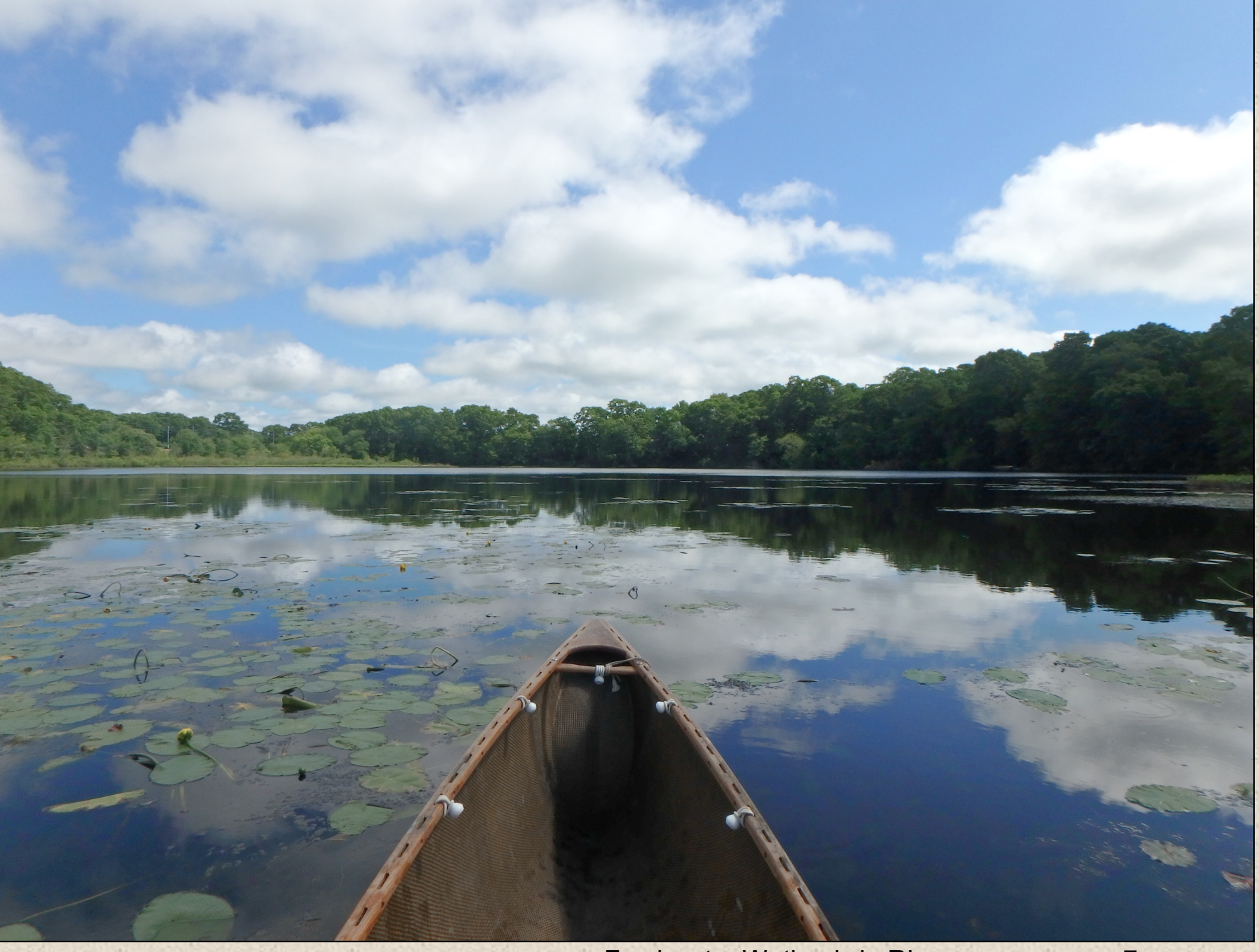
Freshwater Wetlands in RI