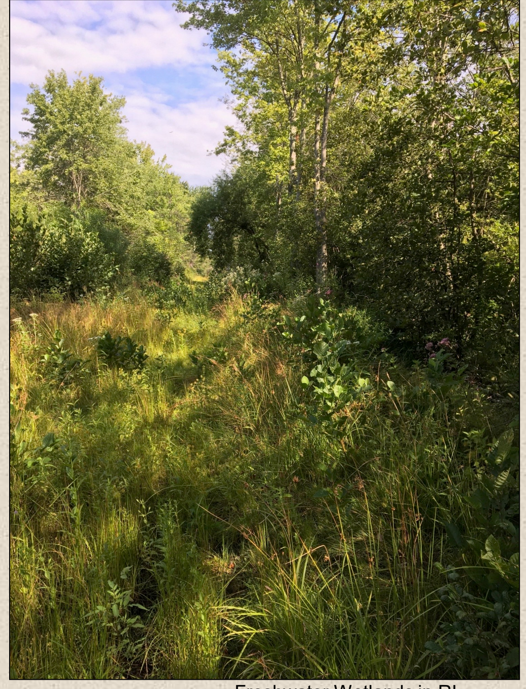
Freshwater Wetlands in RI