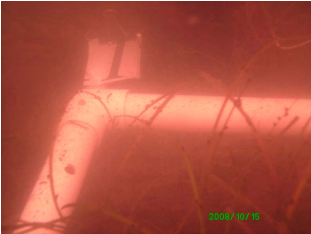
M 1 on 10/15/08 Monitoring Survey 4