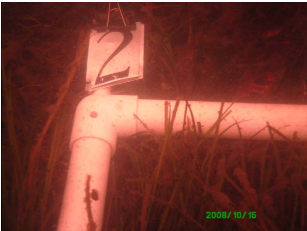
M 2 on 10/15/08 Monitoring Survey 4