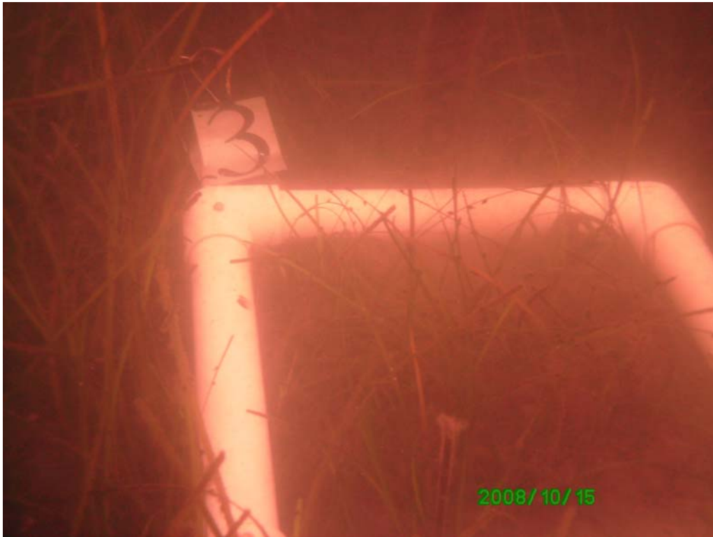
M 3 on 10/15/08 Monitoring Survey 4