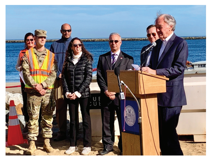
Sen. Edward Markey addresses the audience during the Newburyport Harbor media event.