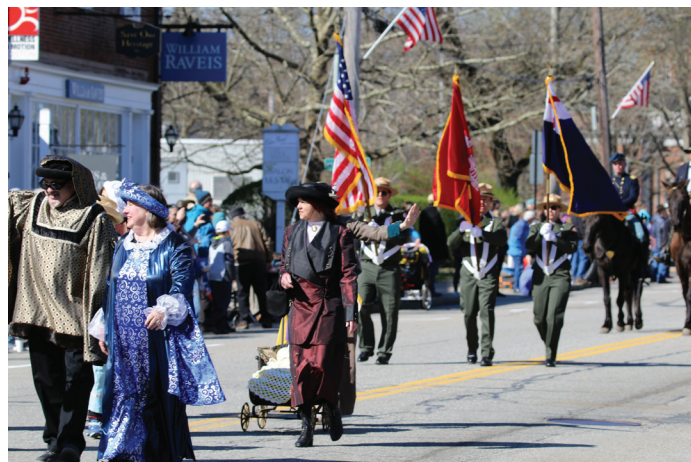
The New England District Ranger Color Guard march past crowded streets during the parade.

Patriots Day is a state holiday celebrated in multiple states all over the country as well as in the Commonwealth of Massachusetts. It is held each year on the third Monday in April to commemorate the battle of Lexington and Concord, the first shots fired in the American Revolutionary War. Events held all over the Commonwealth include the Concord events, re-enactments in Lexington, Massachusetts and the running of the Boston Marathon.