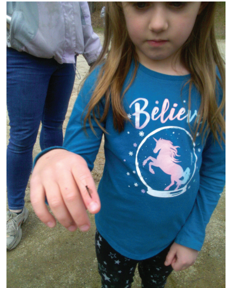
An Earth Day activity participant finds a Mayfly at West Hill Dam.