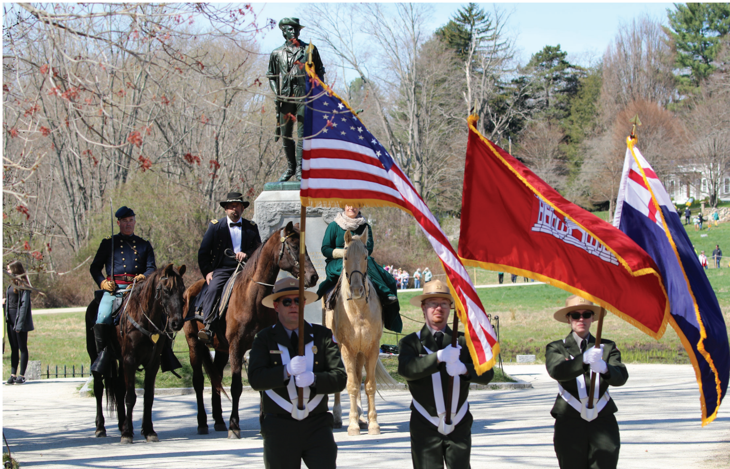
The New England District Ranger Color Guard stand by the Minuteman Statue during the wreath laying ceremony.