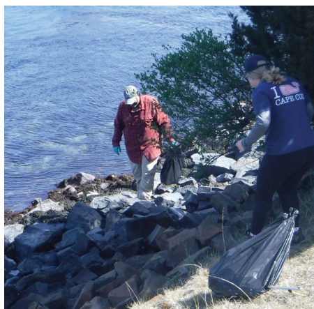
Volunteers pick up trash along the Cape Cod Canal.

"Event participants were given a reusable BINGO card with different items of litter on it," explained Carey. "If you brought back the card with a BINGO on it you received a prize. Prizes were also given to the volunteers who collected the most trash at each site."