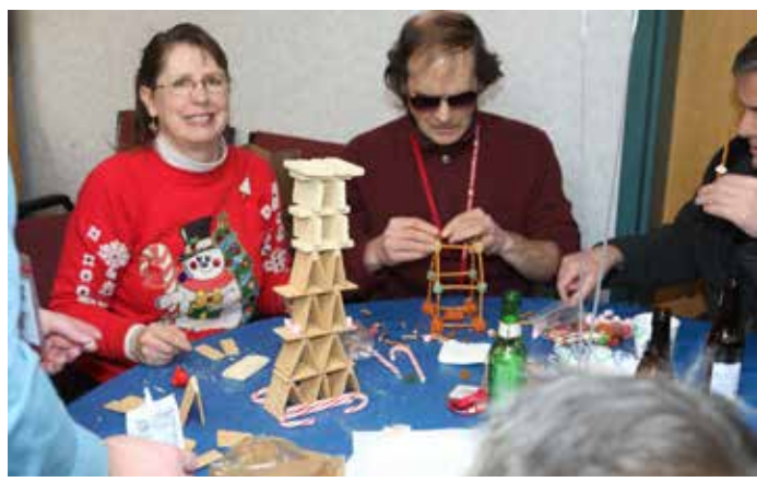
Party participants build their own "gingerbread houses" during the holiday celebration.