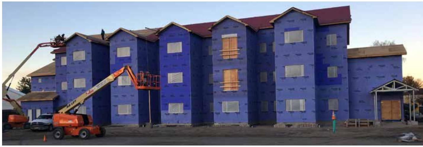
The Hanscom Air Force Base dormitory under construction.