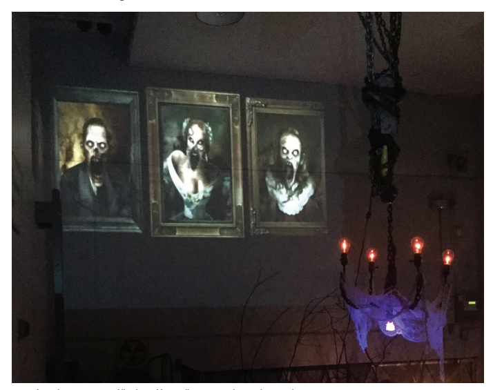
Spooky decorations filled Buffumville Dam throughout the tour.