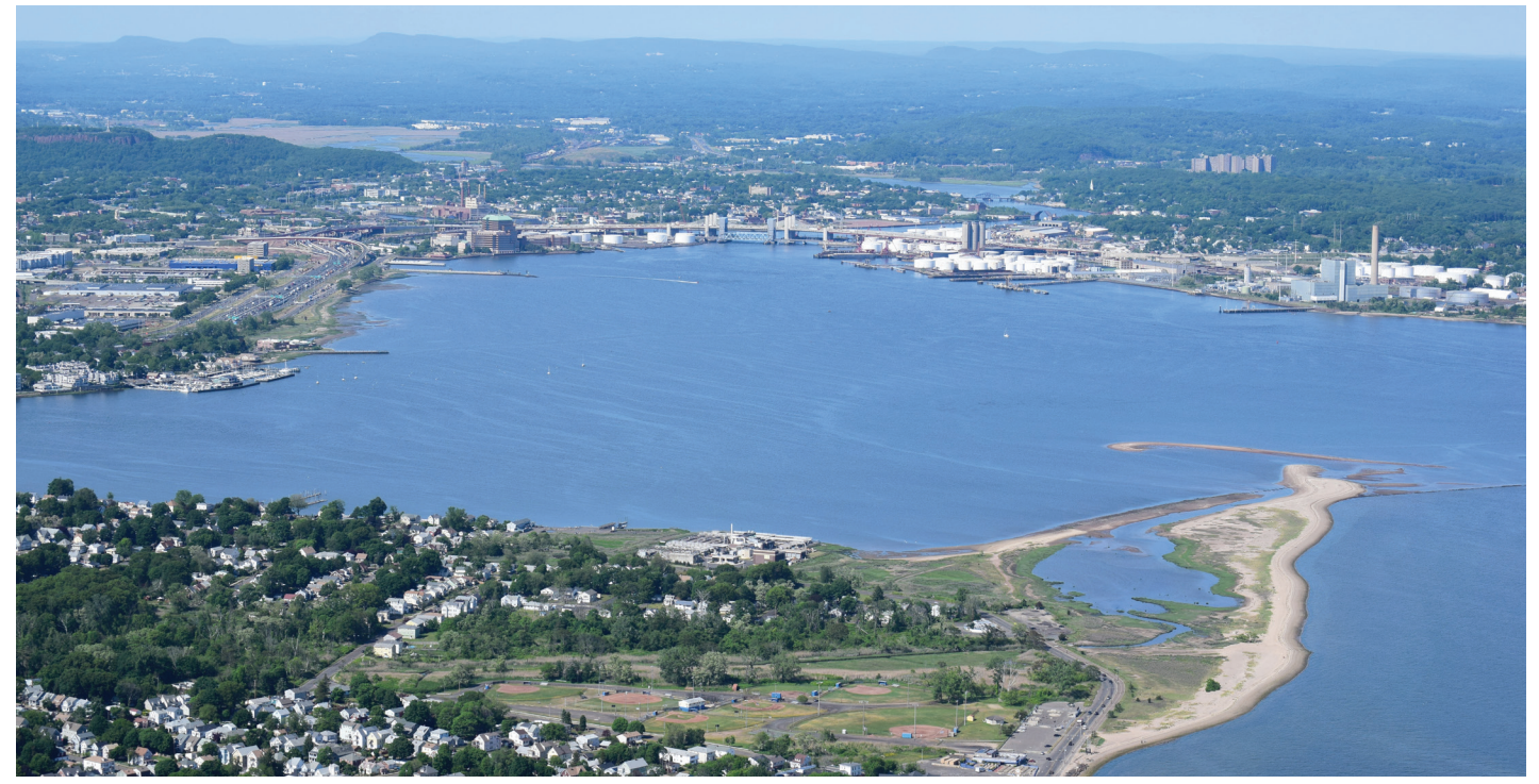
New Haven Harbor in Connecticut.