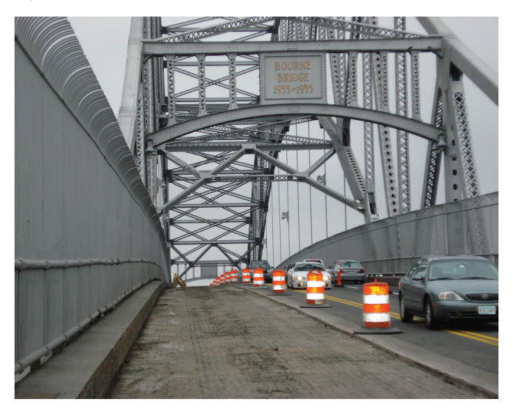
Repair work on the Bourne Bridge in 2010.

coordinate with appropriate state and Federal agencies and federally recognized Tribes to fully evaluate the alternatives.