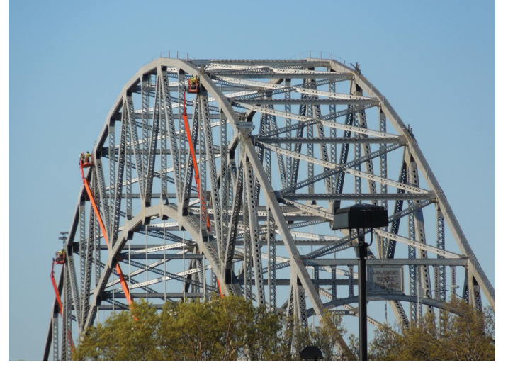
Workers prepare the Sagamore Bridge for painting in 2012.

As part of National Environmental Policy Act (NEPA) compliance, the Corps is seeking public input and will