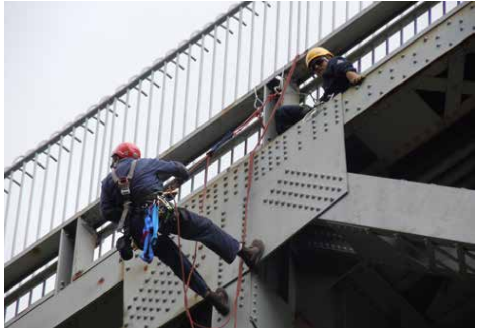
Workers perform an inspection of the Bourne Bridge's gusset plates in this August 2011 photo.

In New England, the Bridge Safety Program is currently collaborating with the U.S. Forest Service on a demonstration project to paint the North