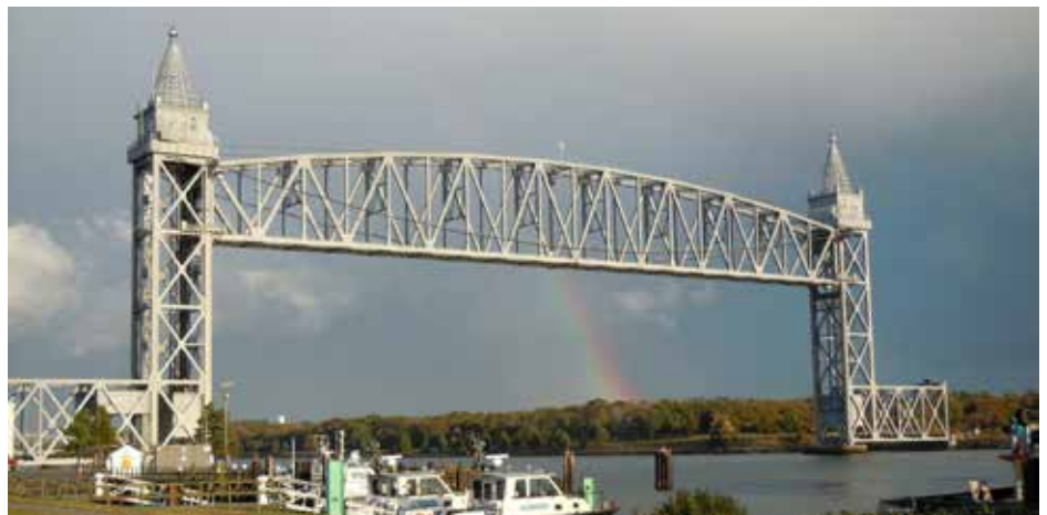
The Cape Cod Canal Railroad Bridge is operated and maintained by the New England District.