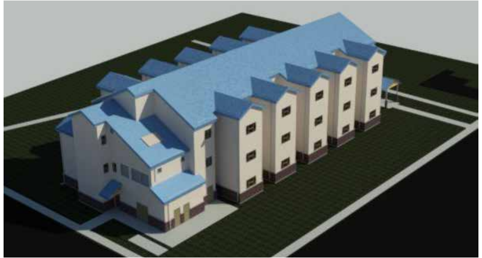
Artist's rendition of the new dormitory.

According to Tuttle, the dormitory will consist of two 2-bed units, two 3-bed units and 14, 4-bed units. “Each unit will contain a shared common area, kitchen, laundry area and bulk storage,” he said. “Each bedroom unit will have