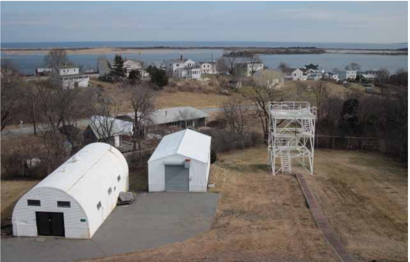
The Ipswich Antenna Testing Facility will be demolished under a $2 million contract.