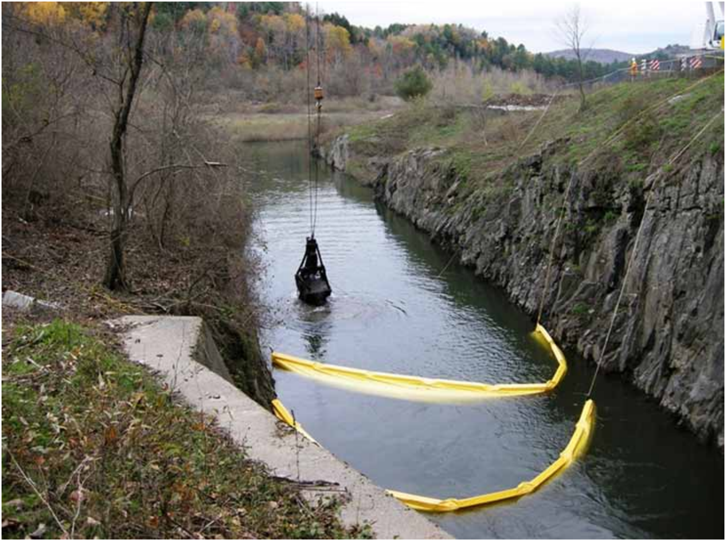
Contractor removes material from the intake channel at Union Village Dam.