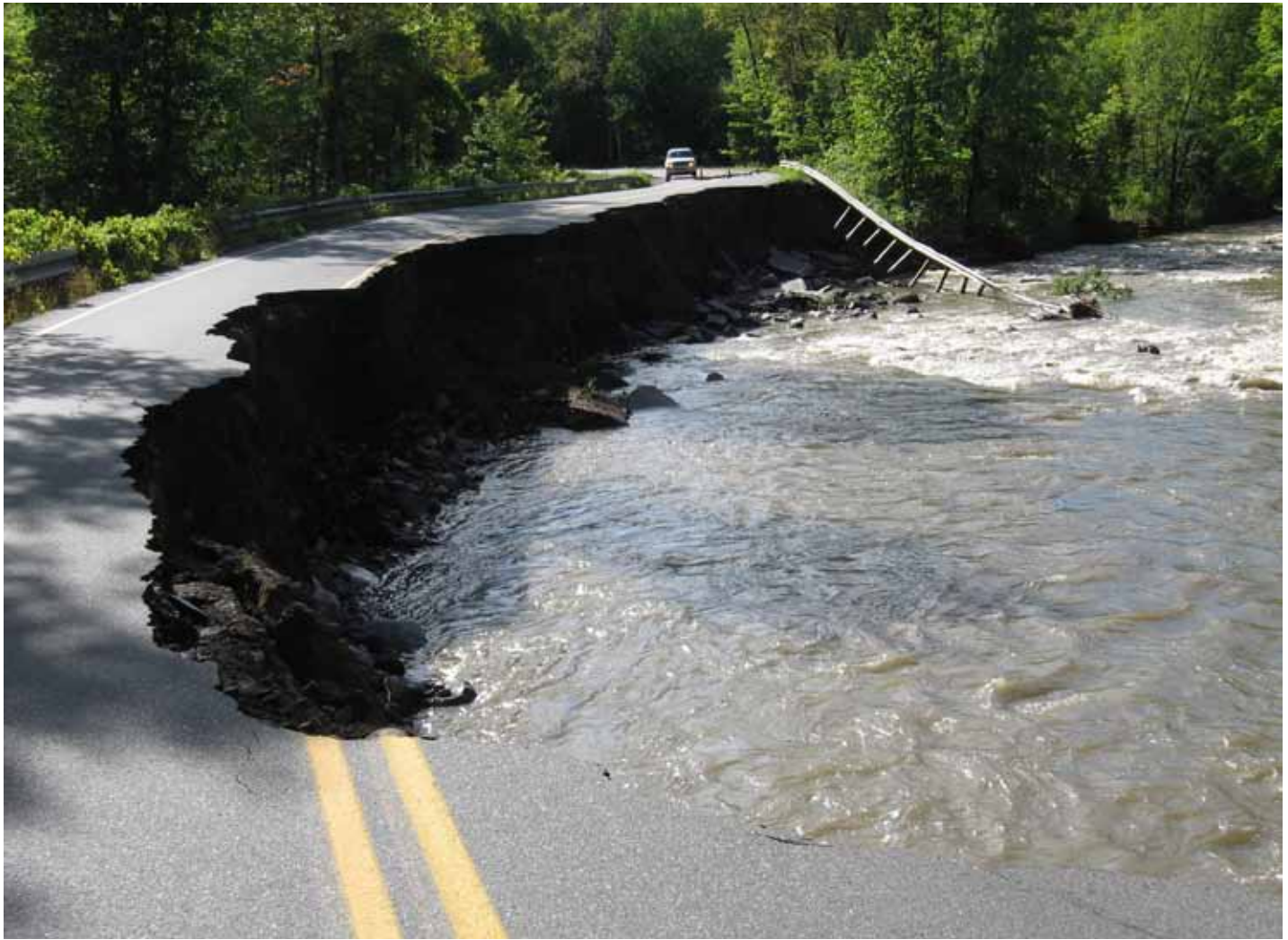
Hurricane Irene washed out many roads like the one above, causing delays hauling out material from Union Village Dam. Despite the challenges brought on by the storm, the District was able to complete the project on time. File photo

The District and Tantara teams soon found that other challenges to get the project completed were before them: A near vertical wall in part of the channel blocked a clear line of sight; stirring up sediment in the water would cause too much turbidity; uncertainty over how quickly the sediment would dewater in the dewater ponds, and additional uncertainty regarding how much water it would produce. With each challenge came a solution: The contractor used a crane and a spotter to guide the crane operator; the contractor installed turbidity curtains and conducted turbidity monitoring, and an option (which was not required) was put into place for a pumping system to pump excess water onto the dam's