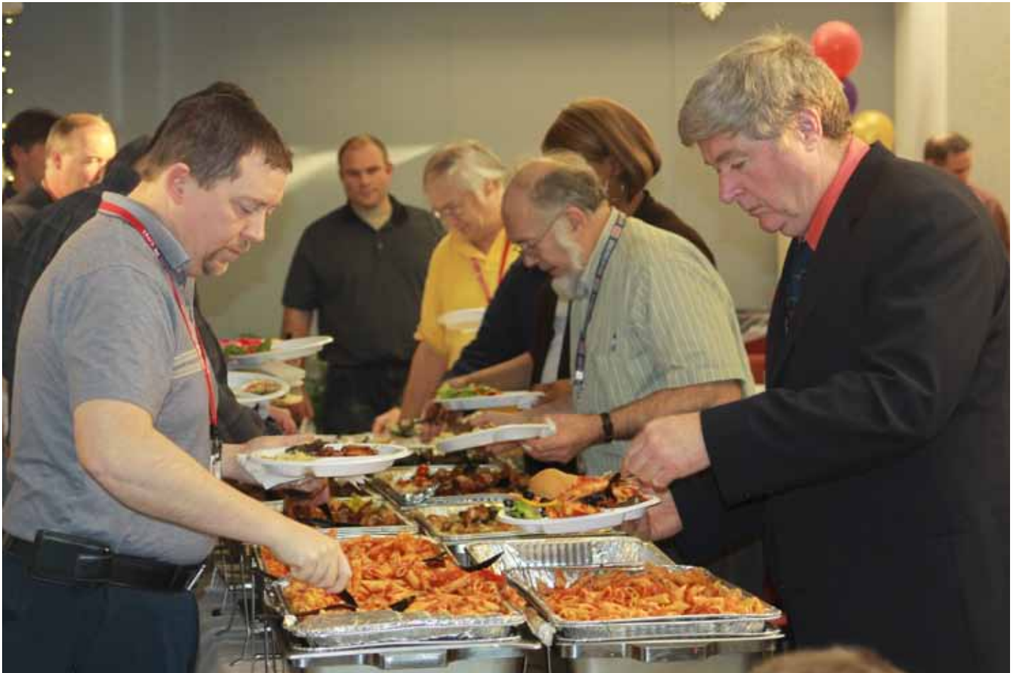
New England District VIPs enjoy a buffet lunch during the holiday party.