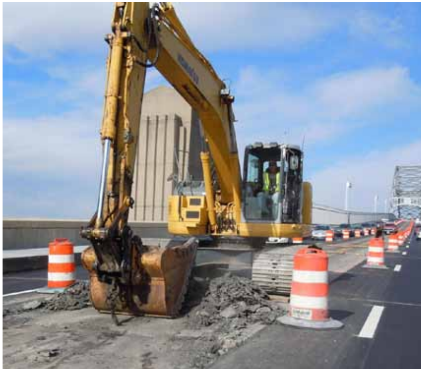
Repair work performed on the Bourne Bridge in 2010.

The Bourne Bridge won the American Institute of Steel Construction's Class A Award of Merit as "The Most Beautiful Bridge Built During 1934."