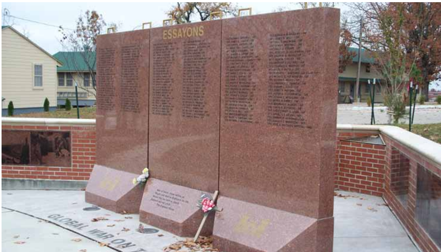
Sapper Grove at Fort Leonard Wood, Mo.