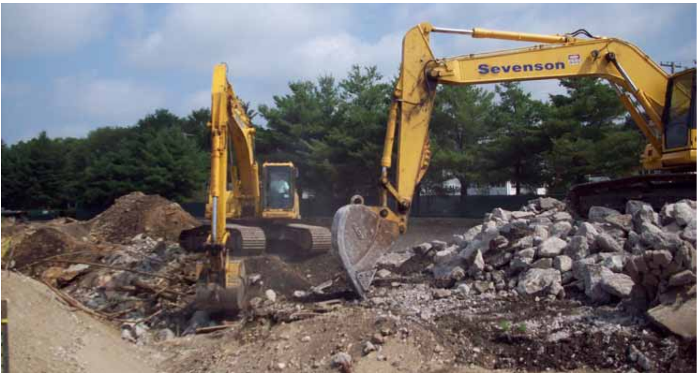
New England District contractor, Sevenson, performs work at the Hatheway & Patterson Superfund Site.