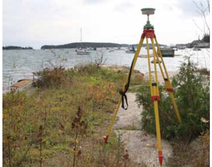
The "Norm 2011" survey marker at Stonington, Me.