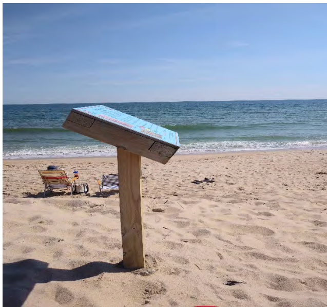
22. Side view.