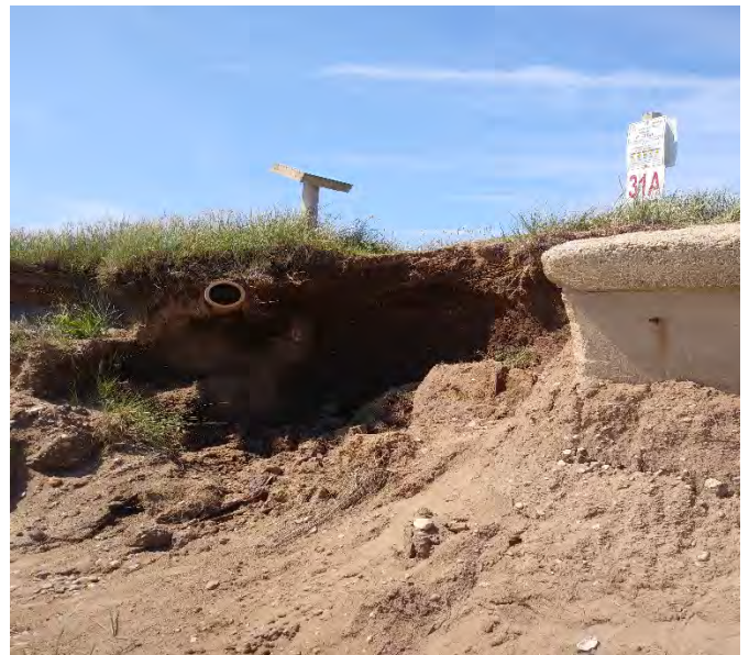
4. Erosion overview.