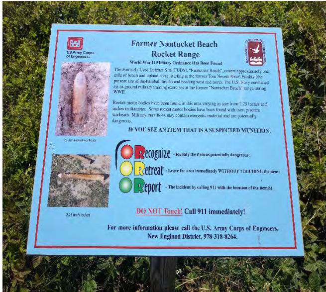
9. Sign facing southwest.