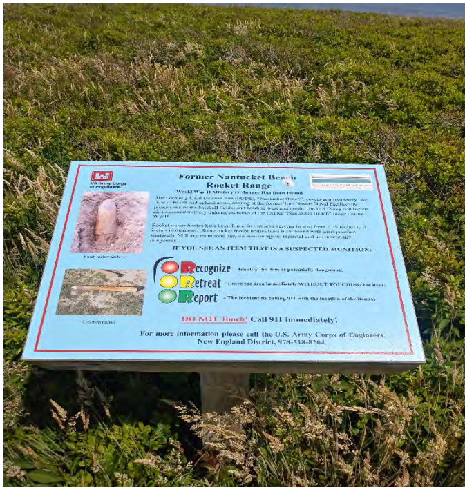
5. Sign facing north.