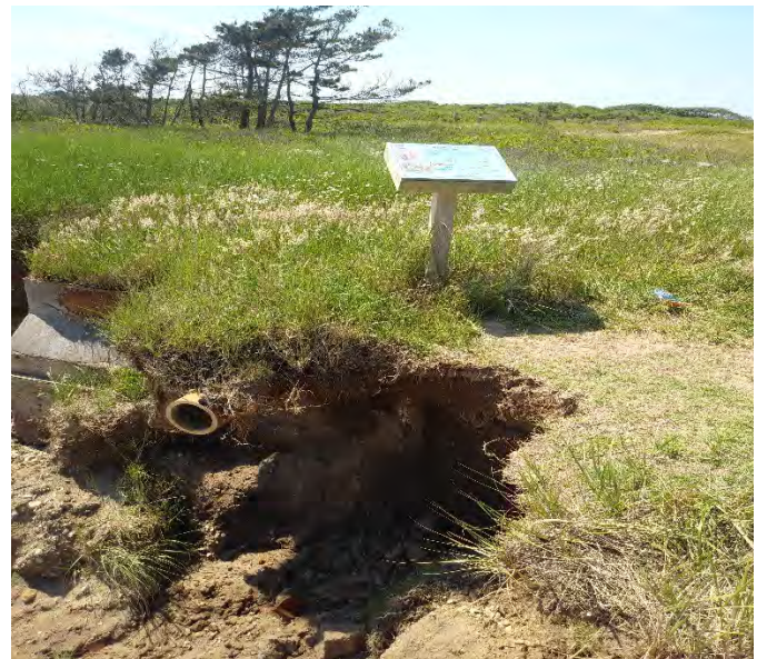
2. Severe erosion.