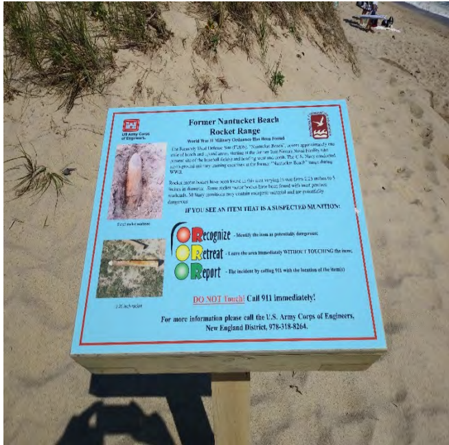
20. Sign facing east. Note bluff in background; slight bluff erosion relative to June 2018.