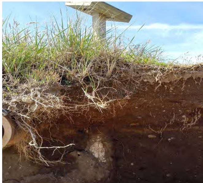
3. Erosion view from beach.