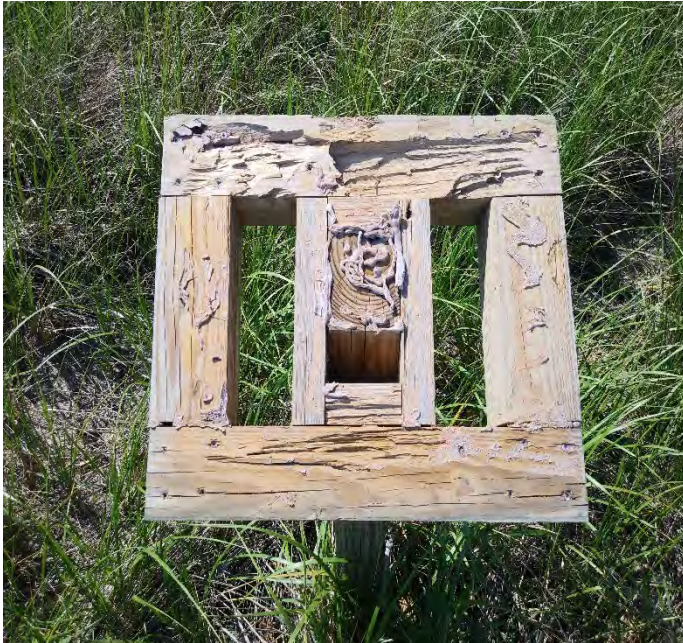
13. Sign facing missing.