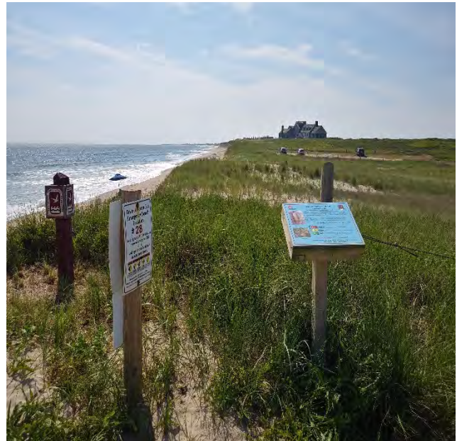
17. Approach to sign from parking lot.