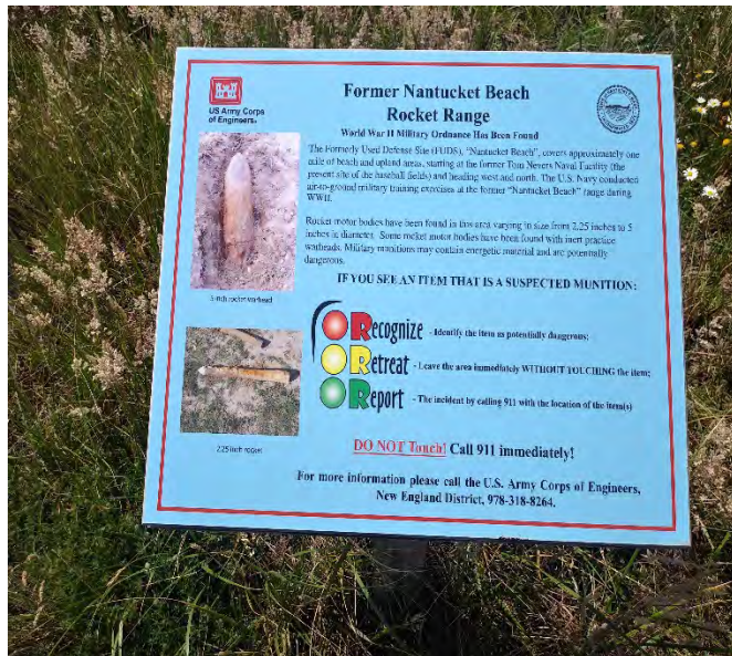
1. Sign facing southwest.