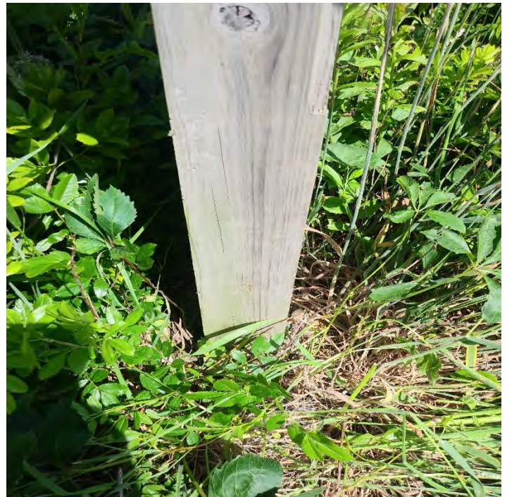
6. Close up (excellent condition).