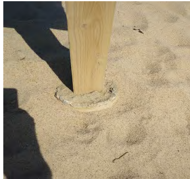
23. Pedestal closeup.