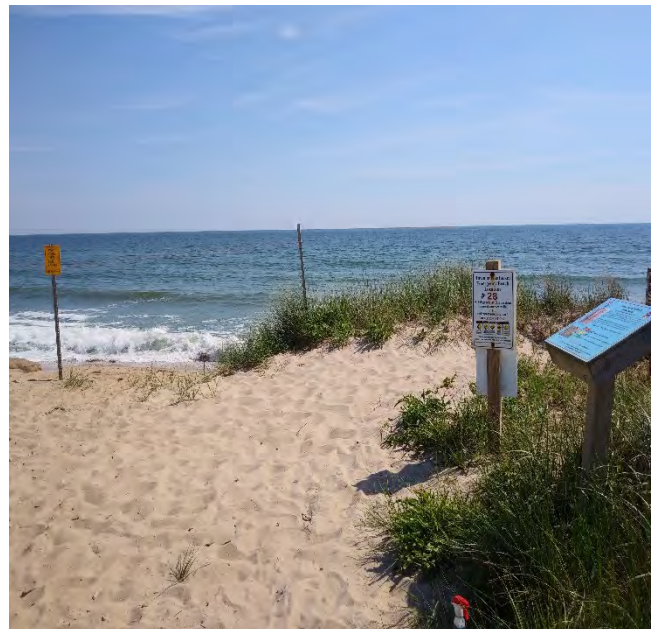
19. Beach view, facing east.