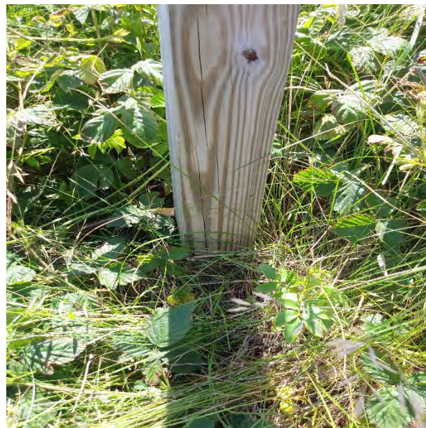
12. Pedestal in excellent condition.