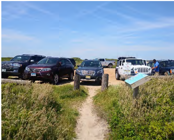
7. Sign approach.