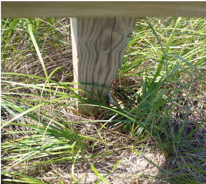
15. Pedestal in good condition.