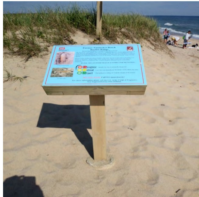
21. Slight erosion around pedestal.