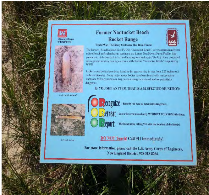
16. Sign facing southwest.