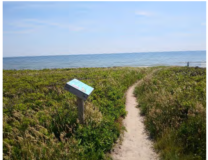
8. Sign and pathway to beach.