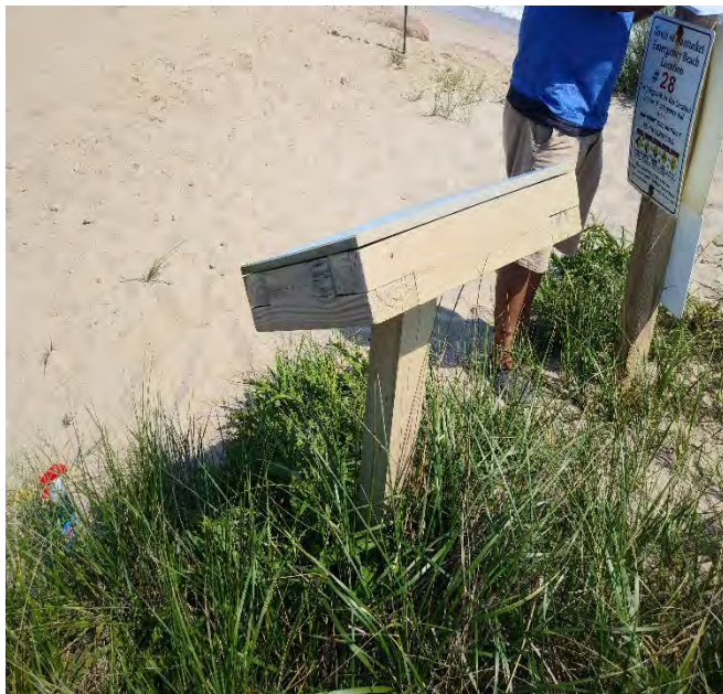
18. Side view.