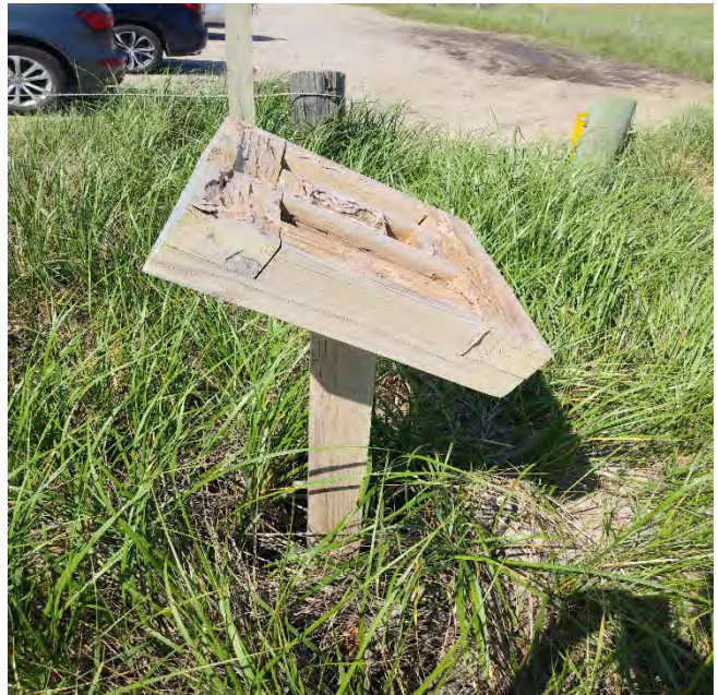
14. Side view.