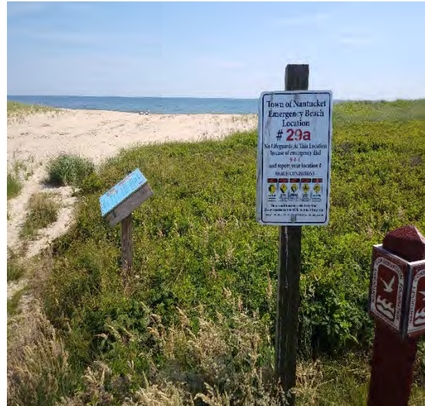
10. Approach to sign.