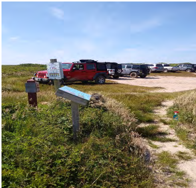
11. View from beach.