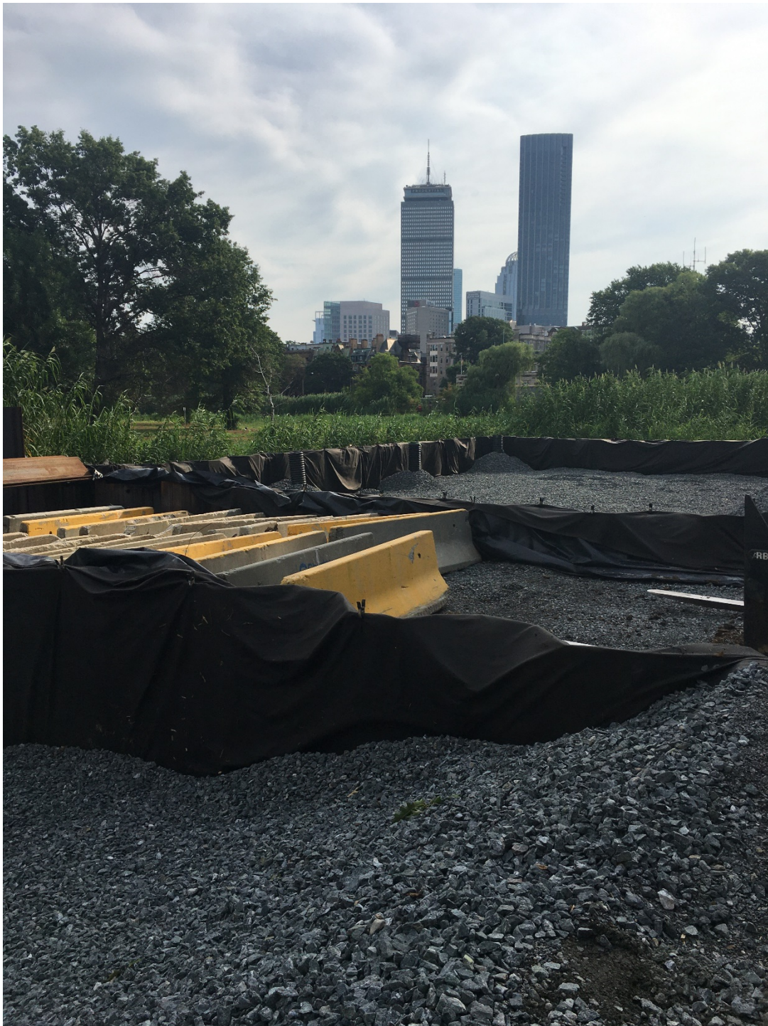
Central Processing Facility at Work Area #11 – bins constructed out of steel sheeting; lined with geotextile fabric; and topped with gravel – ready to receive dredged sediment from the river to be processed for disposal.