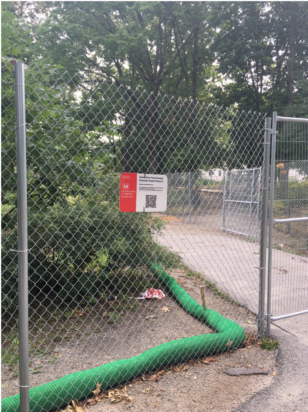
Temporary construction fencing near Work Area #10 – Muddy River Project Update sign with QR code attached for public information.