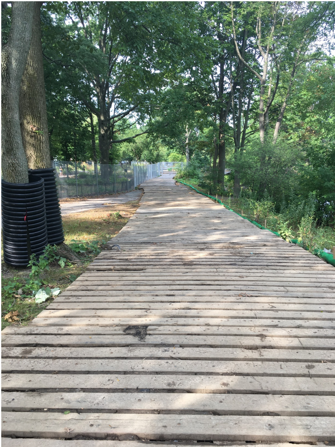
Construction Access road near Work Area #10 - 8" wood chips and timber matting for existing tree root protection, along with the corrugated plastic wrap around existing tree trunks.