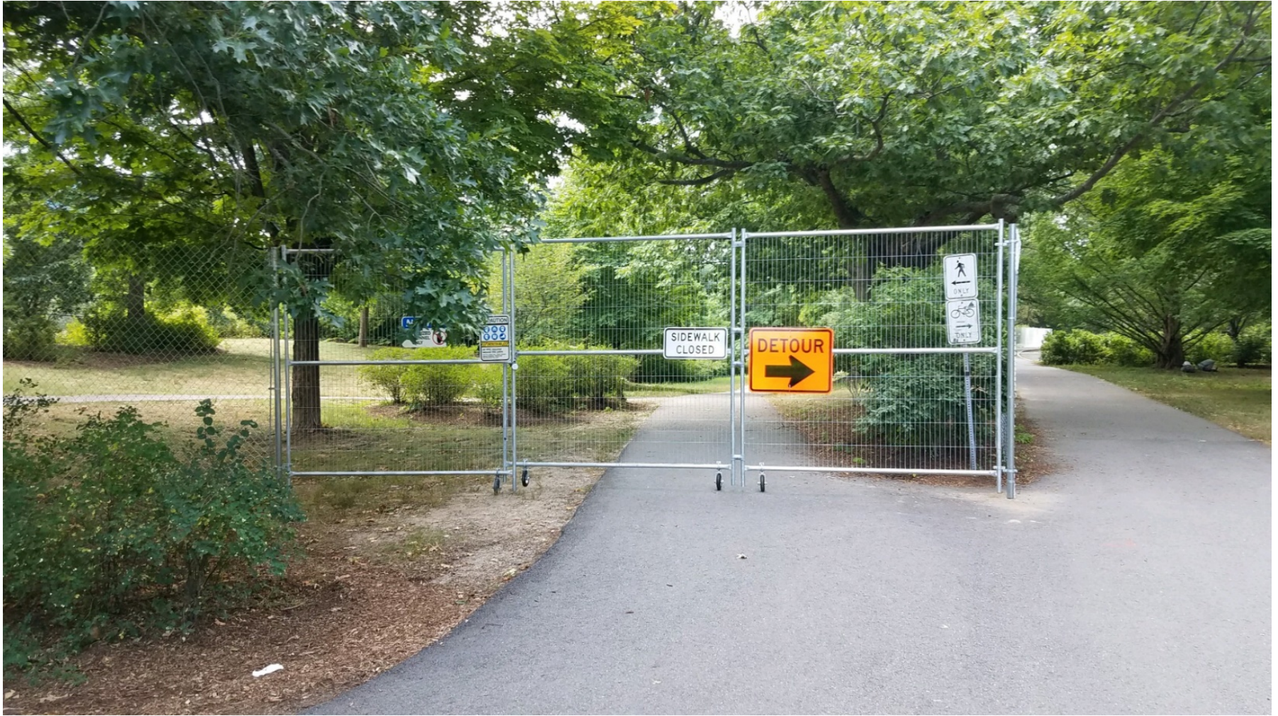
Temporary construction fencing at Work Area #1 – continued access provided for pedestrian and bicyclist traffic.