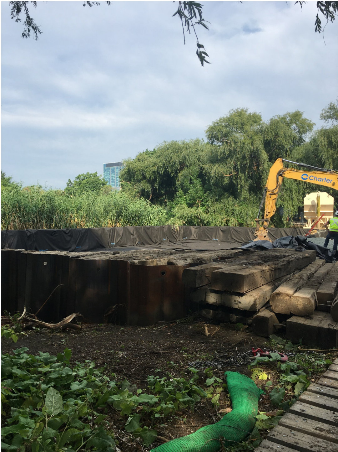
Constructing Central Processing Facility at Work Area #10 – steel sheeting and geotextile fabric installed. Placing gravel at the bottom of the bin.