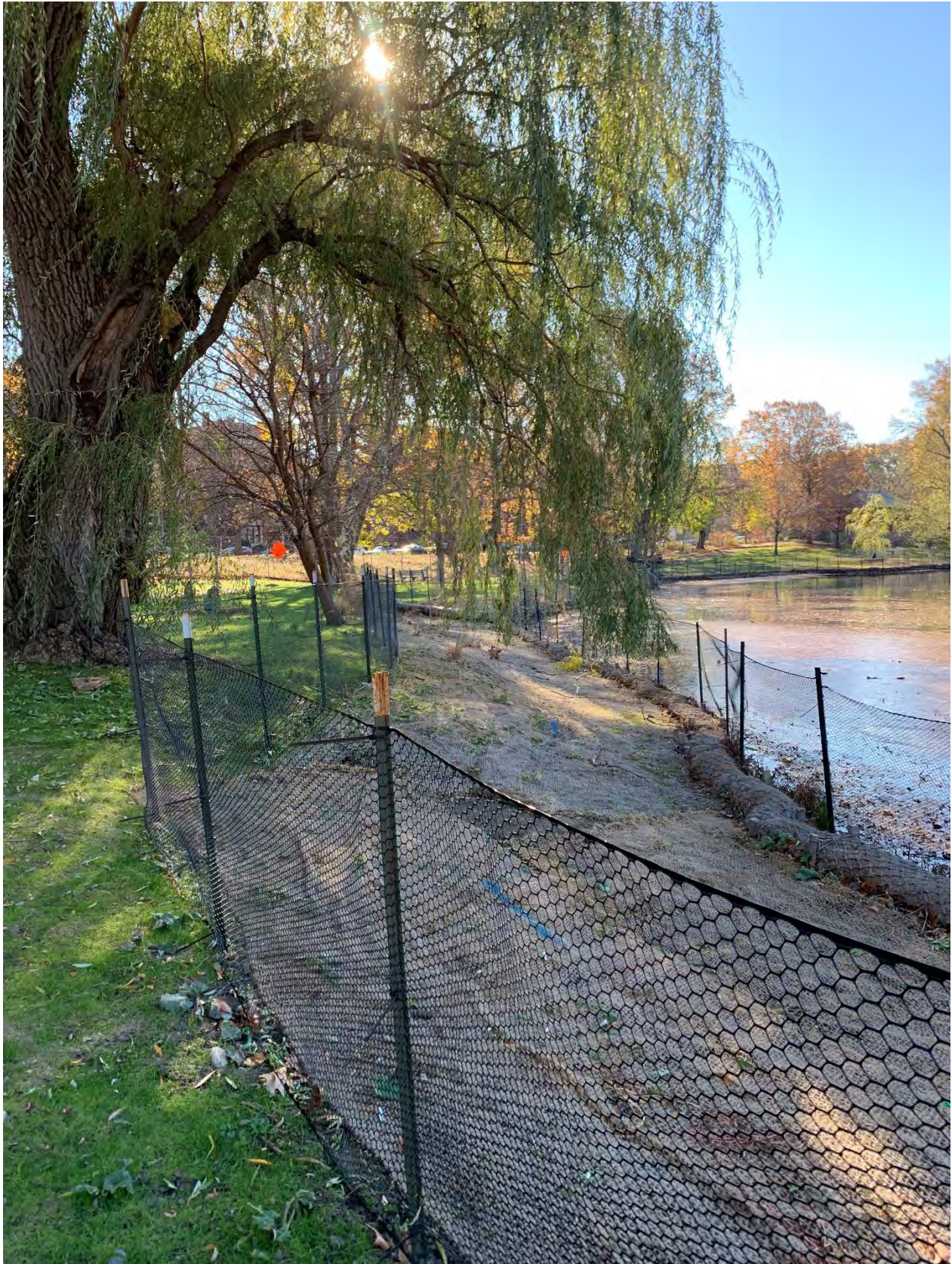
Work Area #10 – section of river immediately downstream of Work Area #9 which ends at Agassiz Road – flood risk management channel dredged and phragmites removed from bank. Turf reinforcement mattress and wetland seed installed. Maintenance of planted material will continue until October 2024 during the two-year guarantee period.