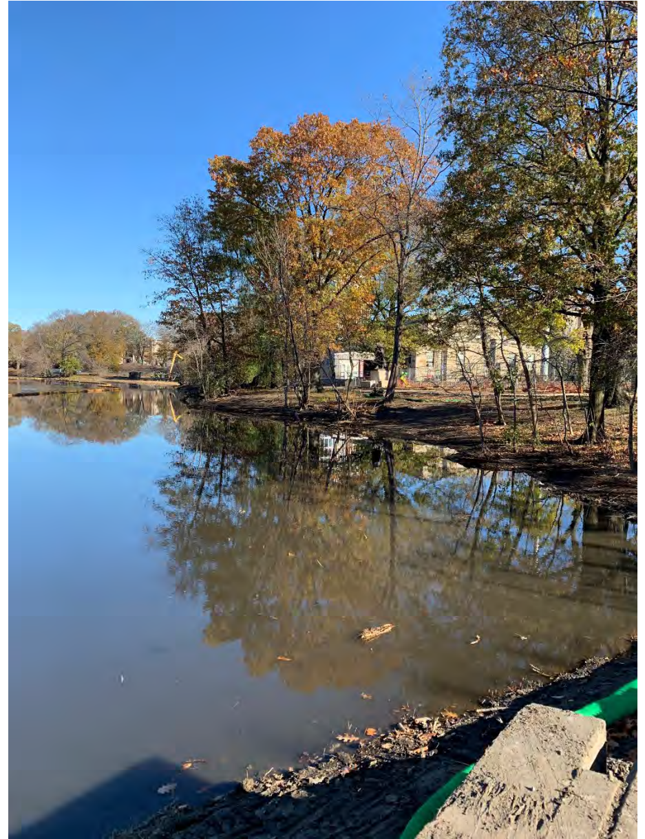
Work Area #11 – Additional Phragmites Removal – section of river downstream from the central processing area near Agassiz Road – picture on left shows the phragmites cut and the area ready for dredging (late October); and picture on right shows the area dredged and phragmites removed (late November). With the removal of the phragmites, the Boston Fire Department can be seen from across the river!