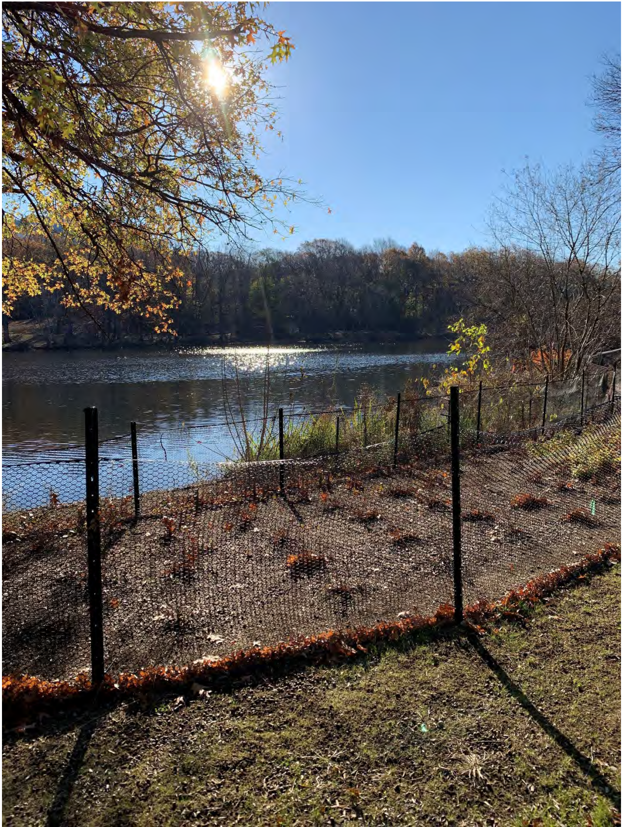
Work Area #1 – Leverett Pond – view of the pond with the sandbar island removed; and the bank planted and restored. Plants will be maintained until October 2024 during the two-year guarantee period.