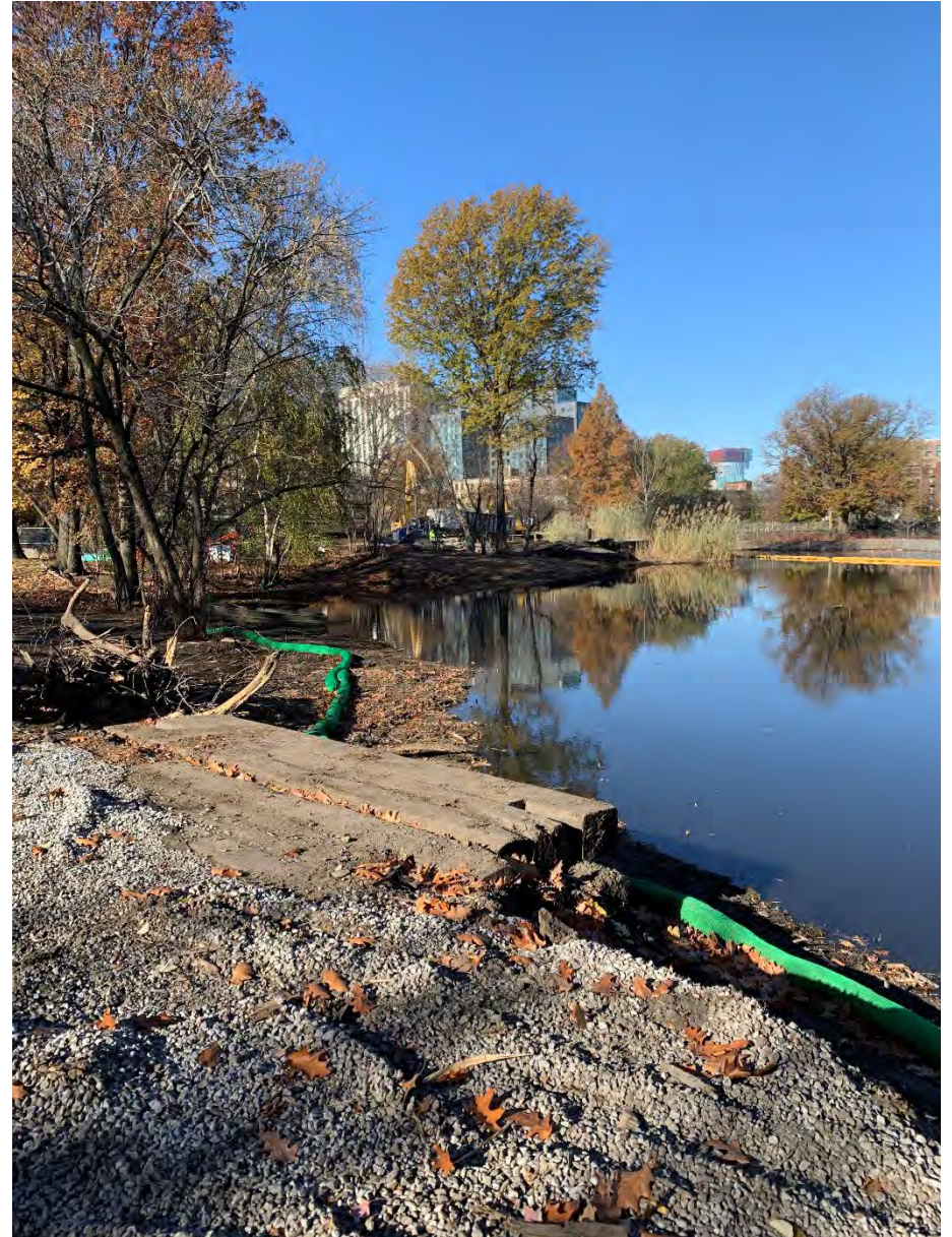
Work Area #11 – Additional Phragmites Removal – section of river downstream from the central processing area near Agassiz Road – picture on left shows the phragmites cut and the area ready for dredging (late October); and picture on right shows the area dredged and phragmites removed (late November).