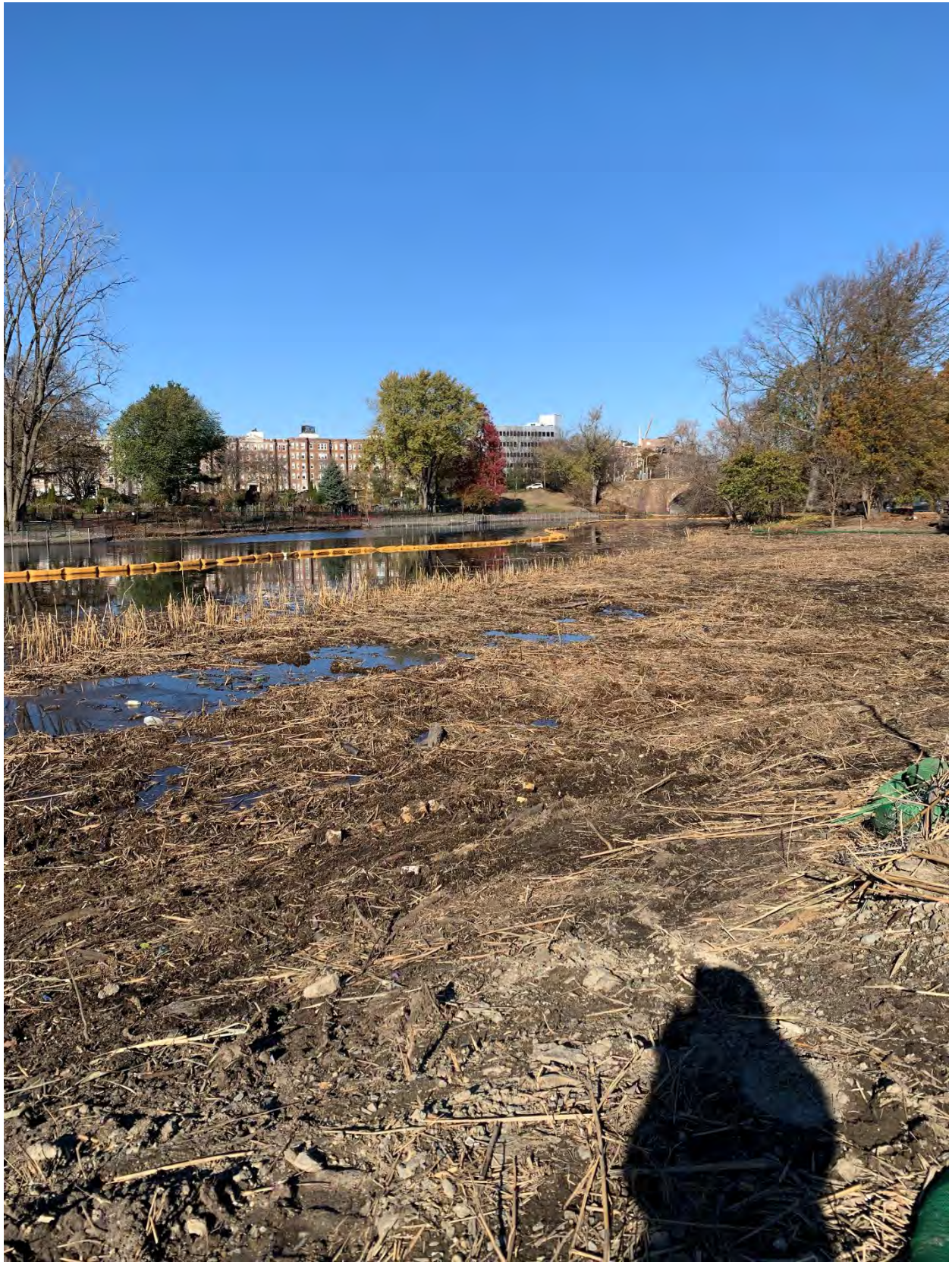
Work Area #12 – Additional Phragmites Removal – section of the river near Boylston Street Bridge – phragmites cut and the area ready for dredging.