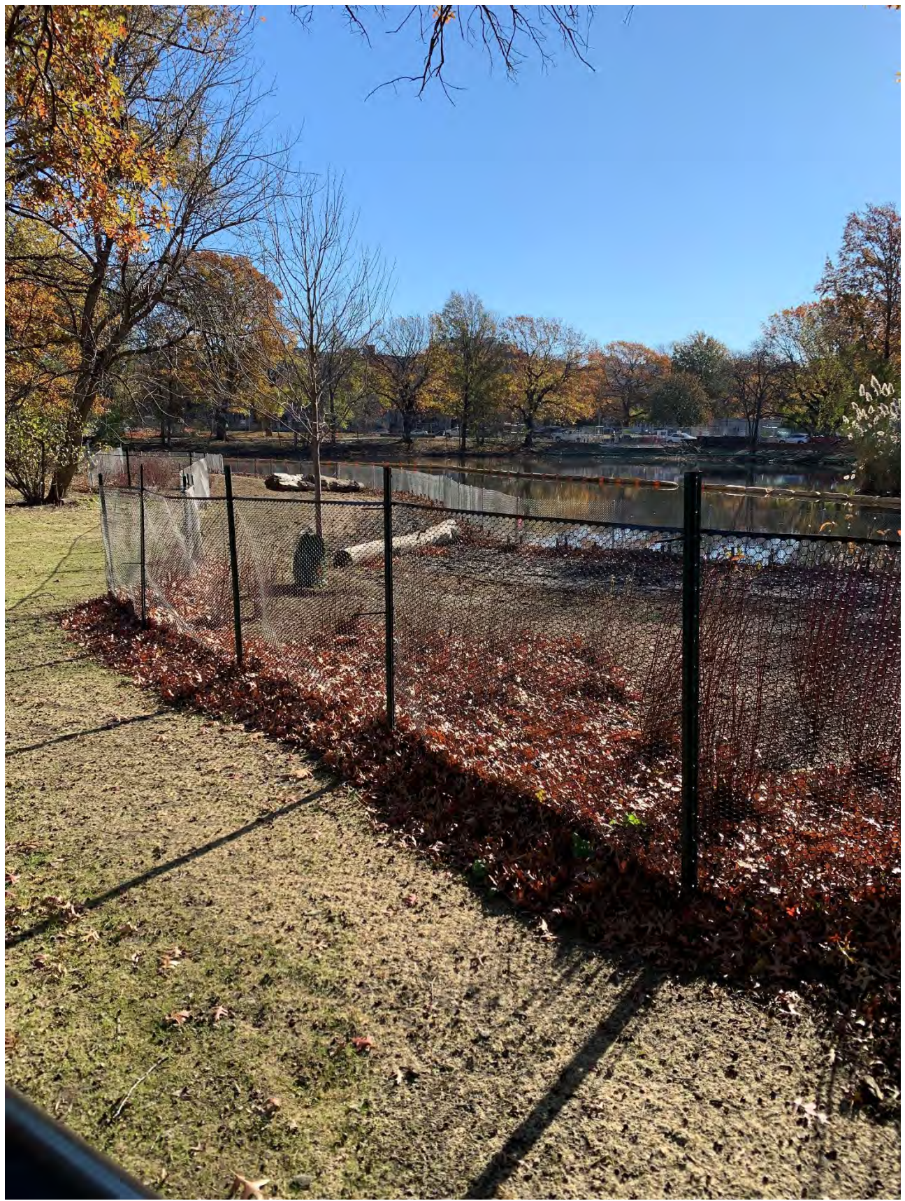
Work Area #11 – Victory Gardens Area – section of the river downstream of Agassiz Road Bridge – restored banks with trees, emergent, and habitat logs. Maintenance of planted material will continue until October 2024 during the two-year guarantee period.