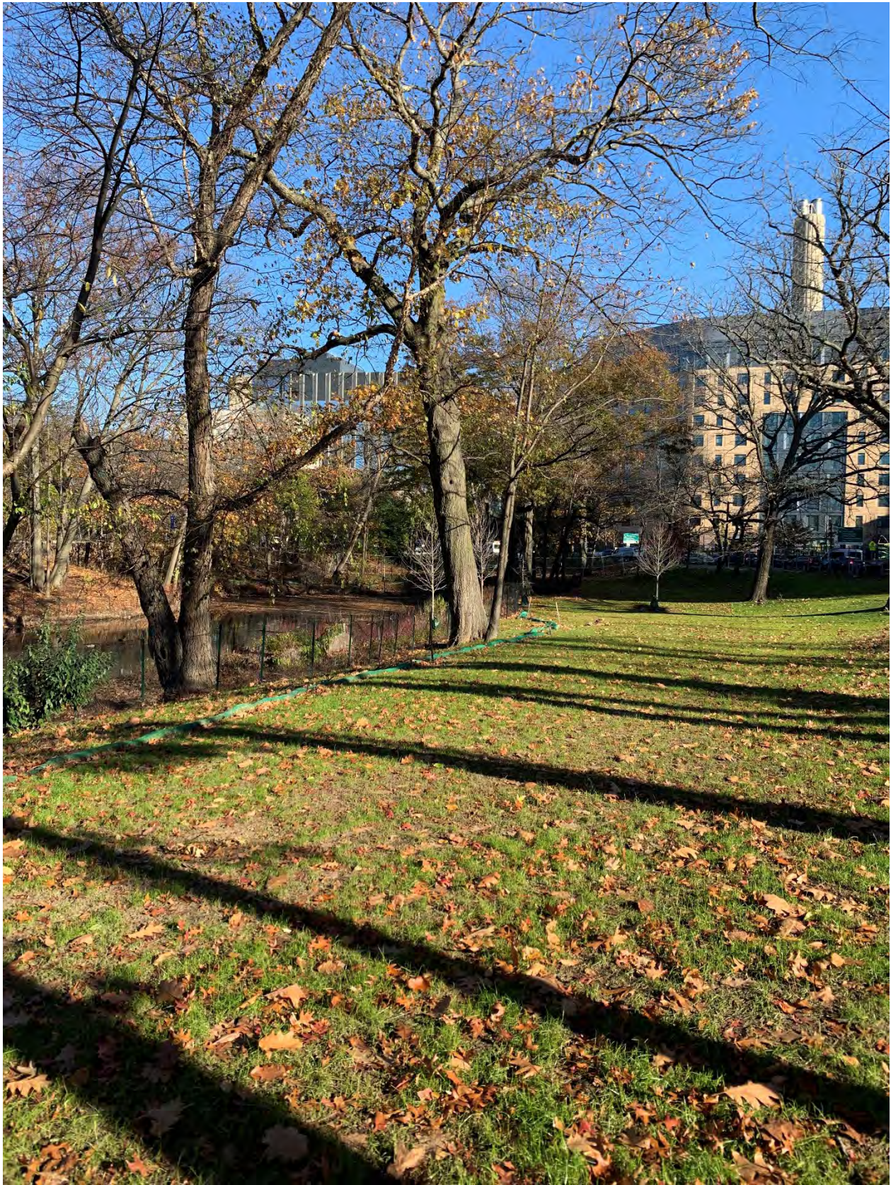
Work Area #2 – section of river at Brookline Avenue and the Riverway – area restored with plantings and access/staging areas restored with loam and seed. Plants will be maintained until October 2024 during the two-year guarantee period.