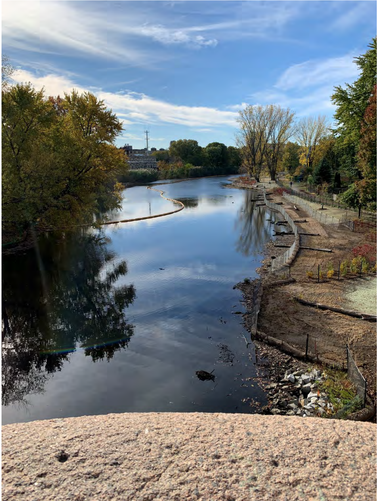
Work Area #12 – section of river at Boylston Street Bridge – Flood risk management channel dredged and the bank planted at the Victory Gardens.