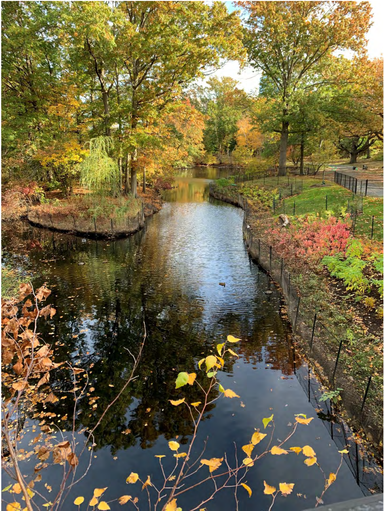
Work Area #5 – section of river by Short Street Bridge (looking downstream) – flood risk management channel dredged and the bank planted with trees and shrubs. Plants will be maintained until October 2024 during the two-year guarantee period.