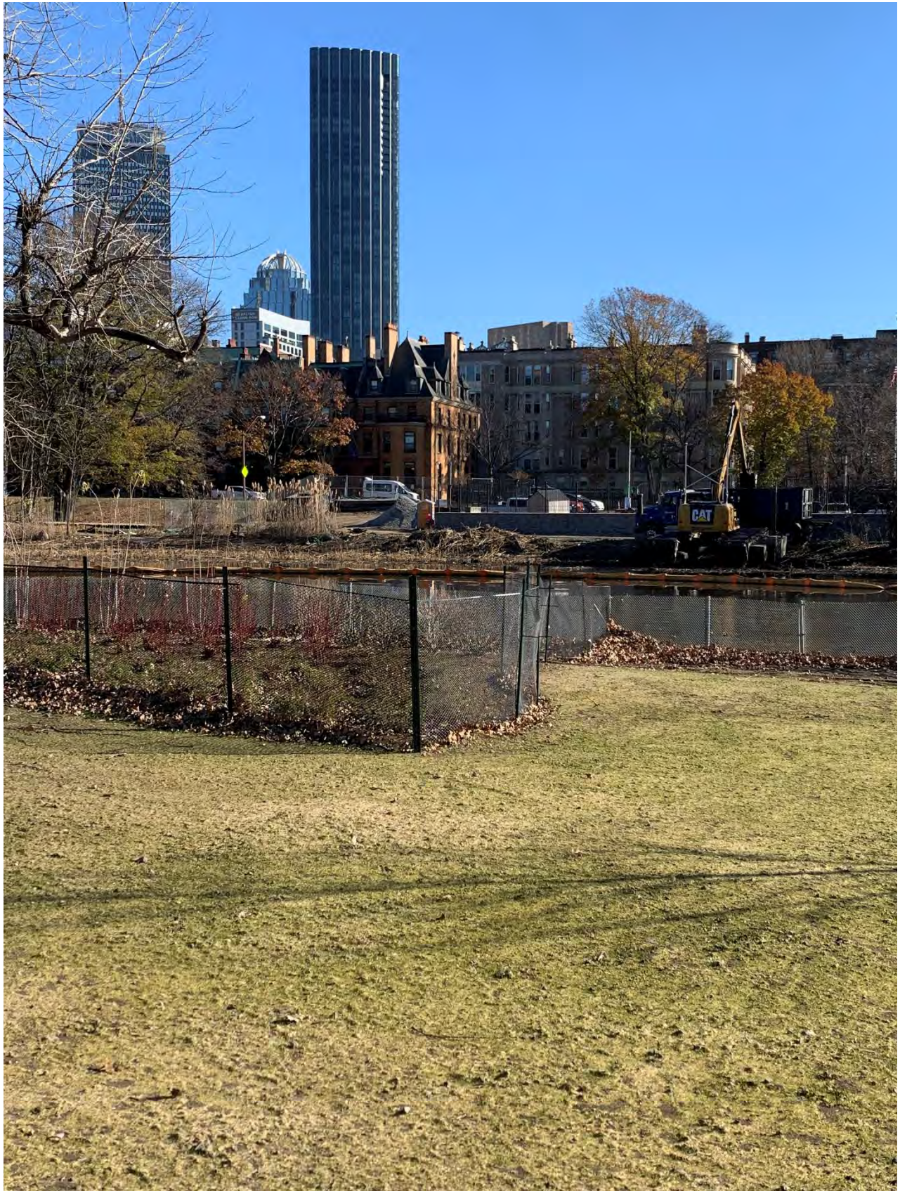
Work Area #12 – Additional Phragmites Removal – section of the river near Boylston Street Bridge – amphibious excavator removing the phragmites. View looking across the river – with the phragmites removed – you can see the newly constructed floodwall at the Boston Fire Department Building.