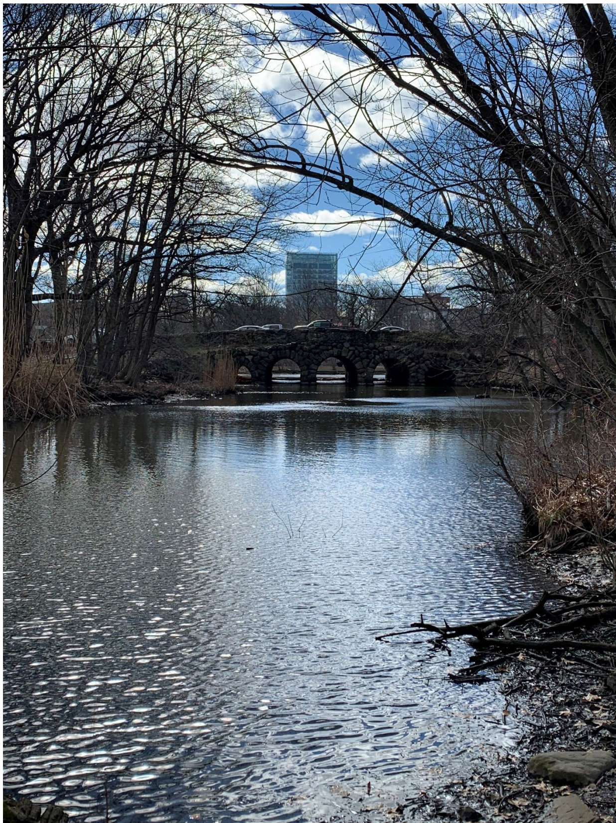
Work Area #11 - section of river immediately downstream of Work Area #10 - view of the Agassiz Road Bridge from downstream of the river. Phragmites will be removed and channel dredged immediately downstream of the bridge.