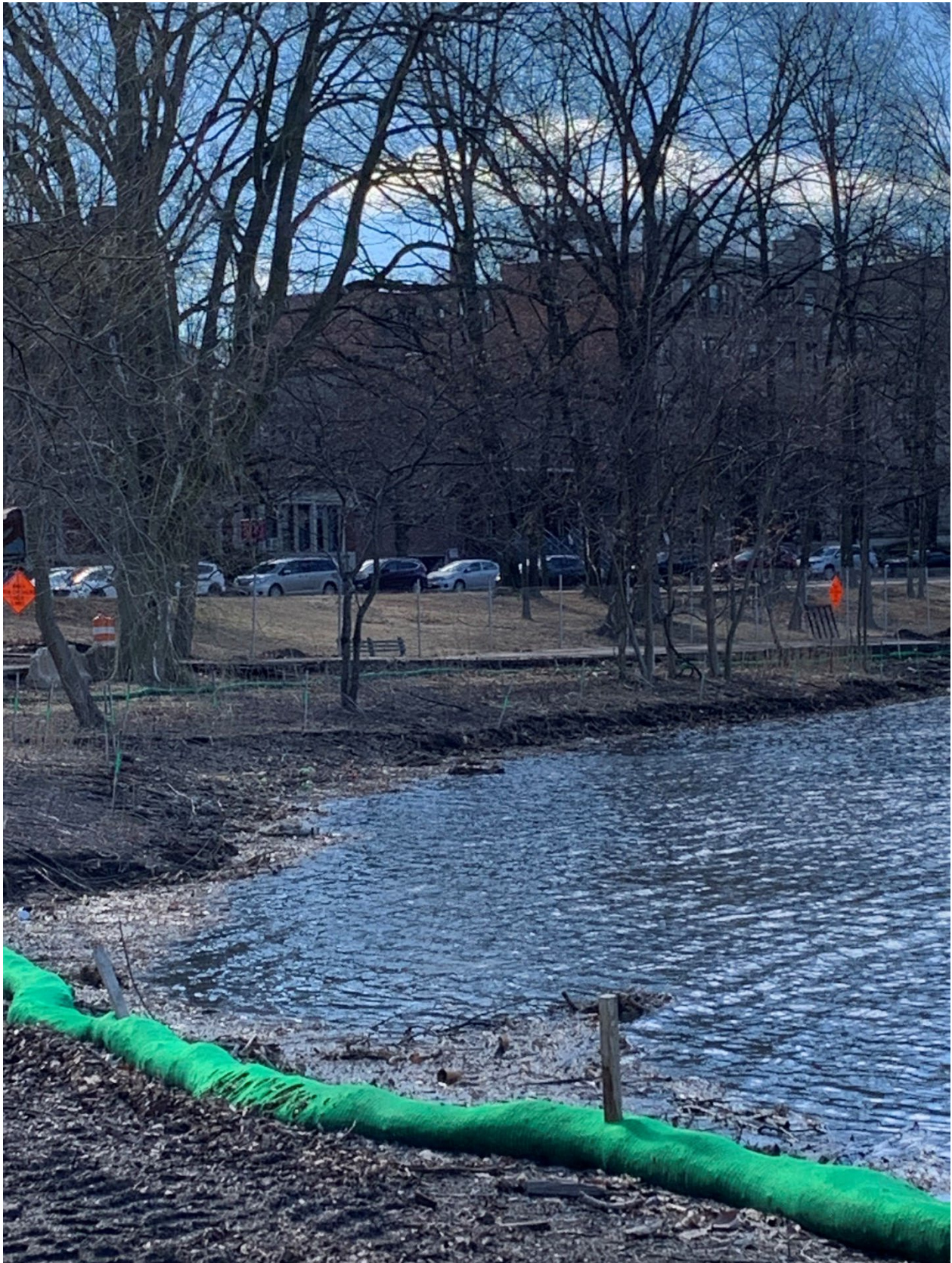
Work Area #10 – section of river immediately downstream of Work Area #9 which ends at Agassiz Road – view of the bank with the phragmites removed. Restoration and planting of the bank will take place in Spring 2022.