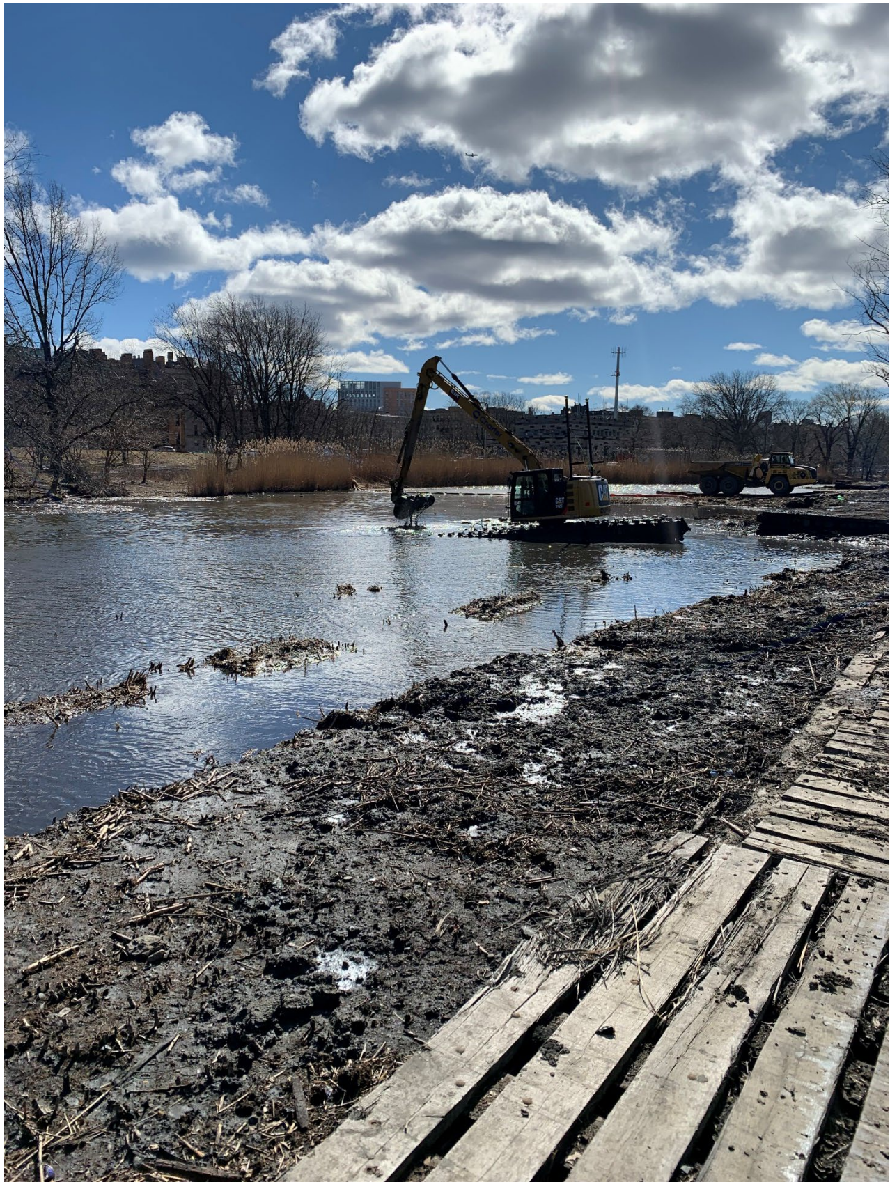
Work Area #12 - section of river immediately downstream of Work Area #11 - amphibious excavator excavating the channel.