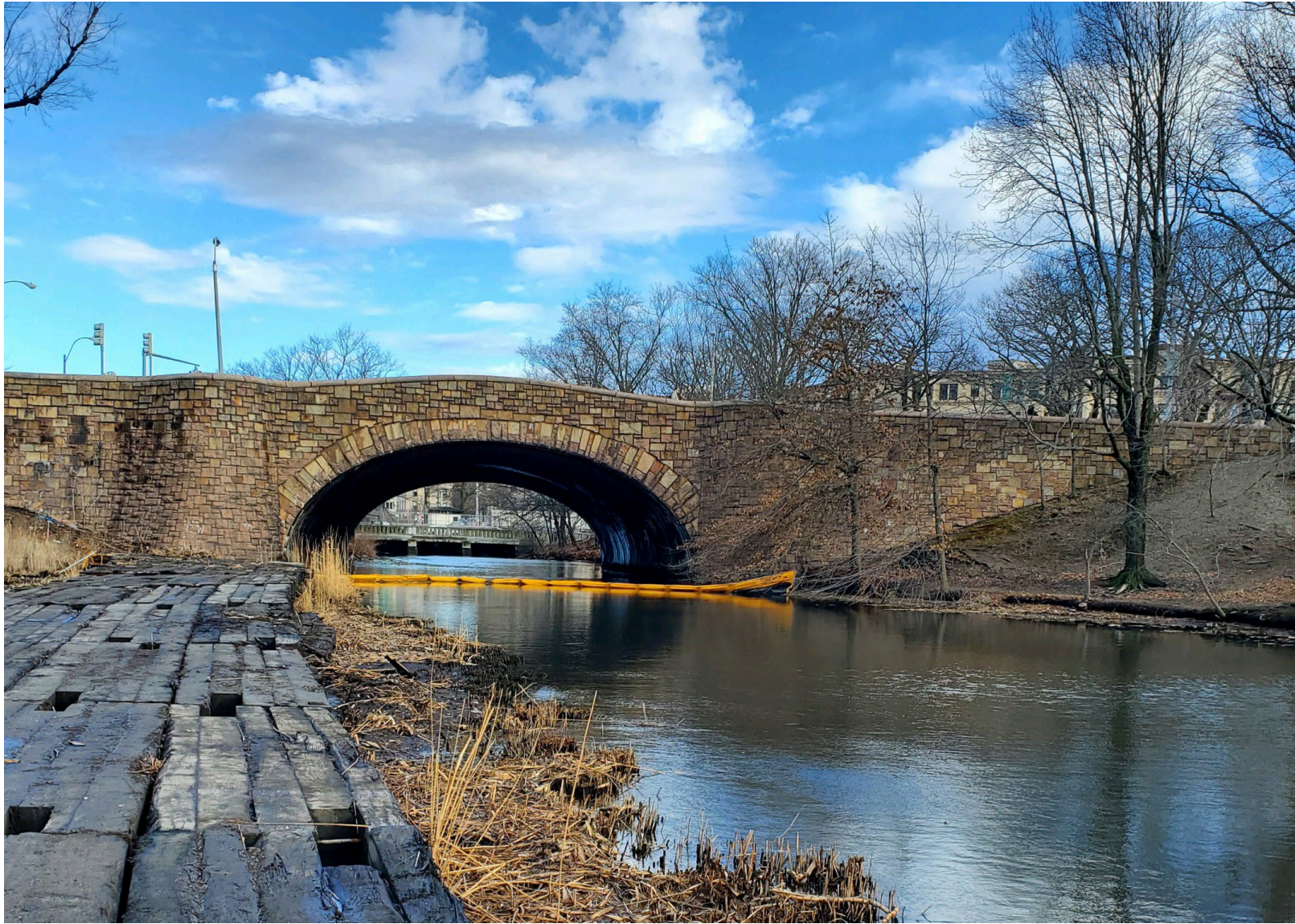
Work Area #12 – section of river immediately downstream of Work Area #11 which ends at Boylston Street Bridge – phragmites beneath the timber matting will be removed once the channel dredging is complete. Note the clear view of the bridge which was previously obscured by the phragmites .