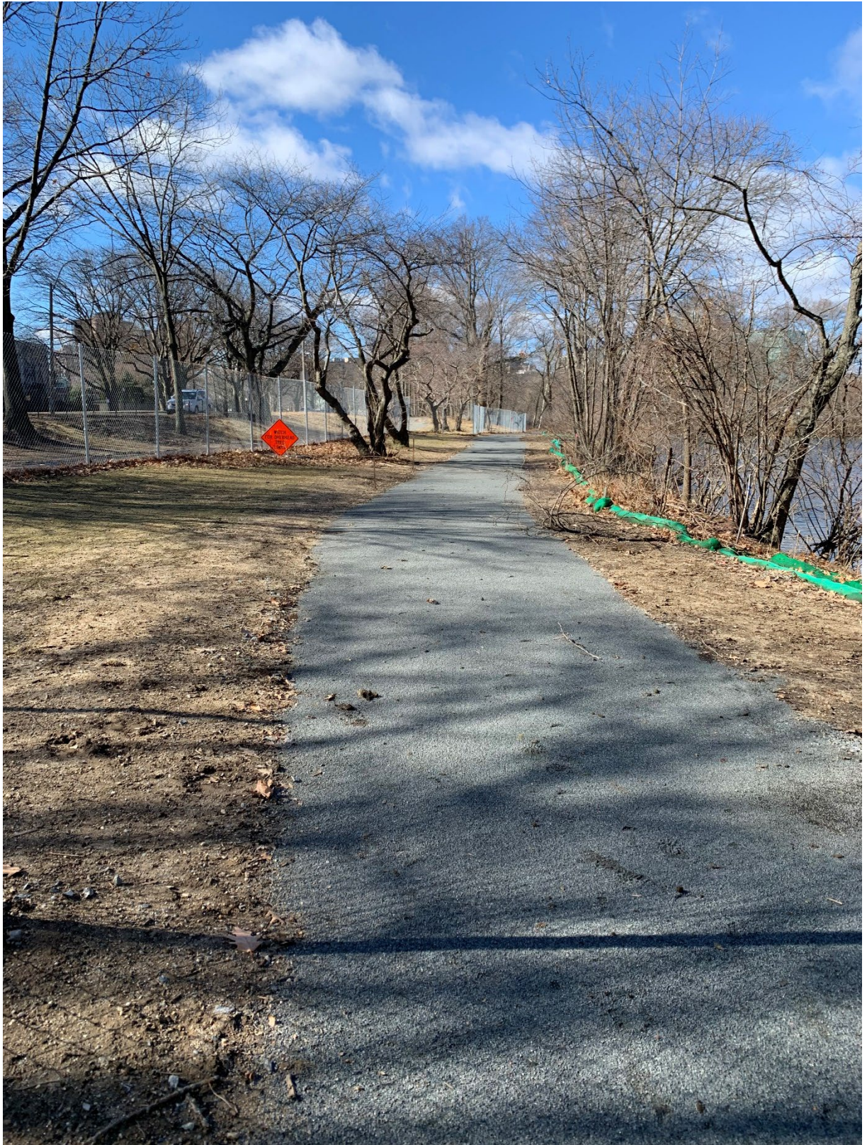
Work Area #9 – section of river immediately upstream of Work Area #10 – restored stone dust pathway that was constructed in November 2021 which has held up well through the winter.