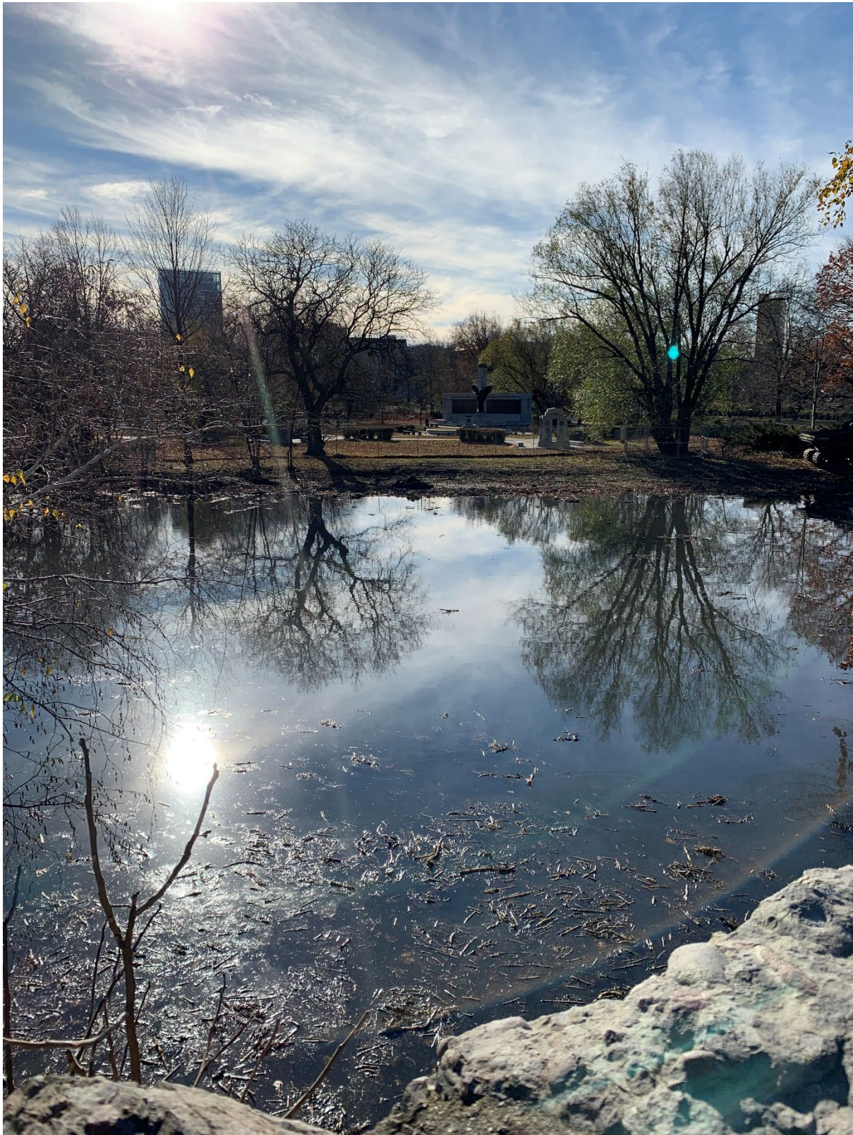
Work Area #10 – section of river immediately downstream of Work Area #9 which ends at Agassiz Road – removal of phragmites has provided a clear view of the War Memorial from across the river standing at Agassiz Road. Restoration and planting of the bank will take place in Spring 2022.