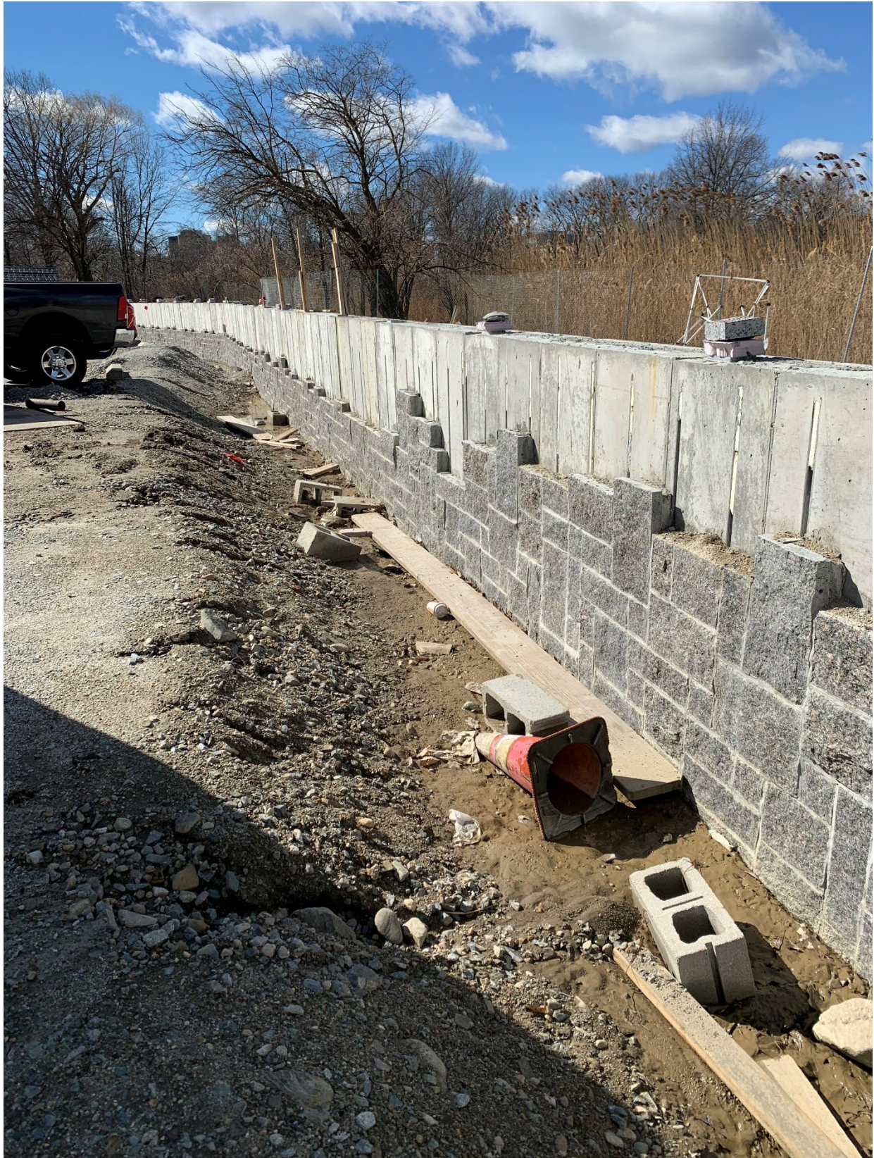
Work Area #13 – Boston Fire Department Building in the vicinity of the Fenway and Agassiz Road – granite veneer that was installed on the constructed floodwall. Footing was backfilled prior to the winter.