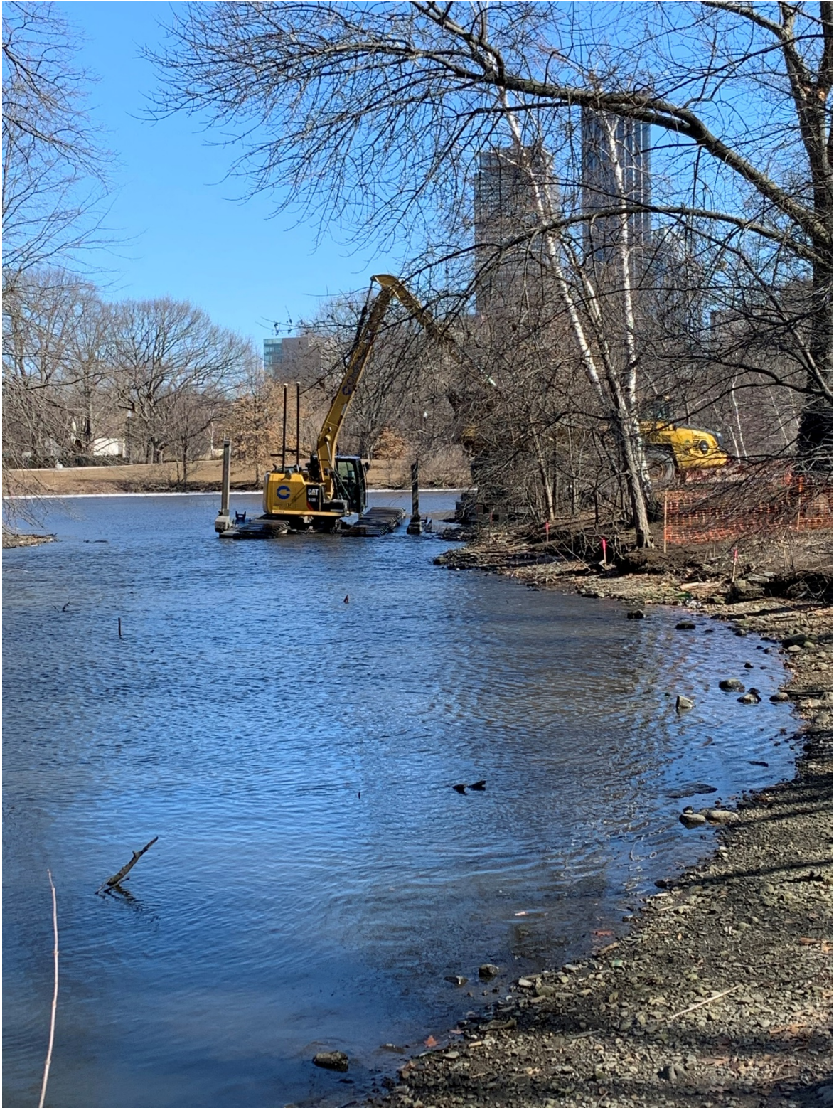
Amphibious excavator dredging at Work Area #9.