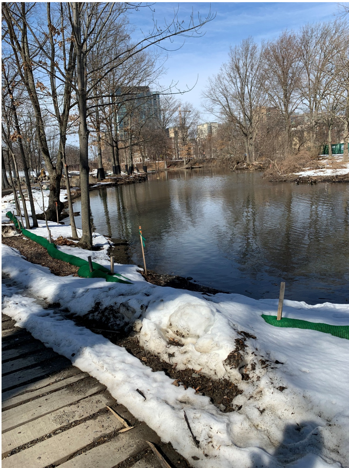
Work Area #7 (looking upstream to Avenue Louis Pasteur) – Dredging completed – sediment dredged from the river and temporary access road removed. Restoration and planting will begin on the banks in early April.