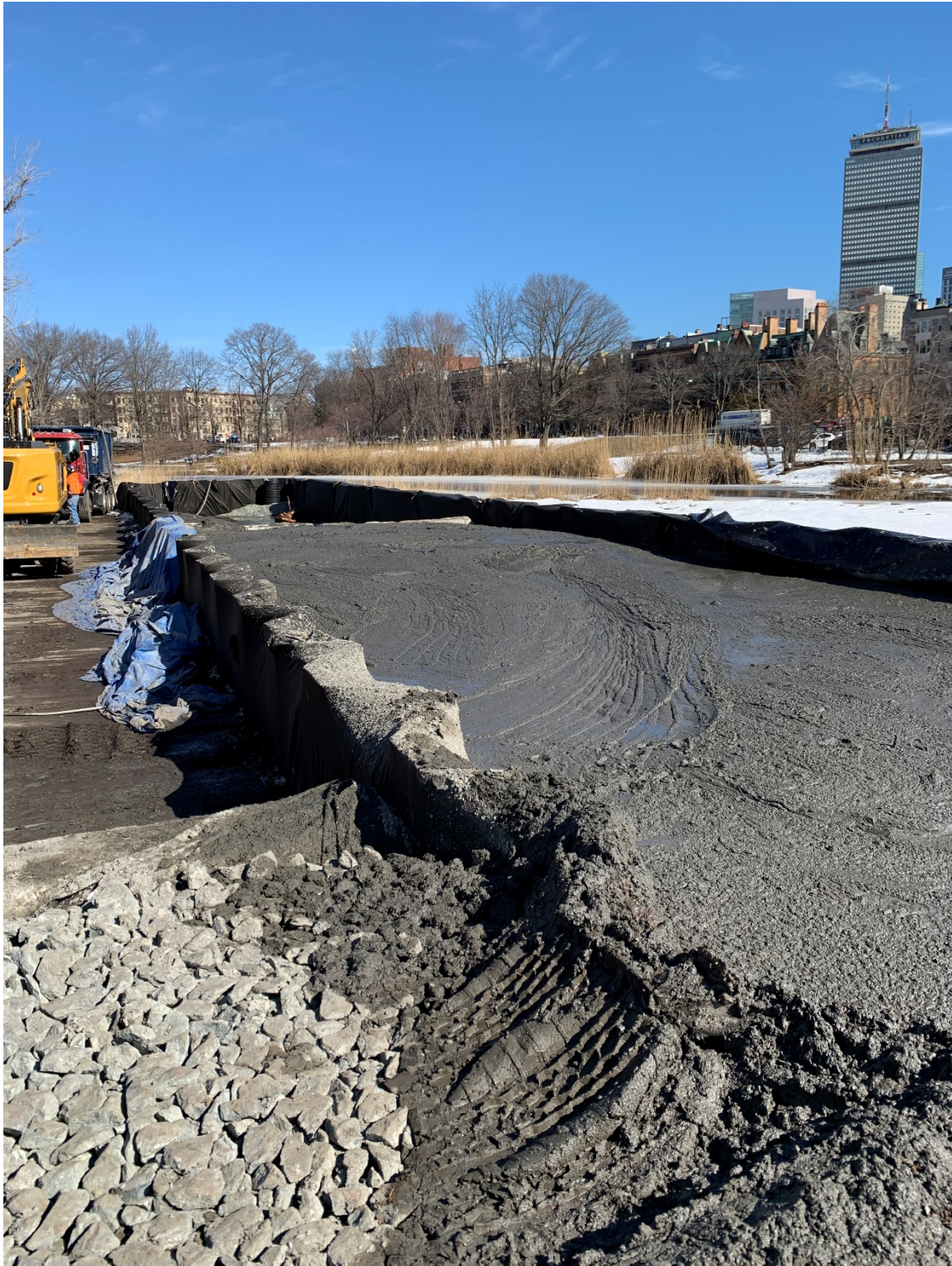
Sediment storage bin at Work Area #11 – sediment naturally drying while stored in the bin.