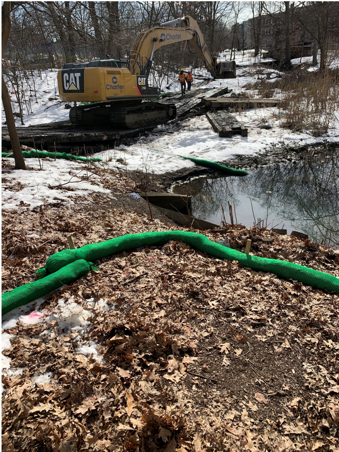
Construction of temporary access road at Work Area #3 on the left bank (looking downstream) of the river – for truck access to transport dredged sediments.