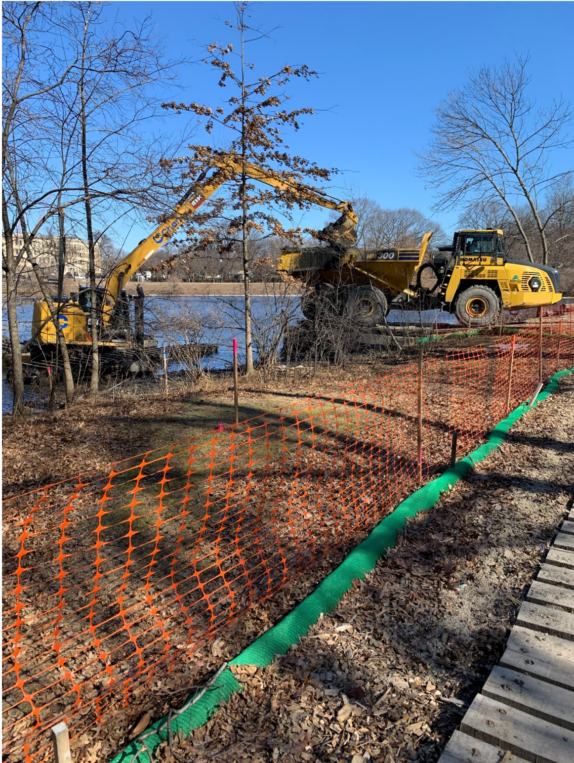
Amphibious excavator depositing dredged sediment into the off-road truck – Work Area #9.