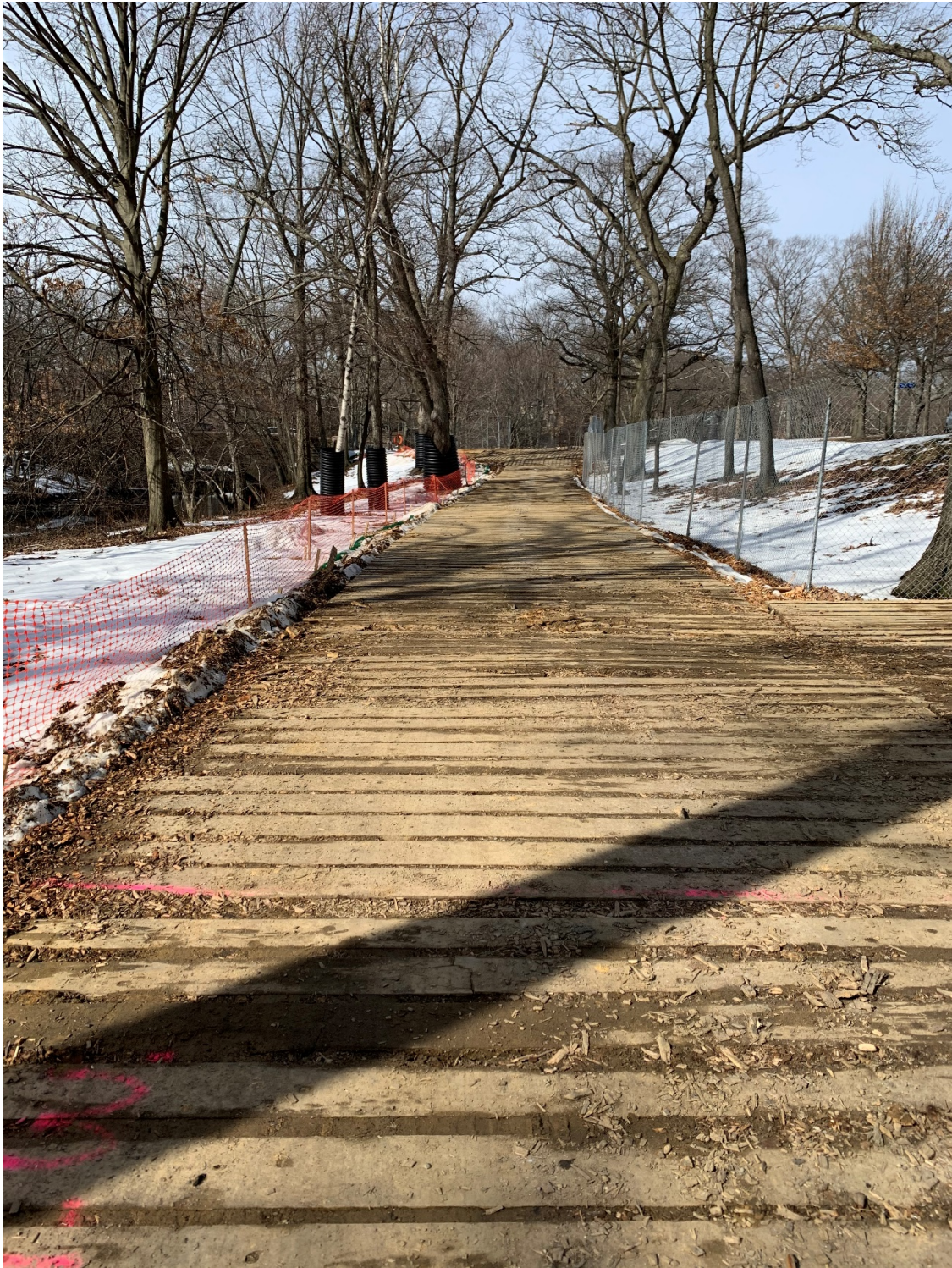
Temporary access road and tree protection at Work Area #3 – looking up at Netherlands Road.