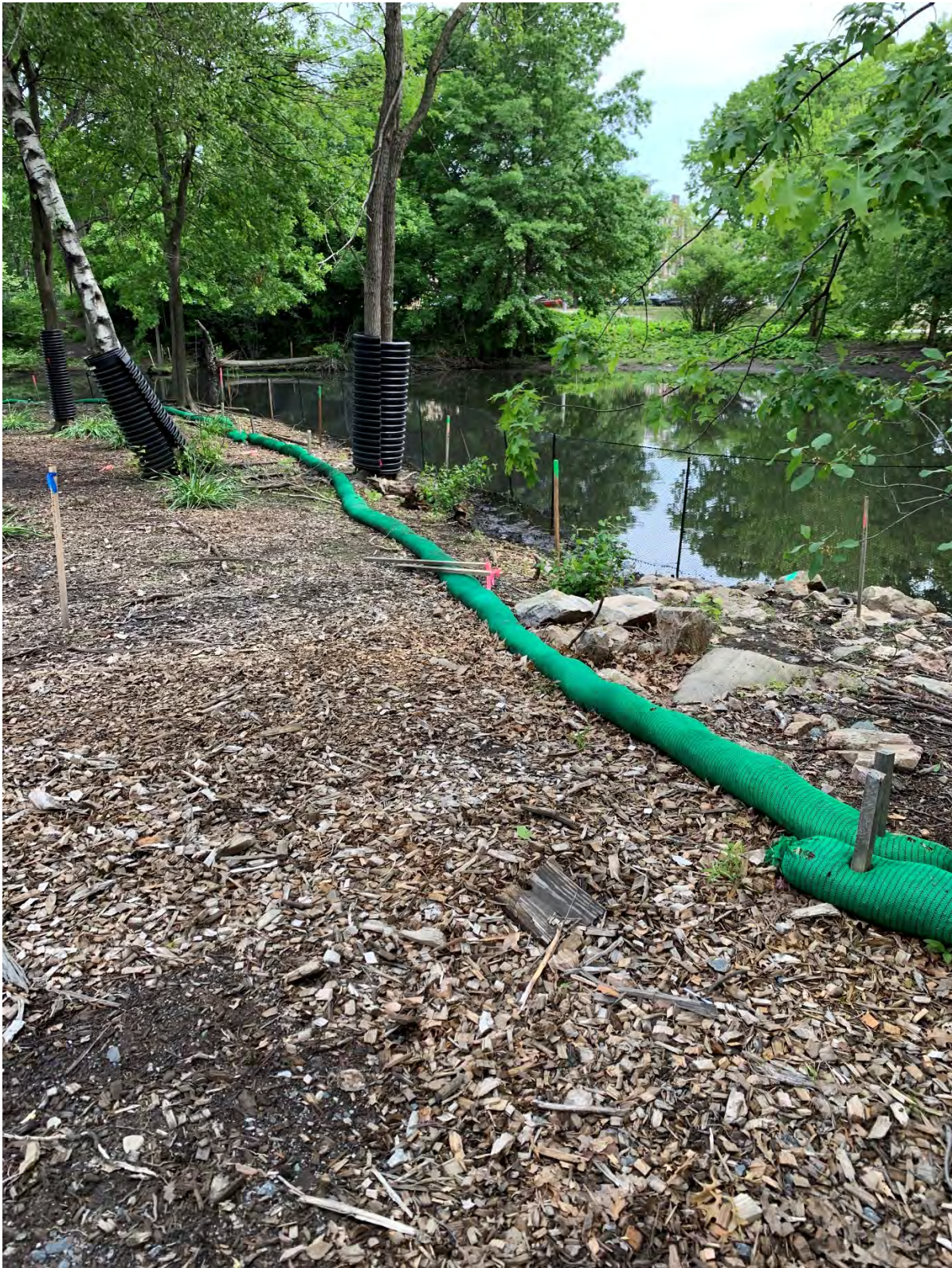
Work Area #7 – section of river immediately downstream of Avenue Louis Pasteur – herbivore deterrent fence installed on the water side of the expected plantings. Preparation work in anticipation of planting in the Fall planting window.