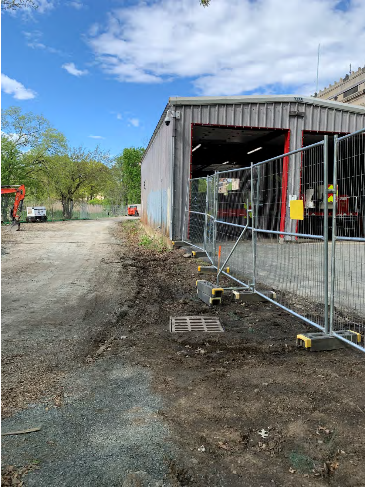
Work Area #13 – Boston Fire Department Building in the vicinity of the Fenway and Agassiz Road – completed demolition of the existing security fencing and its footing. Awaiting excavation for new floodwall subbase and foundation.