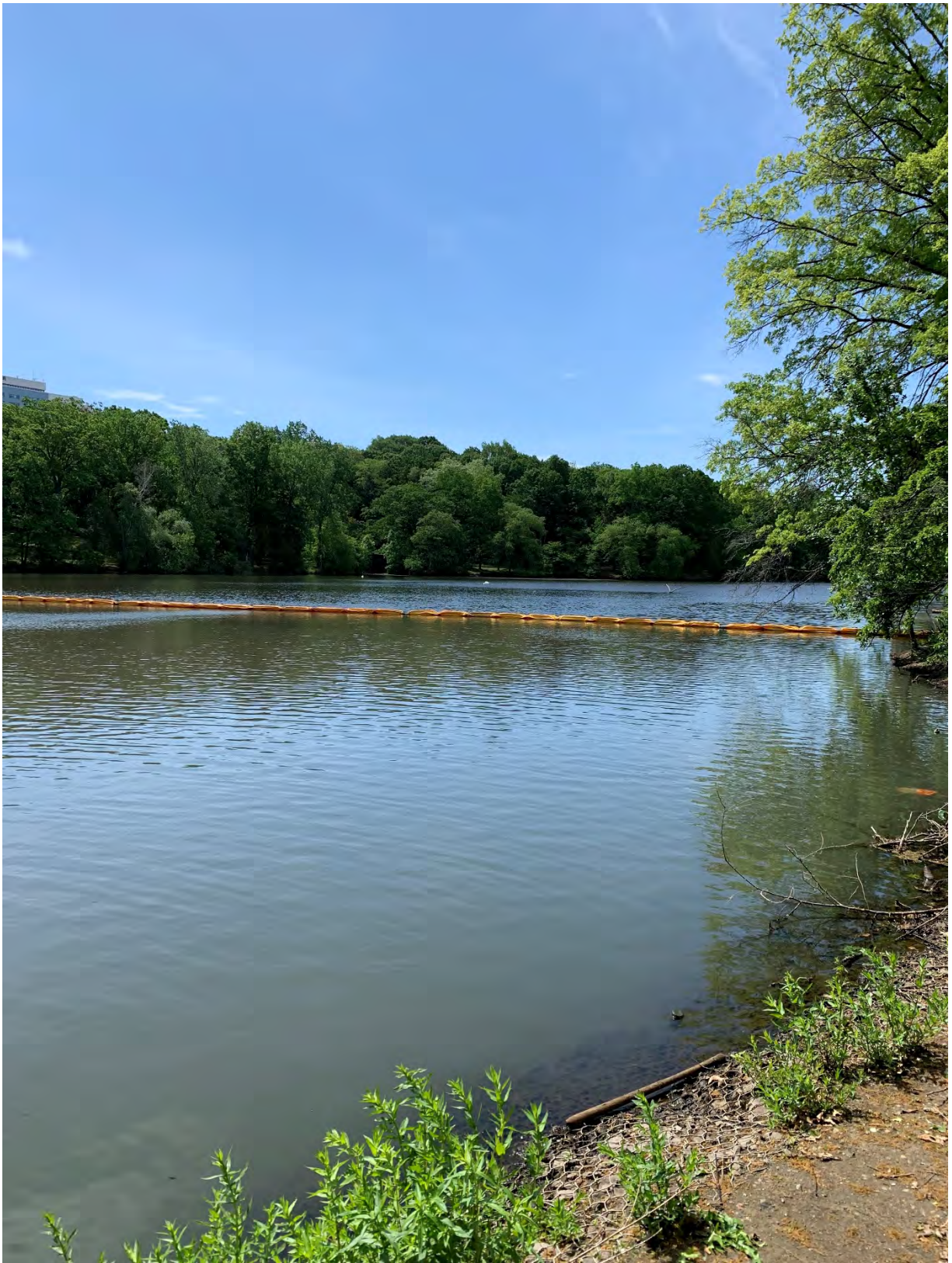
Work Area #1 – Leverett Pond – Silt curtain installed upstream of the dredged footprint.