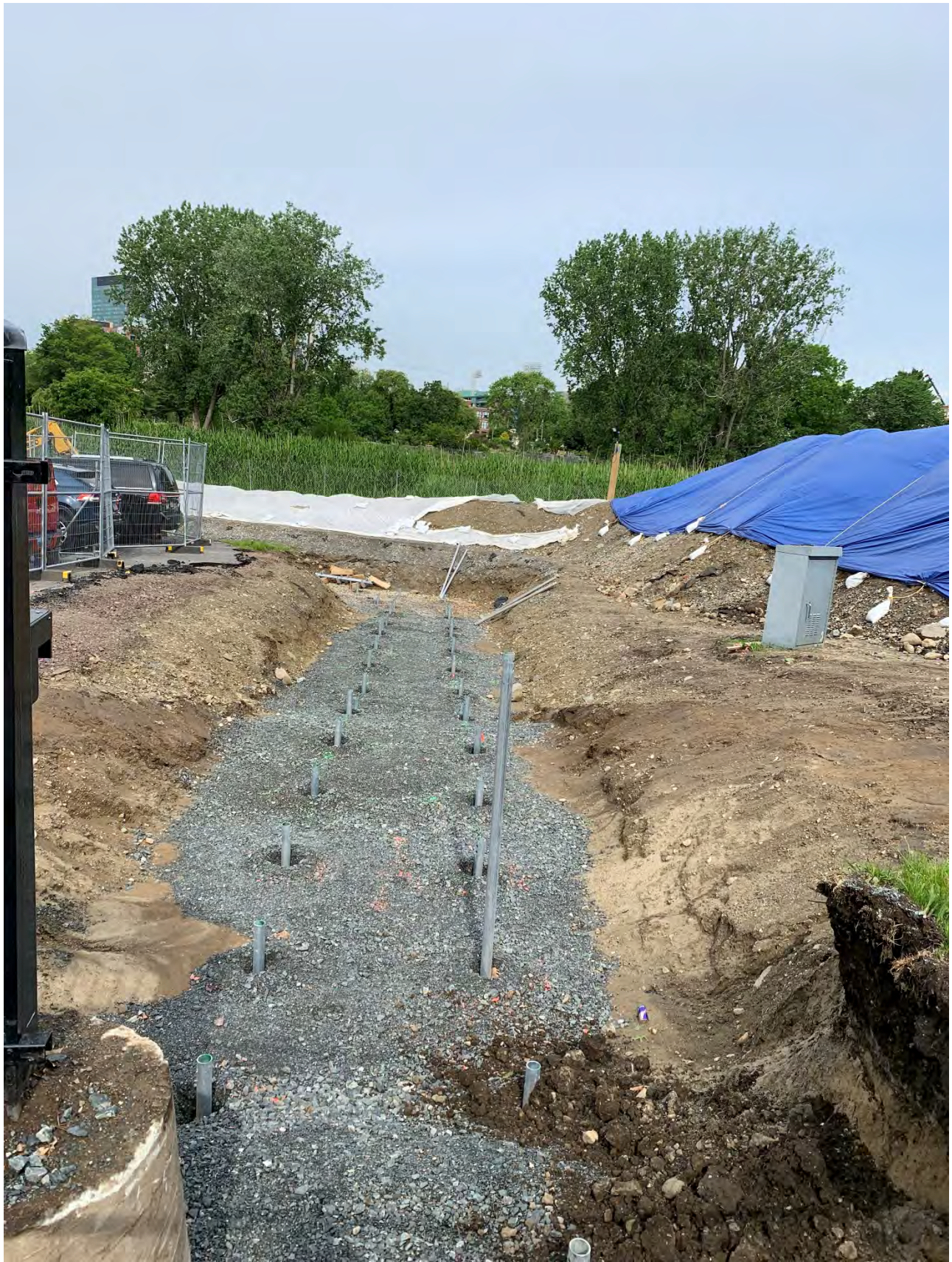
Work Area #13 – Boston Fire Department Building in the vicinity of the Fenway and Agassiz Road – helical piles installed on the northern section of the new floodwall and rounding the corner of the FD building.