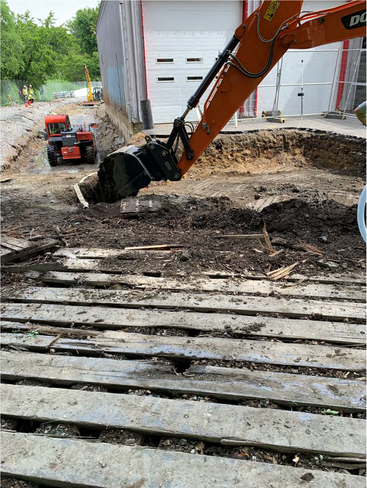
Work Area #13 – Boston Fire Department Building in the vicinity of the Fenway and Agassiz Road – excavation for the new underground pump station in front of the existing metal building and for the new floodwall foundation to the left of the metal building.