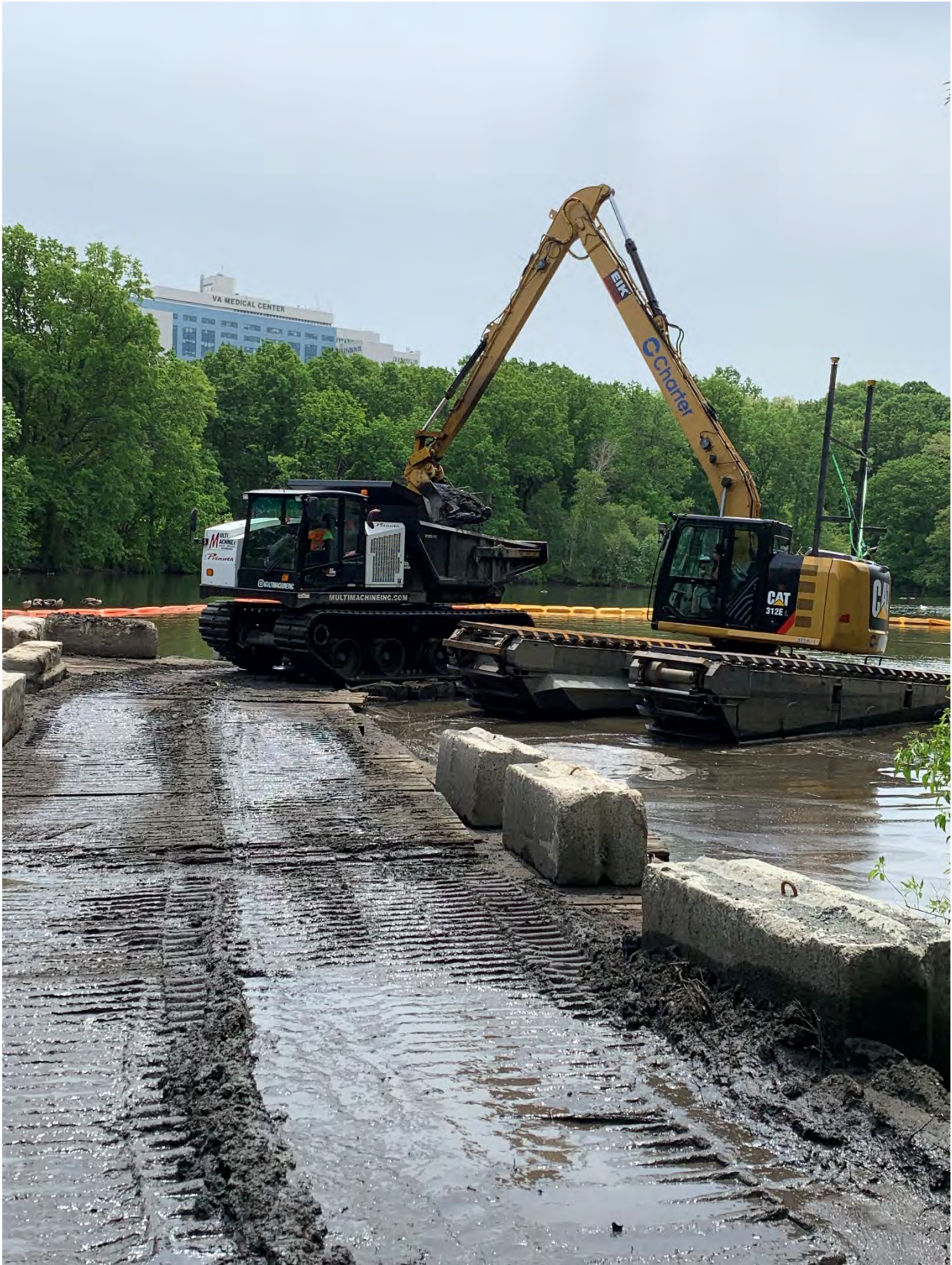
Work Area #1 – Leverett Pond – Amphibious excavator dredging and loading off-road truck to transport sediment to temporary processing bin.