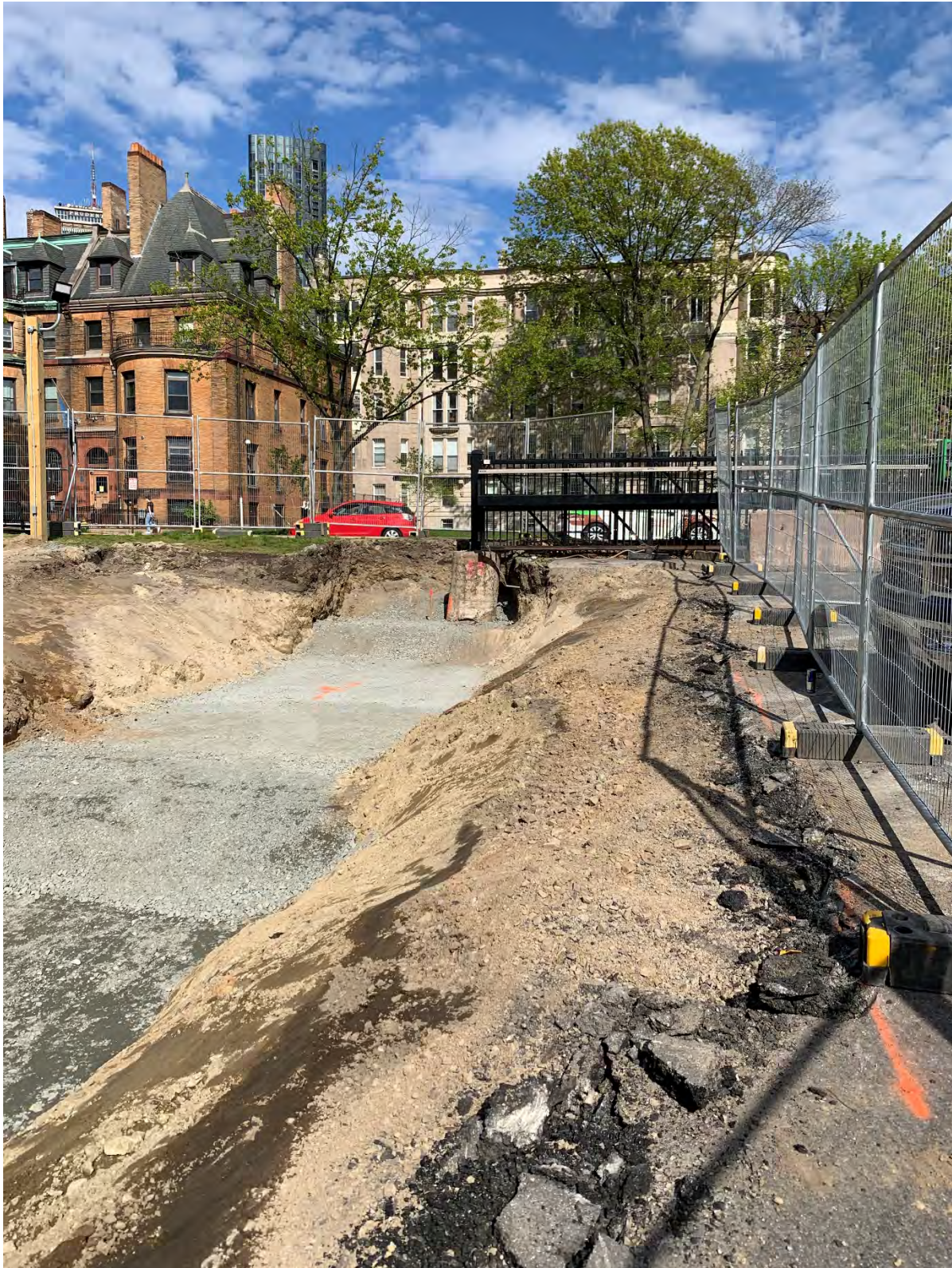
Work Area #13 – Boston Fire Department Building in the vicinity of the Fenway and Agassiz Road – northern section of the new floodwall – excavated; subbase installed and compacted; awaiting helical piles.