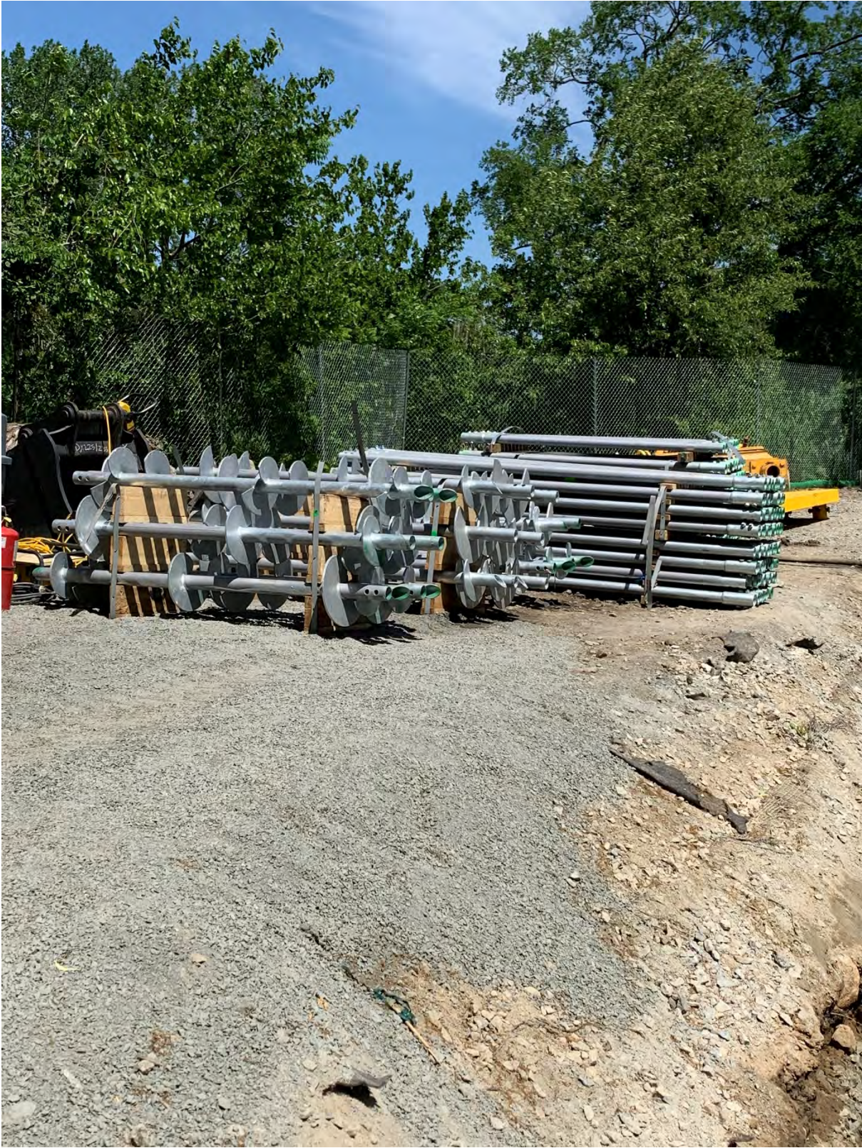
Work Area #13 – Boston Fire Department Building in the vicinity of the Fenway and Agassiz Road – helical piles on site.