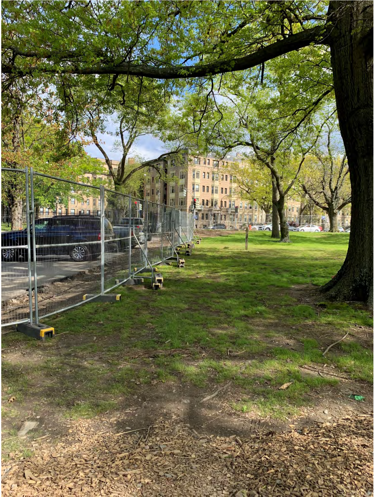
Work Area #13 – Boston Fire Department Building in the vicinity of the Fenway and Agassiz Road – completed demolition of the existing security fencing and its footing. This section of excavation will be done with vacuum excavation to avoid damage to the existing tree.