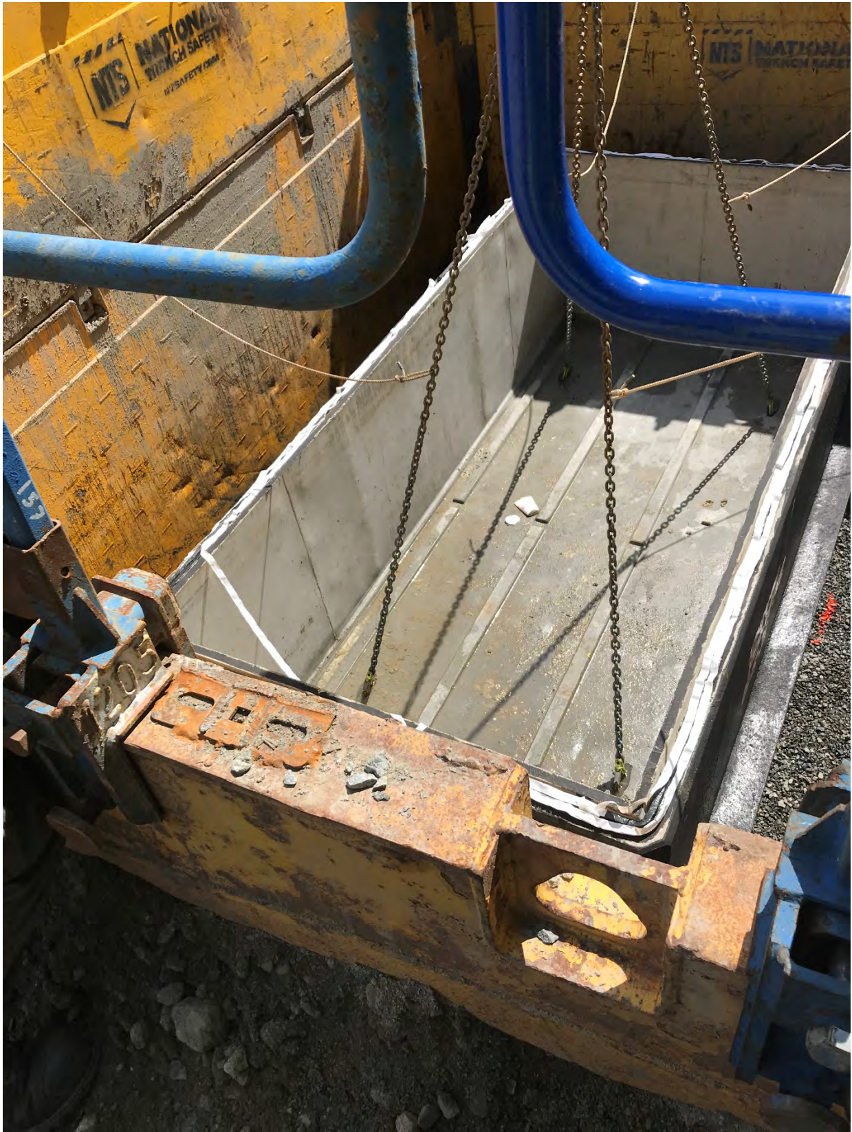
Work Area #13 – Boston Fire Department Building in the vicinity of the Fenway and Agassiz Road – new underground precast pump station placed in hole – 9 June 2021.