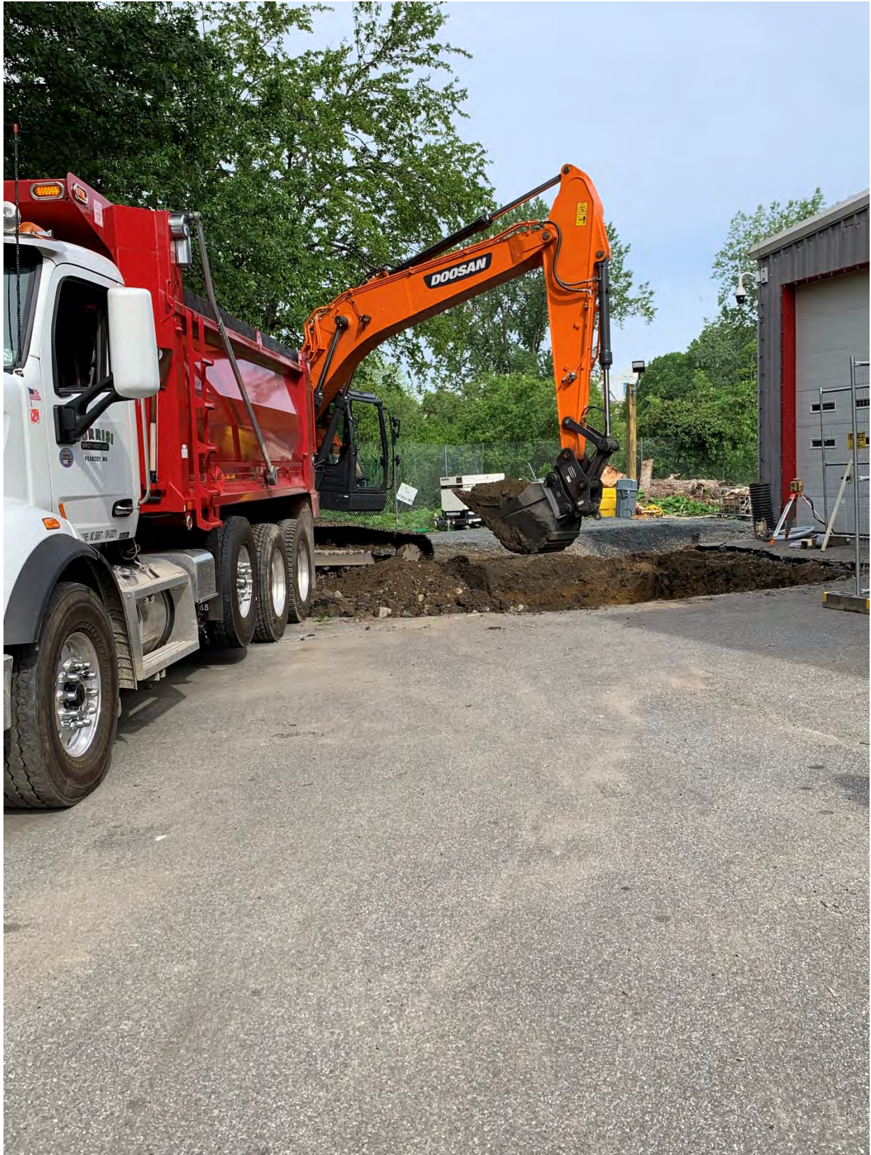
Work Area #13 – Boston Fire Department Building in the vicinity of the Fenway and Agassiz Road – excavation for the new underground pump station in front of the existing metal building.