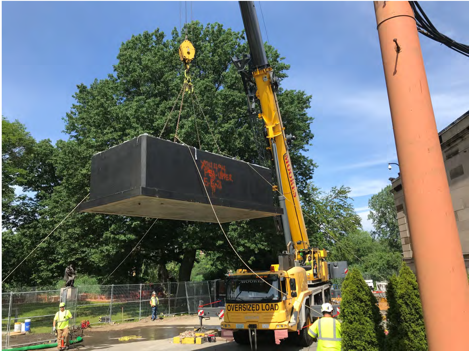
Work Area #13 – Boston Fire Department Building in the vicinity of the Fenway and Agassiz Road – crane lifting new underground precast pump station and getting ready to place in hole – 9 June 2021.