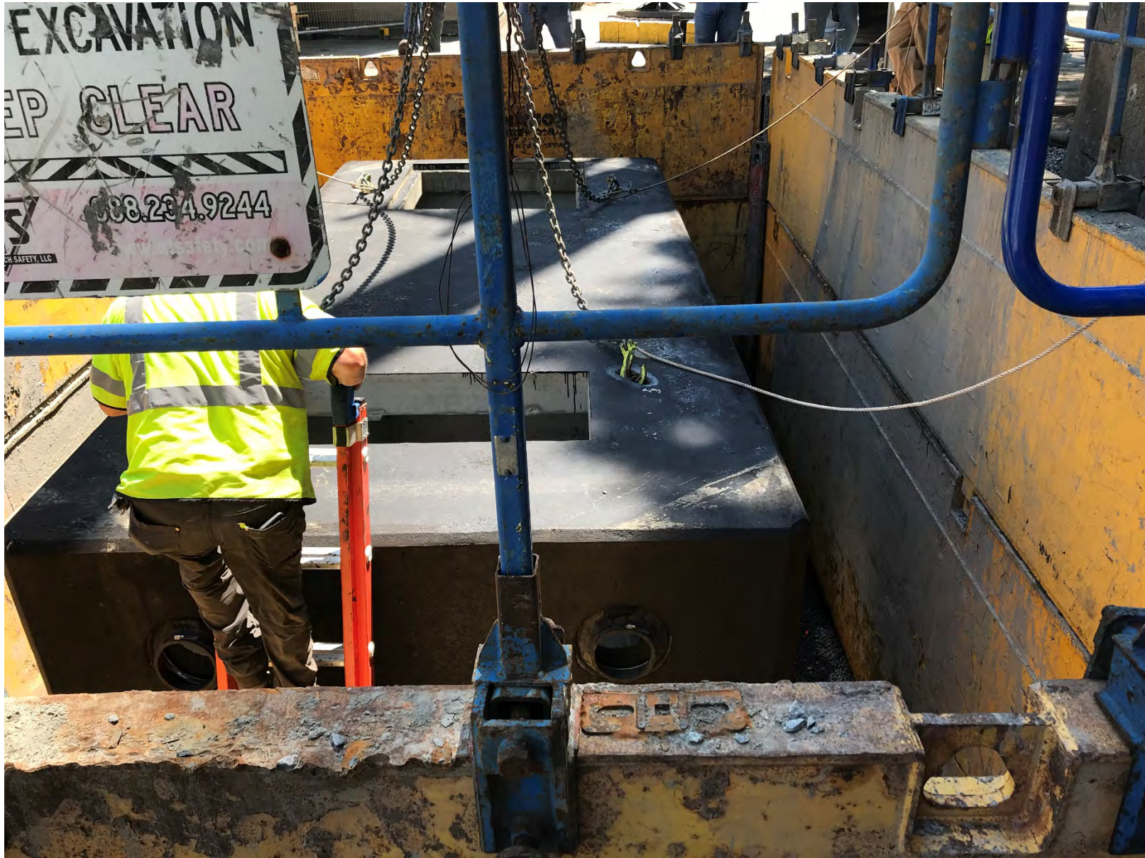
Work Area #13 – Boston Fire Department Building in the vicinity of the Fenway and Agassiz Road – top slab of the new underground precast pump station placed on top of the precast box – 9 June 2021.