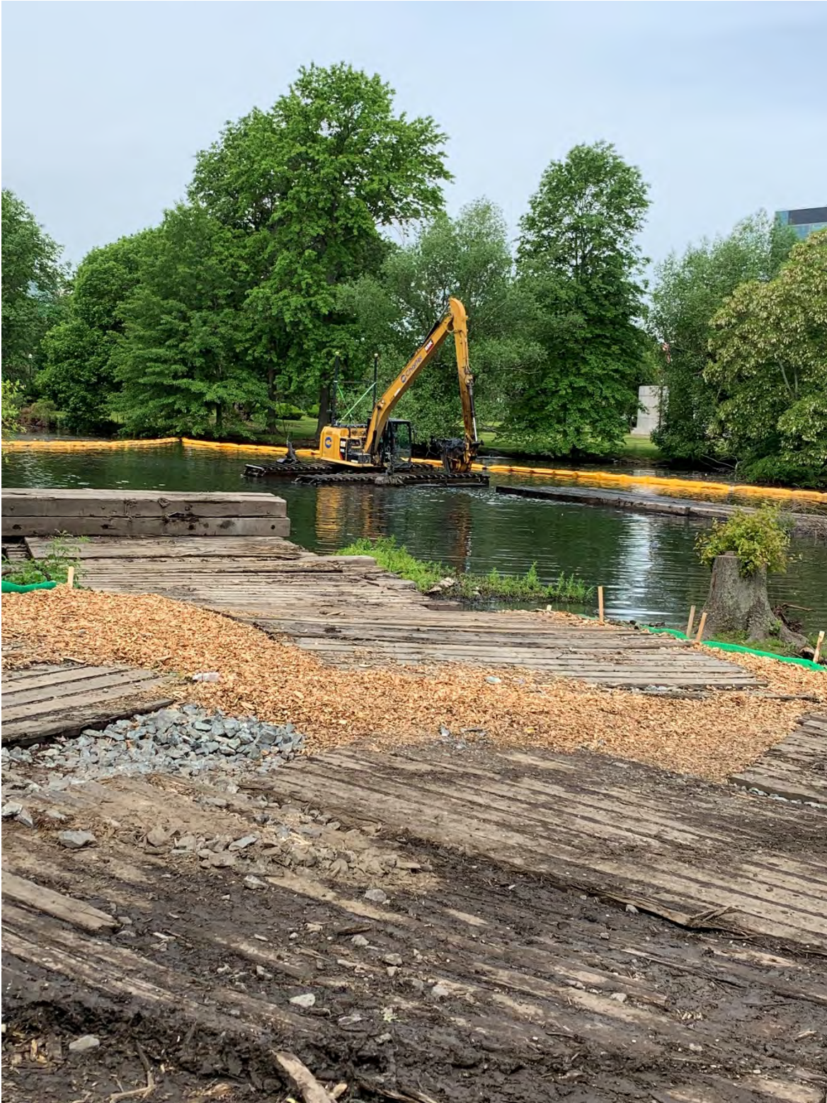
Work Area #10 – Amphibious excavator dredging section of river immediately downstream of Work Area #9 which ends at Agassiz Road.