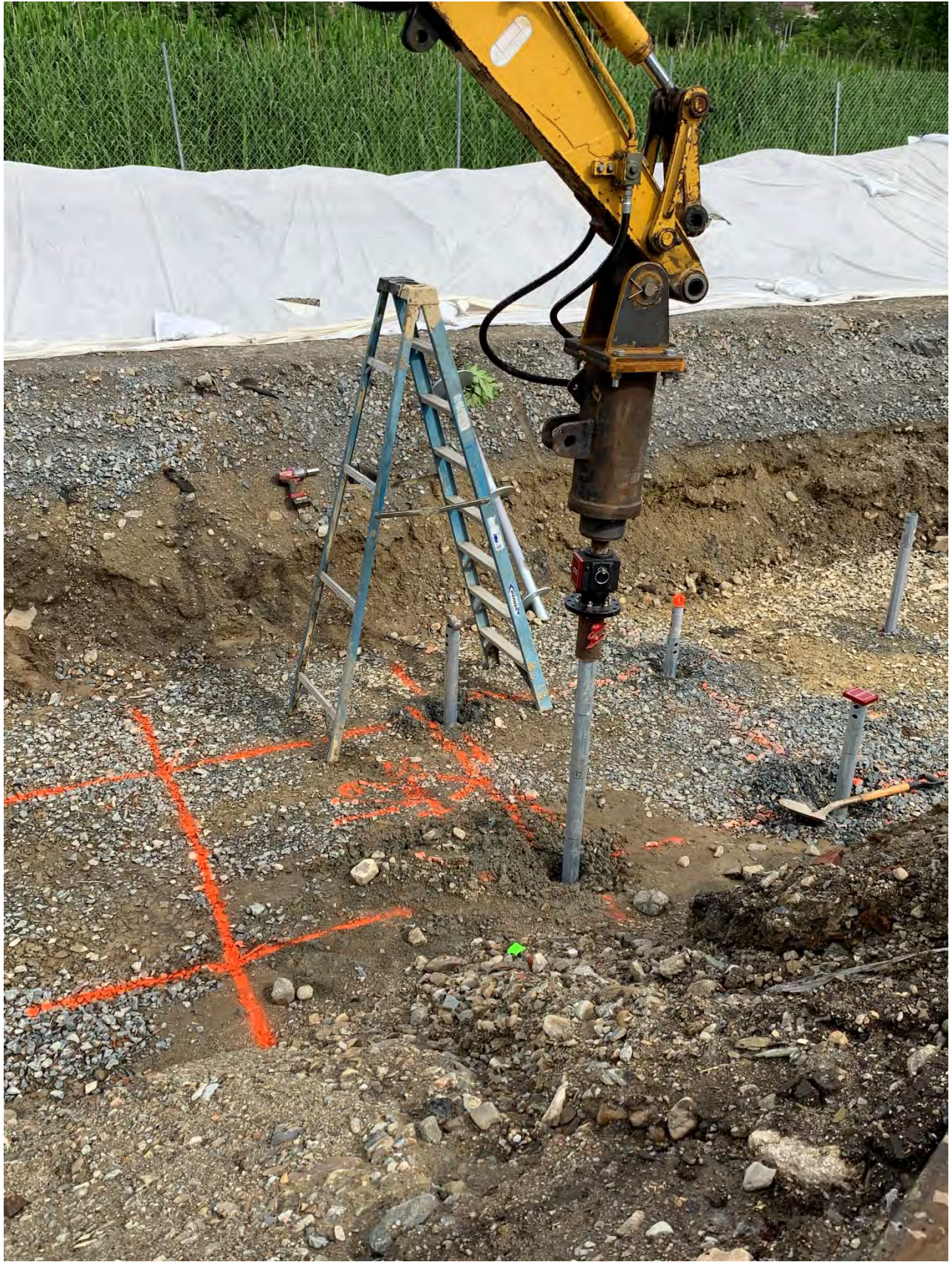
Work Area #13 – Boston Fire Department Building in the vicinity of the Fenway and Agassiz Road – mini-excavator installing helical piles.