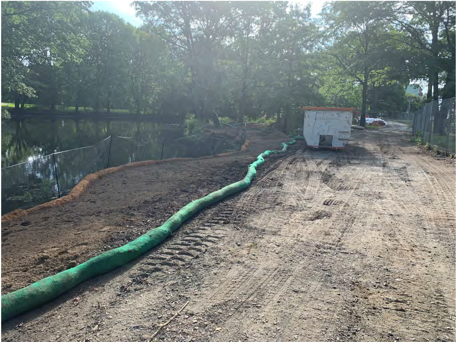
Work Area #7 – section of river immediately downstream of Avenue Louis Pasteur – herbivore deterrent fence installed on the water side of the expected plantings. Topsoil and coir log placed ahead of the plantings.