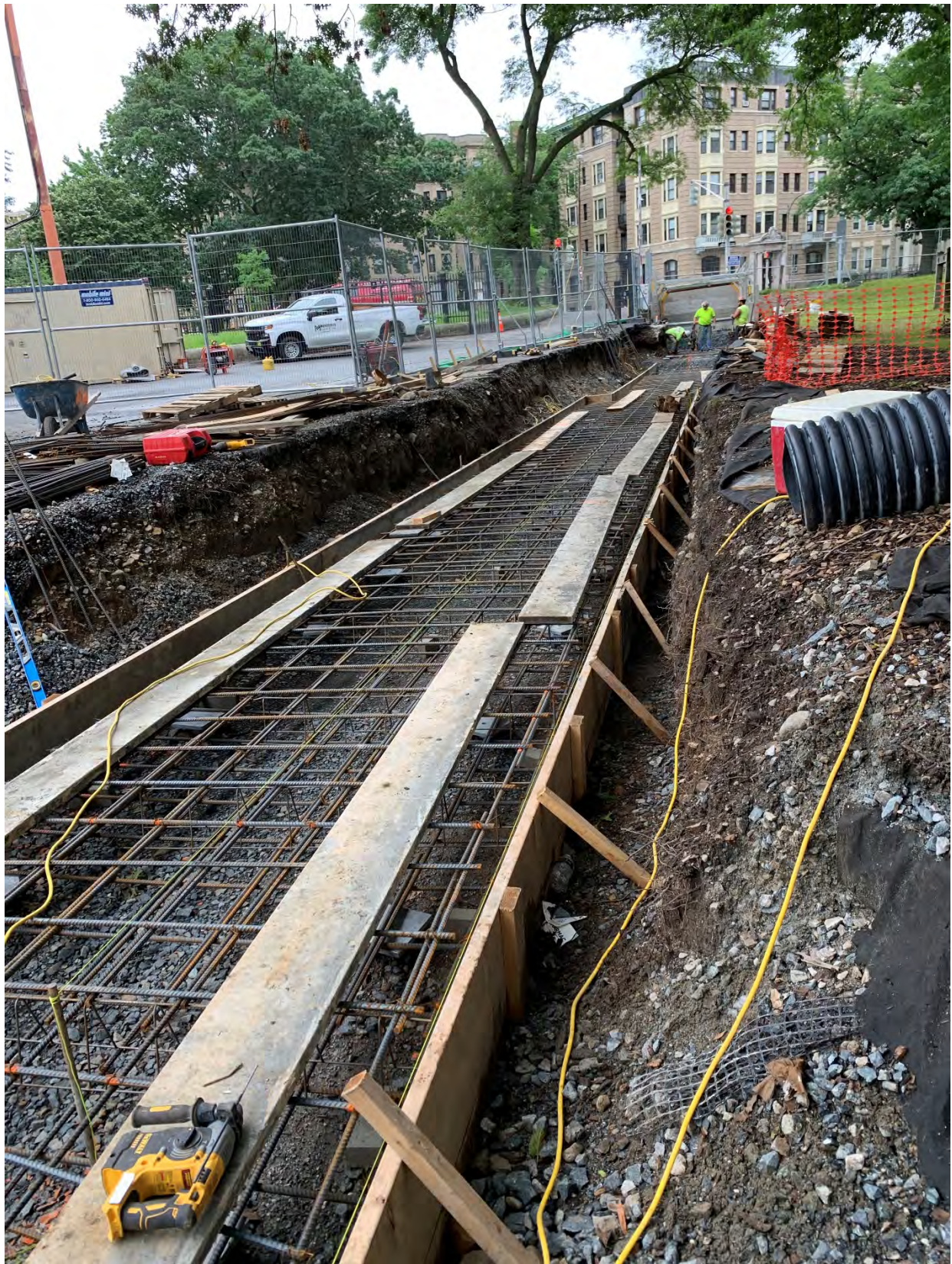
Work Area #13 – Boston Fire Department Building in the vicinity of the Fenway and Agassiz Road – view of south wall looking towards The Fenway. Installing formwork and rebar for the concrete placement for the footing.