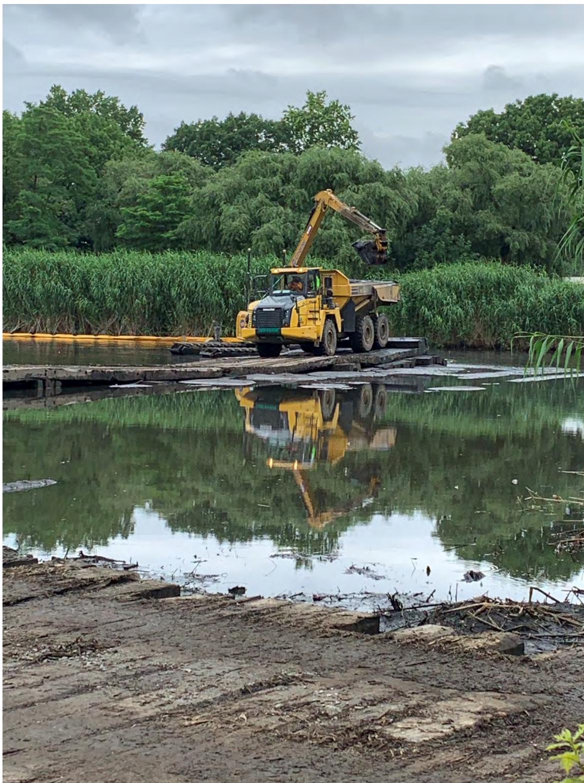
Work Area #10 – Amphibious excavator dredging section of river immediately downstream of Work Area #9 and loading sediment into off-road truck to transport sediment to sediment processing area.