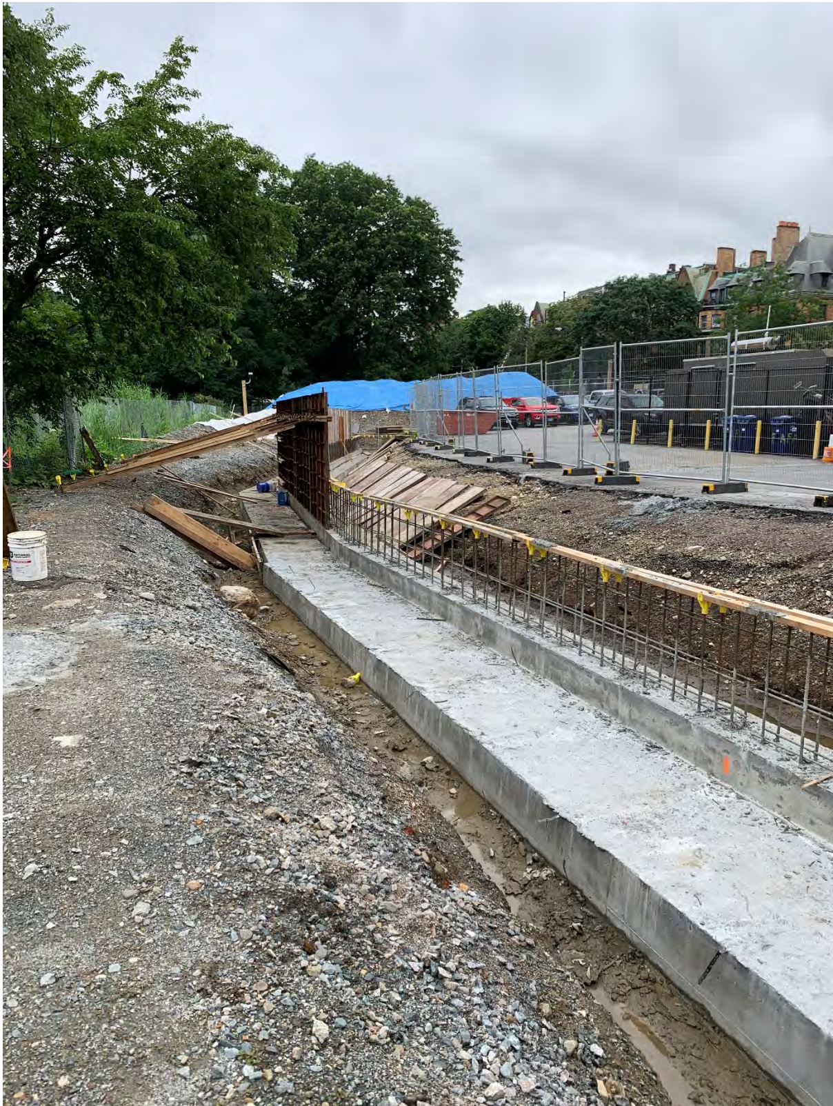
Work Area #13 – Boston Fire Department Building in the vicinity of the Fenway and Agassiz Road – formwork stripped at the completed footing. Rebar and formwork being installed for the floodwall ahead of the concrete placement.