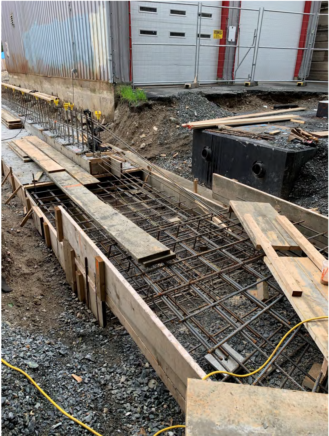
Work Area #13 – Boston Fire Department Building in the vicinity of the Fenway and Agassiz Road – corner near the underground pump station. Installing formwork and rebar for the concrete placement for the footing.