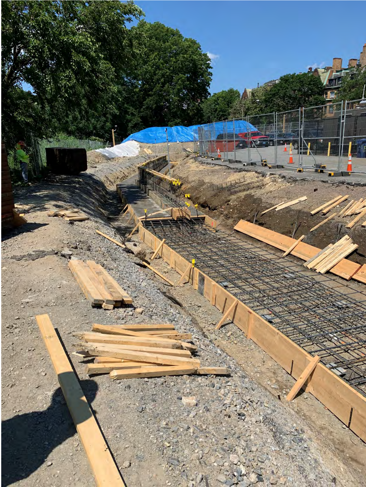
Work Area #13 – Boston Fire Department Building in the vicinity of the Fenway and Agassiz Road – formwork and rebar for the concrete footing. Concrete placed in a section of the footing on the far side.