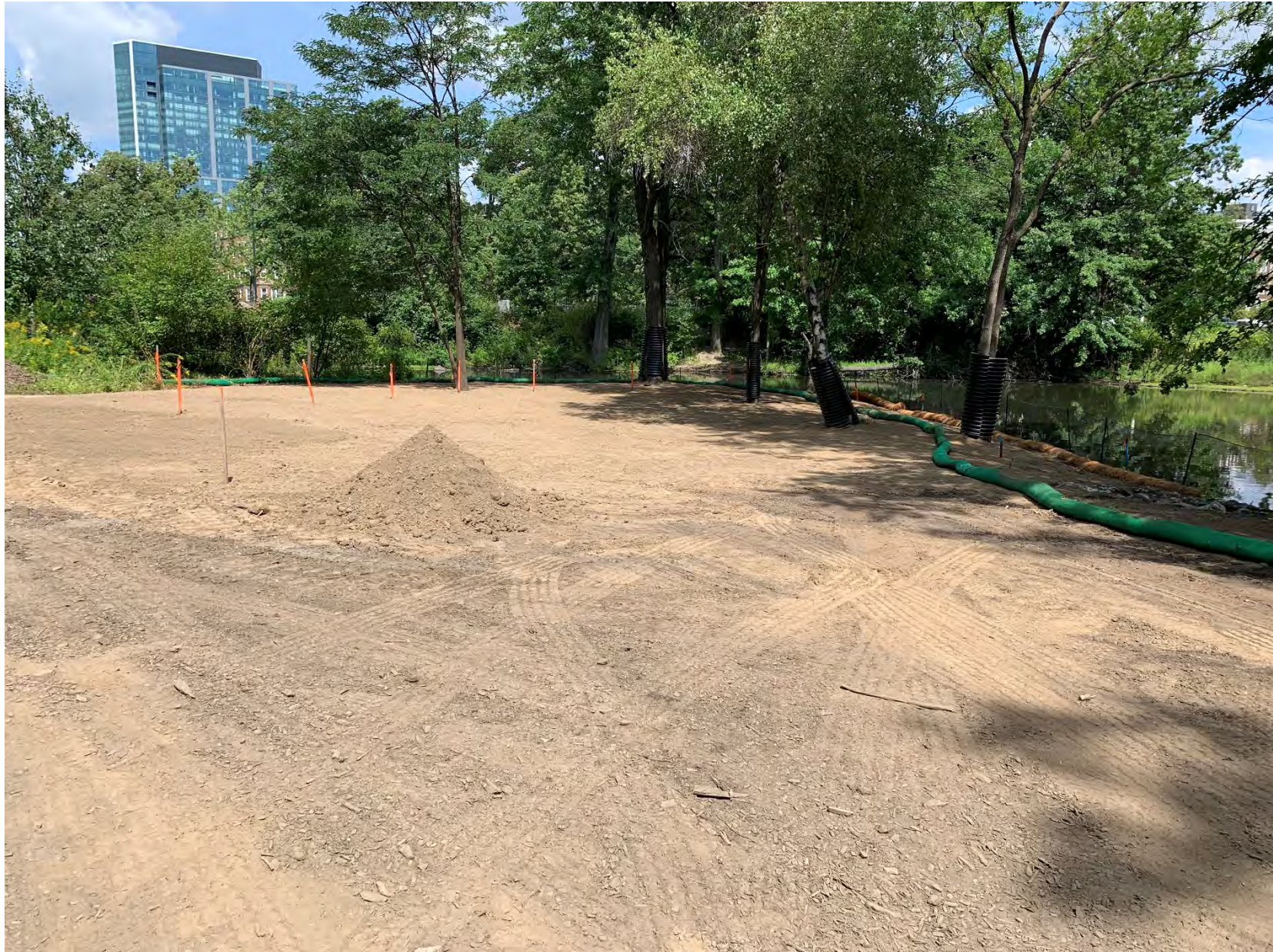
Work Area #7 – section of river immediately downstream of Avenue Louis Pasteur – herbivore deterrent fence installed on the water side of the expected plantings. Shaping and grading of site in anticipation of planting in the Fall planting window.