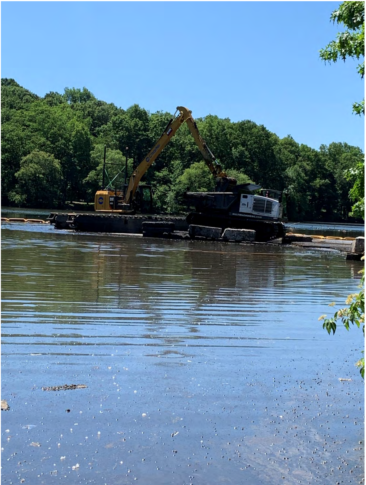
Work Area #1 – Leverett Pond – Amphibious excavator dredging and loading off-road truck to transport sediment to temporary processing bin