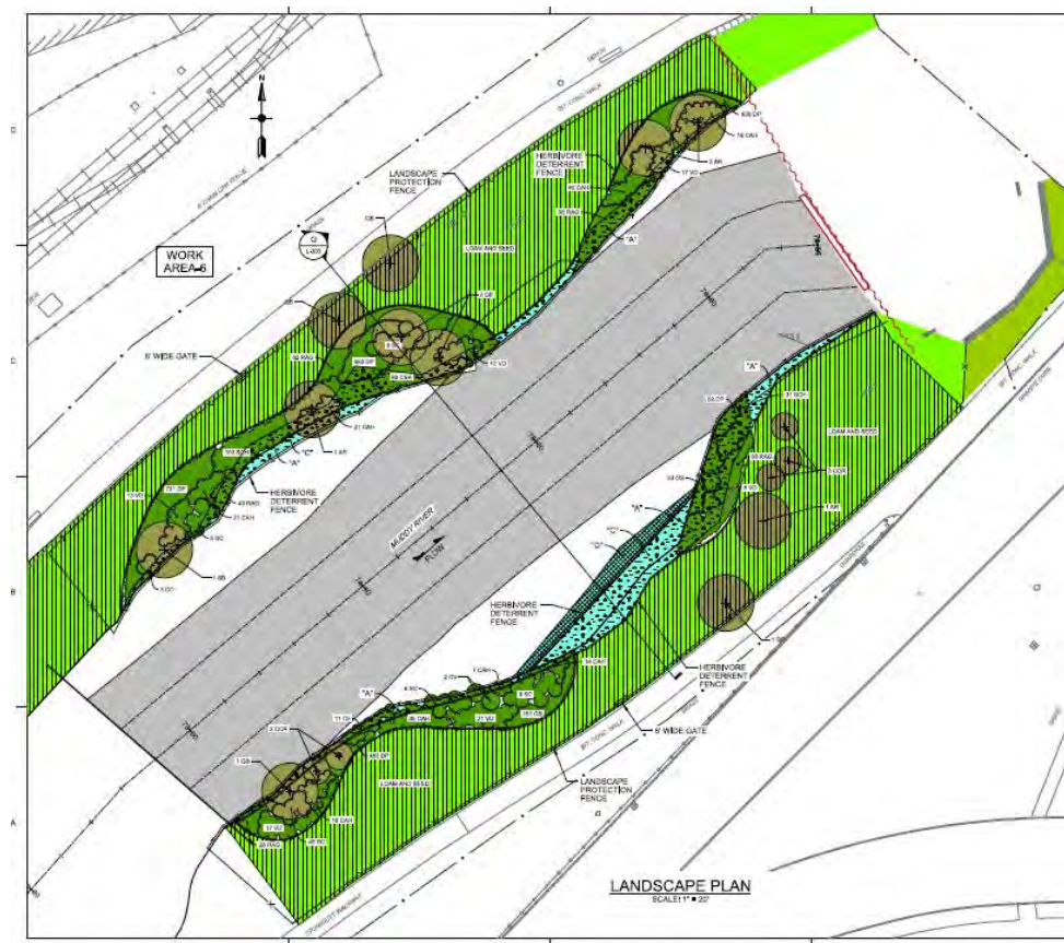
REPRESENTATIVE FIGURE OF FLOOD CONTROL CHANNEL AND PROPOSED IMPROVEMENTS