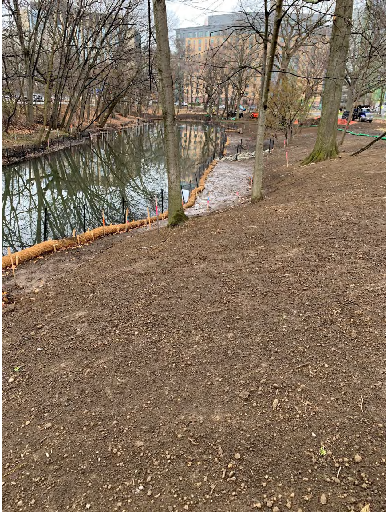
Work Area #2 – section of river at Brookline Avenue and the Riverway – near Beth Israel Deaconess Hospital – bank cleared; wetland shelf constructed; herbivore fence and coir log installed; and loam placed – ready for plants to be installed in early May.