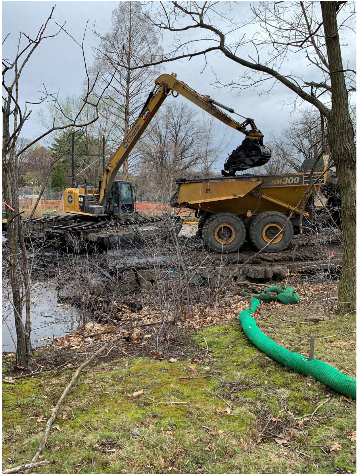
Work Area #11 – section of river immediately downstream of Work Area #10 – dredging of the channel immediately downstream of the Agassiz Road Bridge. Sediment being dredged and transported in off-road truck to the central processing facility.