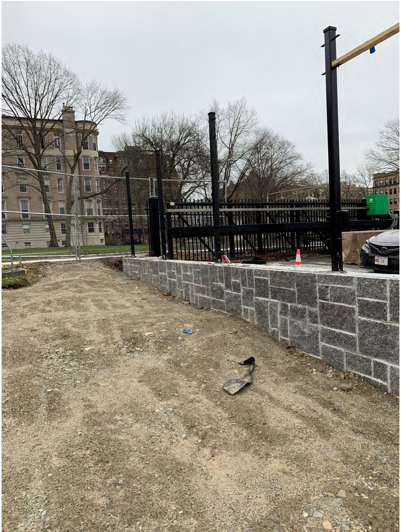
Work Area #13 – Boston Fire Department Building in the vicinity of the Fenway and Agassiz Road – granite veneer installed, and site backfilled at the north section of the constructed floodwall. Note the security fence post installed on top of the floodwall.