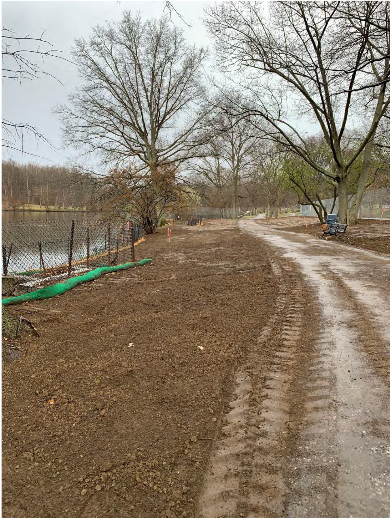
Work Area #1 – Leverett Pond – work area is prepped, and herbivore fence, coir log, and loam installed in preparation for plant installation in May after Work Area #2 is planted.