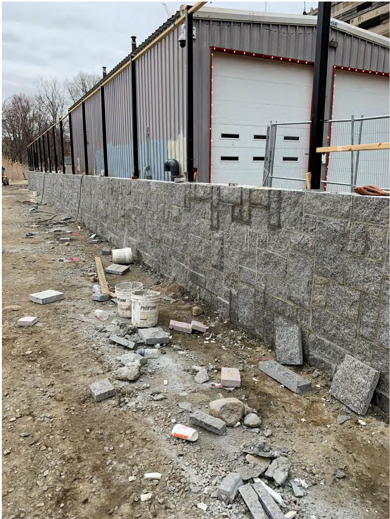
Work Area #13 – Boston Fire Department Building in the vicinity of the Fenway and Agassiz Road – granite veneer installed on the west section of the constructed floodwall. Note the security fence post installed on top of the floodwall.