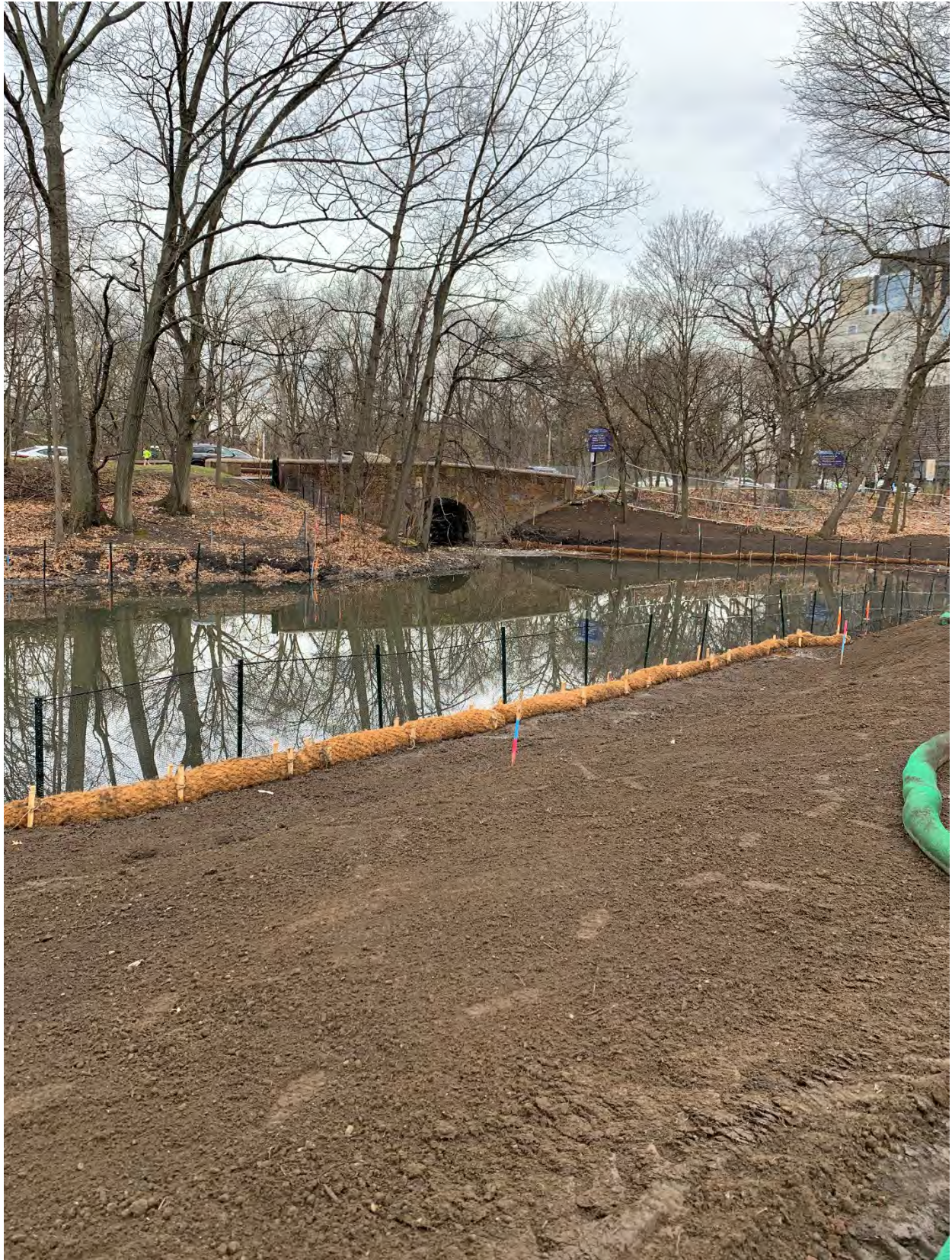
Work Area #2 – section of river at Brookline Avenue and the Riverway – near Beth Israel Deaconess Hospital – downstream section of the Work Area. Bank cleared, herbivore fence and coir log installed; and loam placed – ready for plants to be installed in early May.