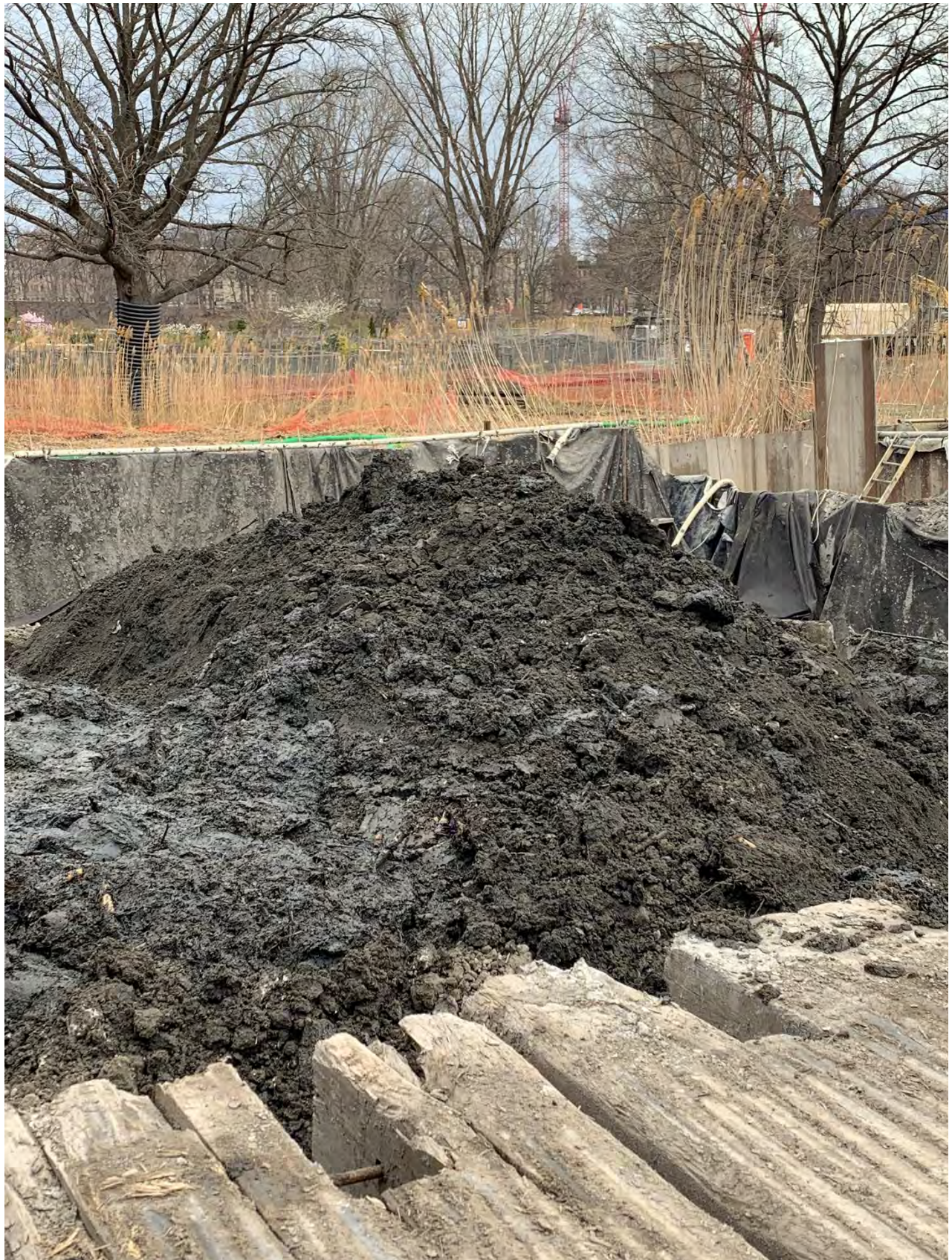
Work Area #11 – processed sediment in the central processing facility bin – awaiting transport off-site to the receiving facility.