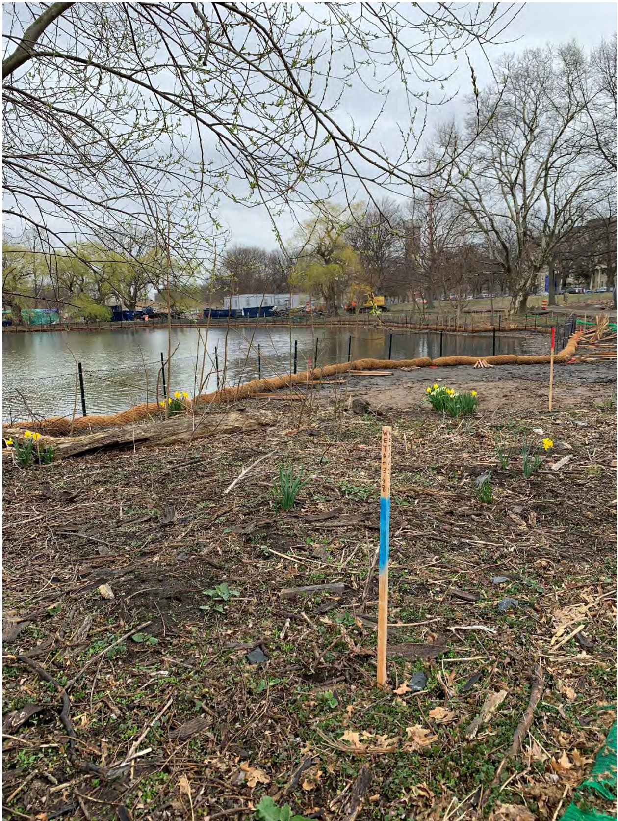
Work Area #10 – section of river immediately downstream of Work Area #9 which ends at Agassiz Road – herbivore fence and coir log installed, and wetland shelf constructed. Awaiting plantings and seed to be installed in the Spring planting window.