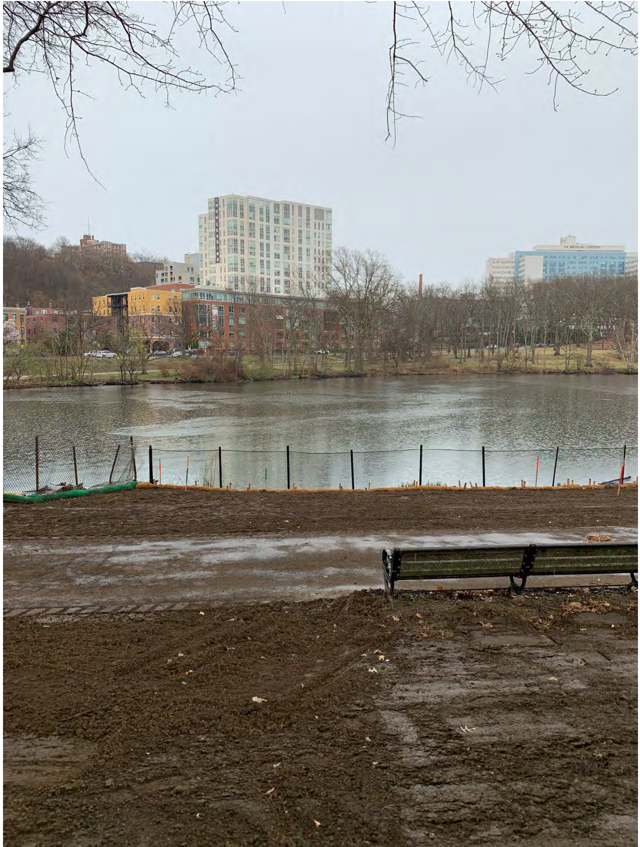
Work Area #1 – Leverett Pond – flood risk management channel dredged, and sandbar island removed. Note the bank is prepped and loam installed in preparation for plant installation in May after Work Area #2 is planted.