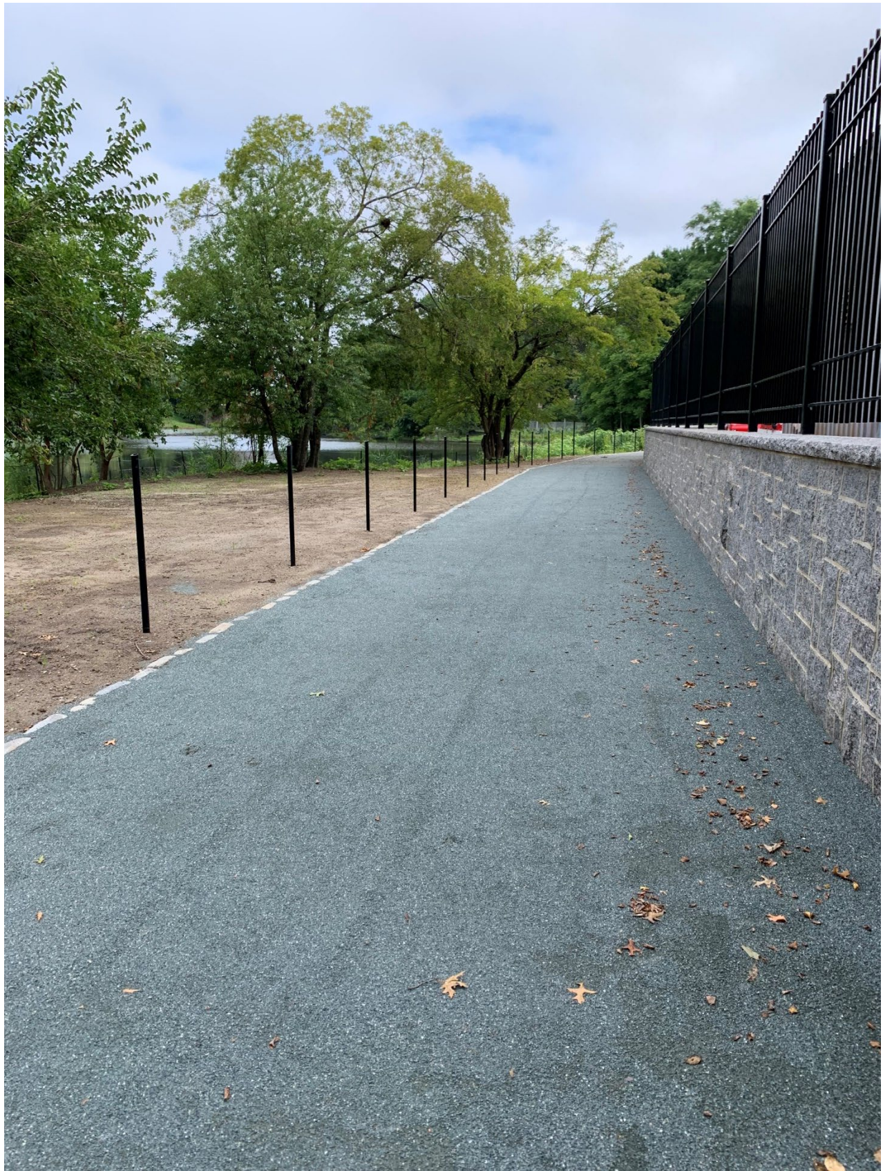
Work Area #13 – Boston Fire Department in the vicinity of The Fenway and Agassiz Road – full depth replacement of stonedust pathway along newly constructed floodwall. Posts for landscape protection fence installed awaiting fencing.