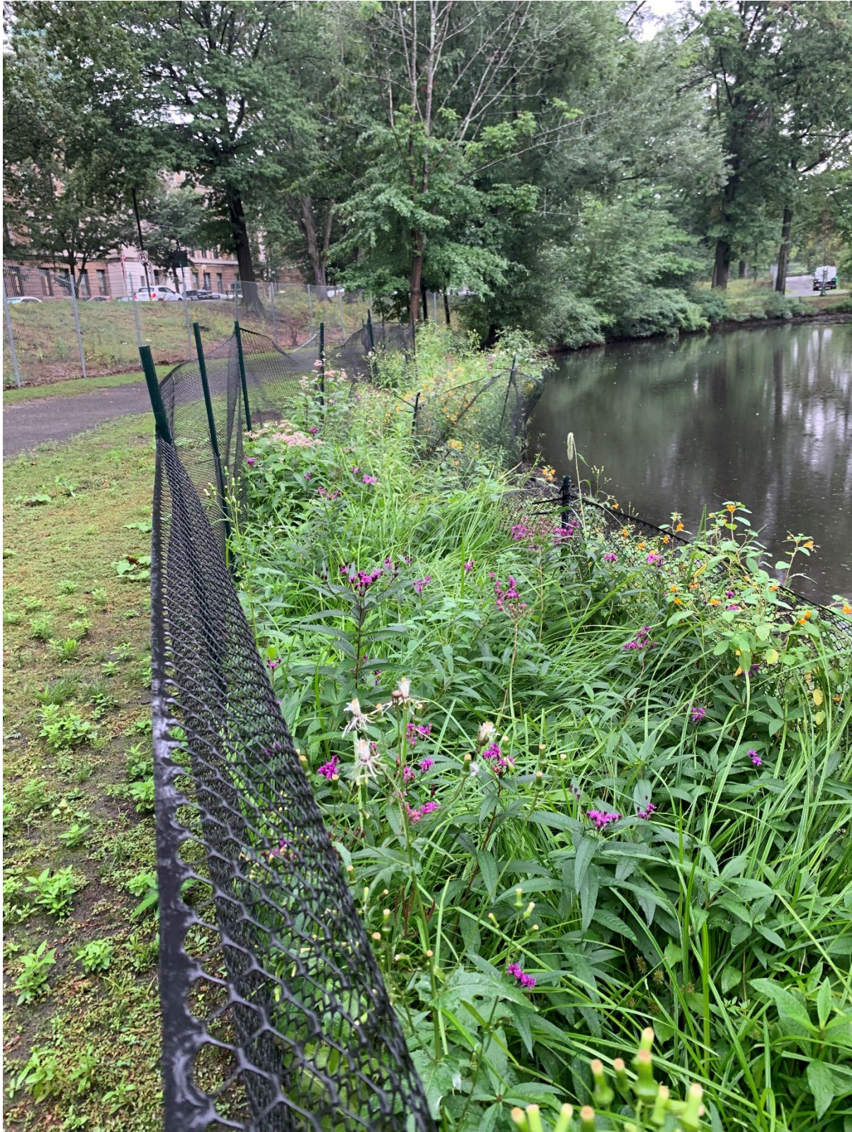
Work Area #7 – section of river immediately downstream of Avenue Louis Pasteur – planted shelf area growing along the bank.