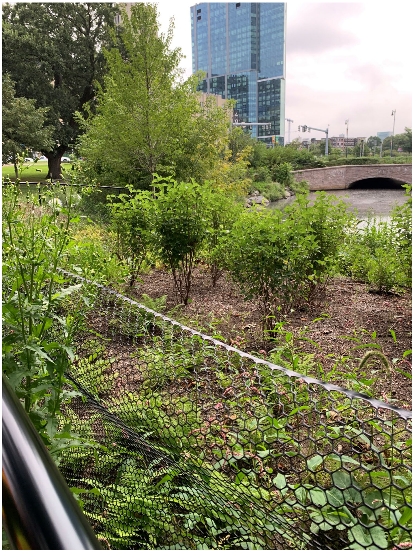
Work Area #6 – section of river by Back Bay Yard – looking downstream at the Riverway Culvert – planted bank.