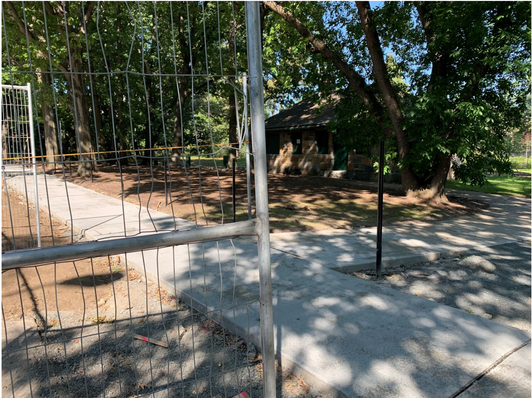
Work Area #11 – Agassiz Road Bridge and the Duck House – concrete sidewalk replaced in front of the Duck House.