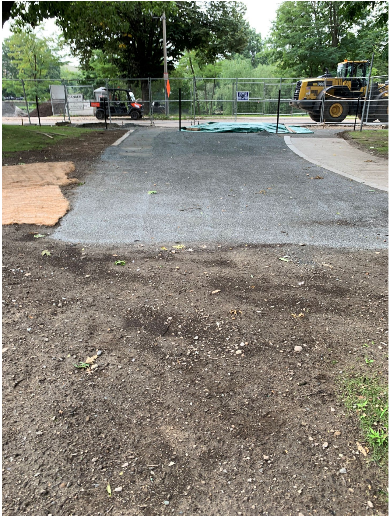
Work Area #11 – Agassiz Road Bridge and the Duck House – restored stonedust apron and cubing by the Duck House entrance.