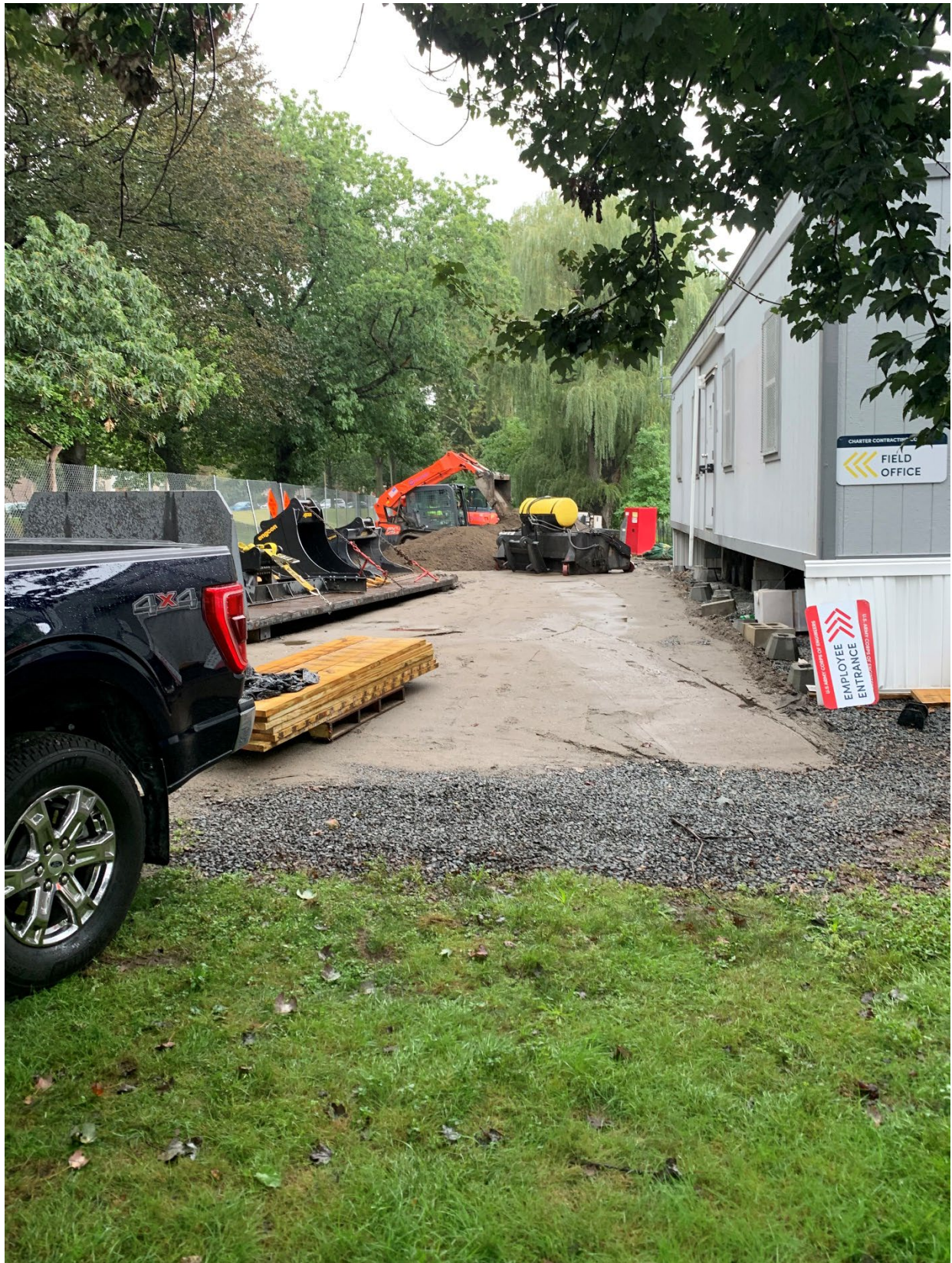
Work Area #10 – section of river immediately downstream of Work Area #9 which ends at Agassiz Road – Corps' construction trailer demobilized in order to perform final restoration.