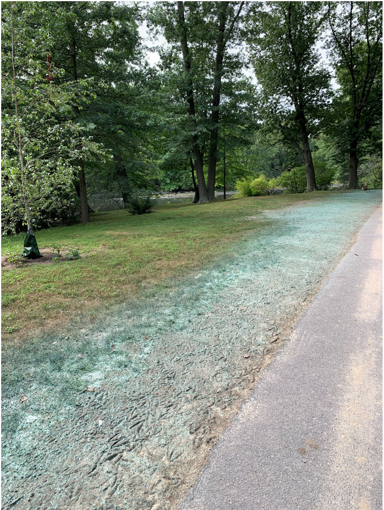
Work Area #6 – section of river by Back Bay Yard – hydroseeding reapplied to lawn area along paved walkway.