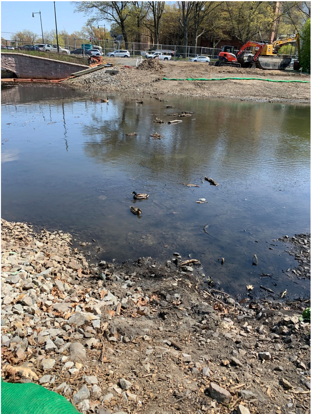
Work Area #6 – section of river by Back Bay Yard – FRCS cut to the final elevation and the last of the sediment dredged.