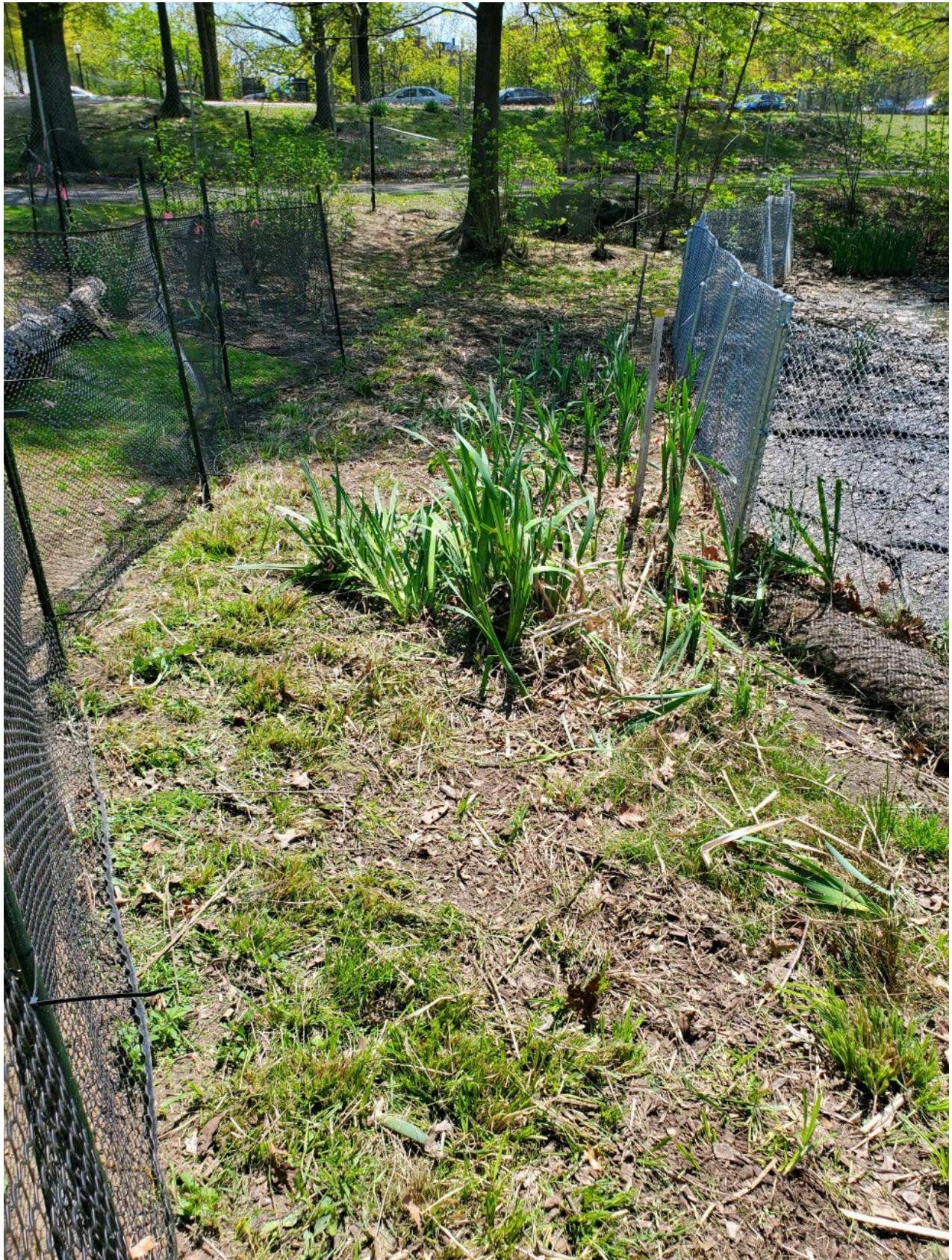
Work Area #9 – section of river immediately downstream of Work Area #8 – constructed wetland shelf coming back to life with the Spring weather.