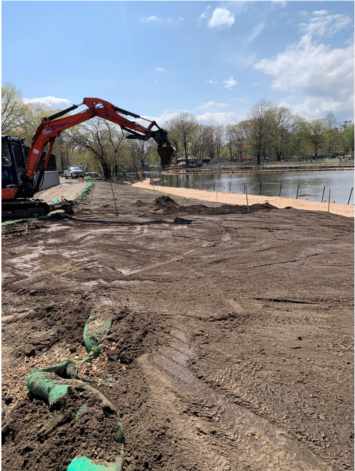
Work Area #12 – Additional Phragmites Removal – section of the river near BFD Building – Equipment spreading loam ahead of plantings for the restoration in this area.