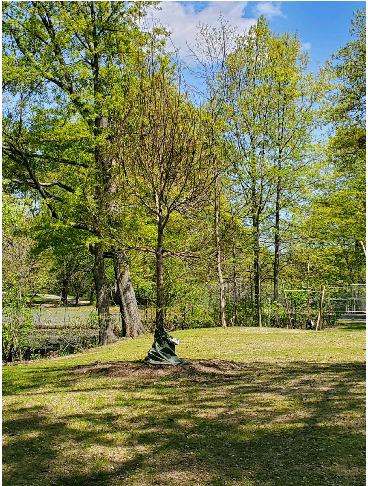
Work Area #9 – section of river immediately downstream of Work Area #8 – planted tree and turf coming back to life with the Spring weather.