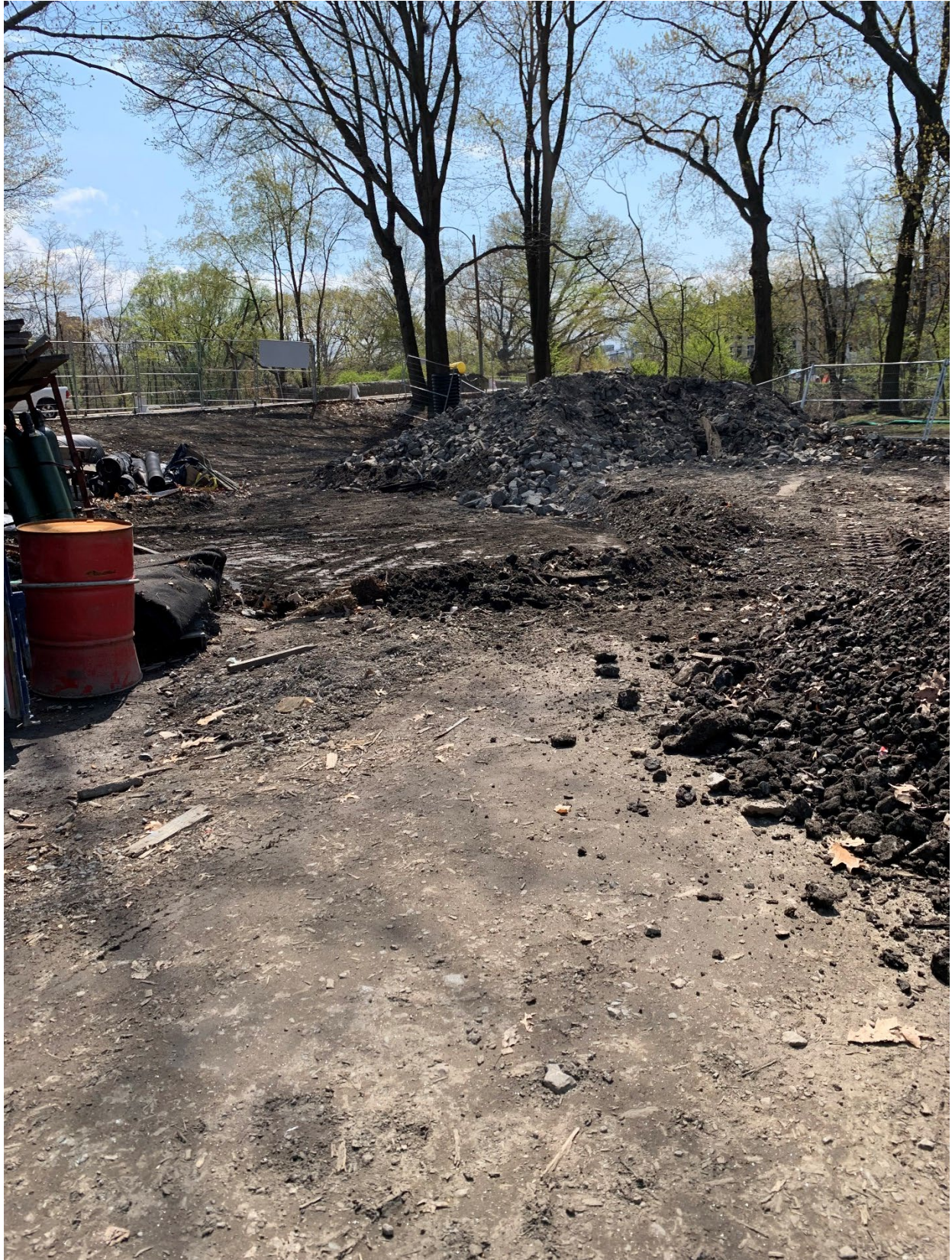
Work Area #11 – Additional Phragmites Removal – section of the river near Duck House – Removal of materials and equipment from the Central Processing Area by the Duck House in preparation of restoration and plantings.