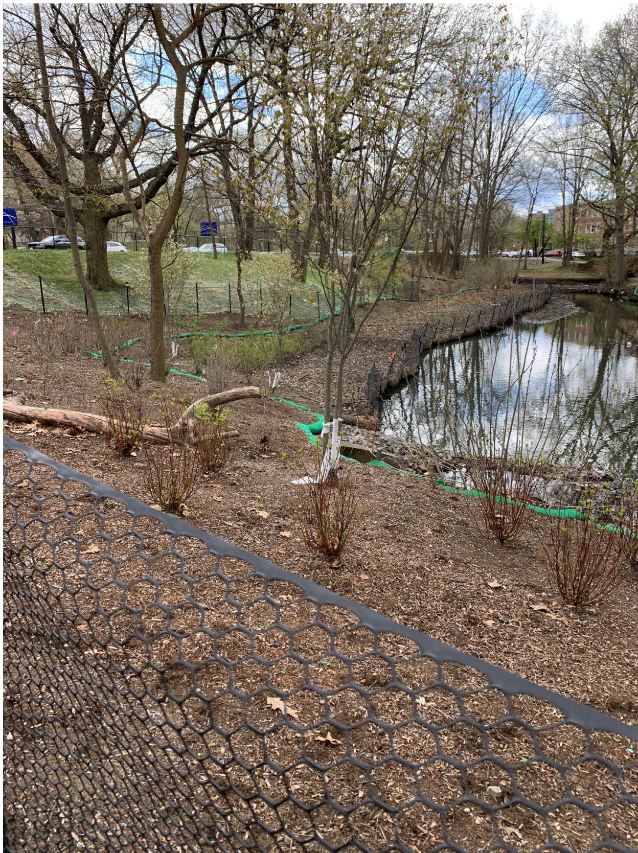
Work Area #3 – section of river at Brookline Avenue, the Riverway, and Netherlands Road – near Beth Israel Deaconess Hospital – view of the plantings and the turf coming back to life with the Spring weather.