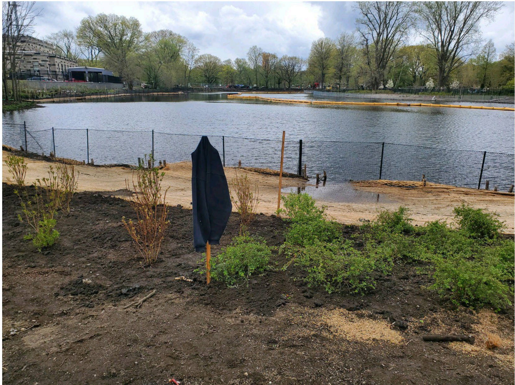
Work Area #12 – section of the river near Boylston Street Bridge – Upland shrubs installed and wetland seed spread in the TRM as part of the bank restoration.