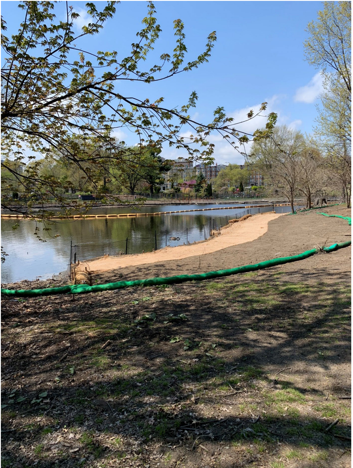
Work Area #12 – Additional Phragmites Removal – section of the river near BFD Building – Prepared area with loam, turf reinforcement mat (TRM) and herbivore fence installed ahead of plant installation.