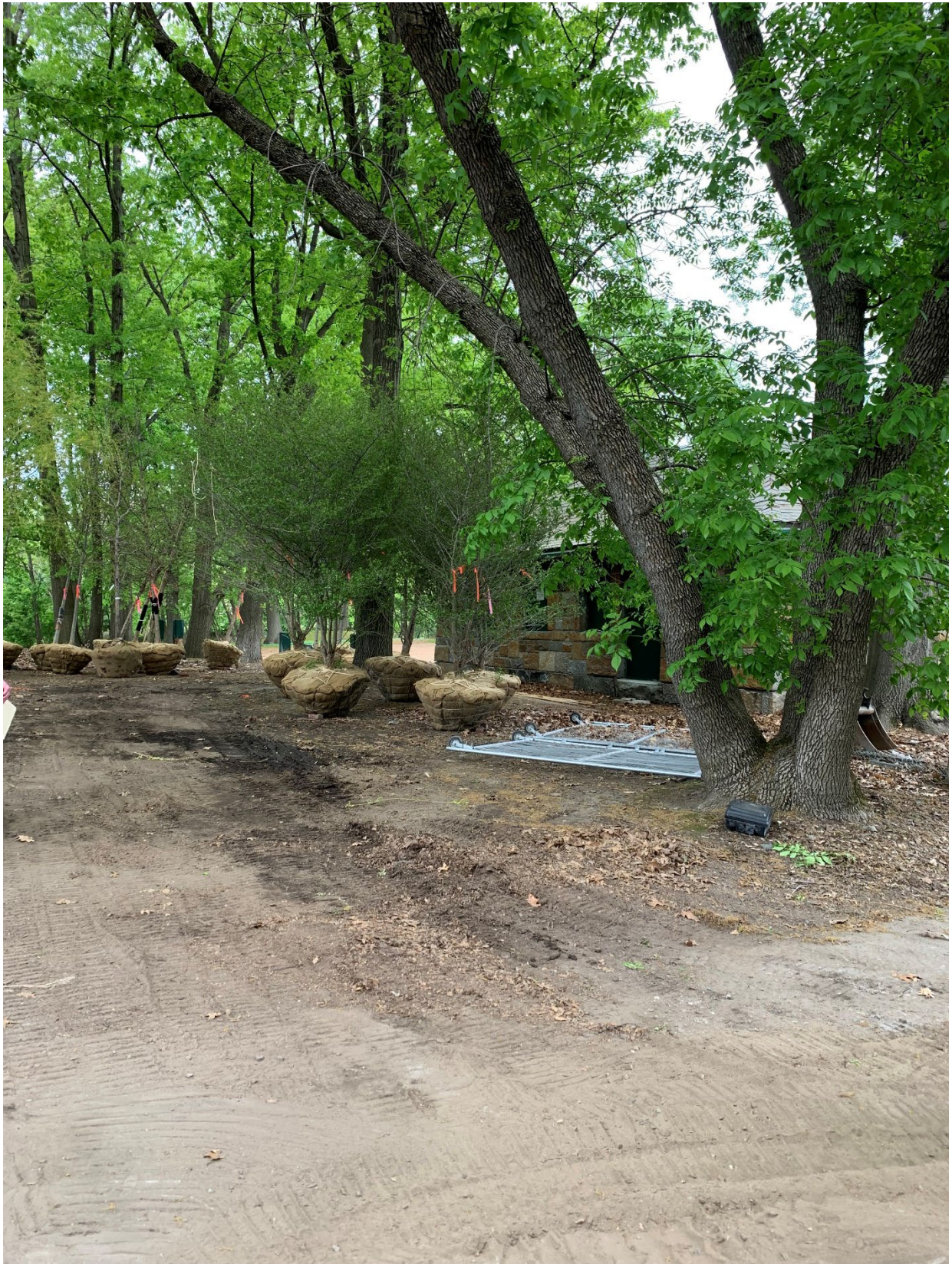
Work Areas #11 – section of the river downstream of Agassiz Road Bridge at the Duck House – Trees being staged near the Duck House for planting (mid-May 2023).