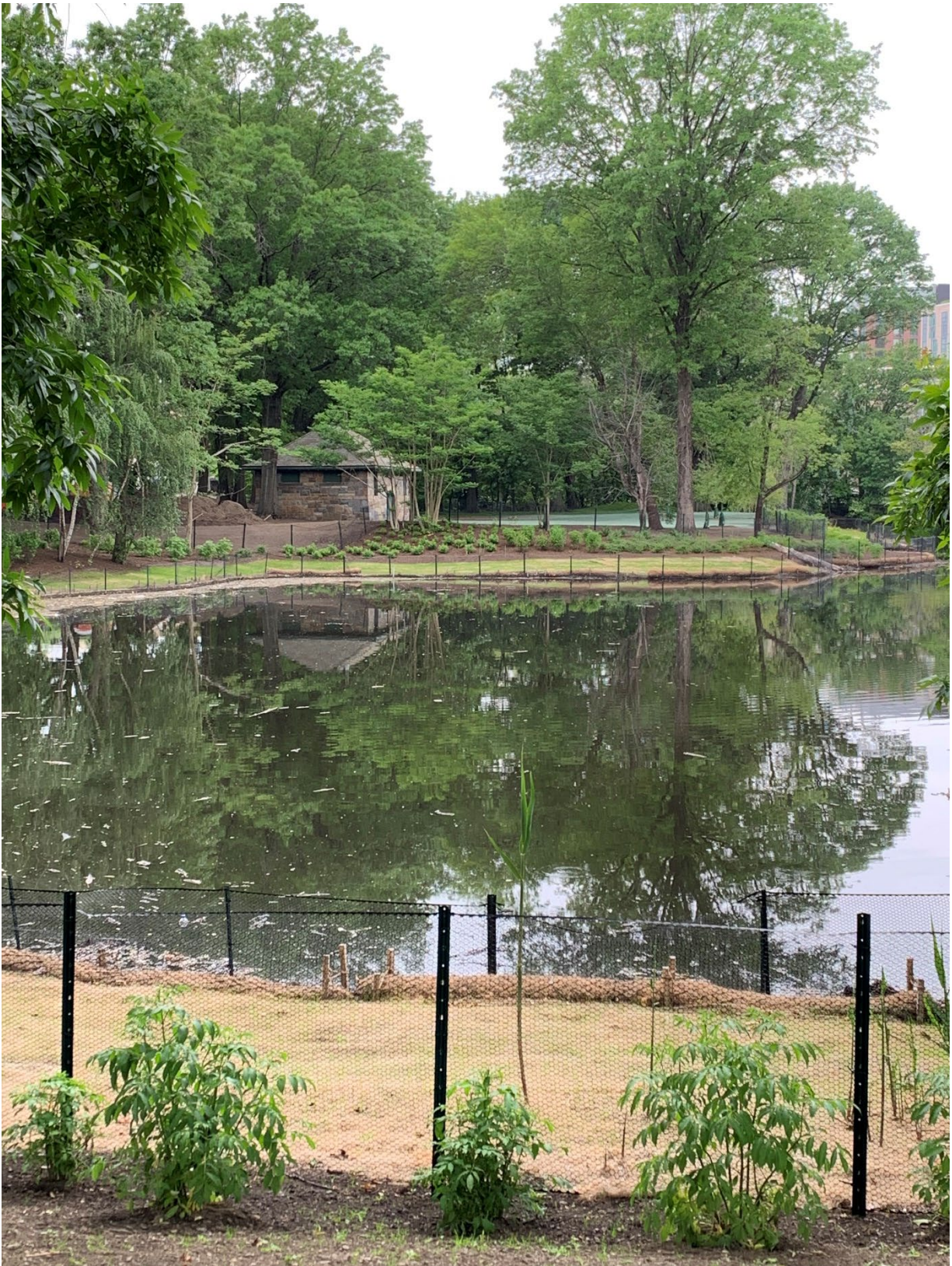
Work Areas #11 – section of the river downstream of Agassiz Road Bridge at the Duck House – Area of the Central Processing Bins where sediment was processed – area restored, planted, and hydroseeded (early June 2023).