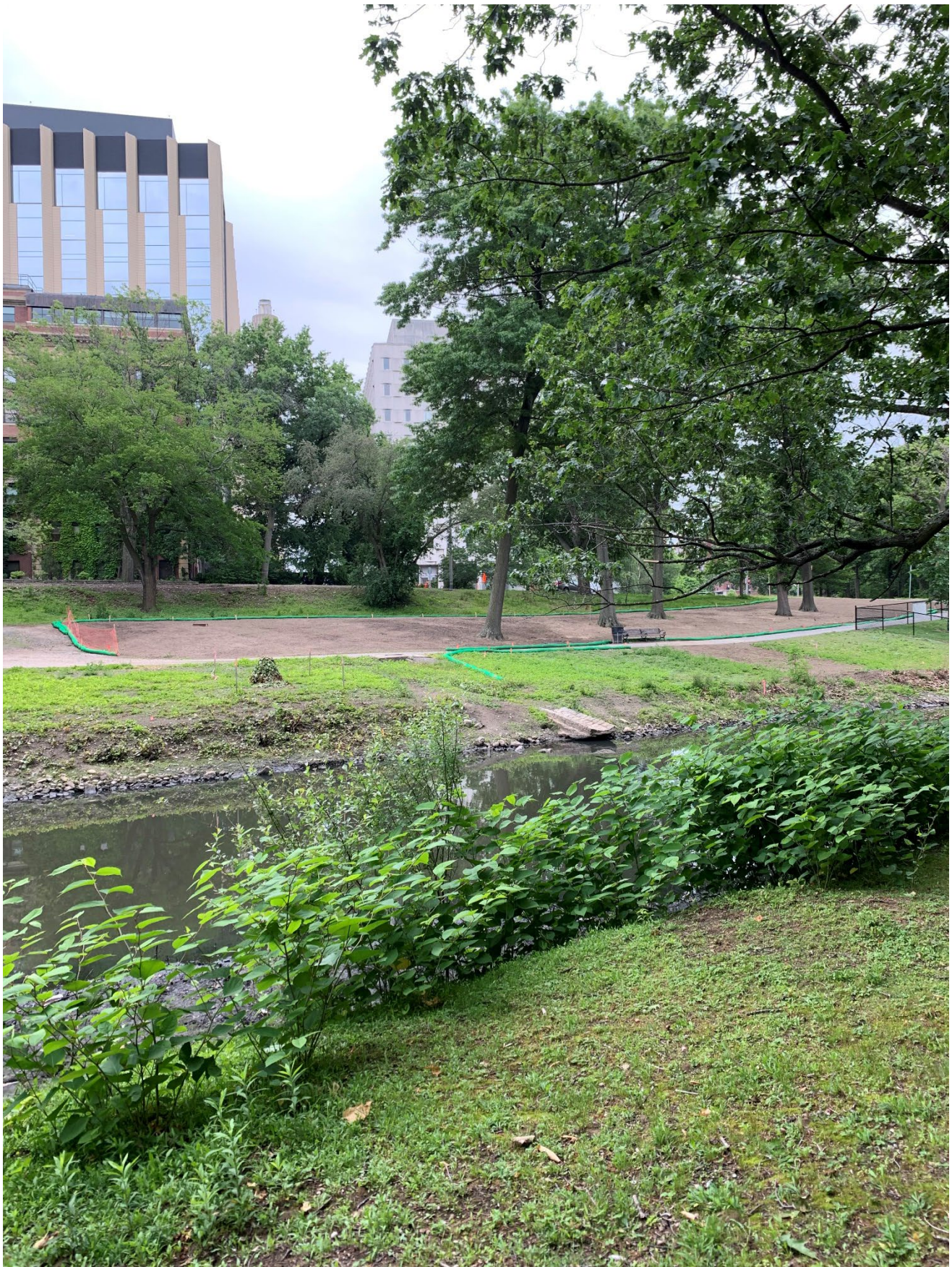
Work Area #4 – section of river immediately downstream of Work Area #3, across Netherlands Road – section of lawn being replaced with new loam (and will be hydroseeded) as part of the guarantee period.