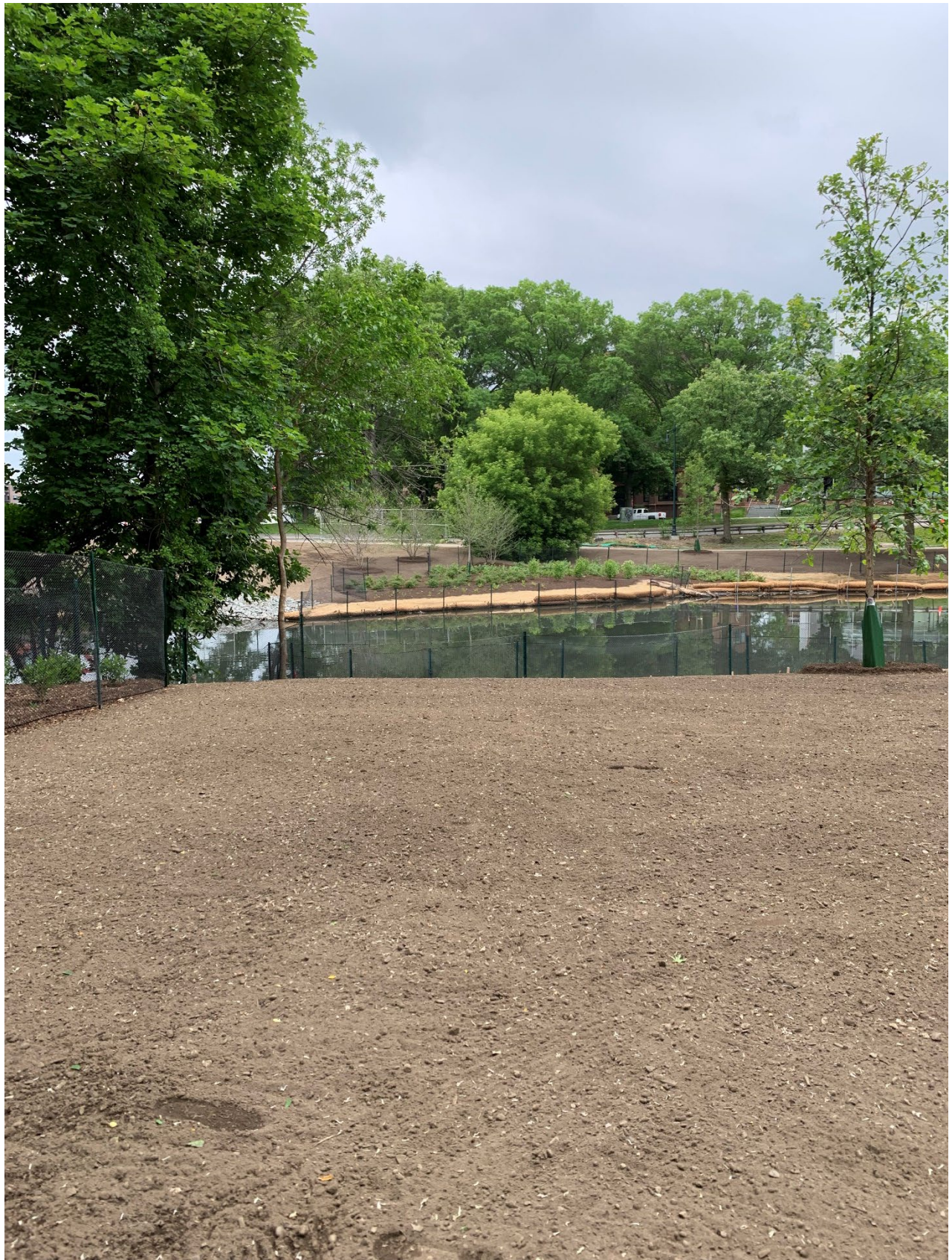
Work Area #6 – section of river by Back Bay Yard – Looking at right bank of the river – trees and shrubs planted (early June 2023).