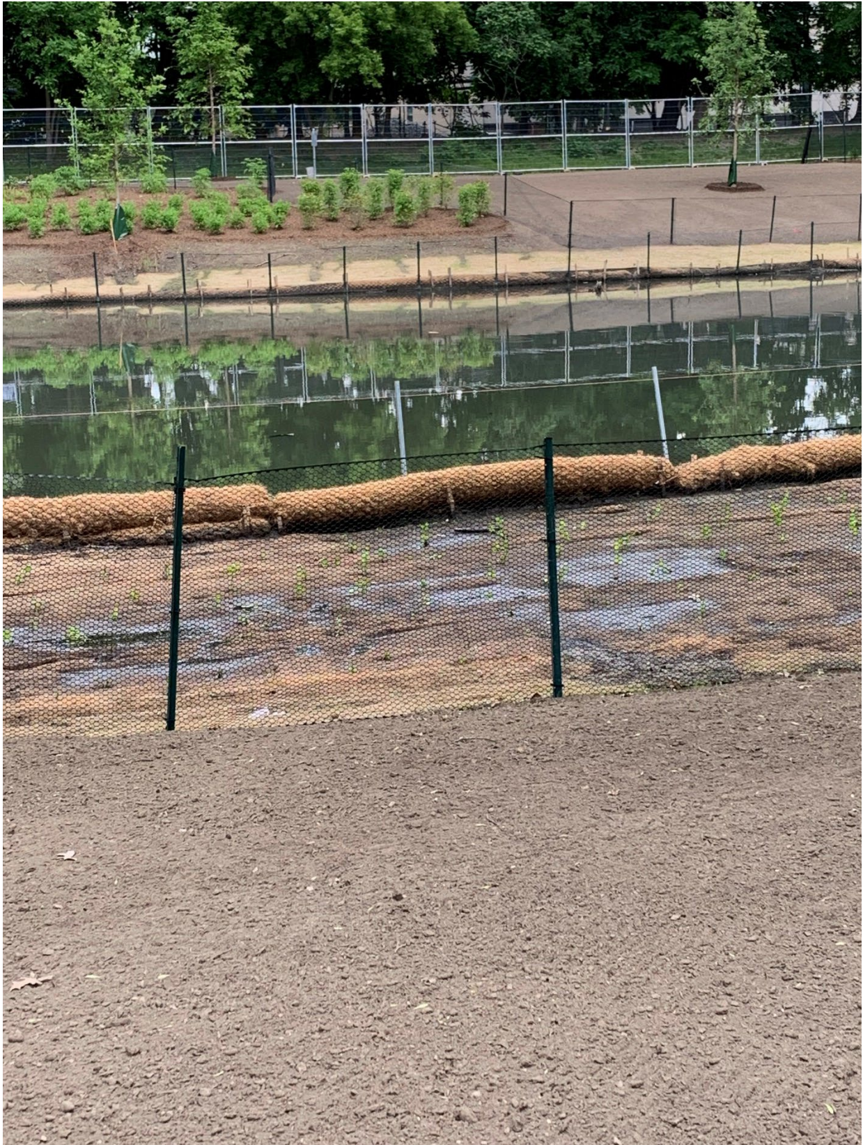
Work Area #6 – section of river by Back Bay Yard – Wetland plugs installed in Wetland Shelf B on the left bank (early June 2023). Lawn will be hydroseeded early next week.