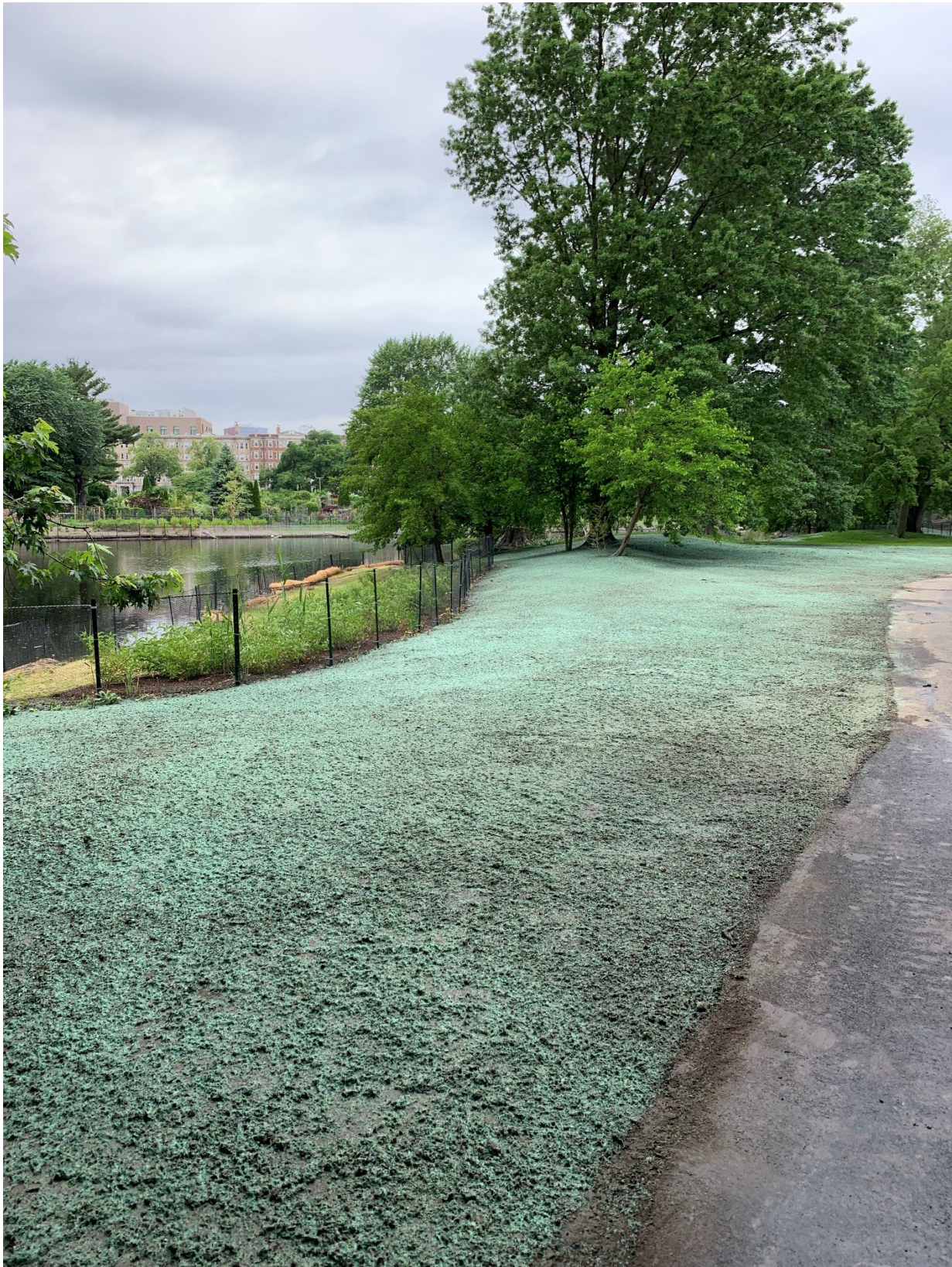
Work Area #12 – section of the river near Boylston Street Bridge – Area restored – new paved pedestrian path; loam and seed; shrubs and trees planted (early June 2023).