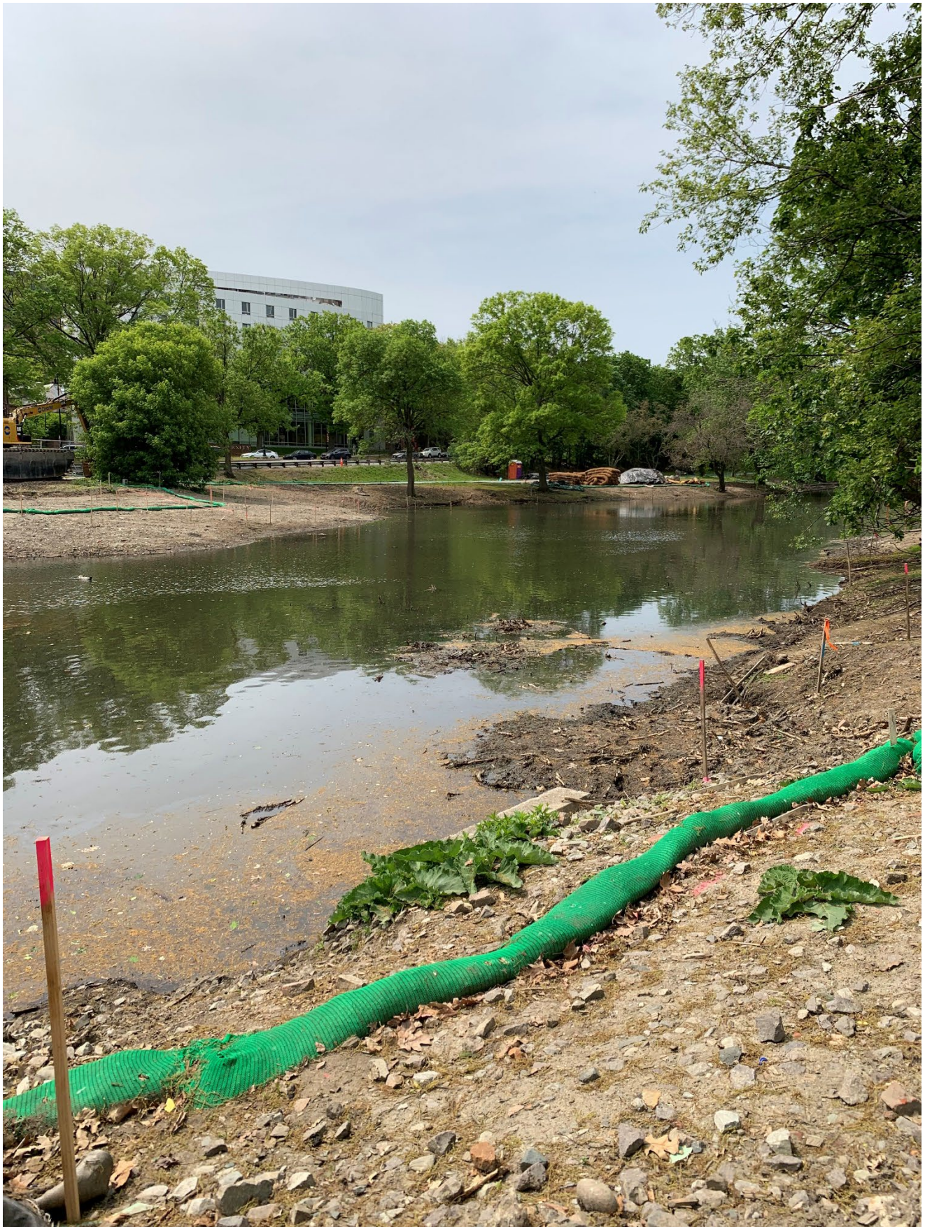
Work Area #6 – section of river by Back Bay Yard – Flood Risk Management (FRM) channel dredged and phragmites removed. Area ready to be prepped for restoration (mid-May 2023) – Looking upstream at the right bank.