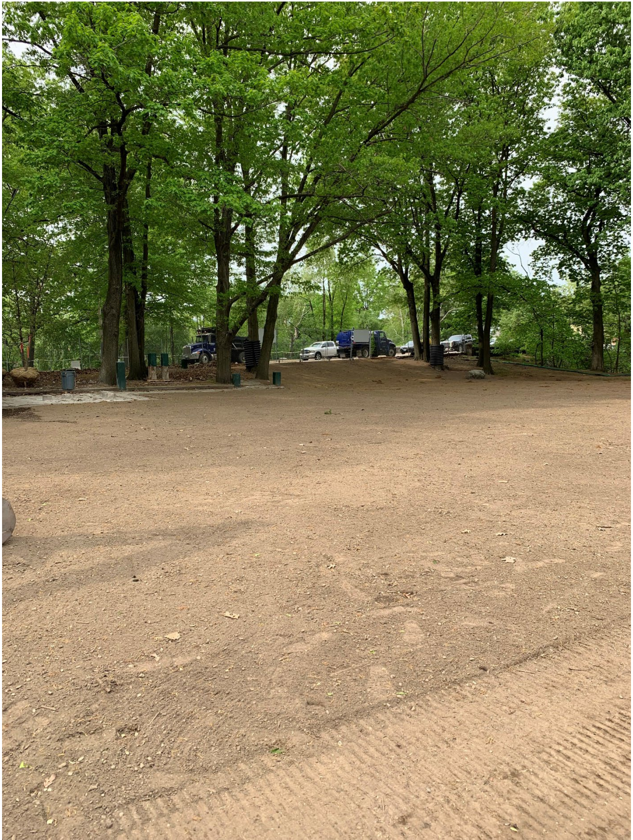
Work Areas #11 – section of the river downstream of Agassiz Road Bridge at the Duck House – Area near the Duck House restored and regraded – ready for plantings and hydroseed (mid-May 2023).