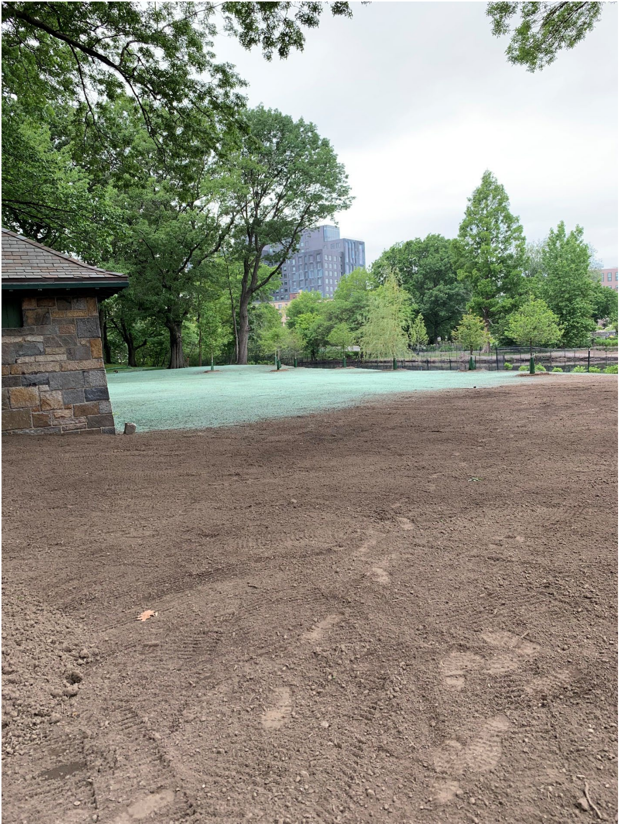
Work Areas #11 – section of the river downstream of Agassiz Road Bridge at the Duck House – Area of the Central Processing Bins where sediment was processed – area restored, planted, and hydroseeded (early June 2023).