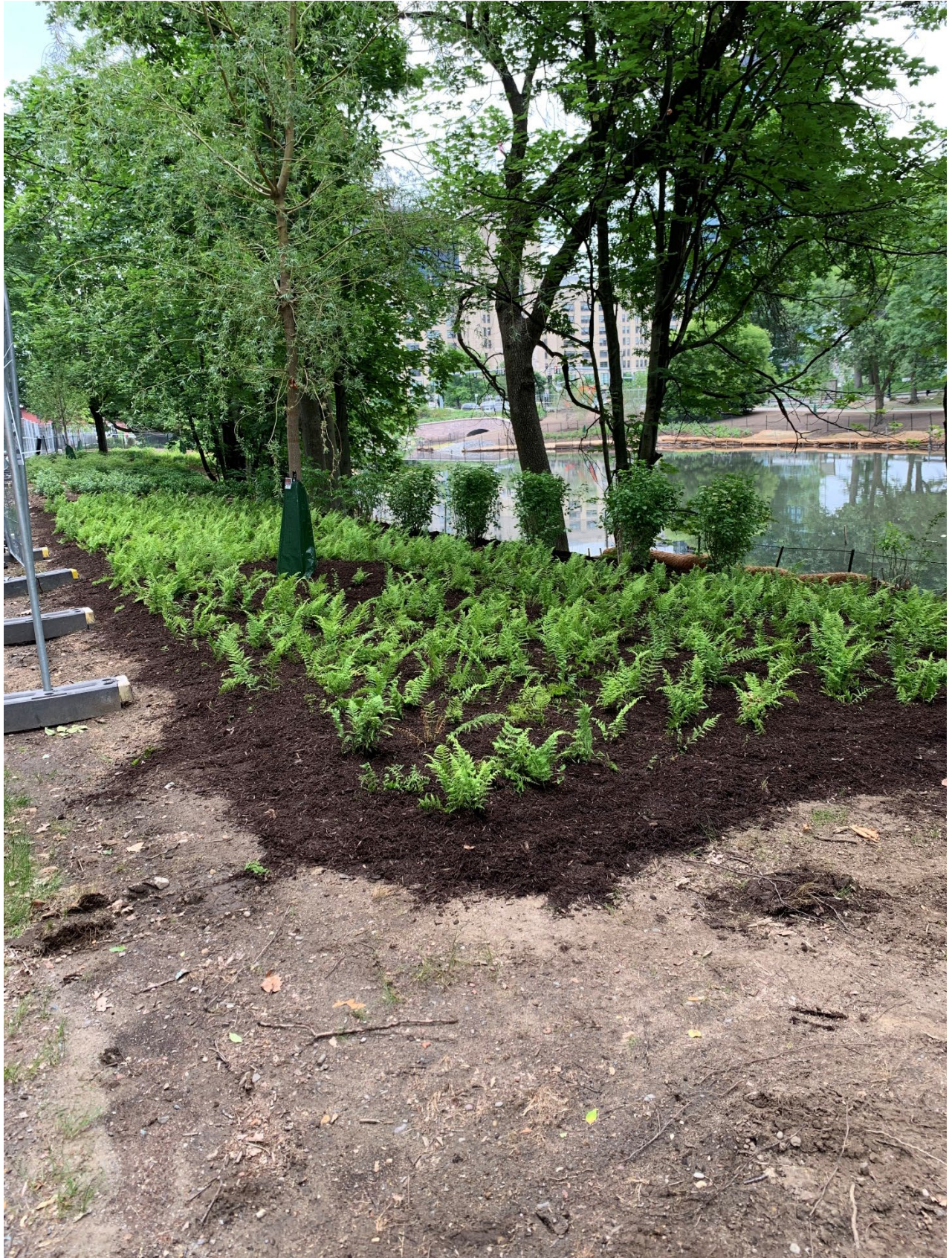
Work Area #6 – section of river by Back Bay Yard – Trees, shrubs, and ferns planted on the left bank (June 2023). Landscape protection fence will be installed in July for 2 years of the guarantee period.