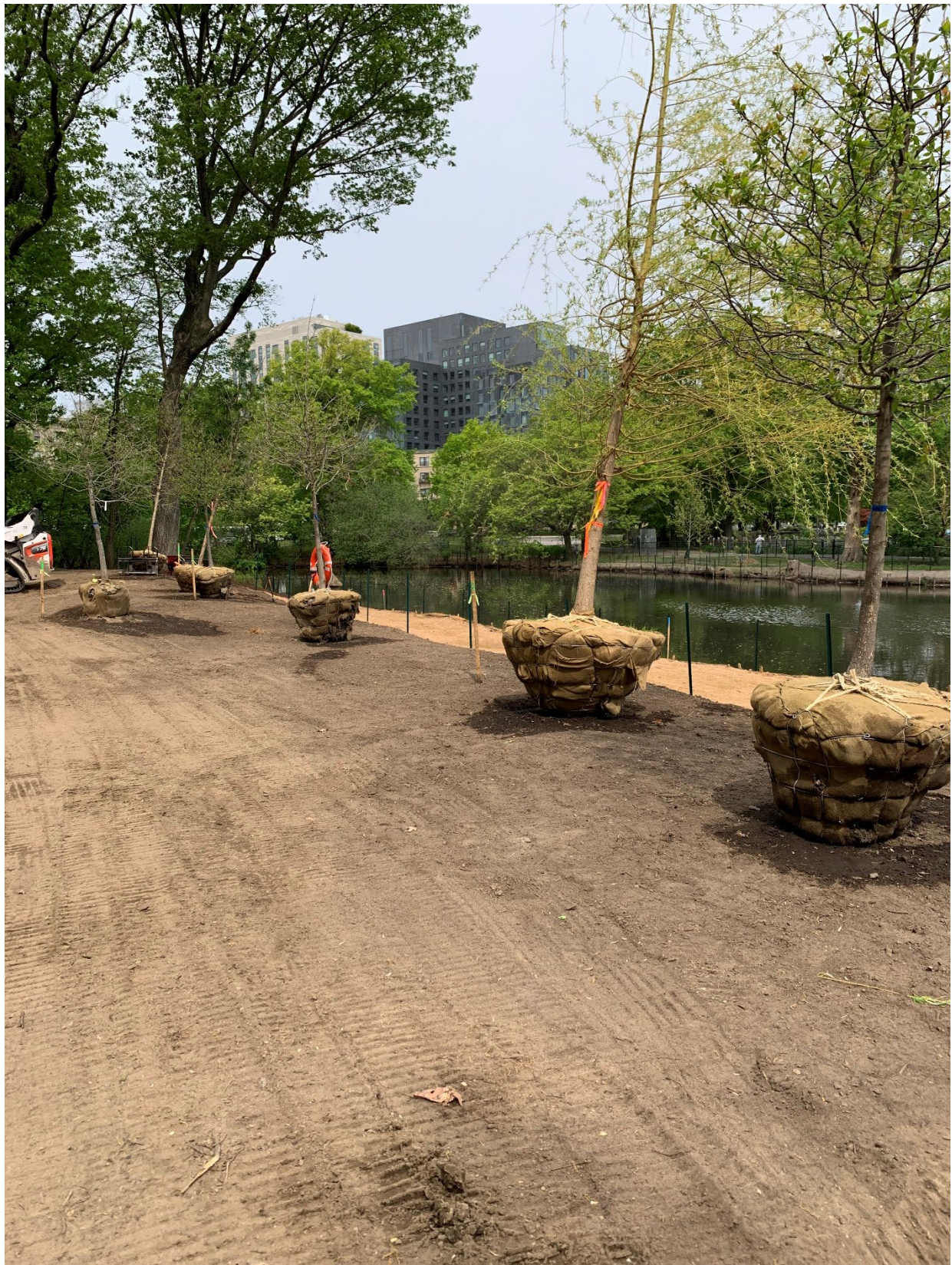
Work Areas #11 – section of the river downstream of Agassiz Road Bridge at the Duck House – Area of the Central Processing Bins where sediment was processed – trees staged for installation (mid-May 2023).