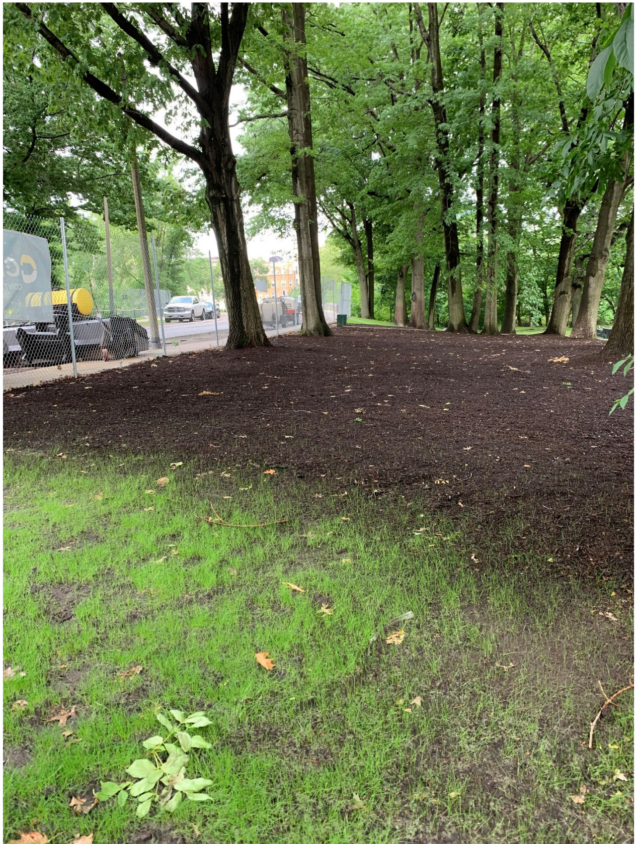
Work Areas #11 – Agassiz Road Bridge and the Duck House – area restored by the Duck House.