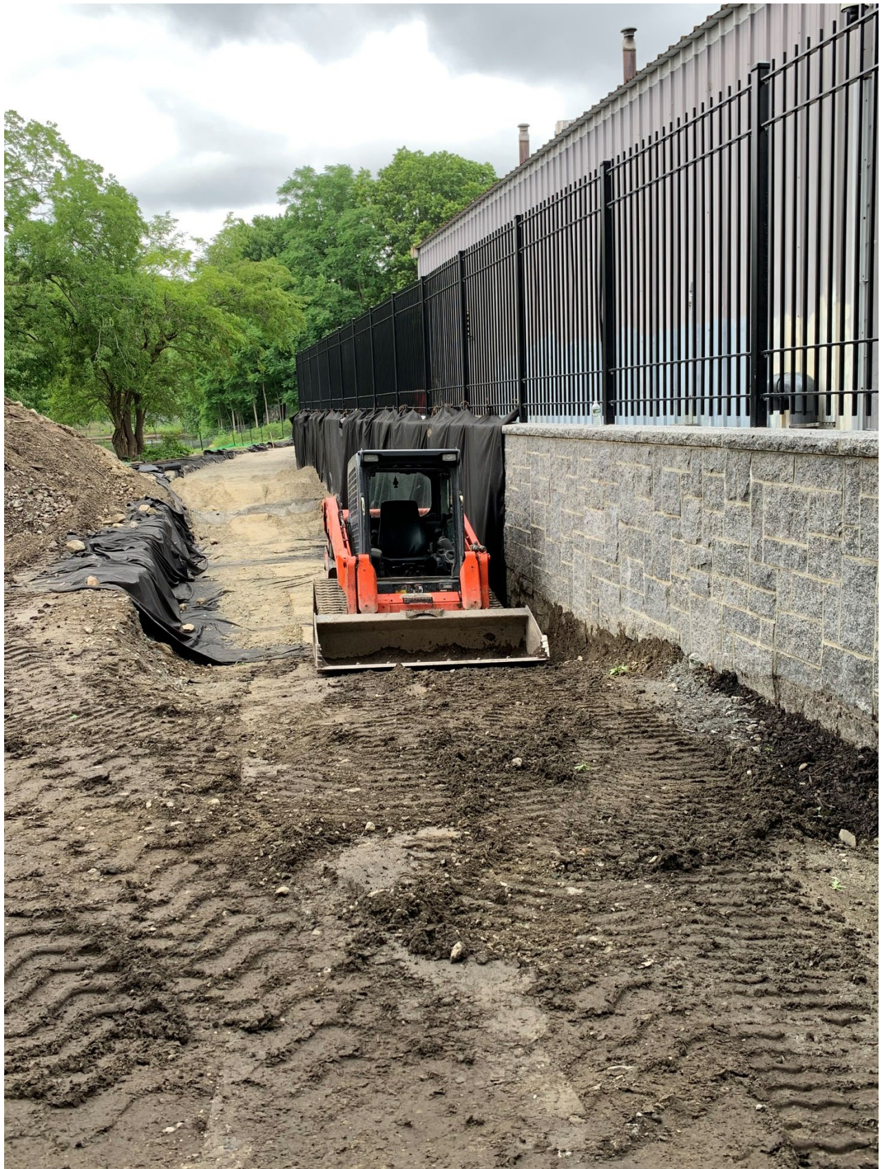
Work Area #13 – Boston Fire Department Building in the vicinity of The Fenway and Agassiz Road – excavation of subgrade and full depth restoration of the stonedust path.