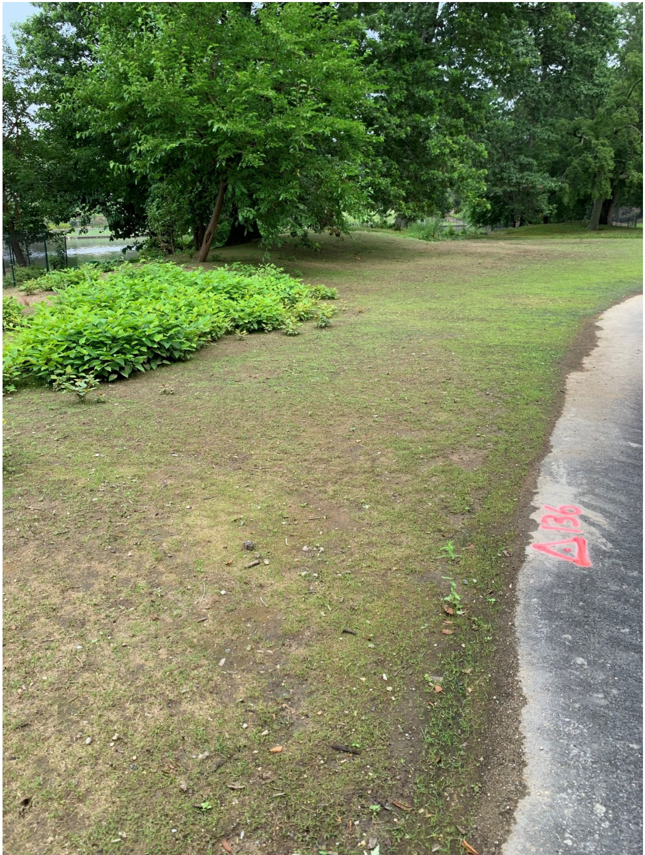
Work Area #12 – section of the river near Boylston Street Bridge – new paved pedestrian path; loam and seed; shrubs and trees planted in early June 2023. Lawn area will be reseeded as necessary during the two-year guarantee period.