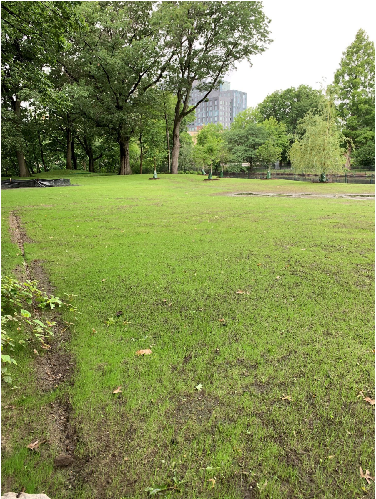
Work Areas #11 – section of the river downstream of Agassiz Road Bridge at the Duck House – Area of the Central Processing Bins where sediment was processed – area restored, planted, and hydroseeded (late June 2023).