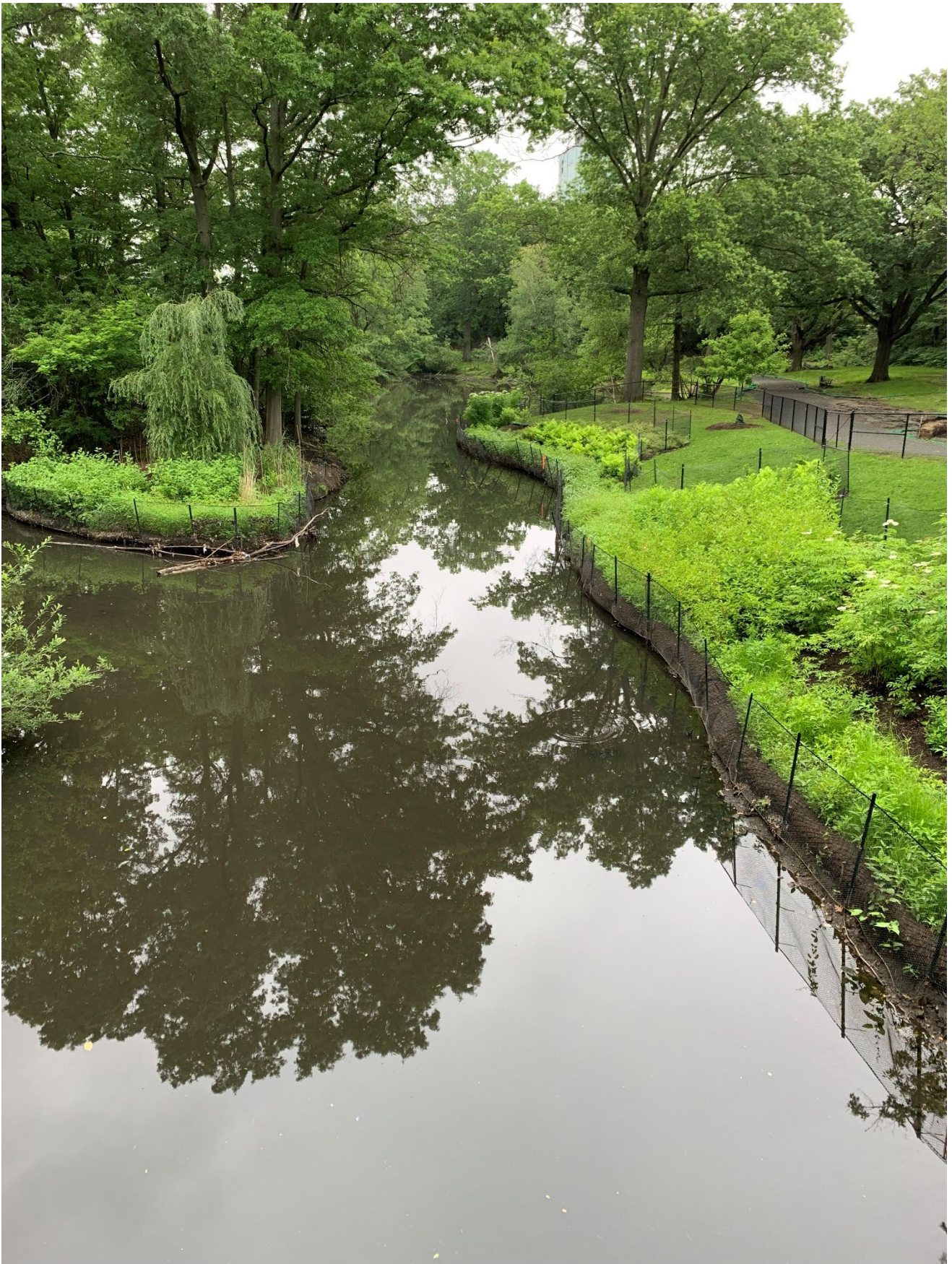
Work Area #5 – section of river by Short Street Bridge to Back Bay Yard – looking downstream, a review of the planted area on the bank and the new island.