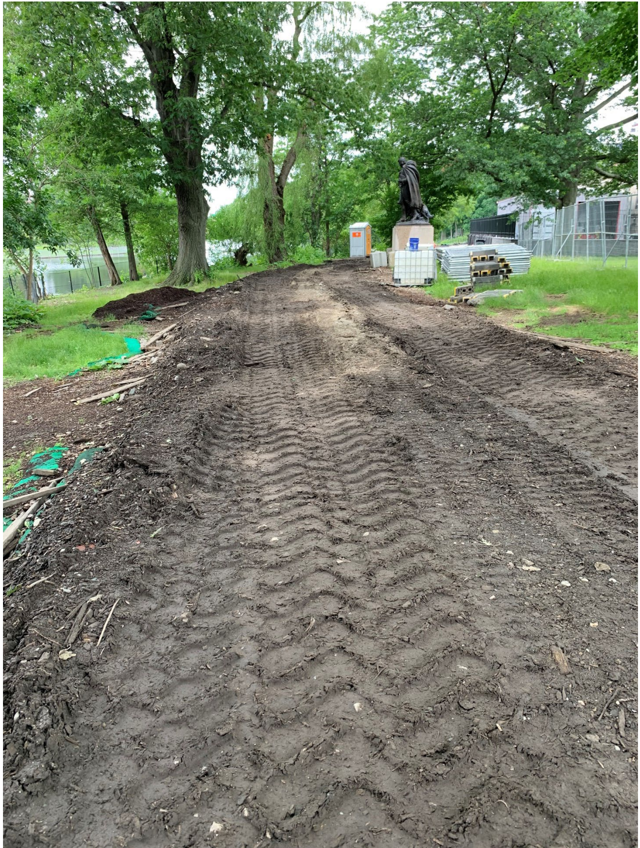
Work Area #13 – Boston Fire Department Building in the vicinity of The Fenway and Agassiz Road – tree root protection and timber mats removed ahead of excavation, grading, and installation of new stonedust path.