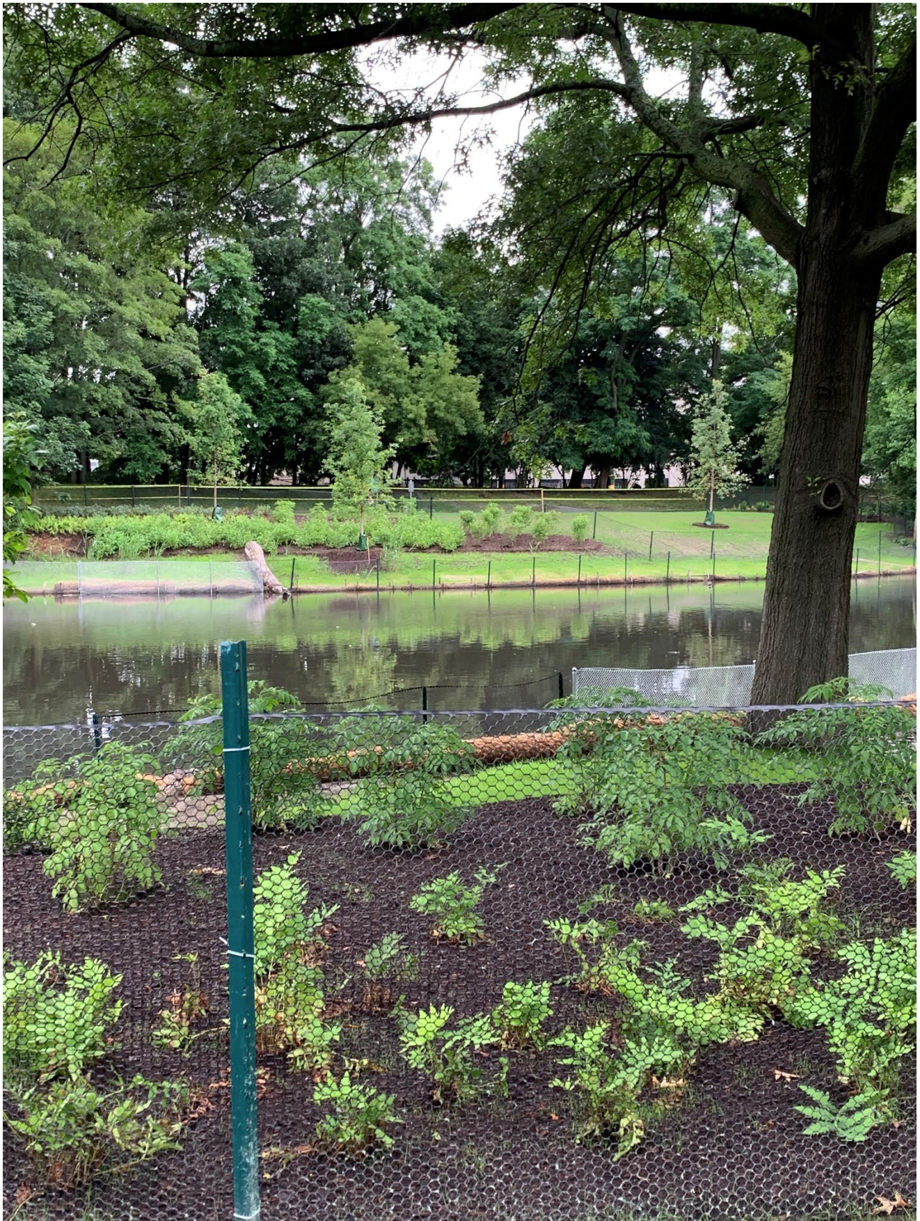
Work Area #6 – section of river by Back Bay Yard – both banks restored, planted, hydroseeded.