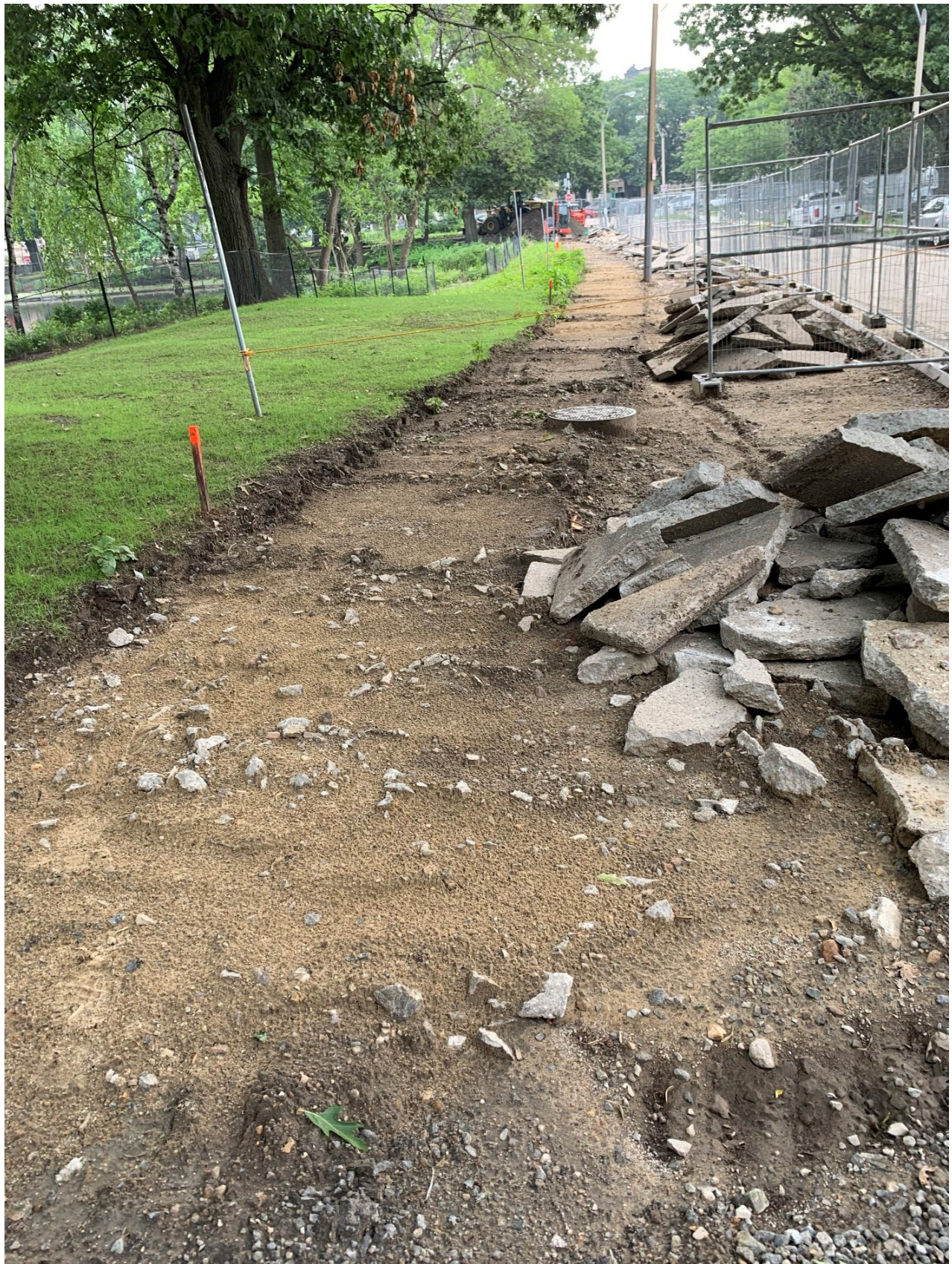
Work Areas #11 – Agassiz Road Bridge and the Duck House – existing sidewalk removed and area being prepared for new sidewalk replacement as part of the Agassiz Road restoration.