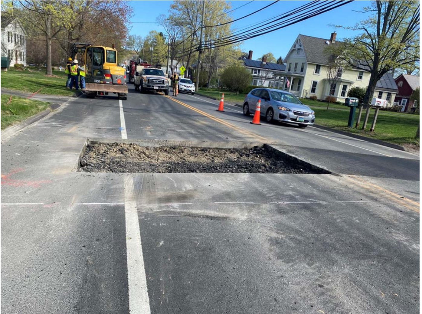
Picture 1: Ludlow begins to excavate the trench in front of residence 257 Main Street, Durham. View to the north.