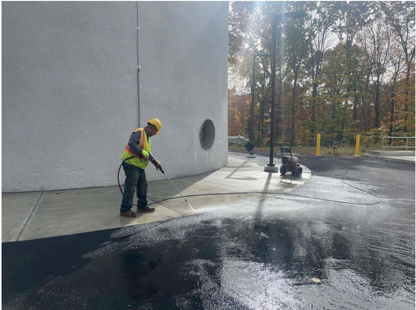
Picture 4: Ludlow pressure washing the concrete sidewalk that surrounds the water tank located east of the Shared Access Road in Middletown. View to the south.