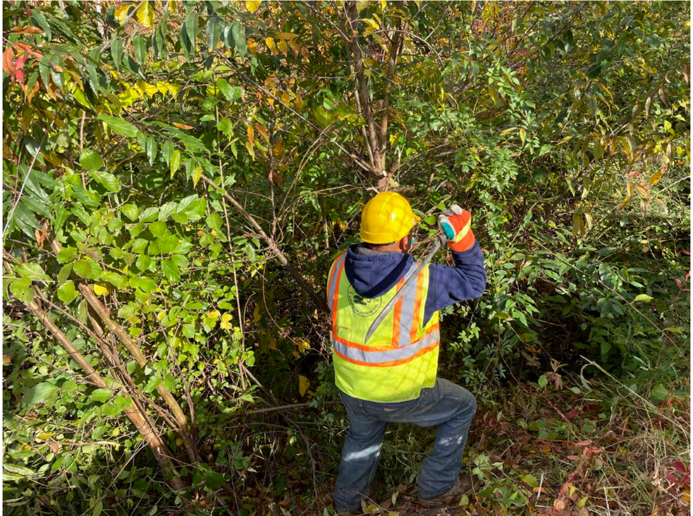
Picture 2: Ludlow clearing brush on the north side of the Shared Access Road in Middletown. View to the northeast.