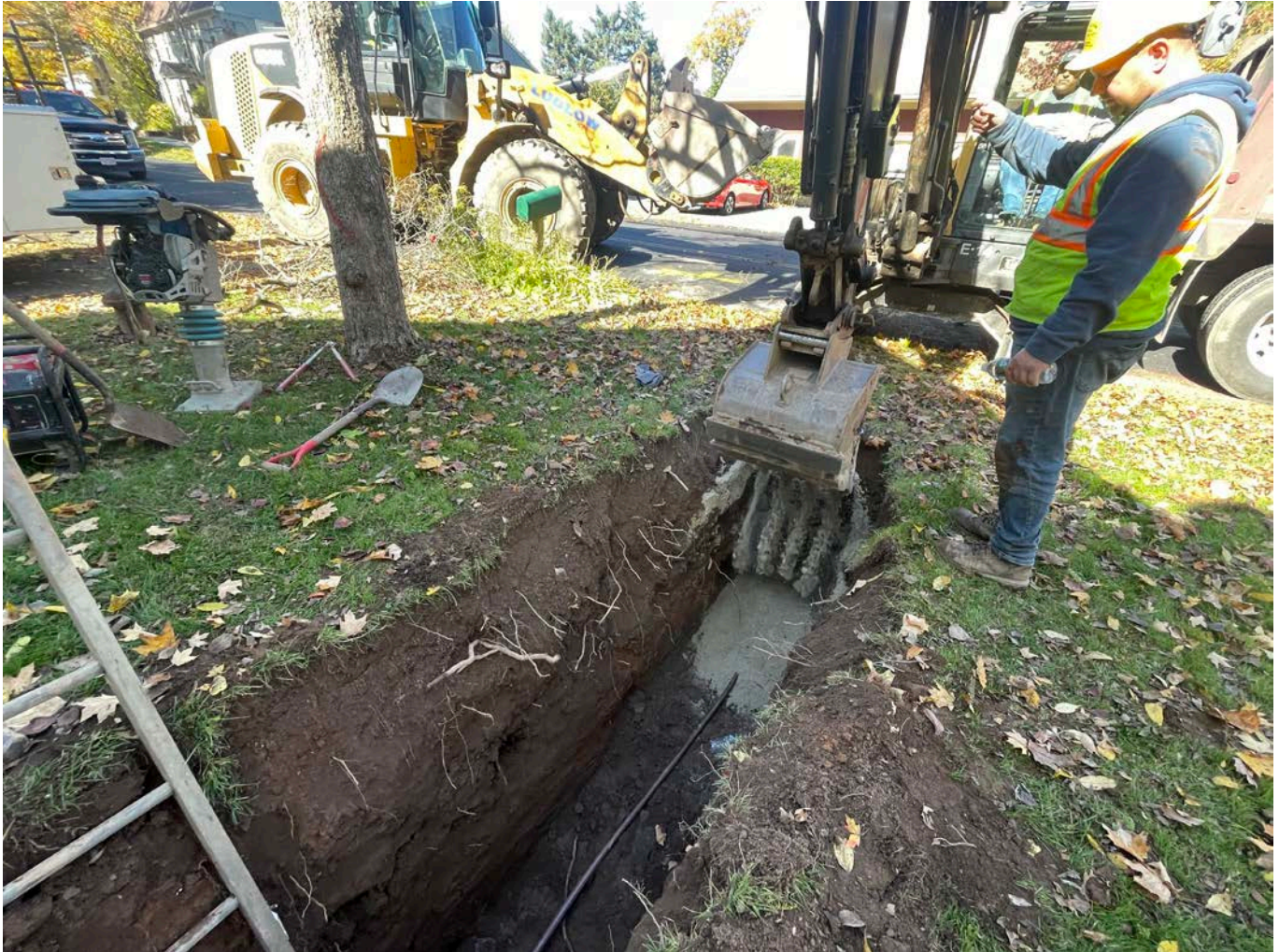
Picture 12: Ludlow placing sand over and under the 1" copper water service line that they ran from the curb stop located on the north side of the 11 Maiden Lane residence into the basement of the home. View to the northwest.