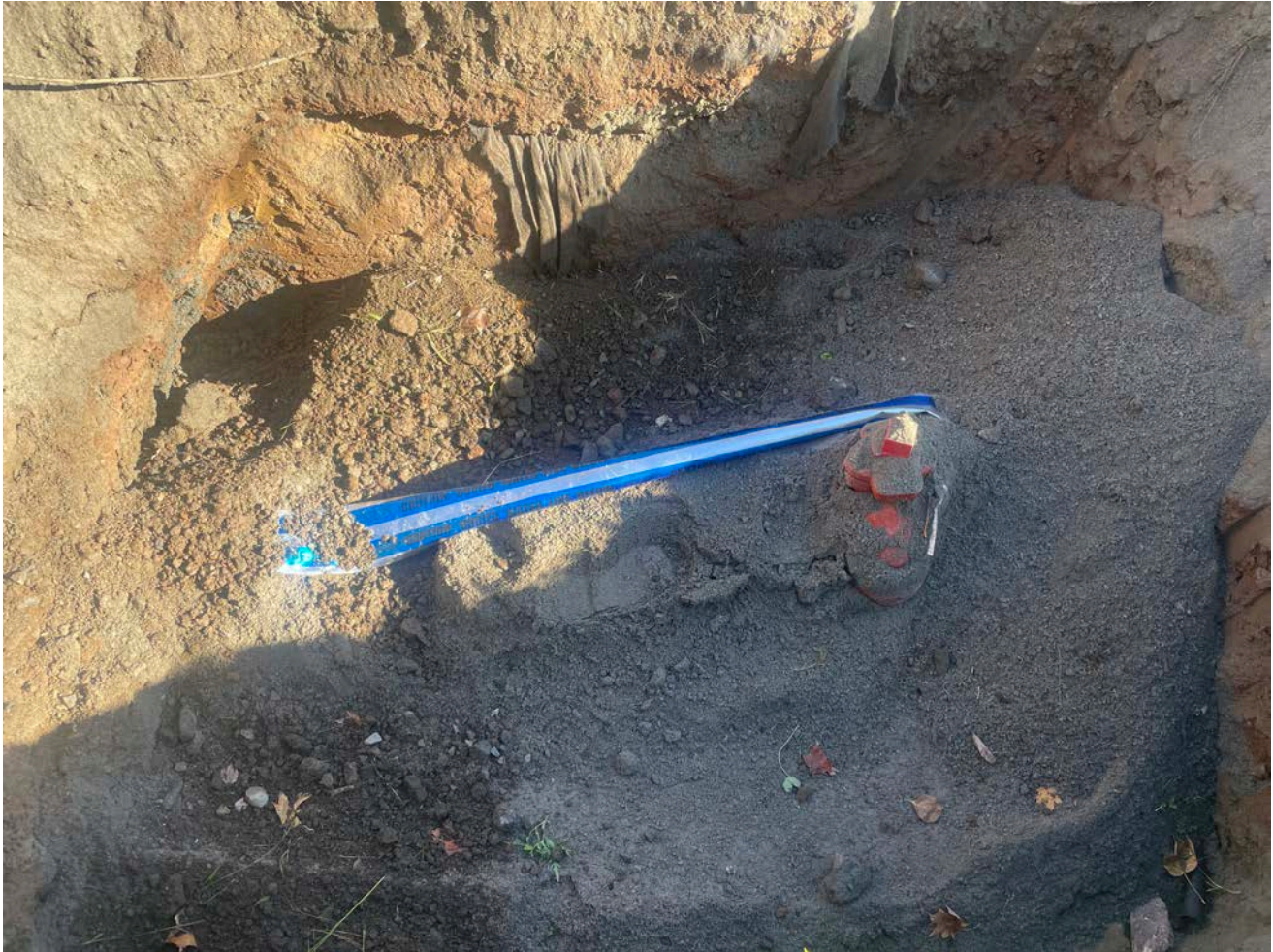
Picture 5: Sand and caution tape that Ludlow placed over the filter fabric and 8" DIP gate valve that they just installed on the north side of the Booster Station. View to the north.