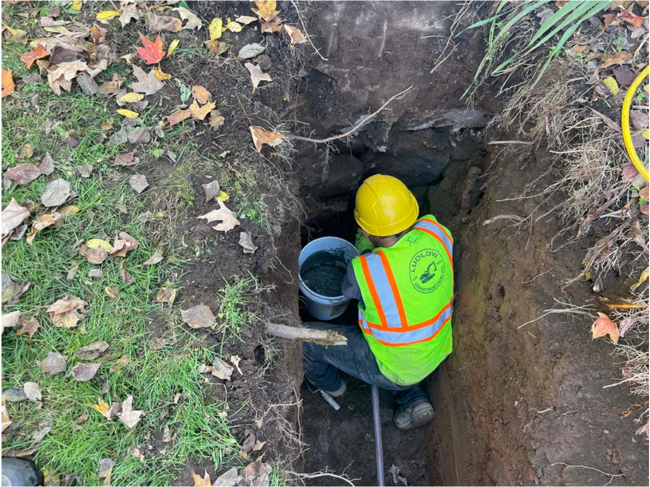
Picture 11: Ludlow using hydraulic cement to secure the 1" copper water service line that they ran through the north side of the foundation of the 11 Maiden Lane residence. View to the south.