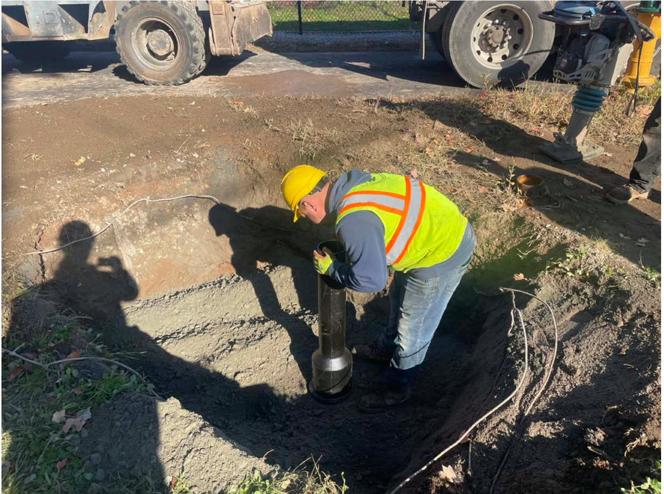
Picture 6: Ludlow setting a road box in place over the 8" DIP gate valve that they just installed on the north side of the Booster Station. View to the northwest.

Project: Durham Meadows Pipeline Installation Date: October 21, 2022 Location: Maiden Lane and Main Street, Durham; S. Main Street, Middletown Day of Week: Friday Project #: AECOM: 6061487 Report No: 535 Contractor: Ludlow Construction Page: 9 of 17