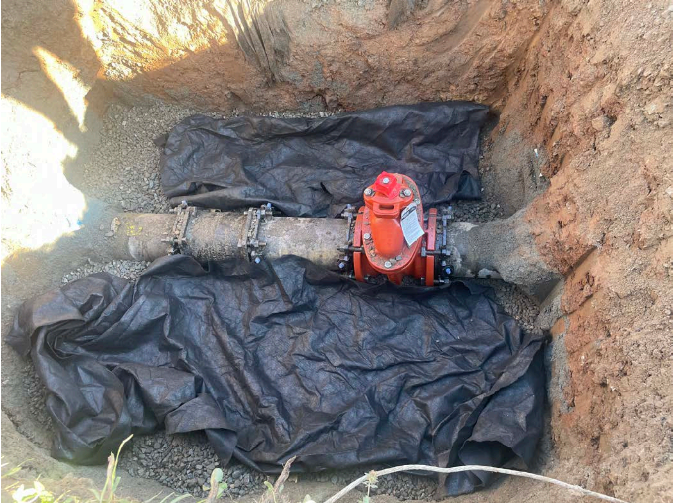
Picture 4: Filter fabric that Ludlow placed on the north and south sides of the 8" DIP gate valve they just installed on the north side of the Booster Station. View to the north.