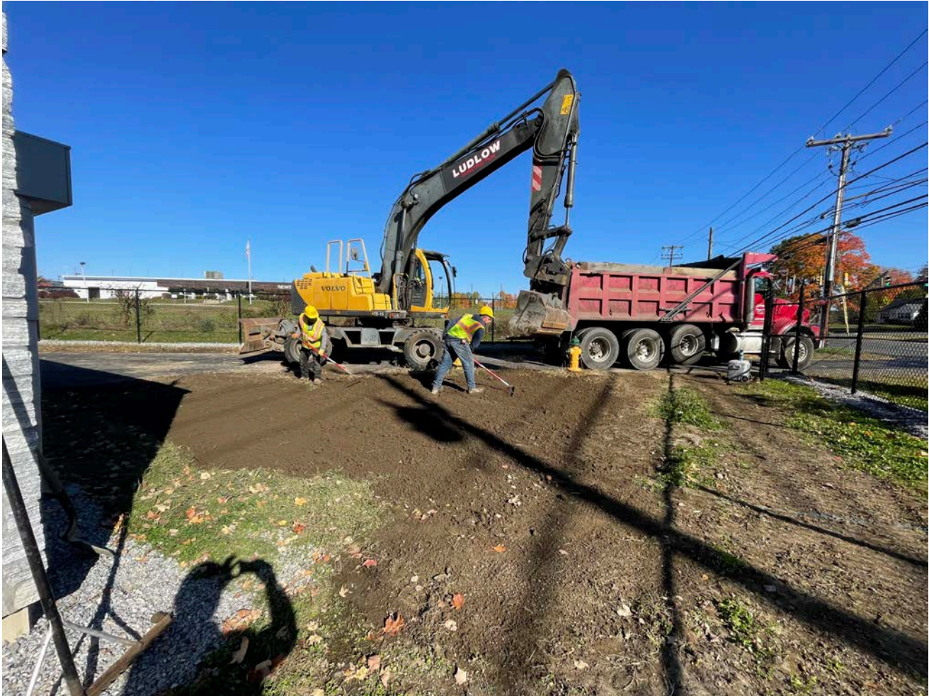
Picture 8: Ludlow placing loam and grass seed on the north side of the Booster Station on those areas of lawn that were disturbed during the installation of an 8" gate valve. View to the north.