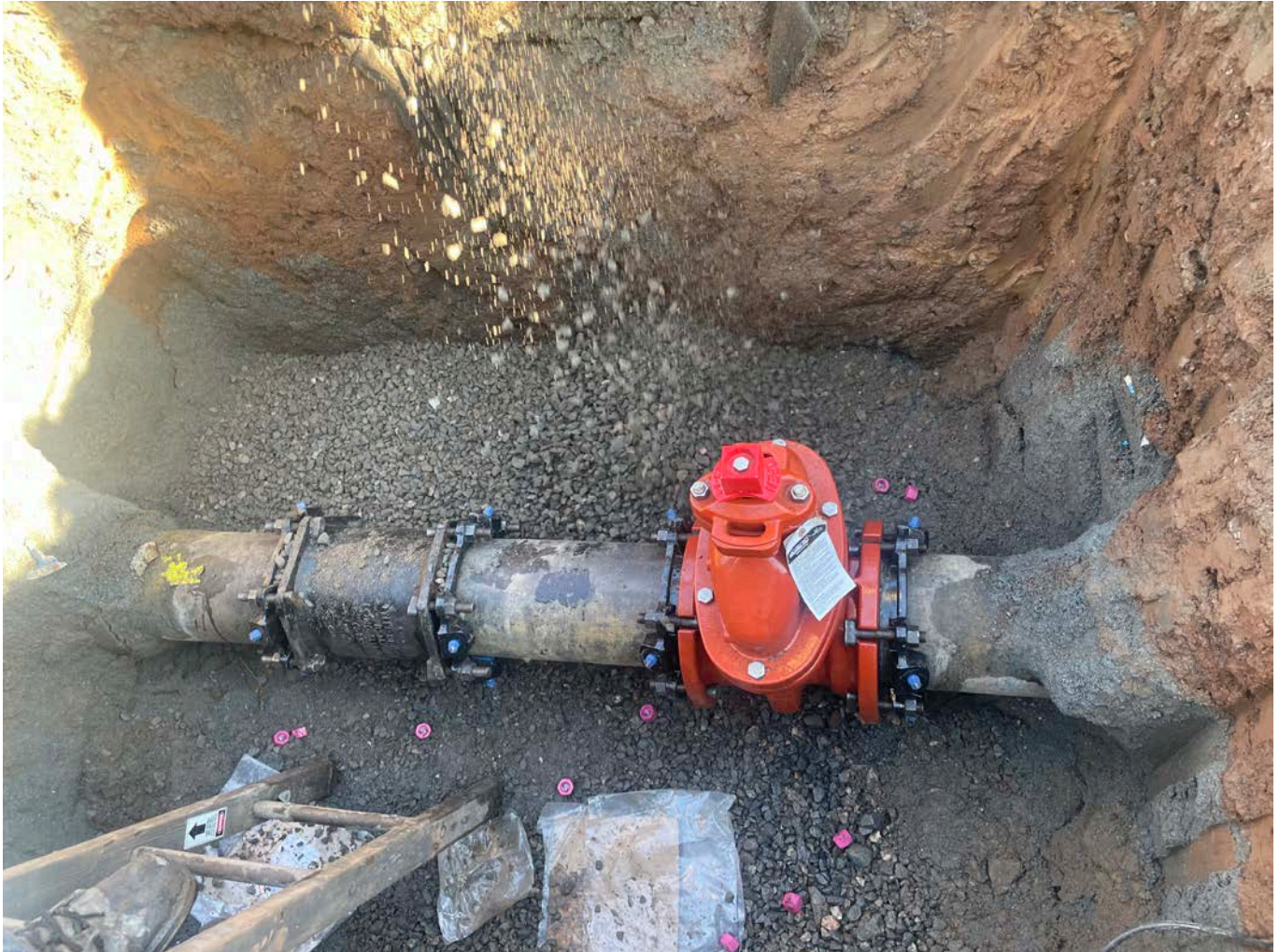
Picture 3: Ludlow placing additional ¾" stone under and on the sides of the 8" DIP gate valve they just installed on the north side of the Booster Station. View to the north.