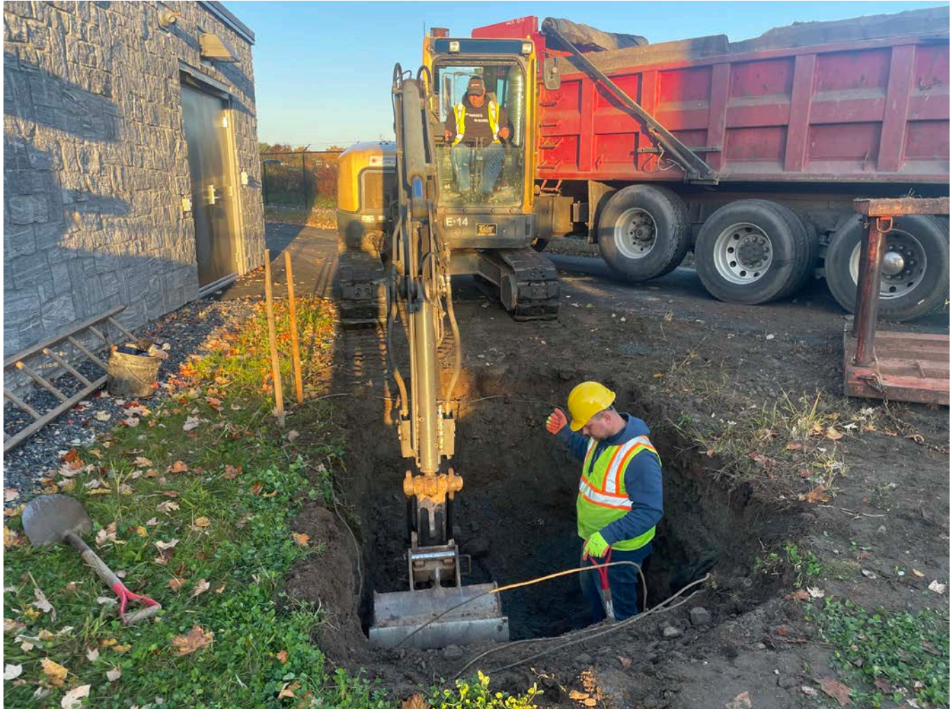
Picture 1: Ludlow excavating on the north side of the Booster Station located on S. Main Street, Middletown, as they work to install an 8" DIP gate valve. View to the west.