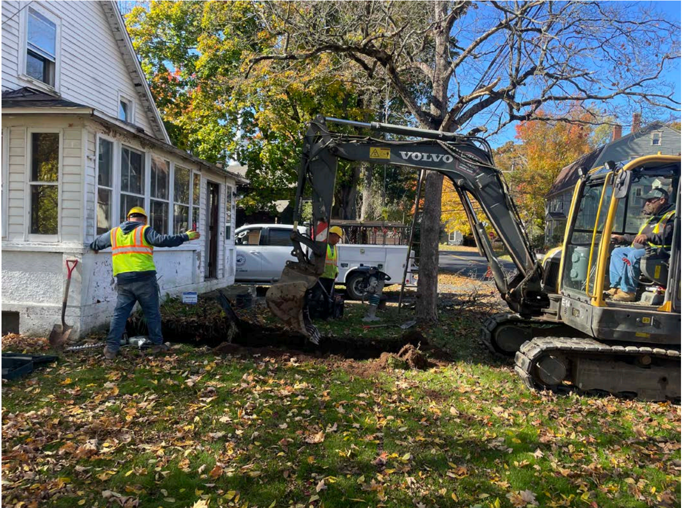
Picture 9: Ludlow excavating on the north side of the 11 Maiden Lane, Durham, residence as they prepare to run a 1" copper water service line from the curb stop to the interior of the residence's basement. View to the west.