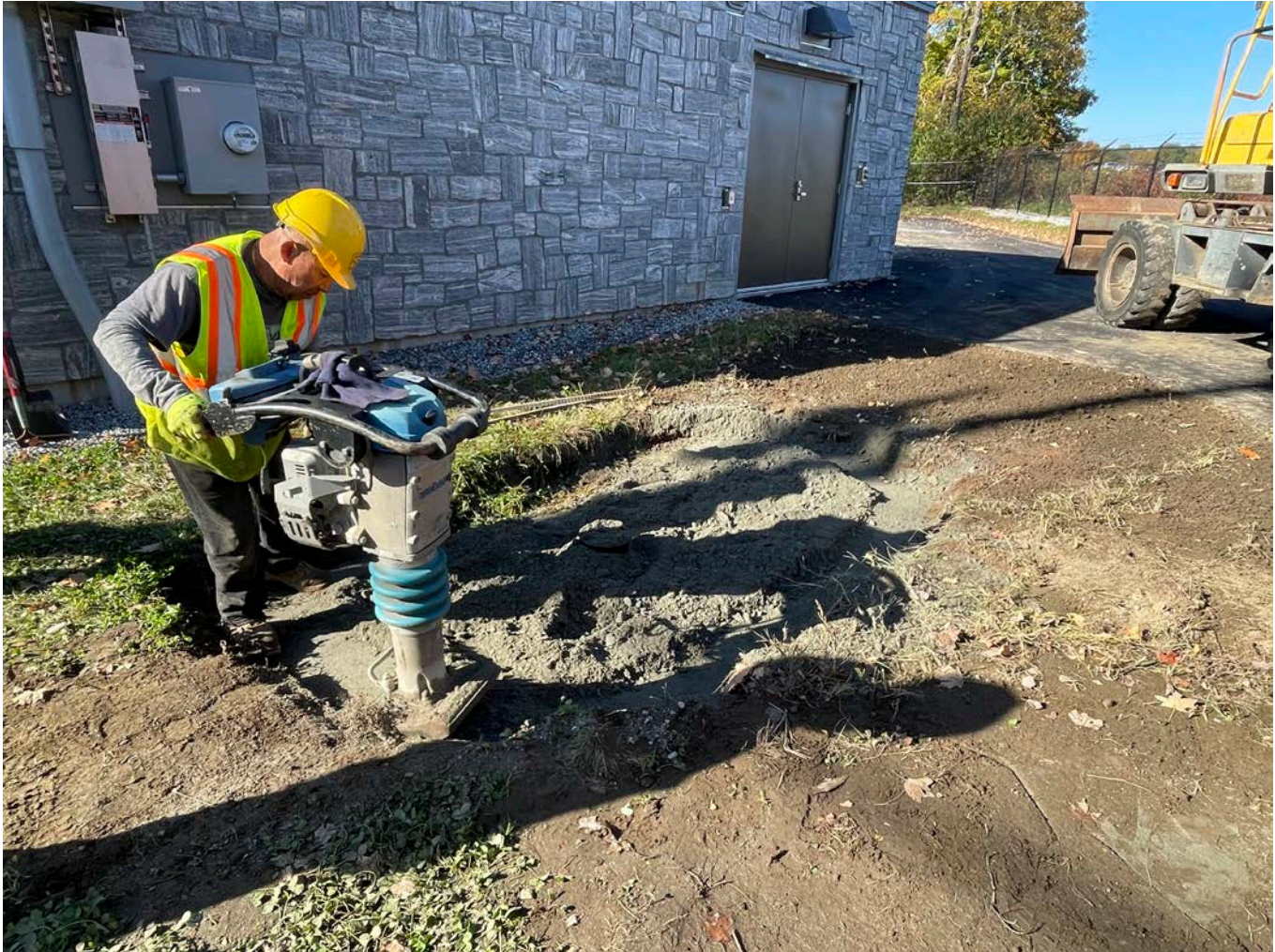
Picture 7: Ludlow using a jumping jack to compact 1.25" processed gravel that they backfilled around the 8" DIP gate valve that they just installed on the north side of the Booster Station. View to the southwest.

Project: Durham Meadows Pipeline Installation Date: October 21, 2022 Location: Maiden Lane and Main Street, Durham; S. Main Street, Middletown Day of Week: Friday Project #: AECOM: 6061487 Report No: 535 Contractor: Ludlow Construction Page: 10 of 17