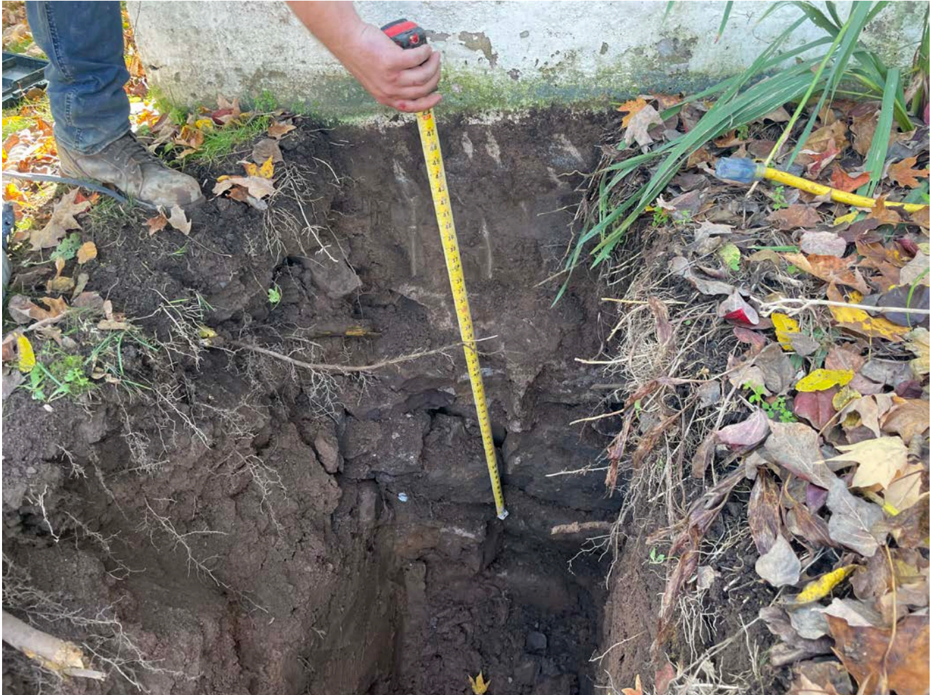
Picture 10: Ludlow measuring where they will penetrate the north side of the field stone foundation of the 11 Maiden Lane residence with a 1" copper water service line. View to the south.