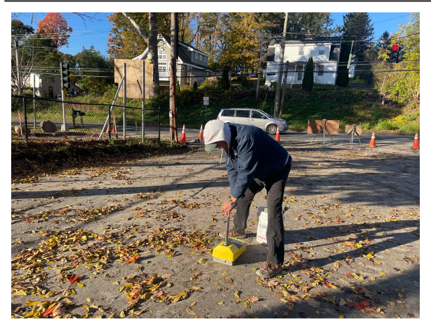
Picture 1: John Turner Consulting (JTC) on site performing compaction testing on the gravel base at Pickett Lane, Durham. View to the west.