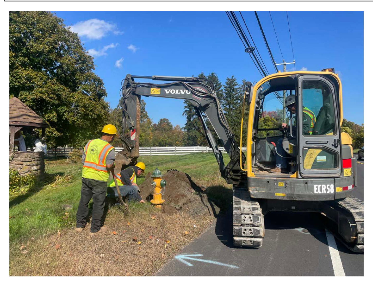
Picture 3: Ludlow realigning a hydrant located on the east side of the 2155 S. Main Street, Middletown. View to the north.