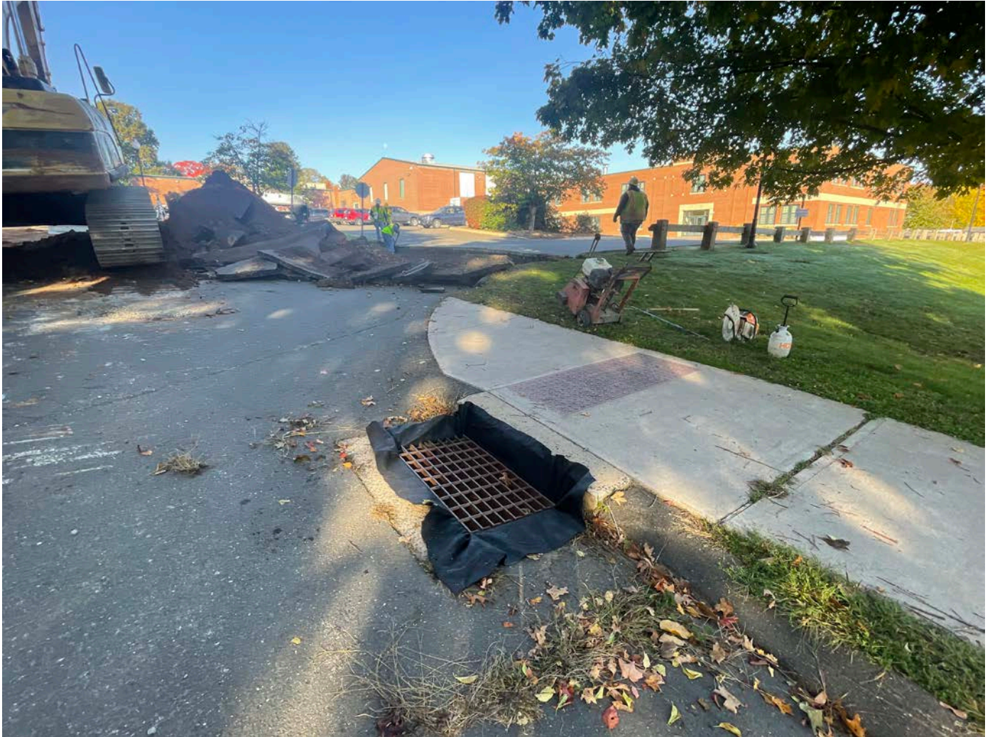
Picture 4: Catch basin located on the north side of Pickett Lane where Ludlow placed filter fabric beneath the grate. View to the northwest.