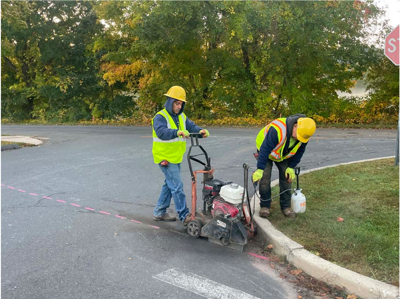
Picture 1: Ludlow saw-cutting pavement on the parking lot entrance located on the east side of the Frank Ward Strong School next to where it intersects with Pickett Lane. View to the southeast.