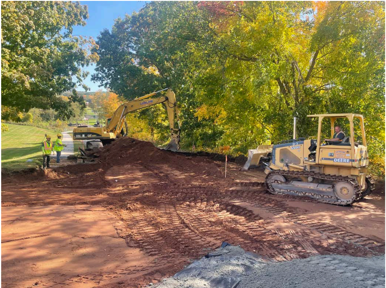
Picture 7: Ludlow removing road base material at the intersection of Pickett Lane and the parking lot entrance located on the east side of the Frank Ward Strong School. View to the southeast.

Res. Representative: J. Meunier Date: 10/12/22