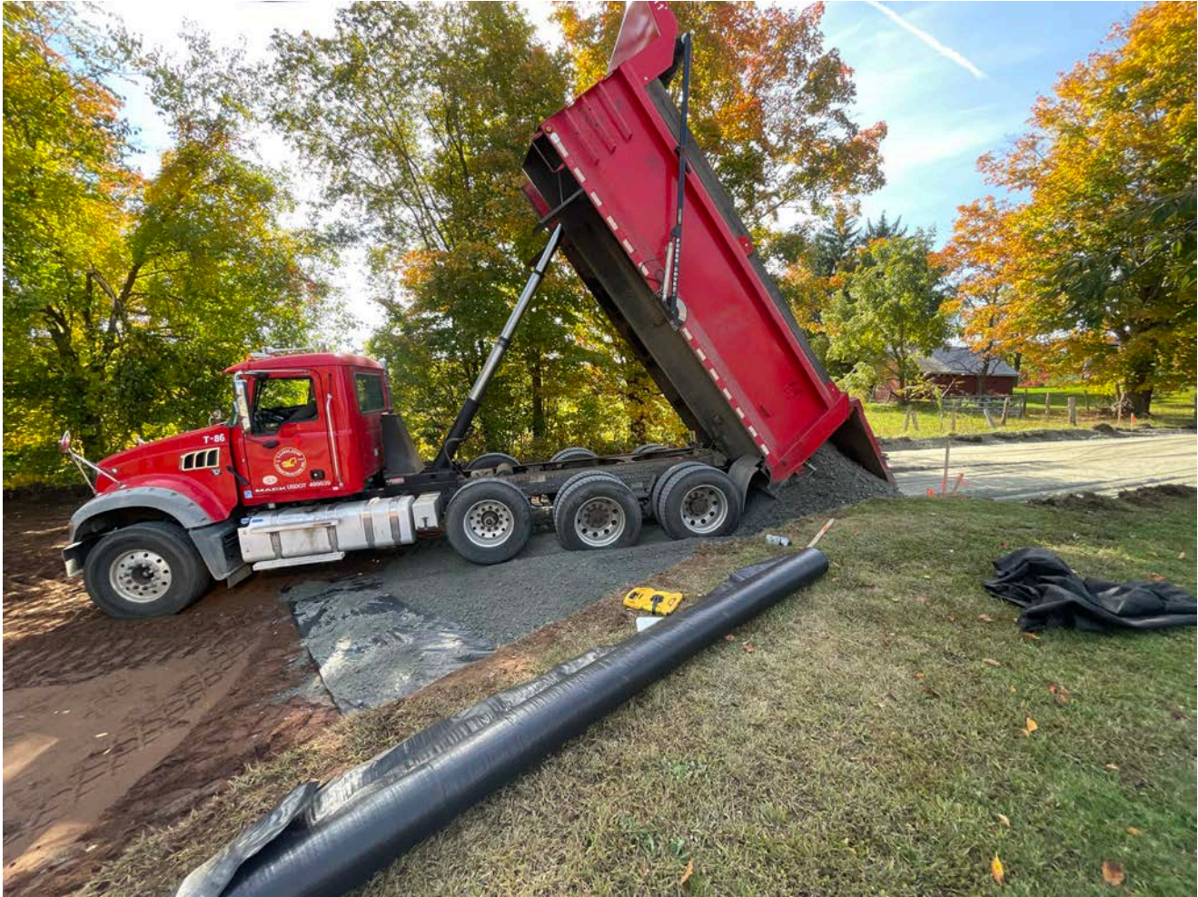
Picture 8: Ludlow dumping a load of 1.25" processed gravel at Station 15+00 on Pickett Lane. View to the southwest.