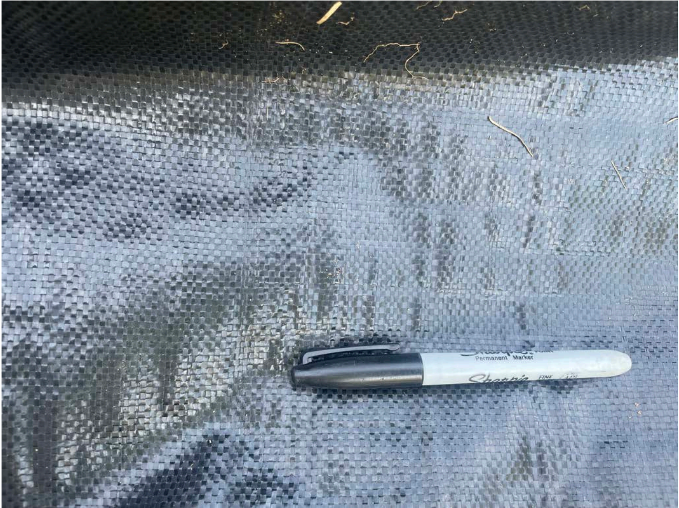
Picture 6: Closeup of the stabilizing fabric that Ludlow placed on the westbound lane of Pickett Lane from Stations 14+50 to 15+69.