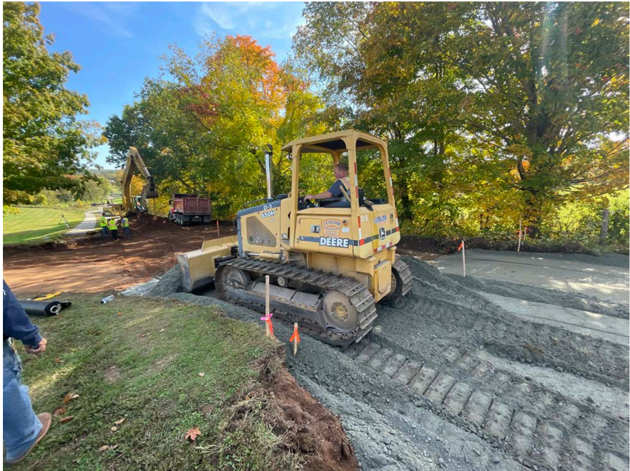
Picture 9: Ludlow grading 1.25" processed gravel at Station ~15+50. View to the southeast.