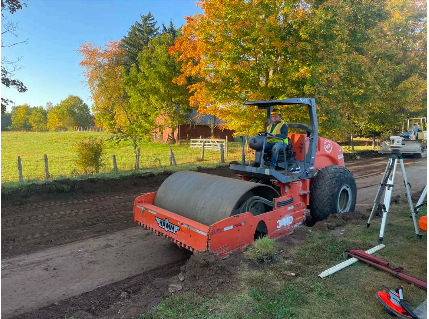
Picture 3: Ludlow compacting the material within the footprint of Pickett Lane with a Hamm 3410 soil compactor prior to placing 1.25" processed gravel. View to the southwest.