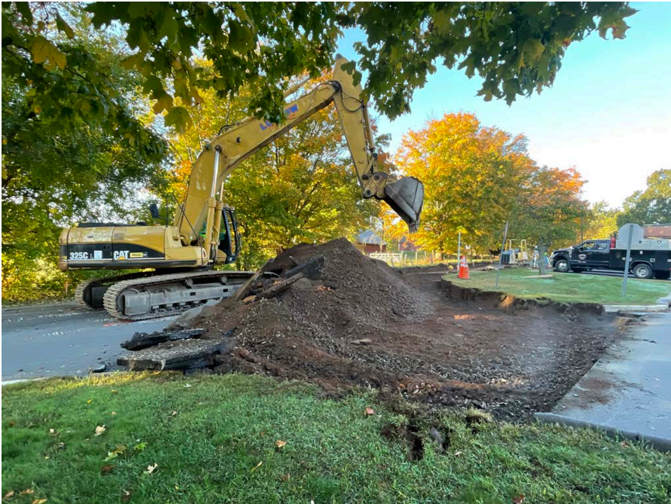
Picture 2: Ludlow excavating the existing road base on the parking lot entrance located on the east side of the Frank Ward Strong School next to where it intersects with Pickett Lane. View to the west.