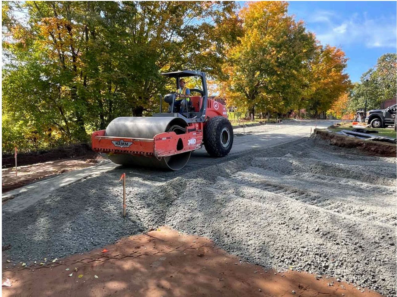
Picture 10: Ludlow compacting 1.25" processed gravel at Station ~15+25 on Pickett Lane. View to the southwest.