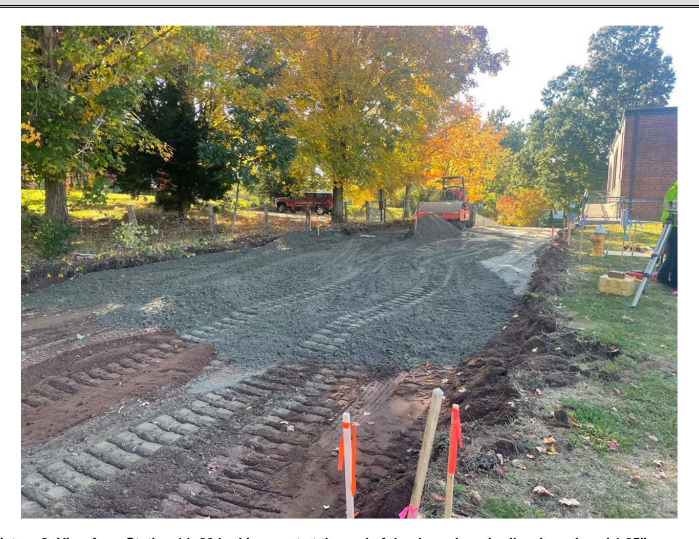
Picture 8: View from Station 14+00 looking west at the end of the day, where Ludlow has placed 1.25" processed gravel up to Station 13+90.