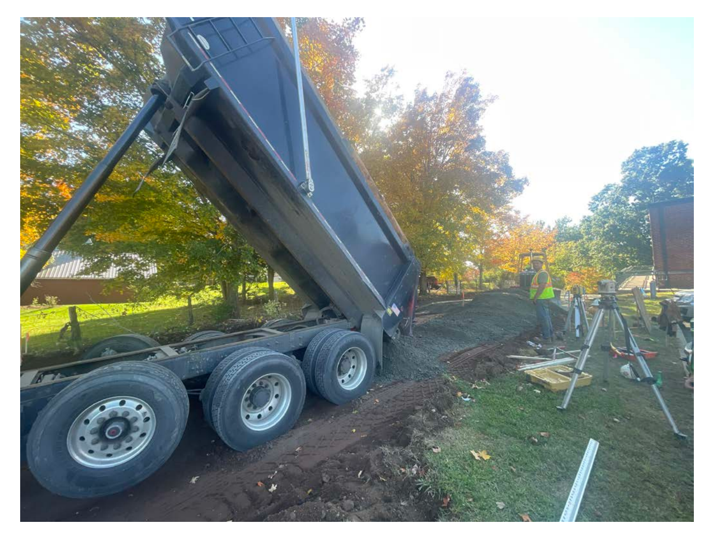
Picture 6: Ludlow placing 1.25" processed gravel on the footprint of Pickett Lane at Station ~14+50. View to the west.