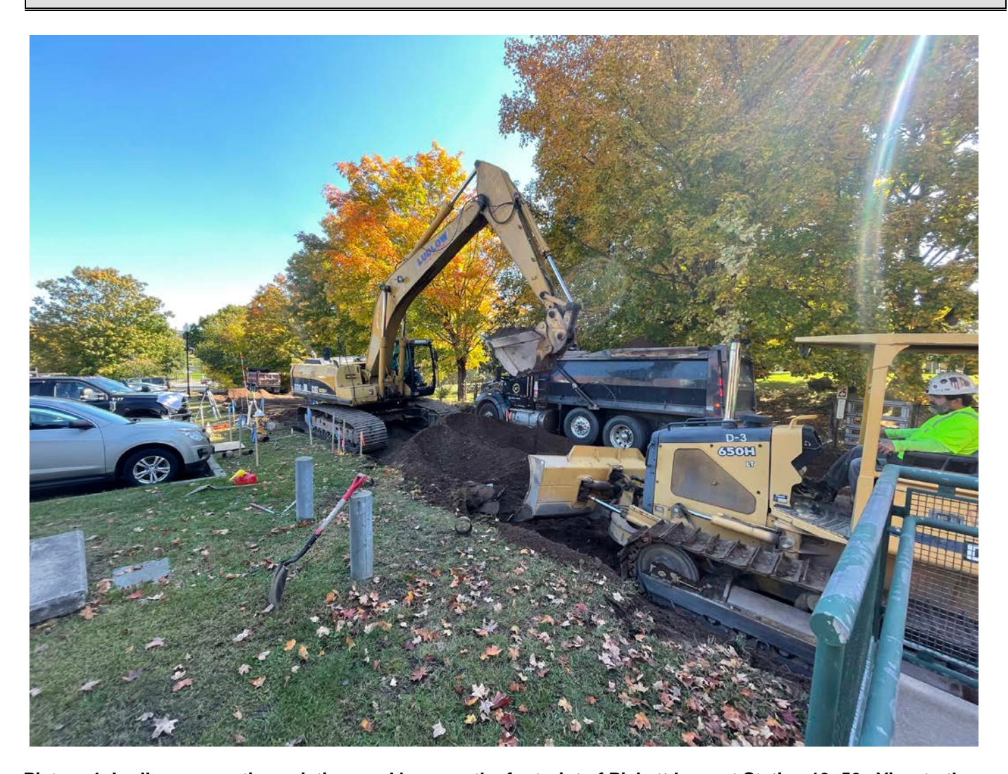
Picture 4: Ludlow excavating existing road base on the footprint of Pickett Lane at Station 13+50. View to the southeast.