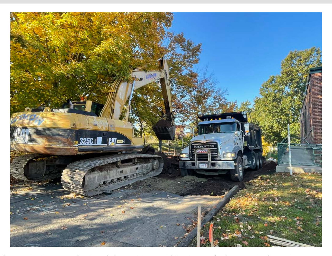
Picture 2: Ludlow excavating the existing road base on Pickett Lane at Station ~13+15. View to the west.