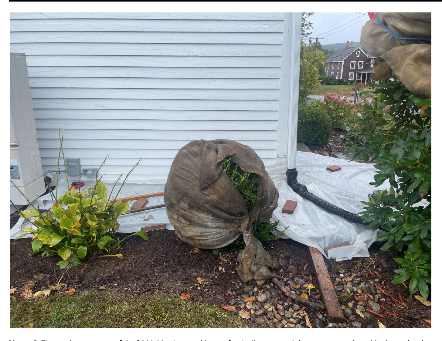
Picture 5: The southwest corner of the 24 Maiden Lane residence after Ludlow covered the open excavation with plywood and poly sheeting. View to the east

Contractor: Ludlow Construction Page: 7 of 7