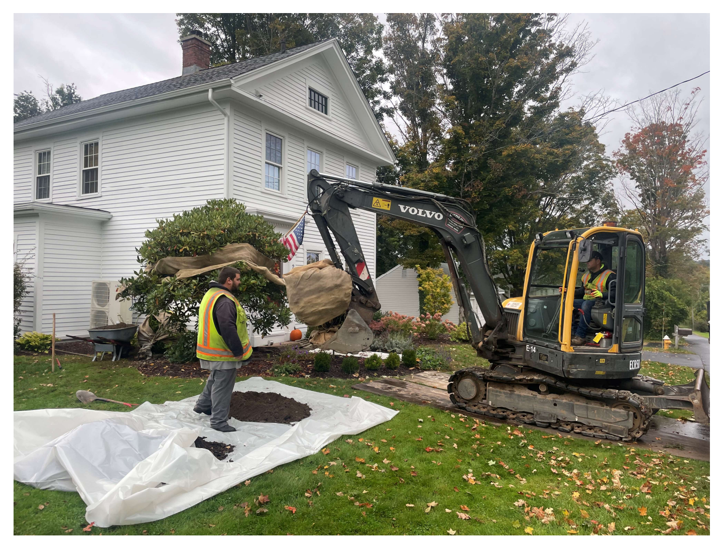
Picture 2: Ludlow moving a shrub from the 24 Maiden Lane property as they prepare to daylight the southwest corner of the home's foundation. View to the northeast.

Contractor: Ludlow Construction Page: 4 of 7