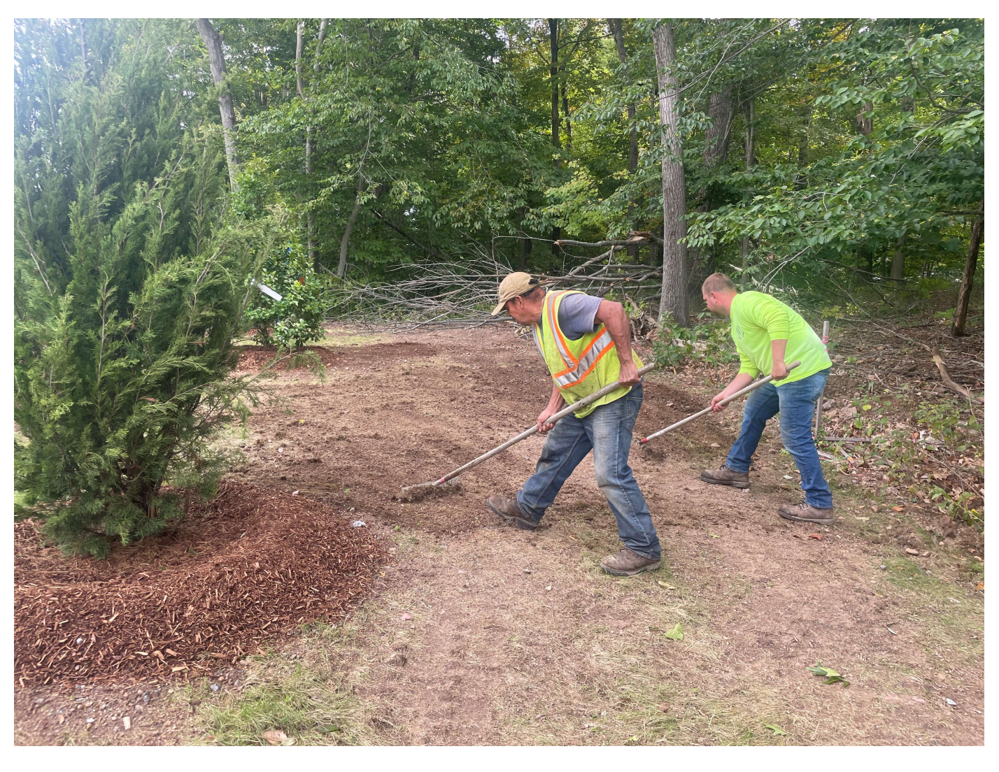
Picture 4: Ludlow raking grass seed into the ground around the trees that were recently planted on the south side of the water tank located east of the Shared Access Road in Middletown. View to the east

Contractor: Ludlow Construction Page: 7 of 11