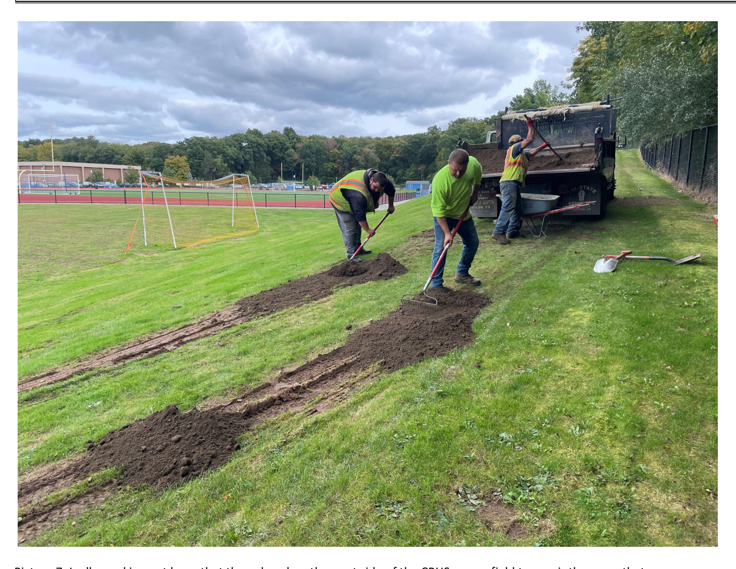
Picture 7: Ludlow raking out loam that they placed on the west side of the CRHS soccer field to repair the areas that were damaged when Grela Drilling decommissioned a well. View to the east.

Contractor: Ludlow Construction Page: 10 of 11