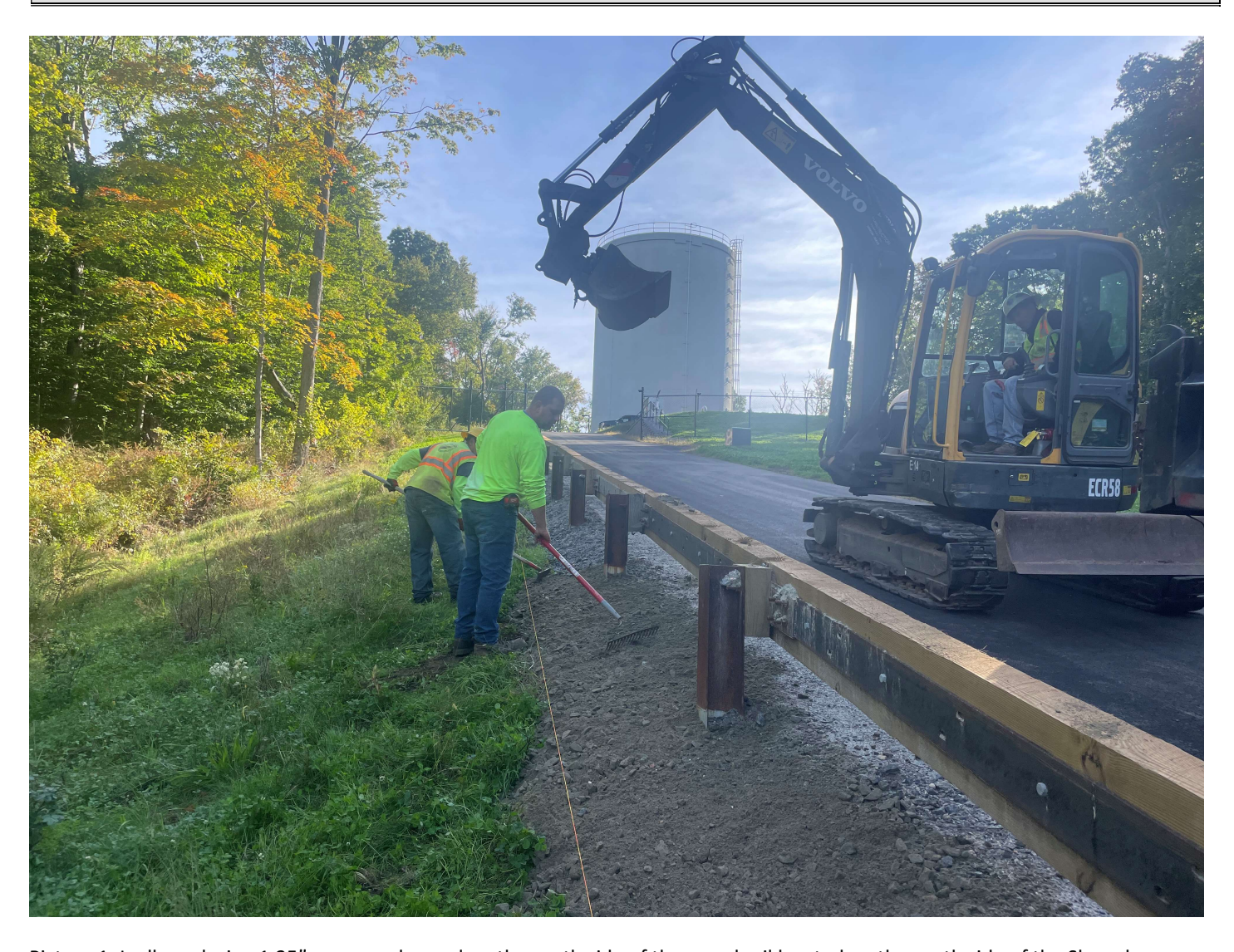
Picture 1: Ludlow placing 1.25" processed gravel on the north side of the guard rail located on the north side of the Shared Access Road in Middletown. View to the east.

Contractor: Ludlow Construction Page: 4 of 11