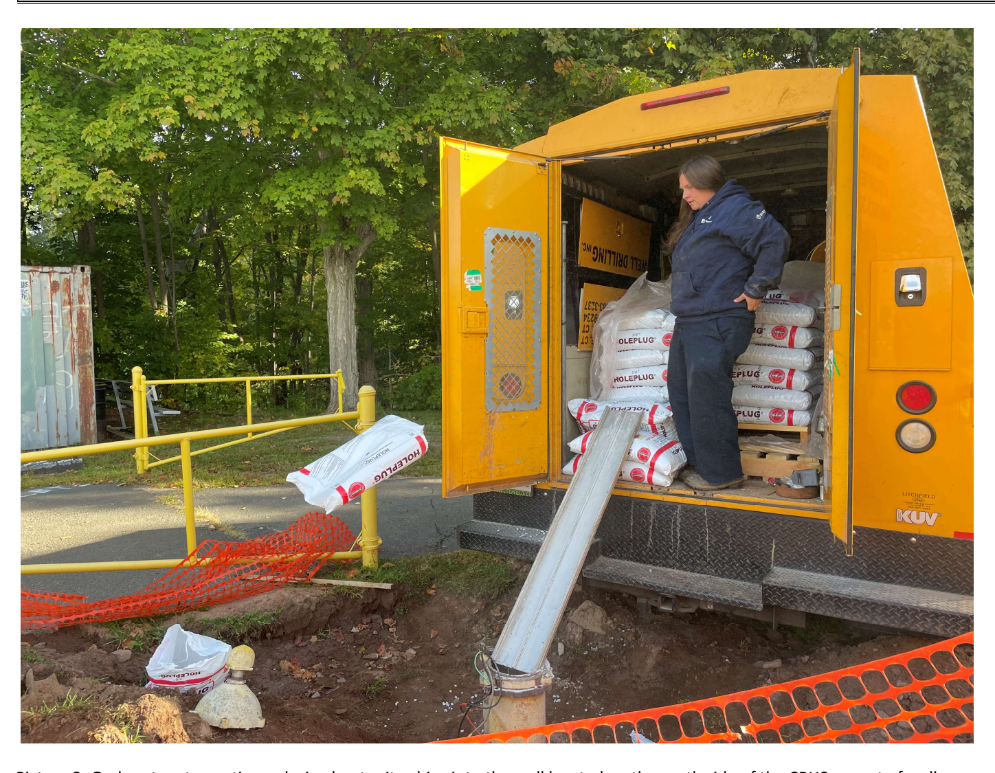
Picture 2: Grela set up to continue placing bentonite chips into the well located on the north side of the CRHS as part of well decommissioning activities. View to the northeast.

Contractor: Ludlow Construction Page: 5 of 11