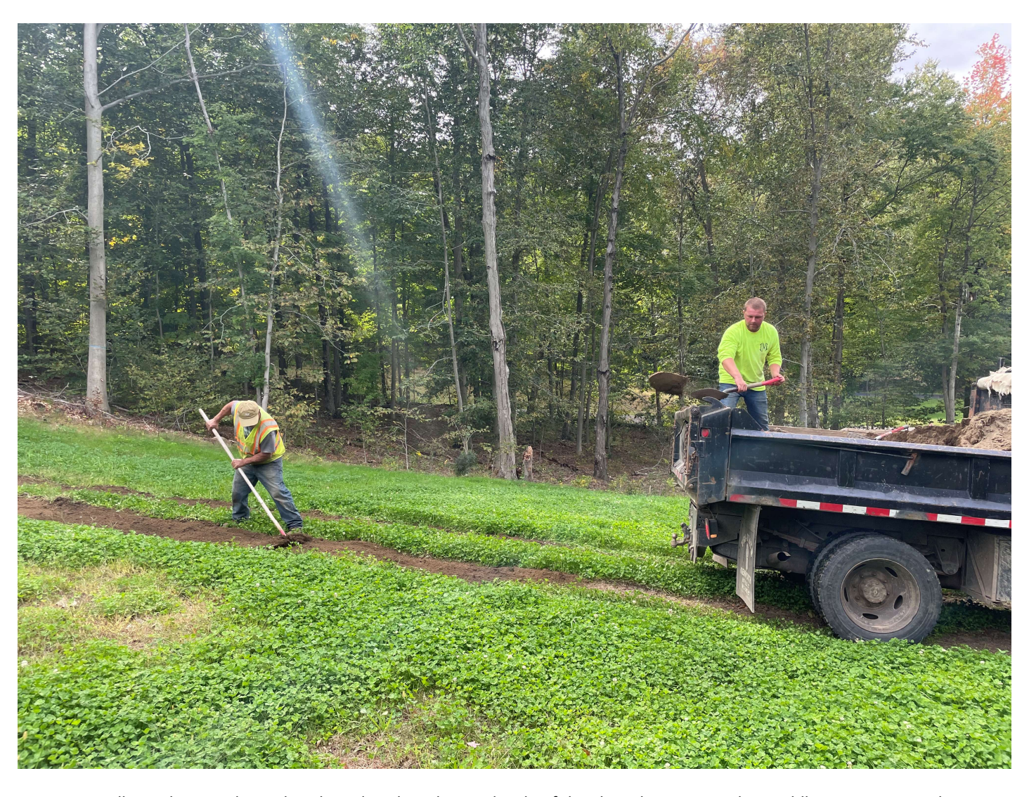
Picture 6: Ludlow raking out loam that they placed on the south side of the Shared Access Road in Middletown to repair the areas that were damaged when Jays Landscaping planted trees on the south side of the water tank. View to the south.

Contractor: Ludlow Construction Page: 9 of 11