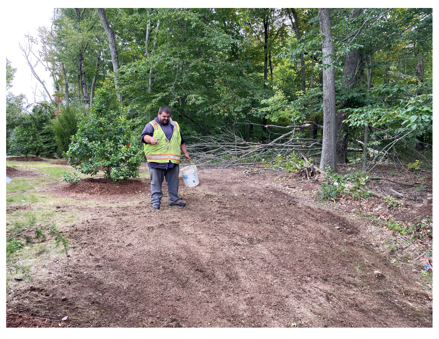
Picture 5: Ludlow spreading grass seed around the trees that were recently planted on the south side of the water tank located east of the Shared Access Road in Middletown. View to the east

Contractor: Ludlow Construction Page: 8 of 11