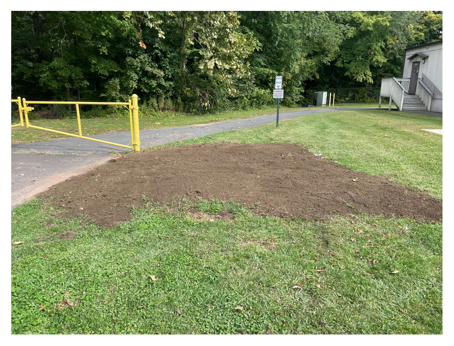
Picture 8: The area located on the north side of the CRHS after Ludlow placed loam and grass seed after Grela decommissioned a well. View to the east.