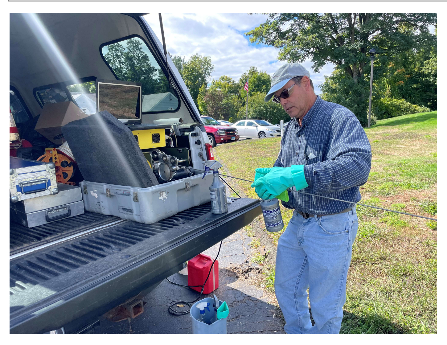
Picture 7: Geophysical Applications decontaminating the cable used to lower probes into the well located at the Hill Hollow condominium complex in Durham.

Contractor: Ludlow Construction Page: 9 of 9