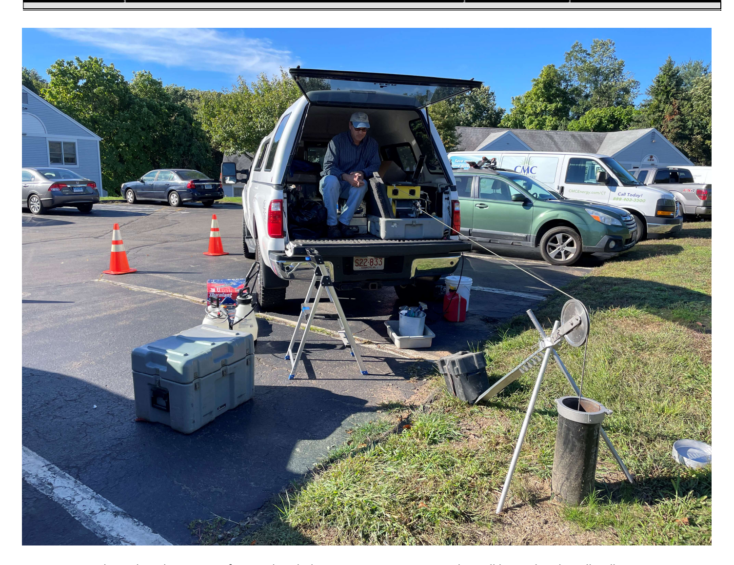
Picture 3: Geophysical Applications performing borehole assessment activities on the well located at the Hill Hollow condominium complex in Durham. View to the southwest.