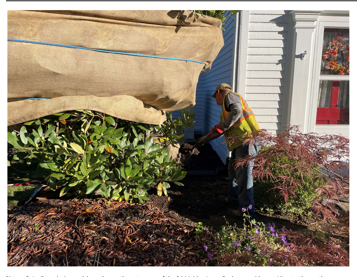
Picture 2: Ludlow placing mulch on the southwest corner of the 24 Maiden Lane, Durham, residence. View to the north.