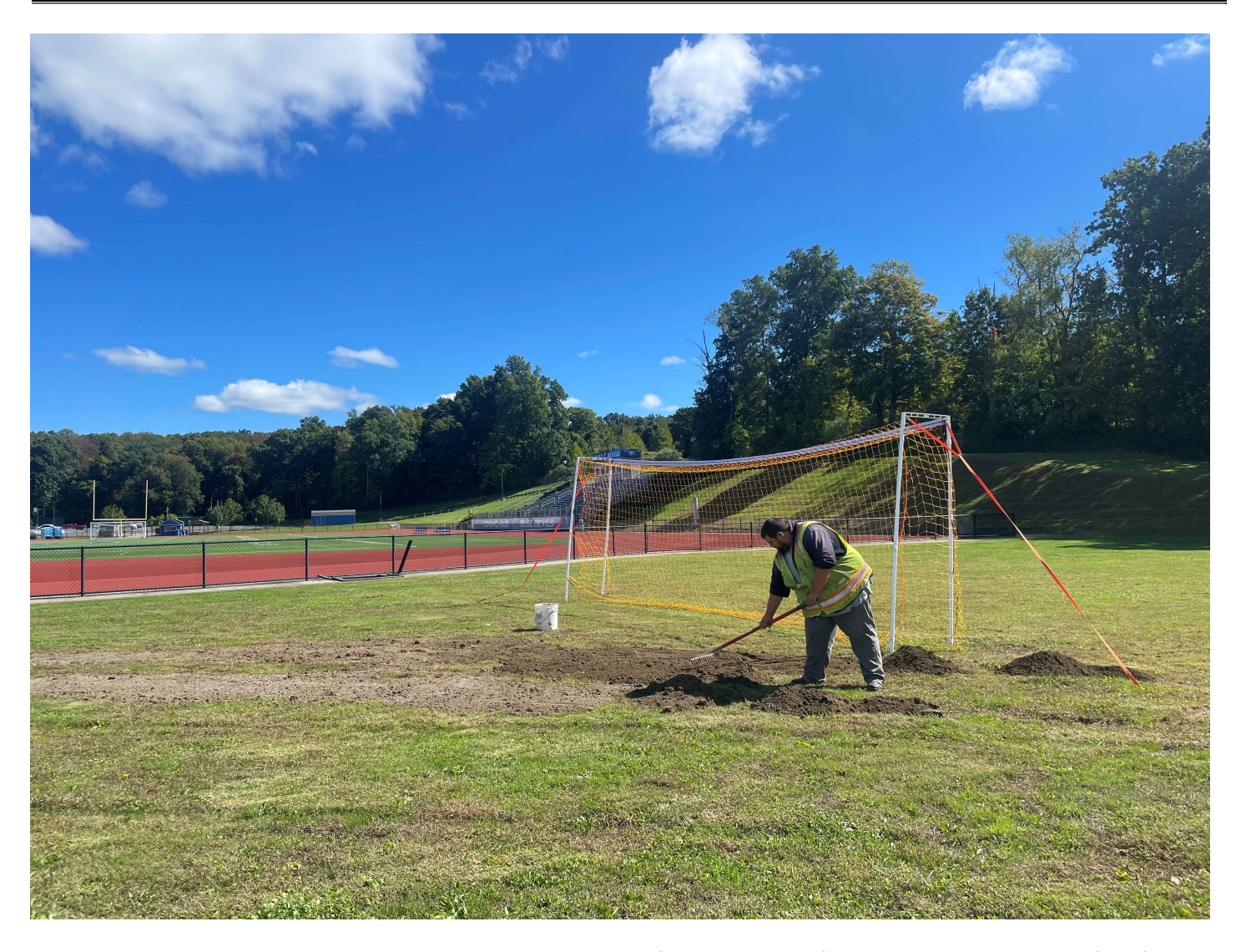
Picture 6: Ludlow raking out loam that they placed on the west side of the CRHS soccer field to repair those sections of the field that were disturbed during the decommissioning of a well by Grela. View to the southeast.