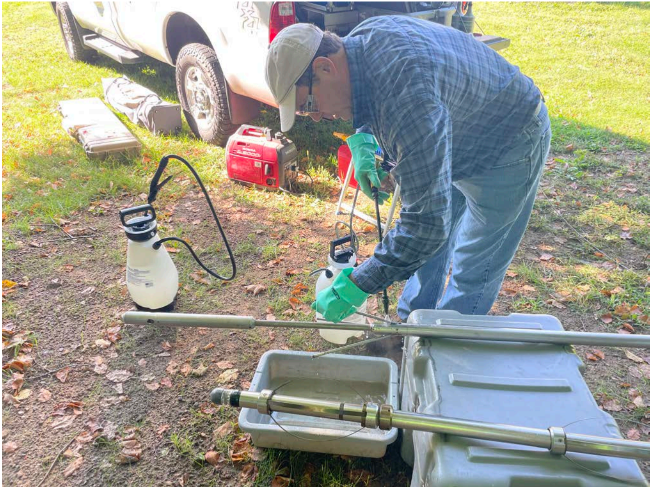
Picture 4: Geophysical Applications decontaminating one of the probes used during borehole assessment activities on the well located on the north side of the 10 Johns Way property.