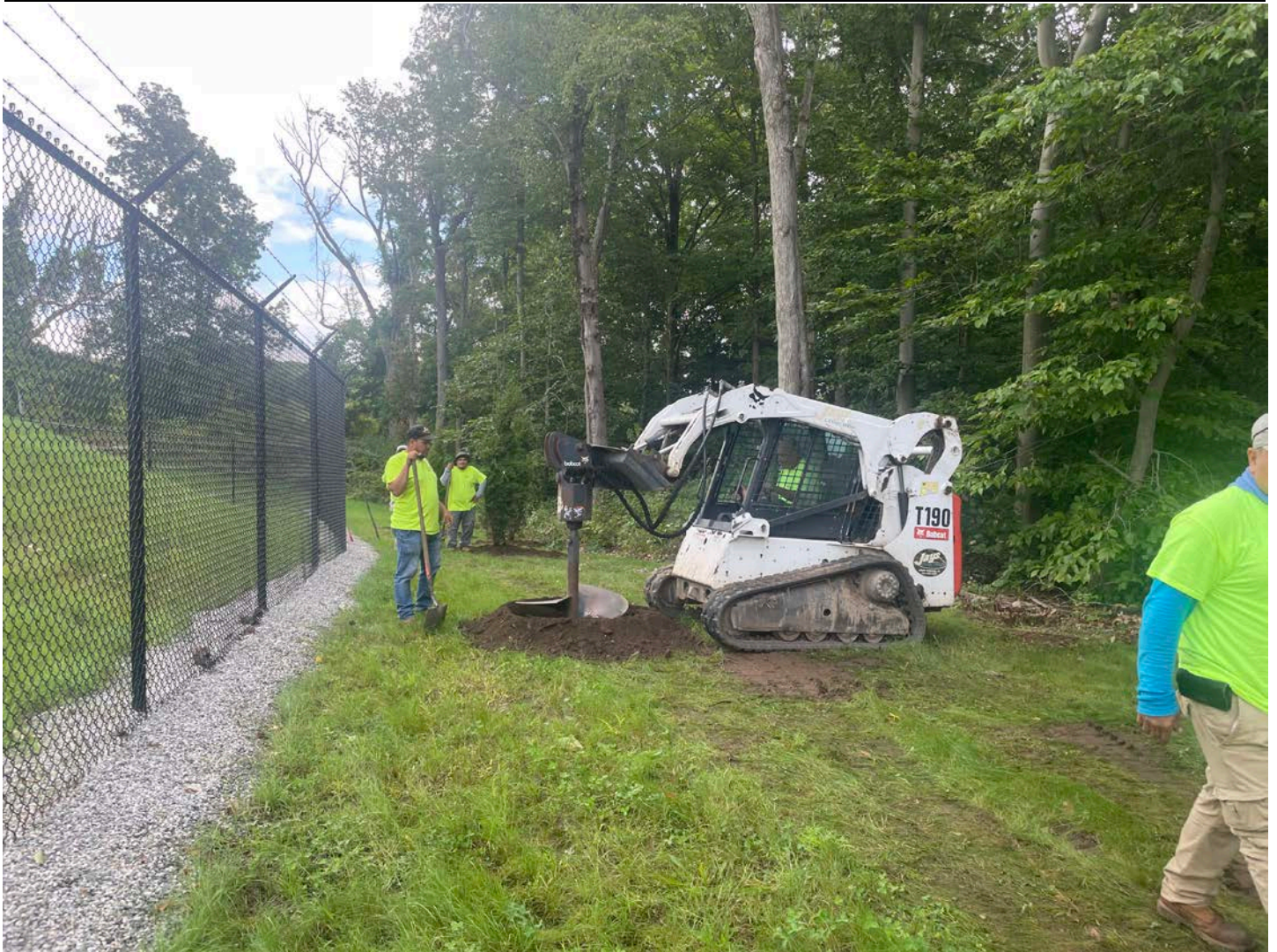
Picture 8: Jays Landscaping auguring a hole as they prepare to plant one of the 19 trees scheduled to be placed on the south side of the water tank located to the east of the Shared Access Driveway in Middletown. View to the east.