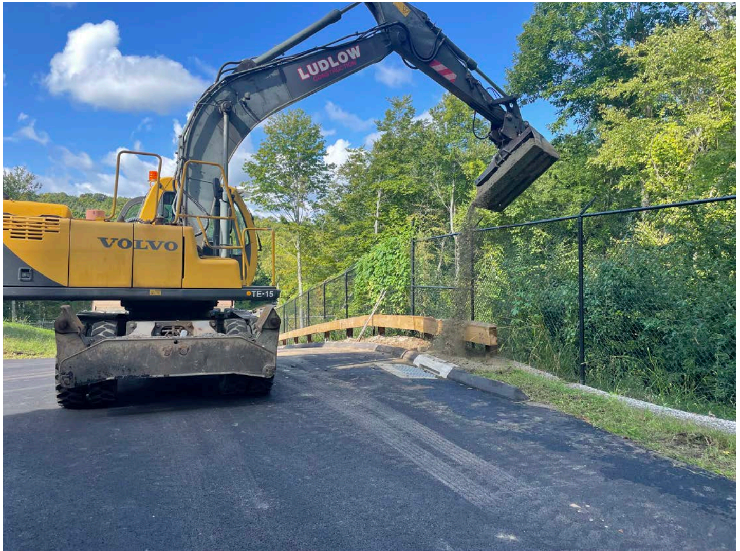
Picture 5: Ludlow placing 1.25” processed gravel along the toe of the guardrail located on the north side of the Shared Access Driveway. View to the west.