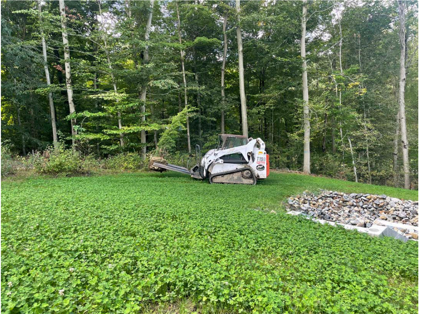
Picture 6: Jays Landscaping moving a juniper to the south side of the water tank to be planted. View to the west.