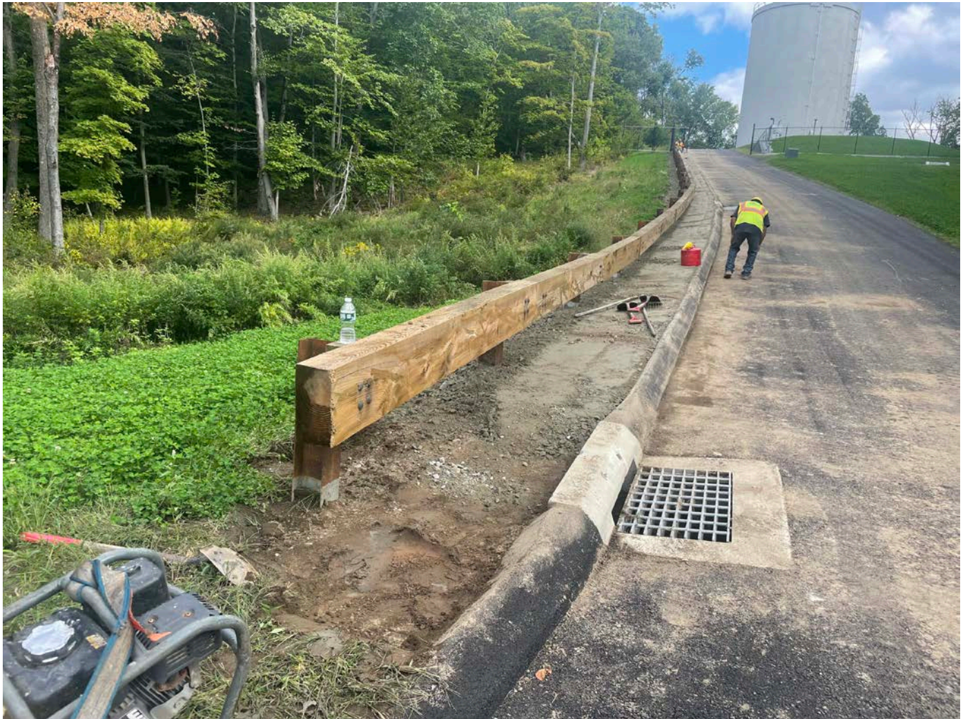
Picture 7: The guardrail located on the north side of the Shared Access Driveway where Ludlow has placed 1.25" processed gravel. View to the northeast.

Project: Durham Meadows Pipeline Installation Date: September 20, 2022 Location: Main Street, Durham; Shared Access Driveway, Main Street, Middletown Day of Week: Tuesday Project #: AECOM: 6061487 Report No: 513 Contractor: Ludlow Construction Page: 10 of 12