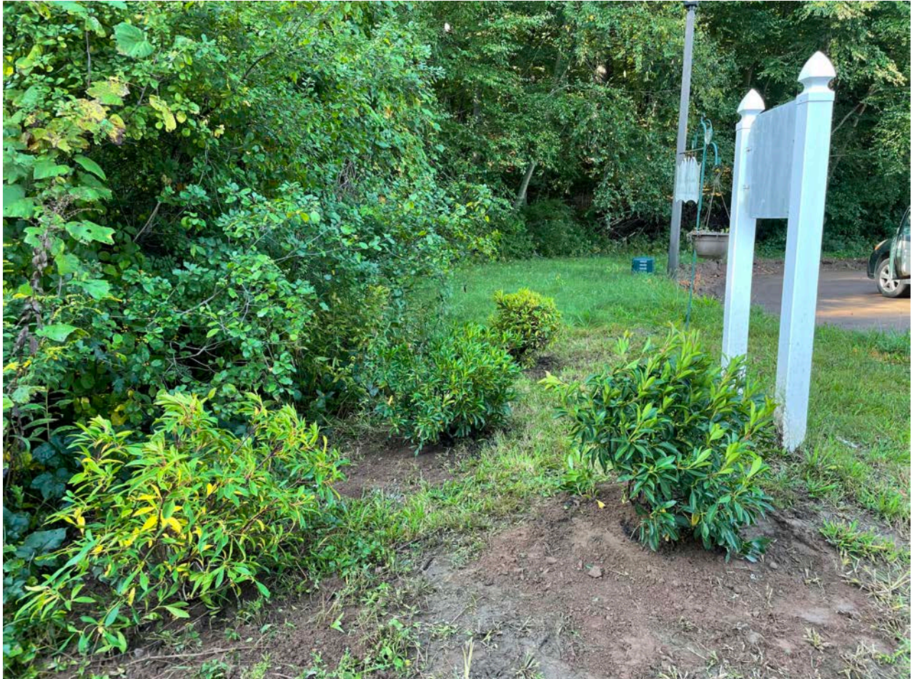
Picture 3: Four of the seven mountain laurels that Jays Landscaping planted on either side of the Shared Access Driveway where it connects to the cul de sac located on the east side of Talcott Ridge Drive in Middletown. View to the south.