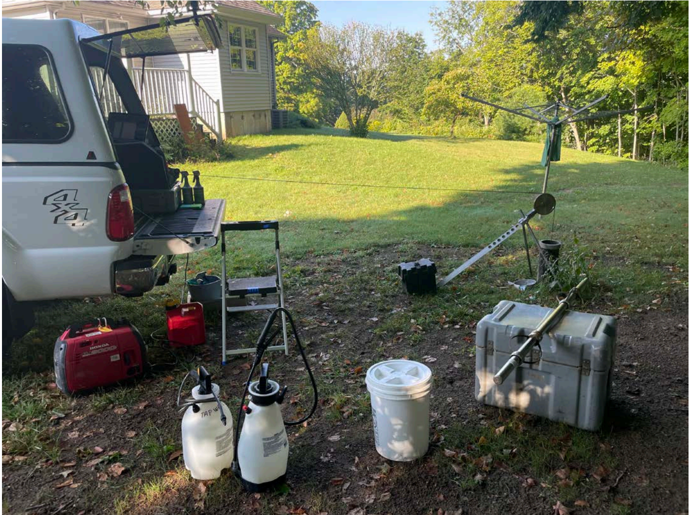
Picture 2: Geophysical Applications set up to perform borehole assessment activities on the well located on the north side of the 10 Johns Way, Durham, residence. View to the west.