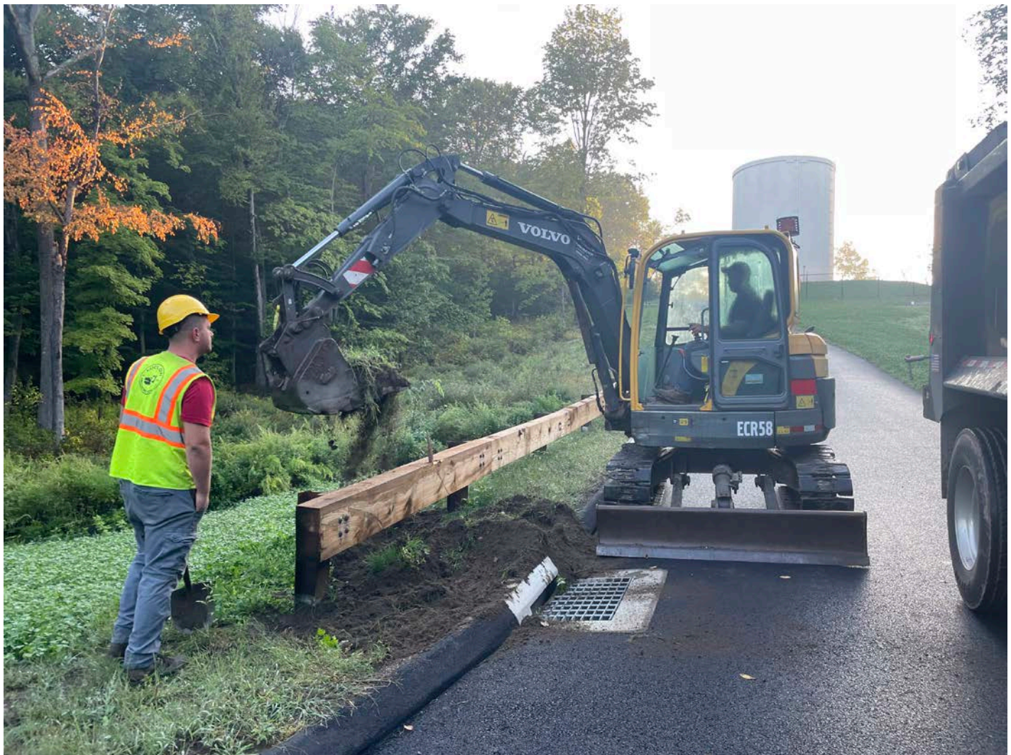
Picture 1: Ludlow excavating soil from around the supports of the guard rail located on the north side of the Shared Access Driveway in Middletown. View to the east.