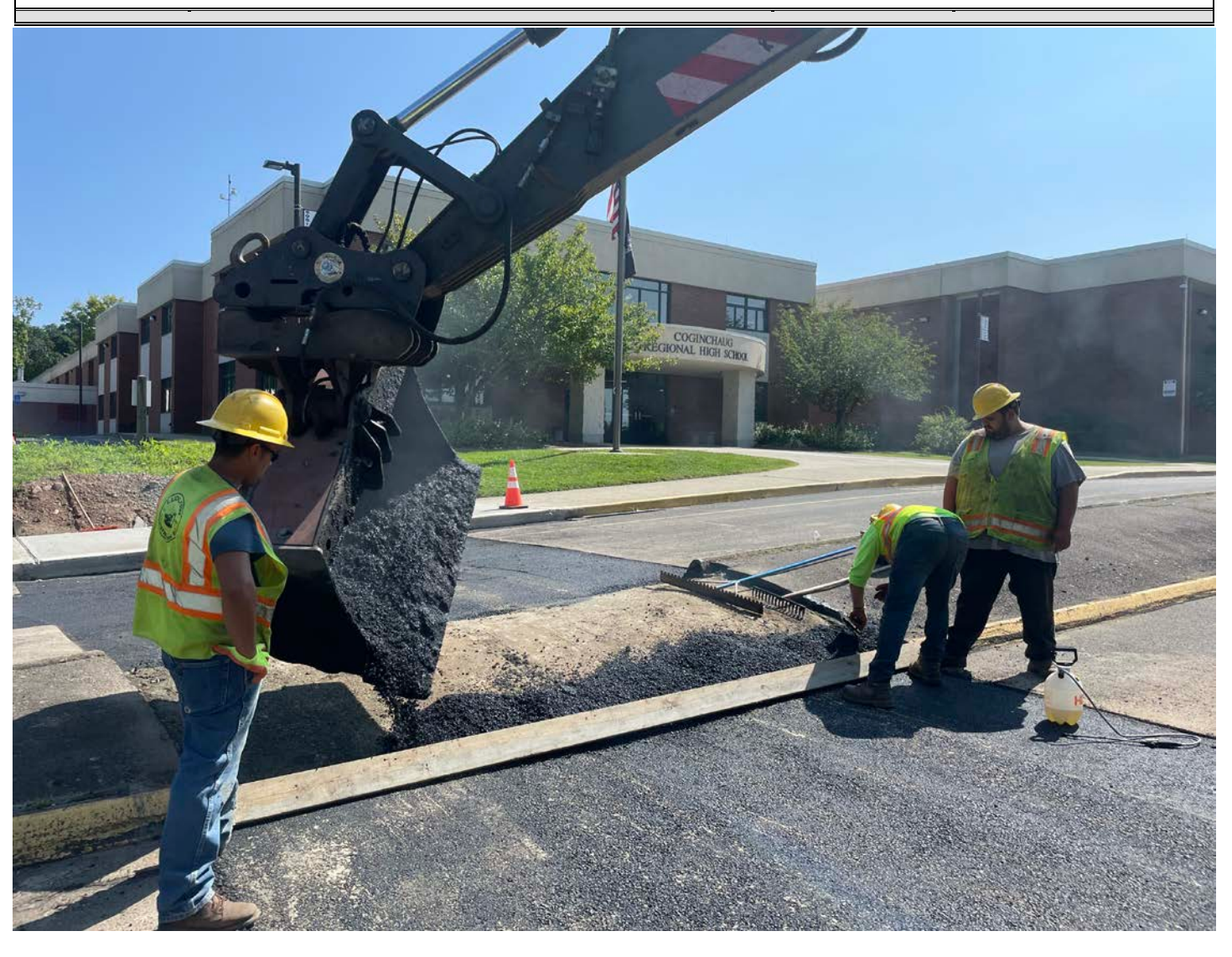
Picture 8: Ludlow placing asphalt on the median strip located between the two lanes of the access road located on the west side of the CRHS. View to the southeast.

Contractor: Ludlow Construction Page: 11 of 15