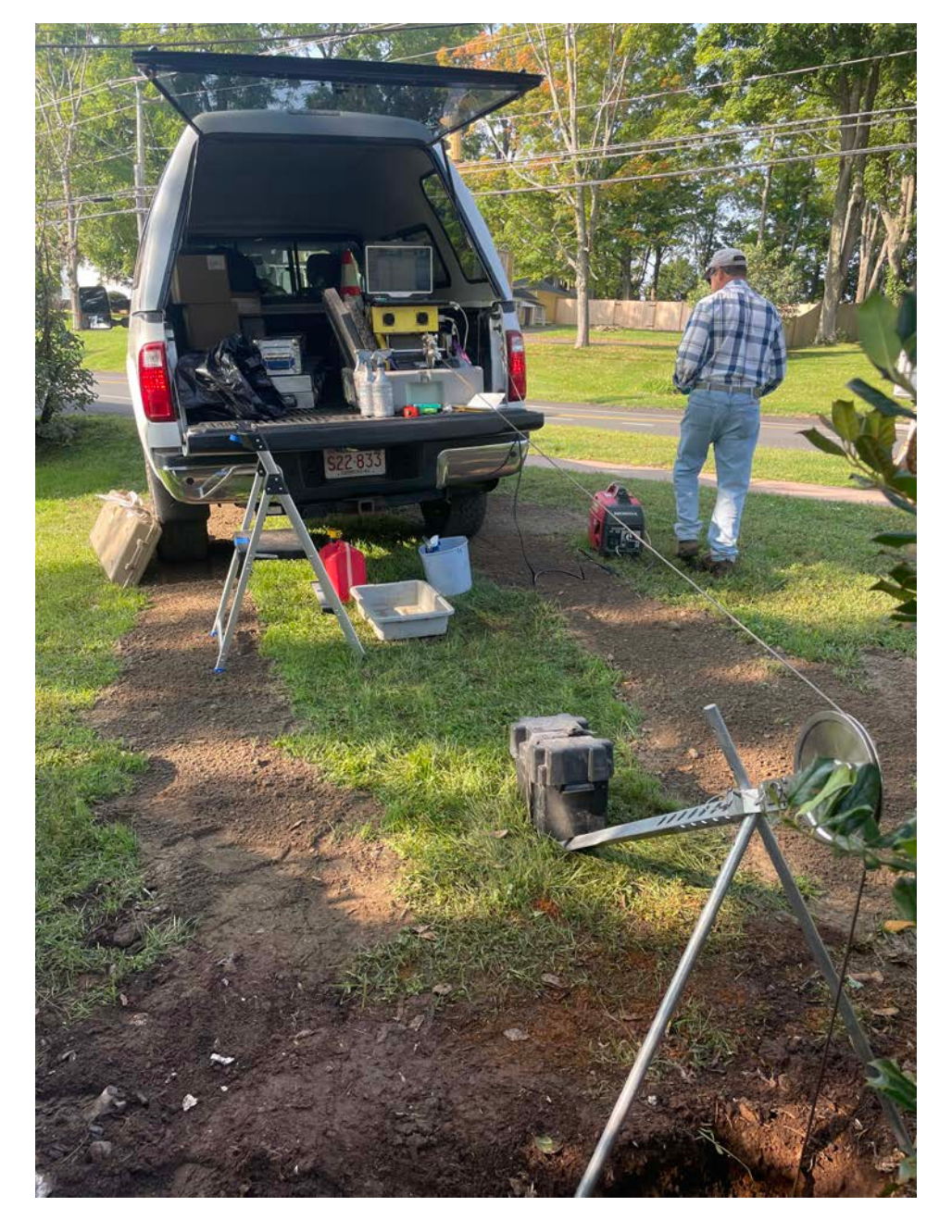
Picture 3: Geophysical Applications performing borehole assessment activities on the DMC-2 well that is located on the west side of the 201-203 Main Street, Durham, property. View to the southwest.