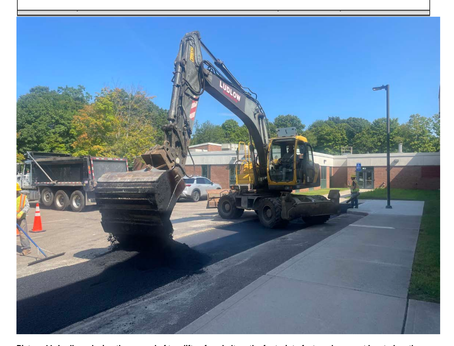
Picture 11: Ludlow placing the second of two lifts of asphalt on the footprint of a trench overcut located on the north side of the CRHS. View to the northeast.