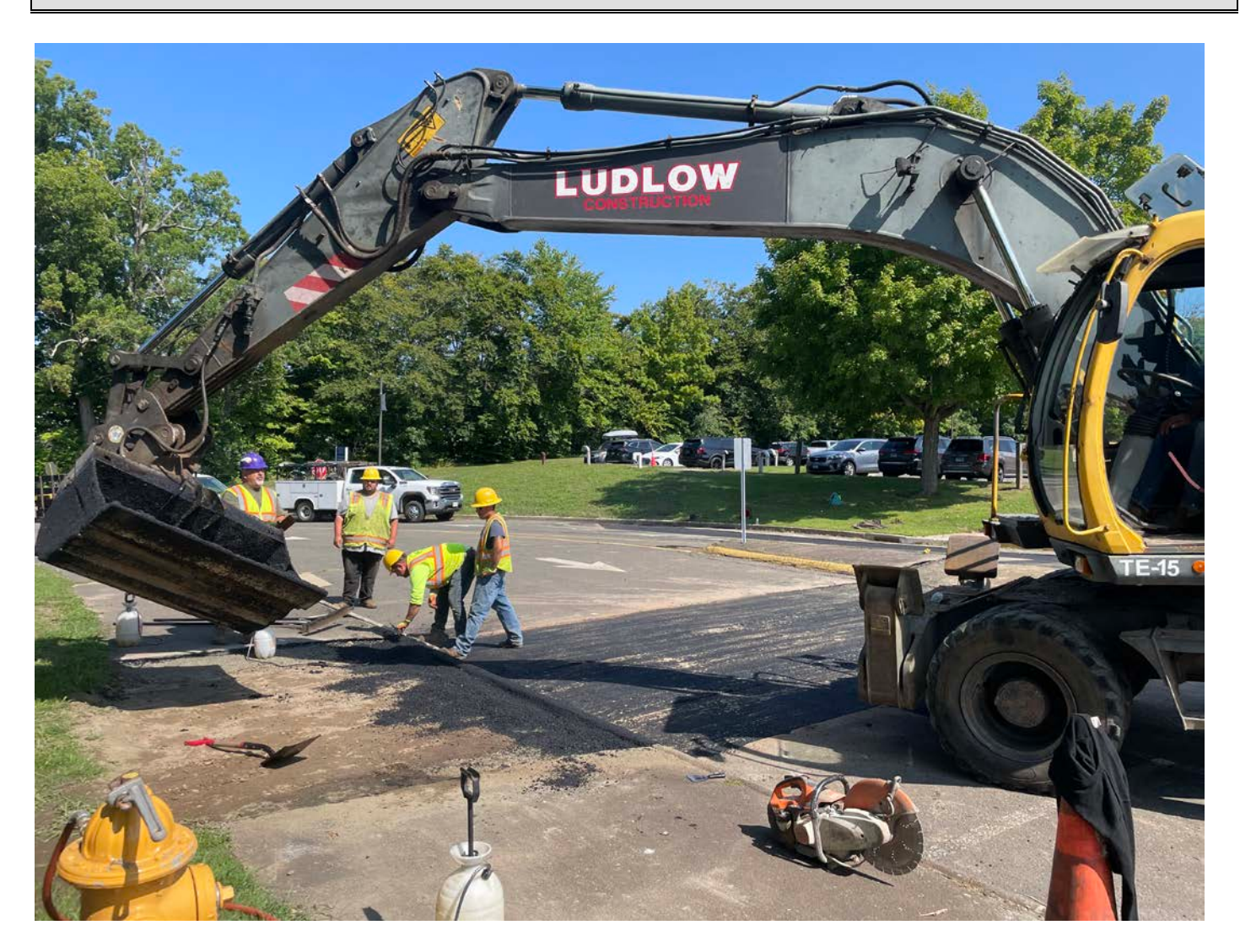
Picture 7: Ludlow placing asphalt on the west side of the access road located on the west side of the CHHS. View to the northeast.