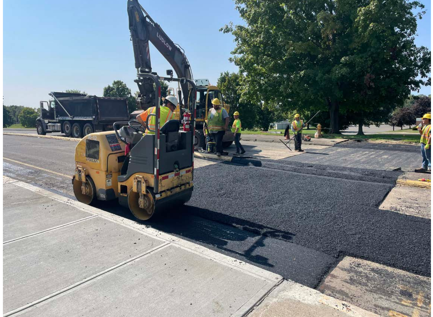
Picture 10: Ludlow placing the second of two lifts of asphalt on the footprint of a trench overcut located on the west side of the CRHS. View to the southwest.