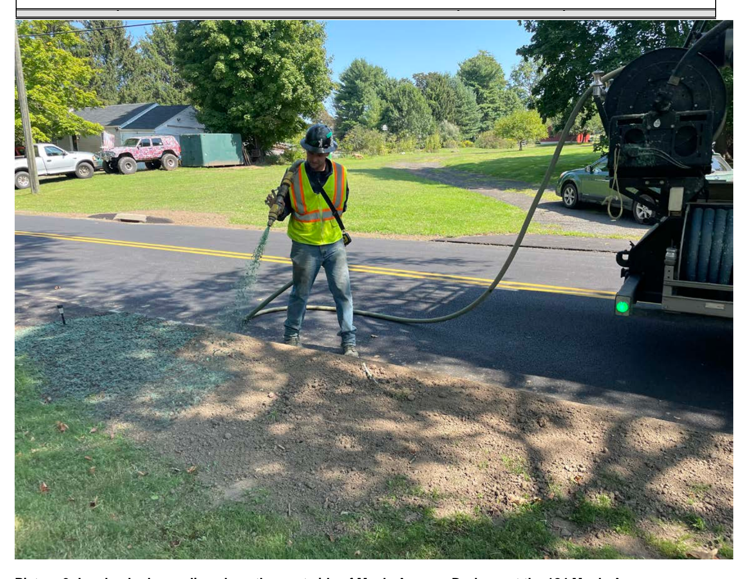
Picture 9: Laydon hydroseeding along the west side of Maple Avenue, Durham, at the 184 Maple Avenue property. View to the northeast.

Contractor: Ludlow Construction Page: 12 of 15