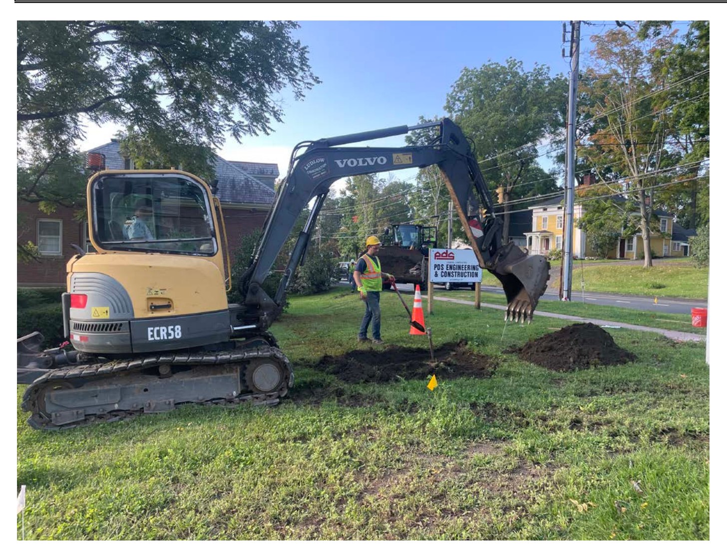
Picture 2: Ludlow excavating around a blowoff valve located on the west side of the 201 Main Street, property as they plan to cut it below surface grade. View to the southwest.