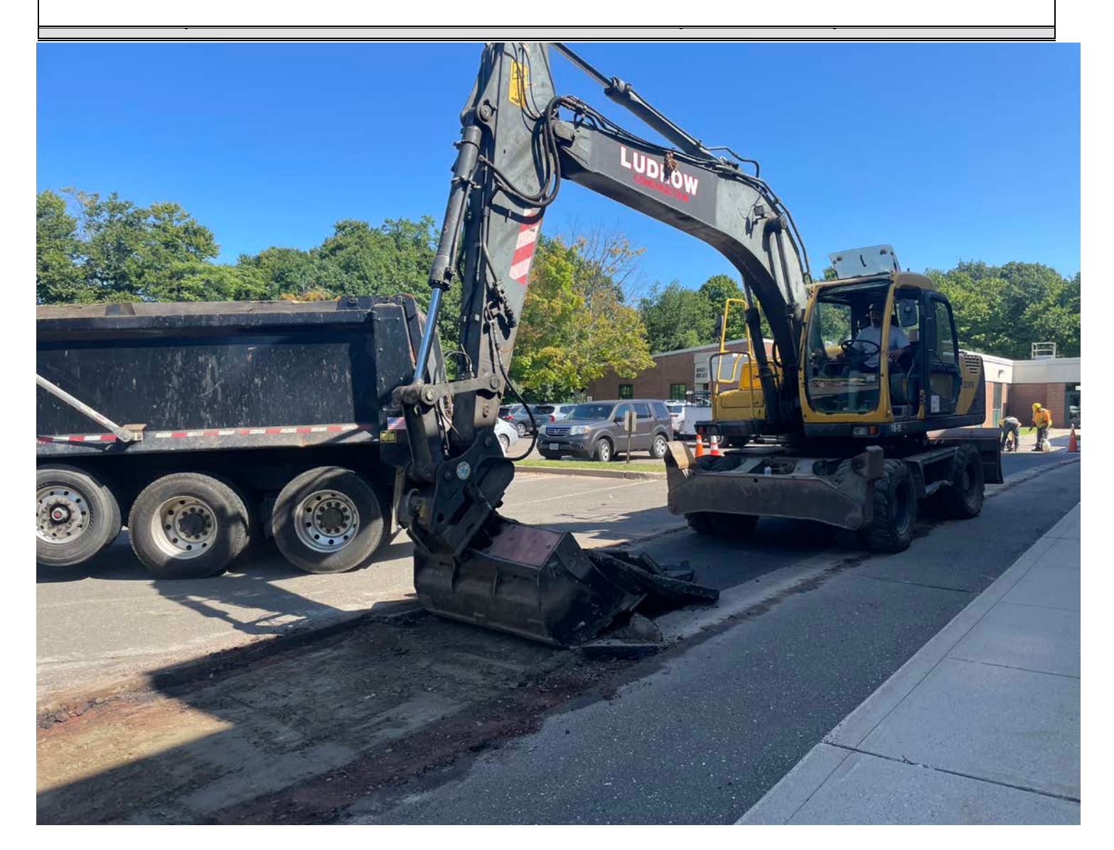
Picture 8: Ludlow stripping pavement from the footprint of a trench overcut located on the north side of the Coginchaug Regional High School as they prepare to place a permanent asphalt patch on the footprint. View to the east.