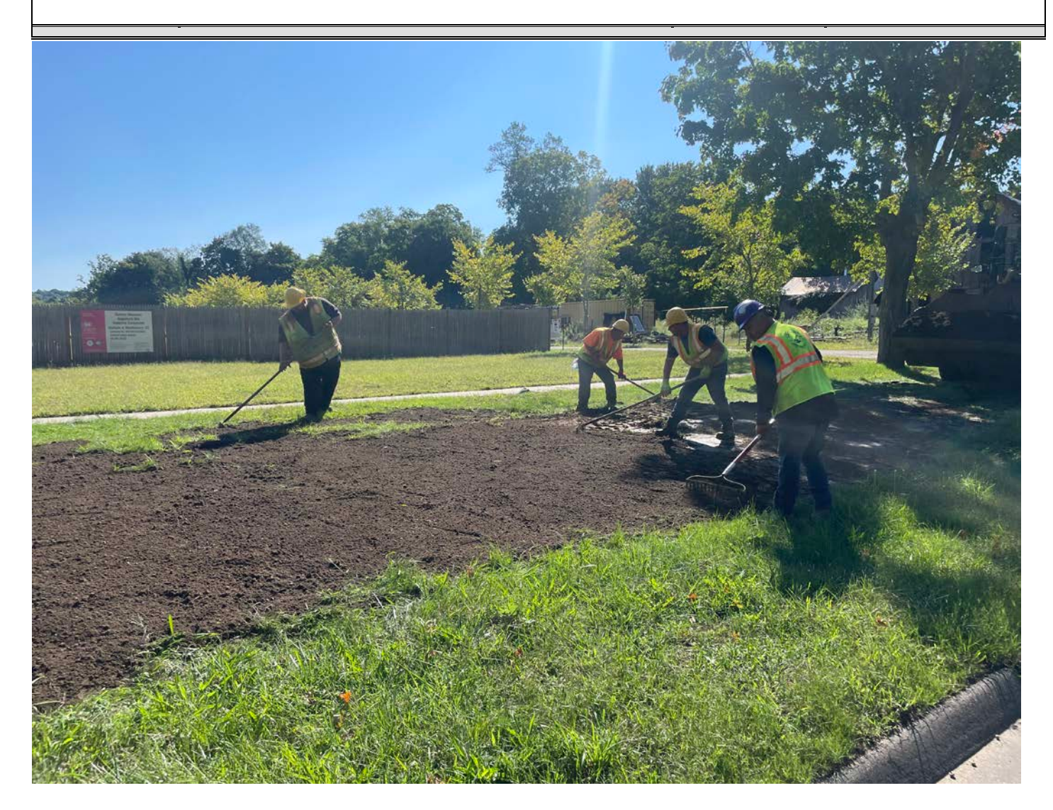
Picture 6: Ludlow grading loam they placed on the west side of the 281 Main Street, Durham, property. View to the southeast.