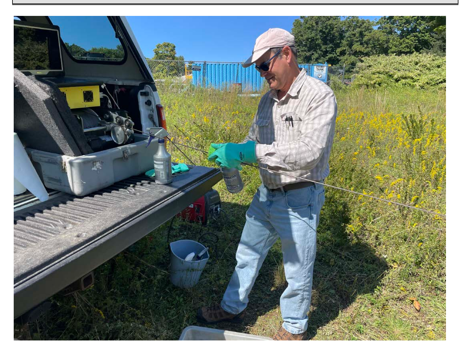
Picture 7: Geophysical Applications decontaminating a section of cable that is being used to lower borehole assessment instruments into well number MW-2, which is located on the east side of the 281 Main Street, Durham, property.