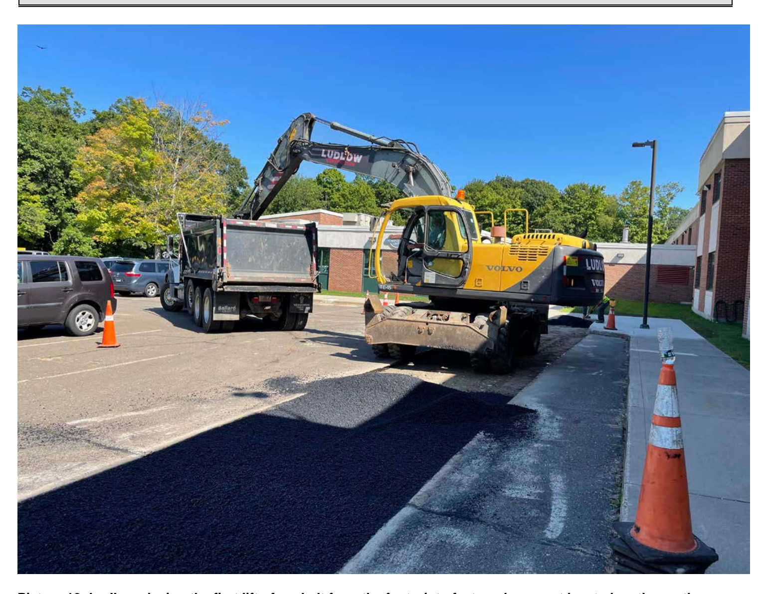
Picture 10: Ludlow placing the first lift of asphalt from the footprint of a trench overcut located on the north side of the Coginchaug Regional High School. View to the east.

Contractor: Ludlow Construction Page: 14 of 15