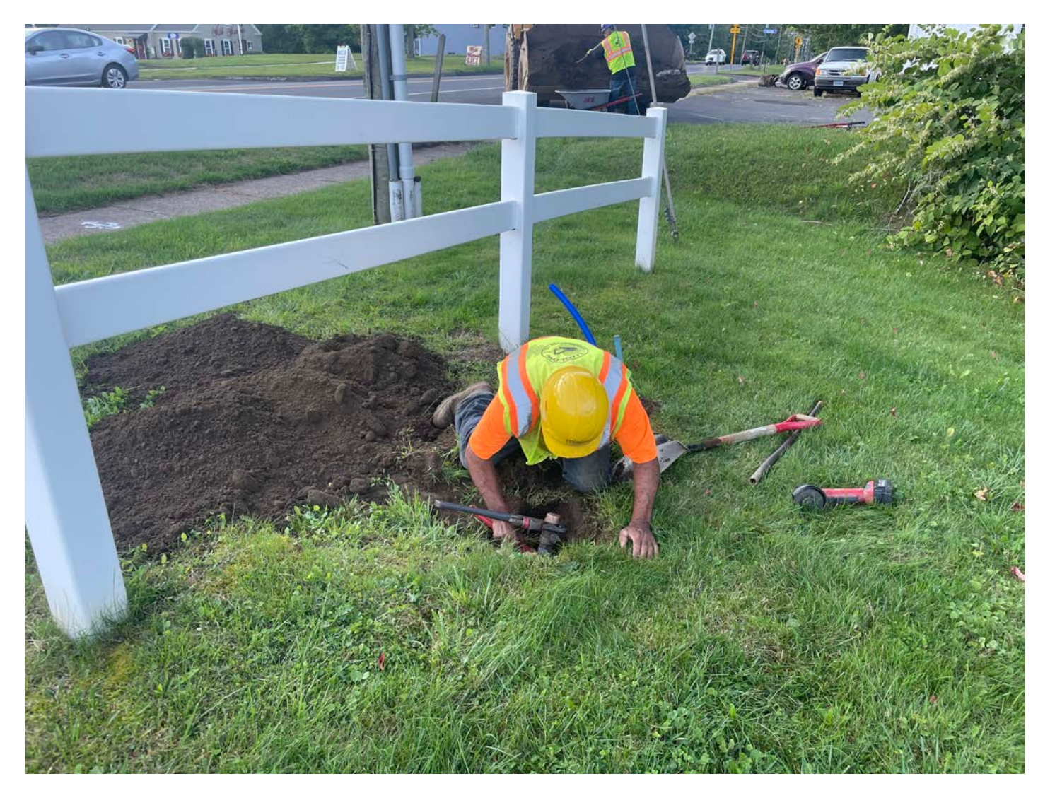
Picture 1: Ludlow cutting a blowoff line below surface grade on the 350 Main Street, Durham, property. View to the southeast.

Contractor: Ludlow Construction Page: 5 of 15