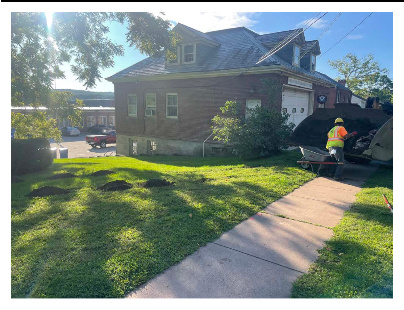
Picture 3: Ludlow placing loam on portions of the 201 Main Street, Durham, property that were disturbed during the previous installation of a meter vault. View to the southeast.