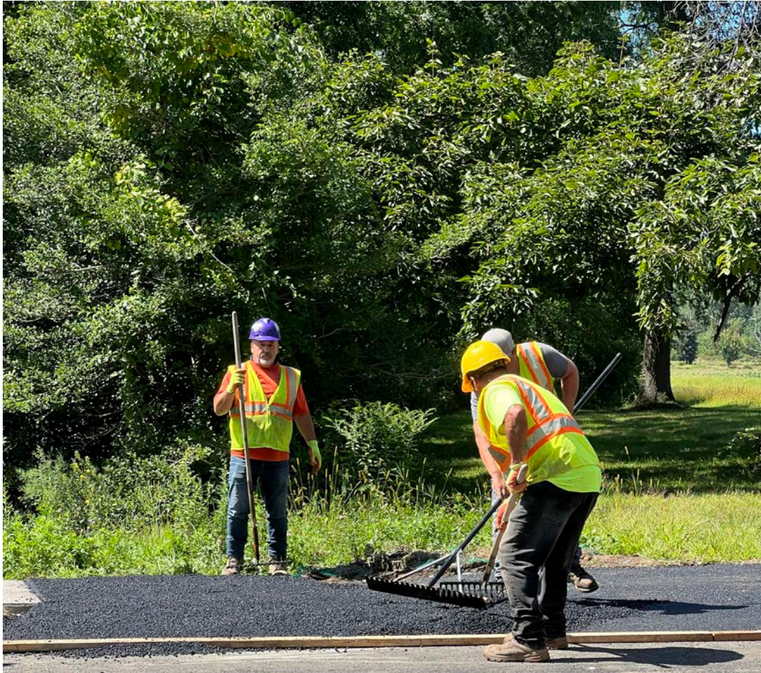
Picture 8: Ludlow Construction is laying a second layer of asphalt at 126 Maple Avenue.