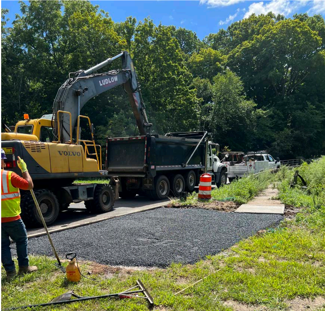
Picture 7: Ludlow Construction is laying the first layer of asphalt at 126 Maple Avenue using excavator and Ludlow personnel.