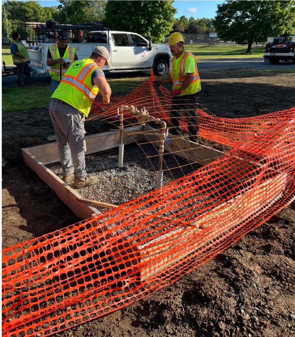
Picture 1: Ludlow Construction is at the backflow preventer enclosure base on Pickett Lane installing wire mesh reinforcement in the completed forms.