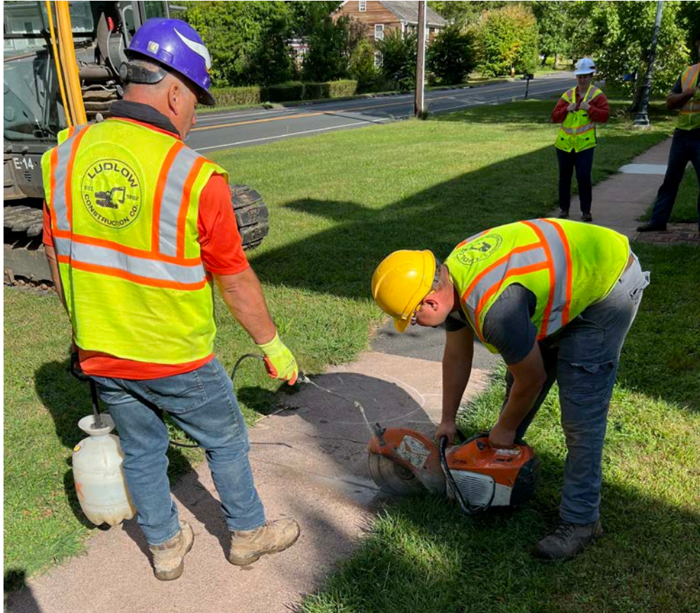
Picture 4: Ludlow Construction is saw-cutting a section of sidewalk to remove the sidewalk for restoration located at 297 Main Street.

Project: Durham Meadows Pipeline Installation Date: September 8, 2022 Location: Pickett Lane, Main Street, and Maple Avenue, Durham Day of Week: Thursday Project #: AECOM: 6061487 Report No: 505 Contractor: Ludlow Construction Page: 6 of 10