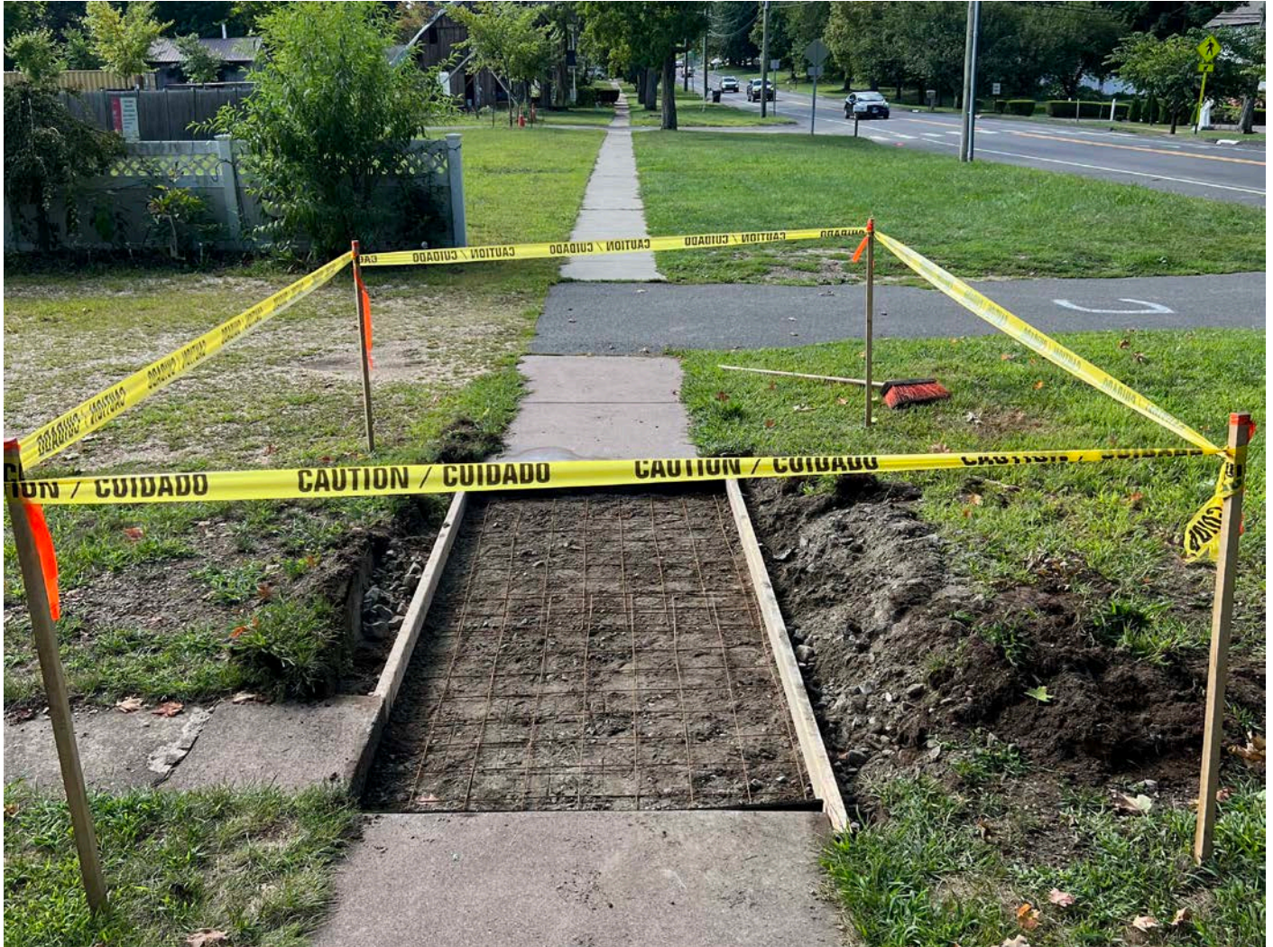
Picture 5: Ludlow construction has fully prepped a section of sidewalk for concrete placement at 289 Main Street.

Project: Durham Meadows Pipeline Installation Date: September 8, 2022 Location: Pickett Lane, Main Street, and Maple Avenue, Durham Day of Week: Thursday Project #: AECOM: 6061487 Report No: 505 Contractor: Ludlow Construction Page: 7 of 10