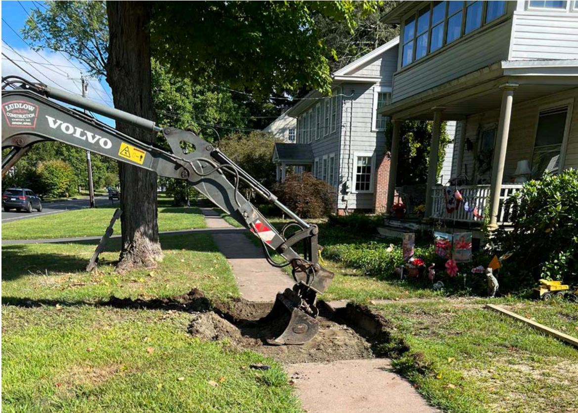
Picture 3: Ludlow Construction is excavating with an excavator to prepare the area for concrete sidewalk restoration located at 289 Main Street.

Project: Durham Meadows Pipeline Installation Date: September 8, 2022 Location: Pickett Lane, Main Street, and Maple Avenue, Durham Day of Week: Thursday Project #: AECOM: 6061487 Report No: 505 Contractor: Ludlow Construction Page: 5 of 10