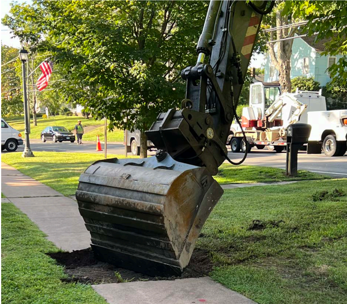
Picture 2: Ludlow Construction is excavating with an excavator to prepare the sidewalk area for concrete sidewalk restoration located at 215 Main Street.