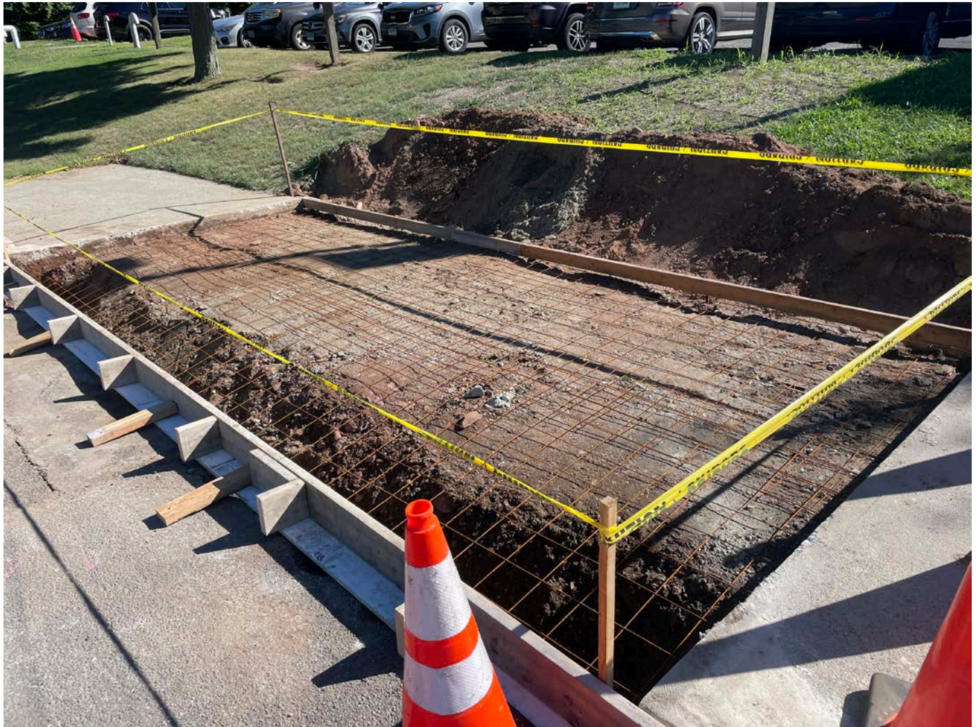
Picture 7: Sidewalk panel located on the west side of the Coginchuag Regional High School, Durham, that Ludlow has framed up to create a form for the placement of concrete as they prepare to repair the sidewalk. View to the northeast.