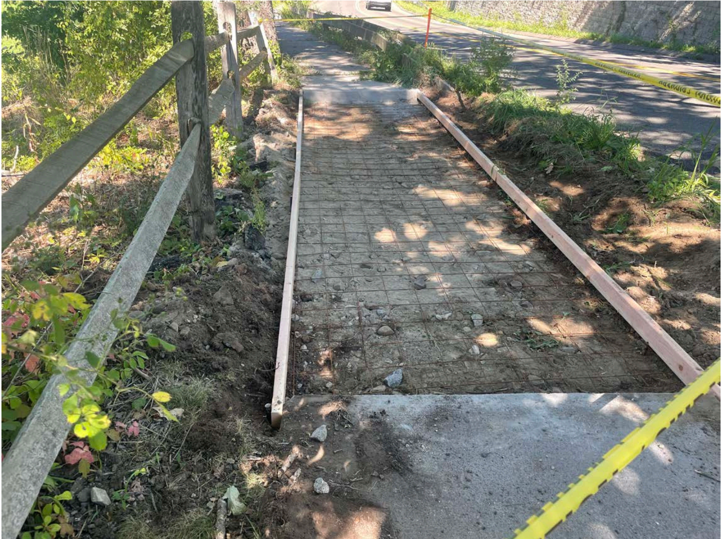
Picture 15: Sidewalk panel located on the west side of Maple Avenue, Durham, at Station ~901+69 that Ludlow framed up to create a form for the placement of concrete as they prepare to repair the sidewalk. View to the north.