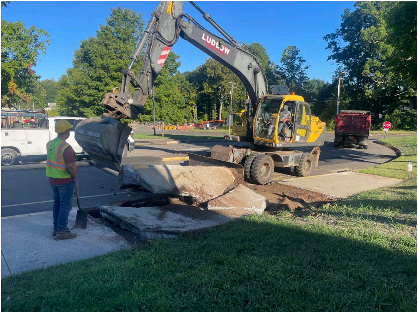
Picture 4: Ludlow removing a damaged sidewalk panel located on the west side of the Coginchuag Regional High School, Durham, as they prepare to repair the sidewalk. View to the north.