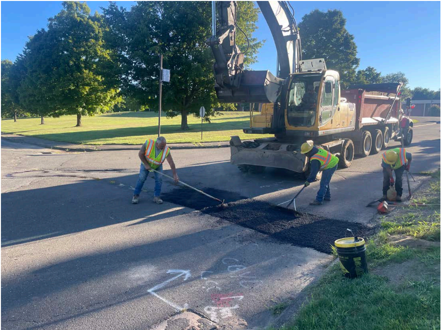
Picture 1: Ludlow placing a shim coating of asphalt over a patch that was placed over a previously installed water service line on Pickett Lane, Durham, at Station 525+75. View to the northeast.