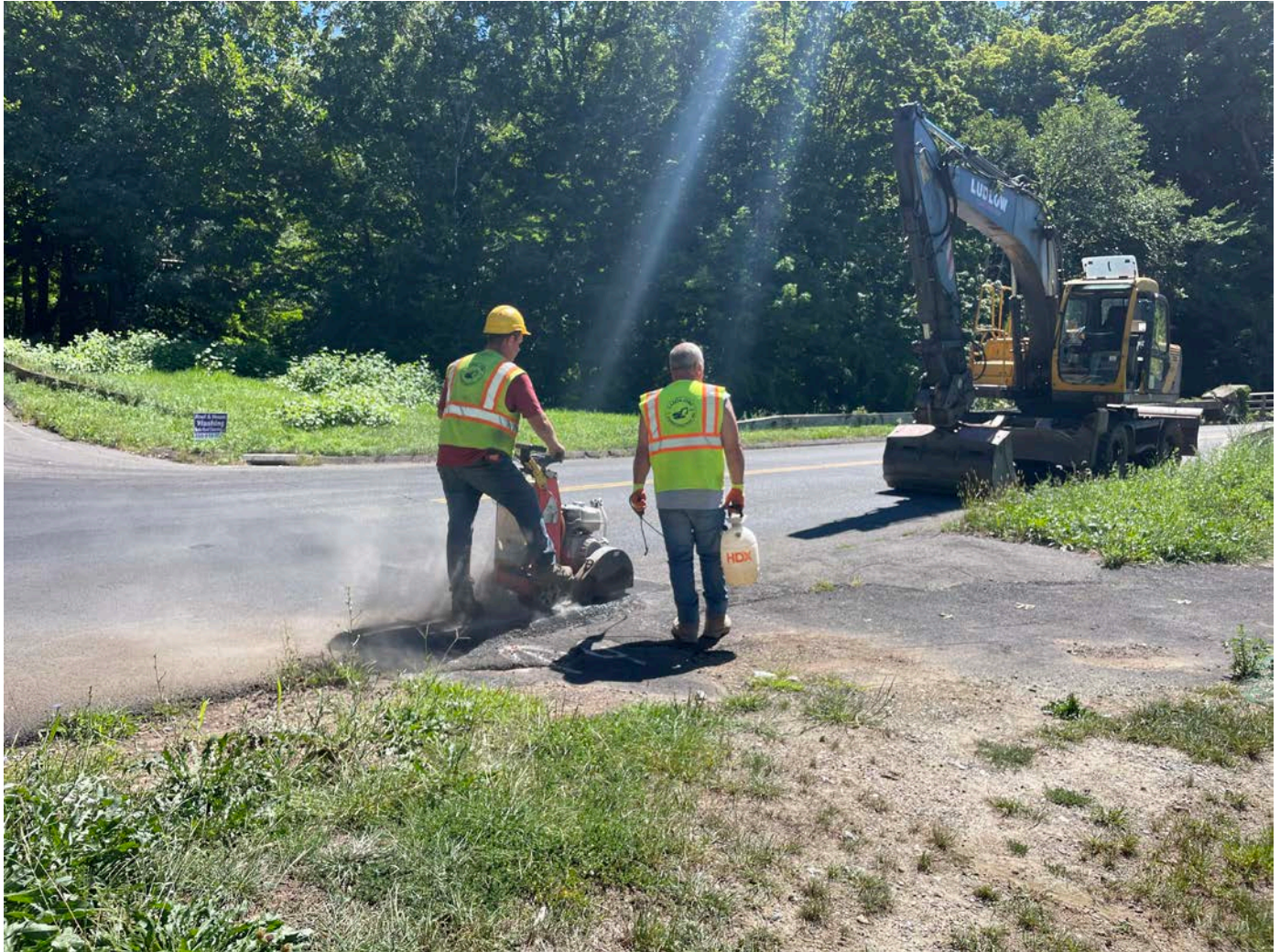
Picture 12: Ludlow saw-cutting at Station ~906+56 as they prepare to repair the sidewalk on the west side Maple Avenue. View to the southeast.