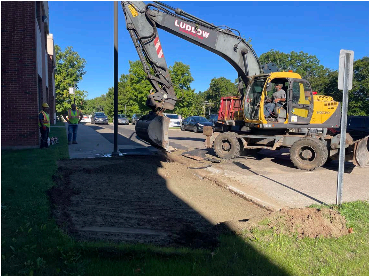
Picture 6: Ludlow excavating on the north side of the Coginchuag Regional High School, Durham, as they prepare to repair the sidewalk. View to the west.