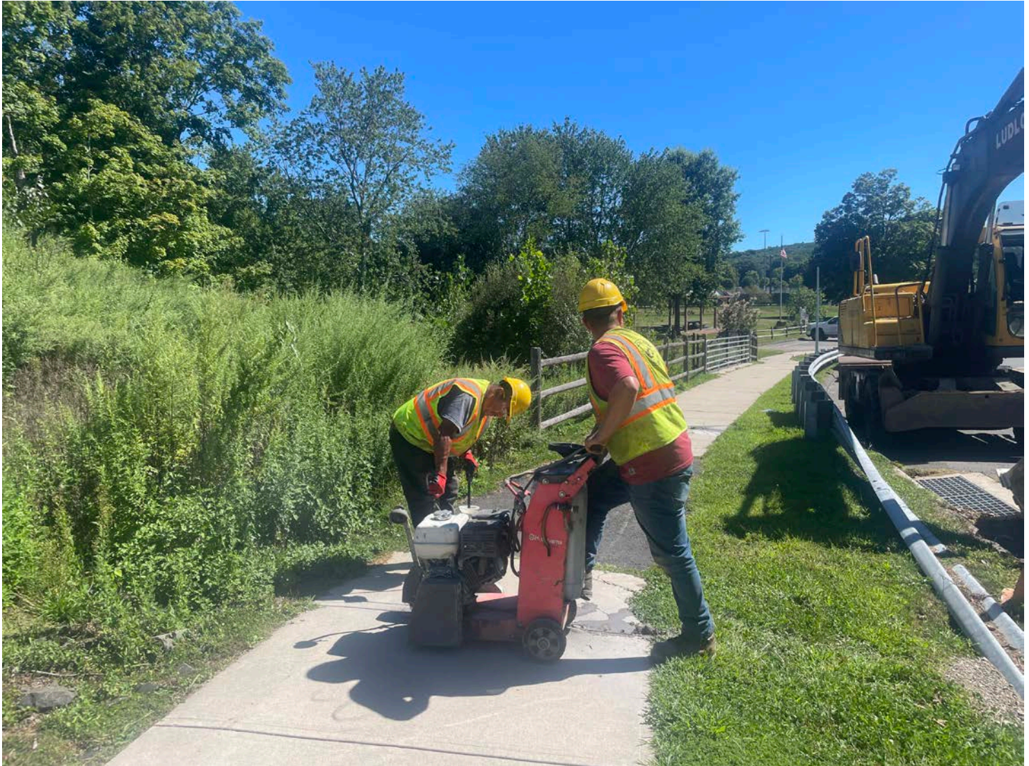
Picture 9: Ludlow saw-cutting sidewalk panels located at Station ~509+00 on the north side of Pickett Lane, Durham, where Ludlow is preparing to repair the sidewalk. View to the east.