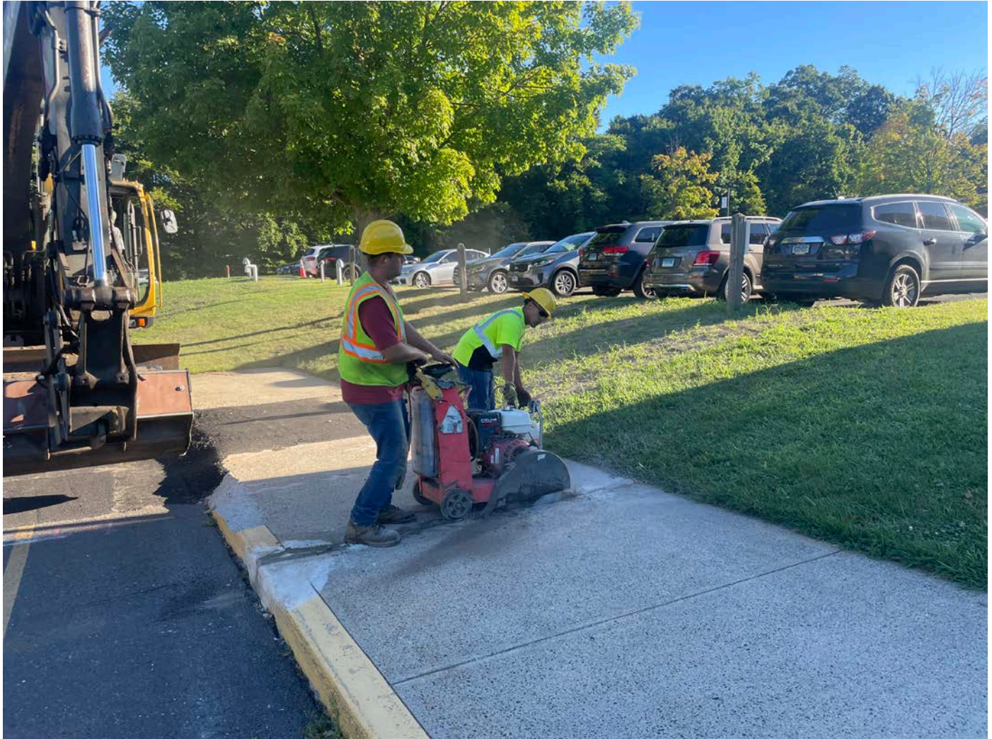
Picture 3: Ludlow saw-cutting a damaged sidewalk panel located on the west side of the Coginchuag Regional High School, Durham, as they prepare to repair the sidewalk. View to the north.