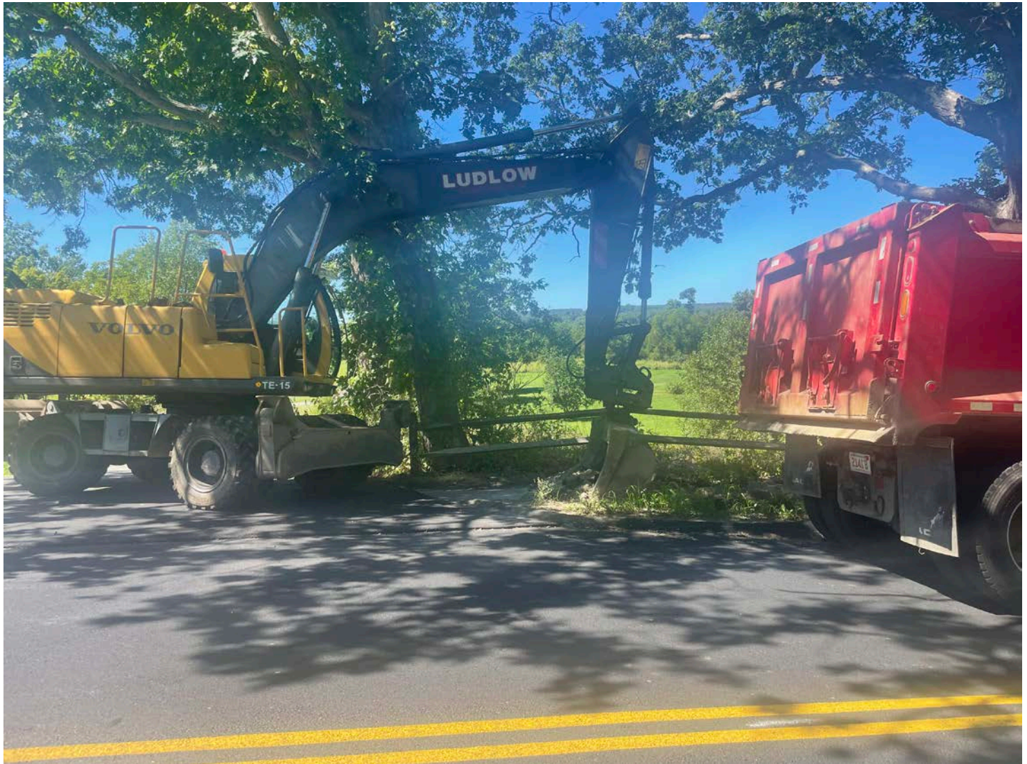
Picture 13: Ludlow removing damaged concrete panels of the sidewalk located on the west side of Maple Avenue at Station ~901+69. View to the west.