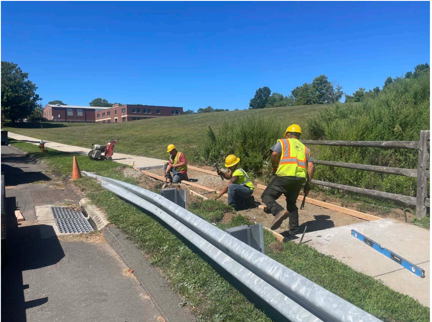
Picture 11: Sidewalk panels located at Station ~509+00 on the north side of Pickett Lane, Durham, where Ludlow is constructing a form for the placement of concrete as they prepare to repair the sidewalk. View to the northwest.