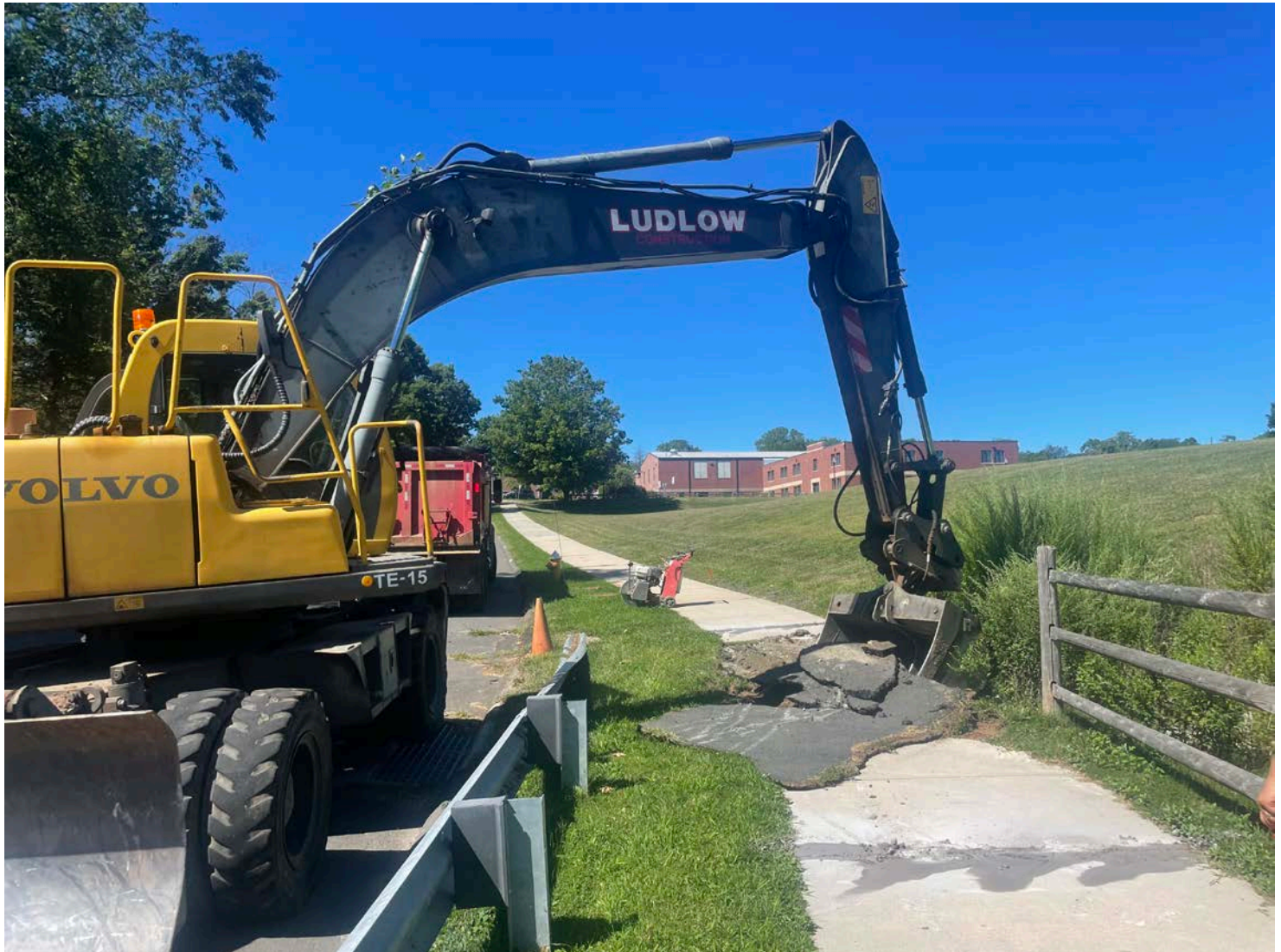
Picture 10: Ludlow removing damaged concrete panels of the sidewalk located at Station ~509+00 on the north side of Pickett Lane, Durham, where Ludlow is preparing to repair the sidewalk. View to the west.