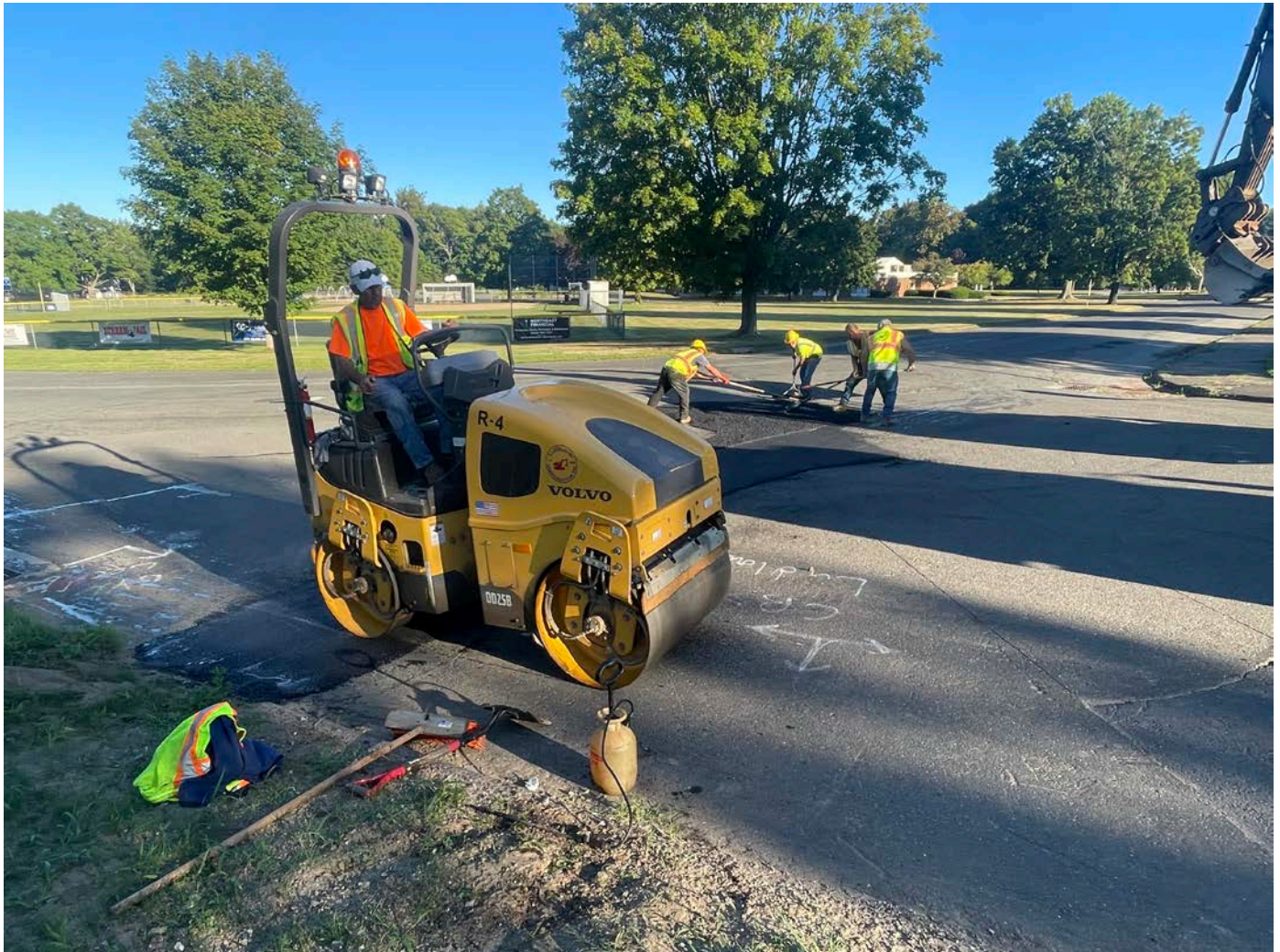
Picture 2: Ludlow compacting a shim coating of asphalt they placed today over an asphalt patch that they placed over a previously installed water service line on Pickett Lane, Durham, at Station 525+75. View to the north.

Res. Representative: J. Meunier Date: 9/02/22