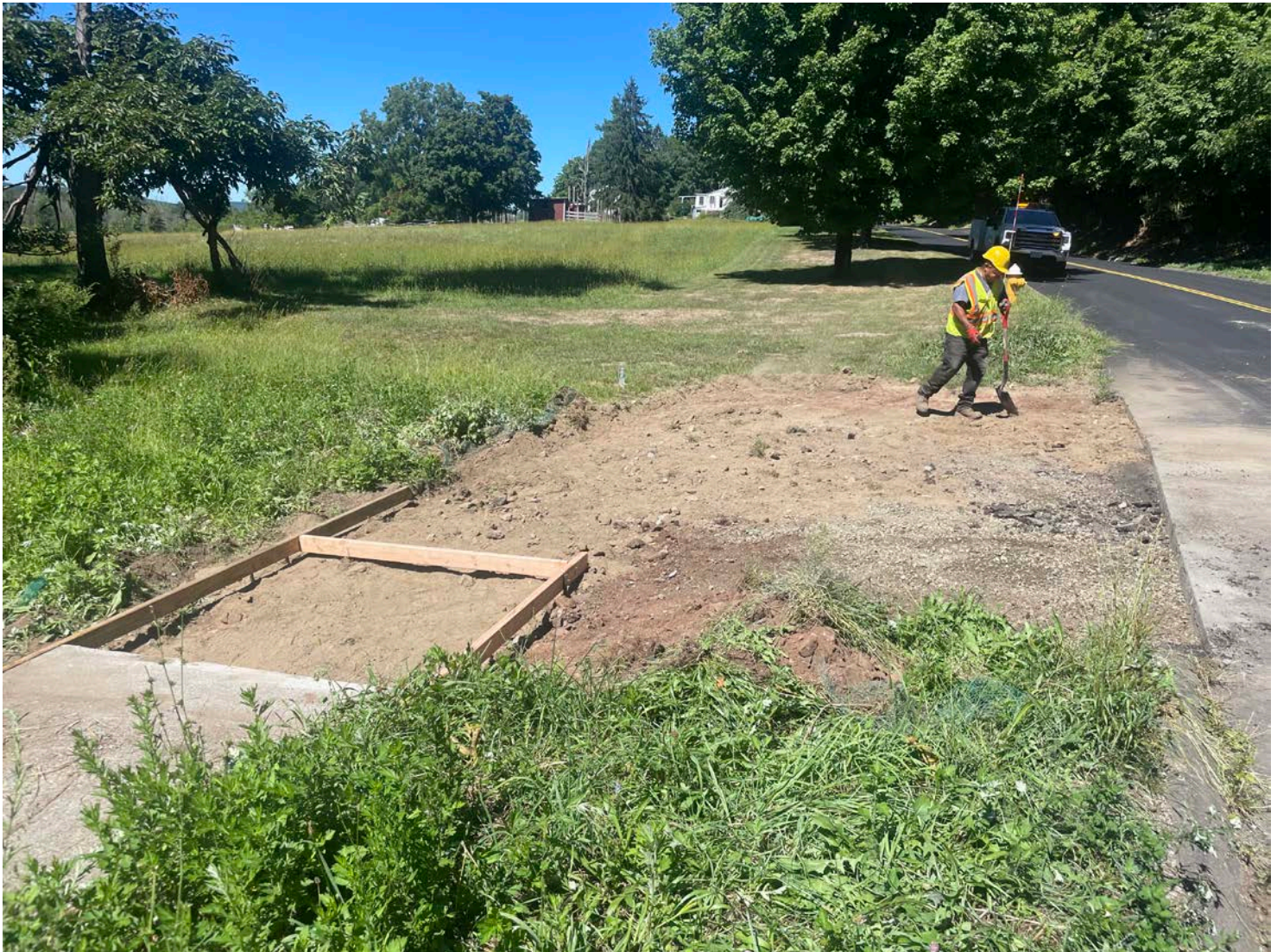
Picture 14: Sidewalk panel located at Station ~906+56 on the west side of Maple Avenue, Durham, that Ludlow is in the process of forming up for the placement of concrete as they prepare to repair the sidewalk. View to the north.