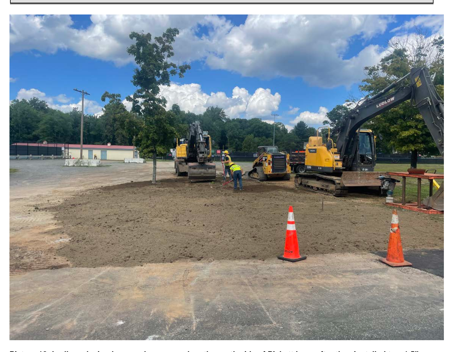
Picture 12: Ludlow placing loam and grass seed on the north side of Pickett Lane after they installed two 1.5" polyethylene water lines. View to the north.

Contractor: Ludlow Construction Page: 14 of 14