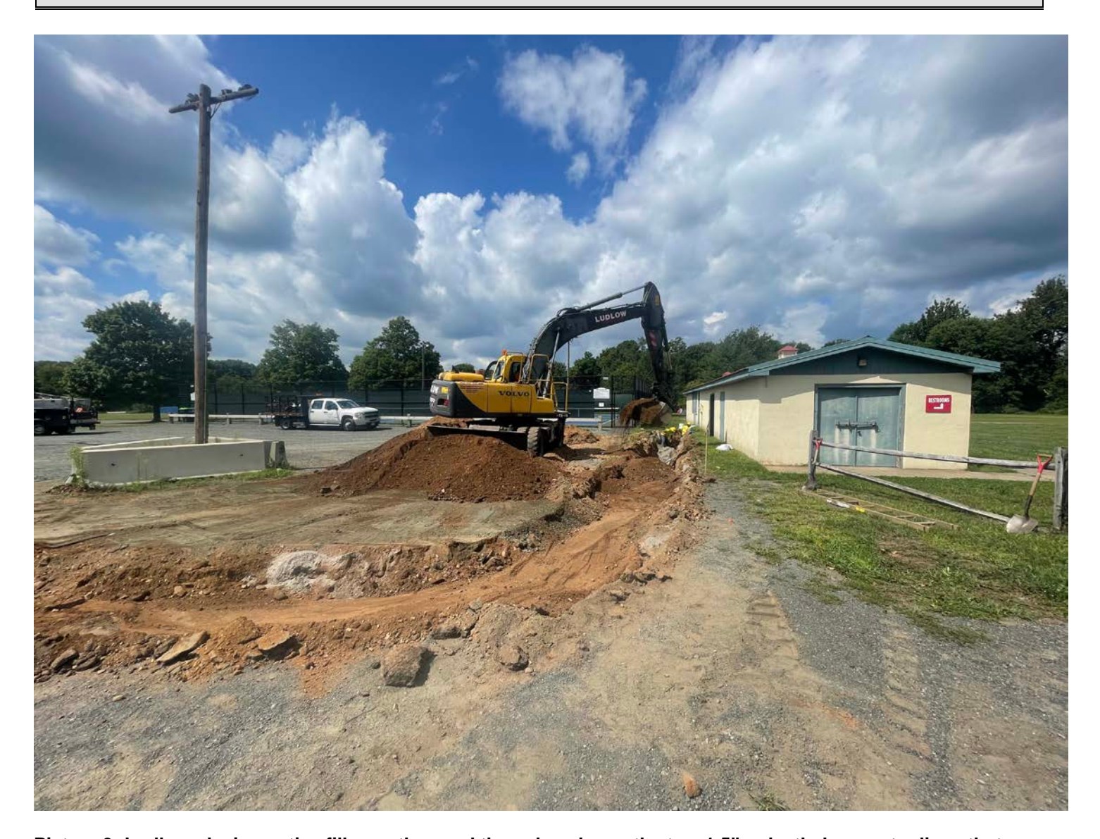
Picture 9: Ludlow placing native fill over the sand they placed over the two 1.5" polyethylene water lines that they Ludlow installed on the south side of the recreation center located on Pickett Lane. View to the west.