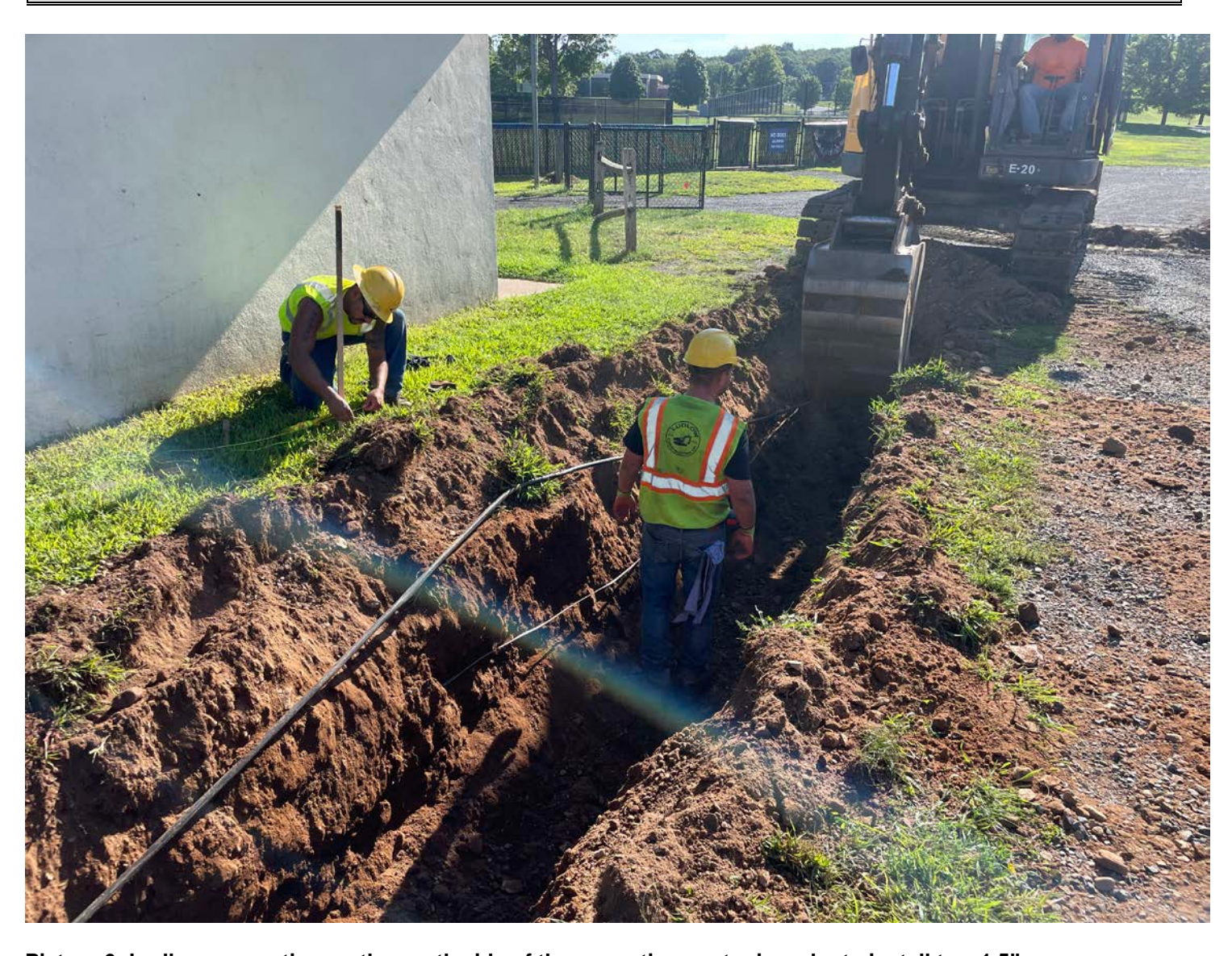
Picture 6: Ludlow excavating on the south side of the recreation center in order to install two 1.5" polyethylene water lines at the recreation center. View to the east.

Contractor: Ludlow Construction Page: 8 of 14