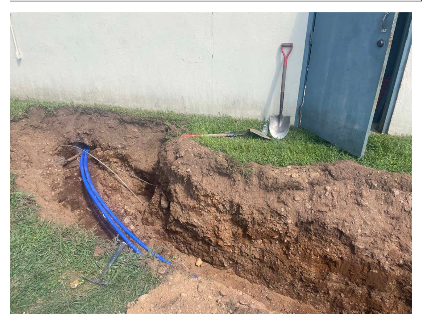
Picture 7: View of the two 1.5" polyethylene water lines that Ludlow installed, where it was run into the south side of the recreation center located on Pickett Lane. View to the northwest.

Contractor: Ludlow Construction Page: 9 of 14