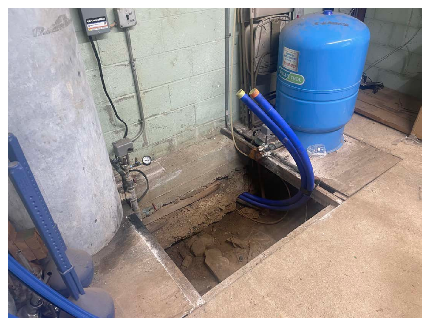
Picture 8: View from the inside of the recreation center where Ludlow ran two 1.5" polyethylene waters. View to the southwest.

Contractor: Ludlow Construction Page: 10 of 14