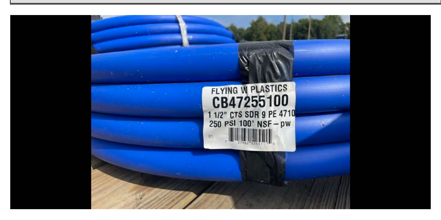
Picture 4: 1.5" polyethylene water line that Ludlow installed between the recreation center and the meter vaults located at Station ~516+55.

Page: 6 of 14 Contractor: Ludlow Construction