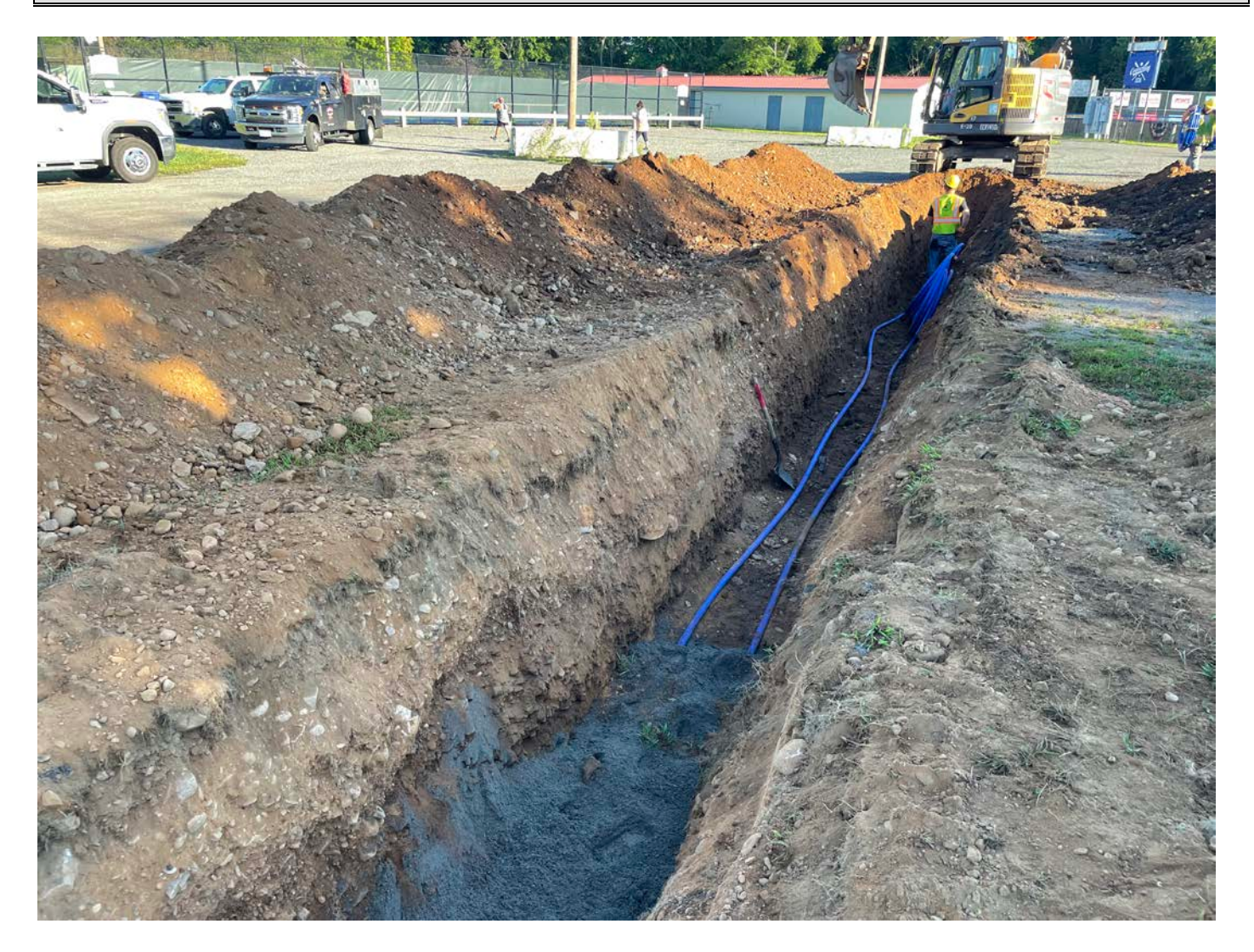
Picture 2: Ludlow installing two 1.5" polyethylene water lines to the north of the two meter vaults they installed at Station \sim 516+55. View to the north.