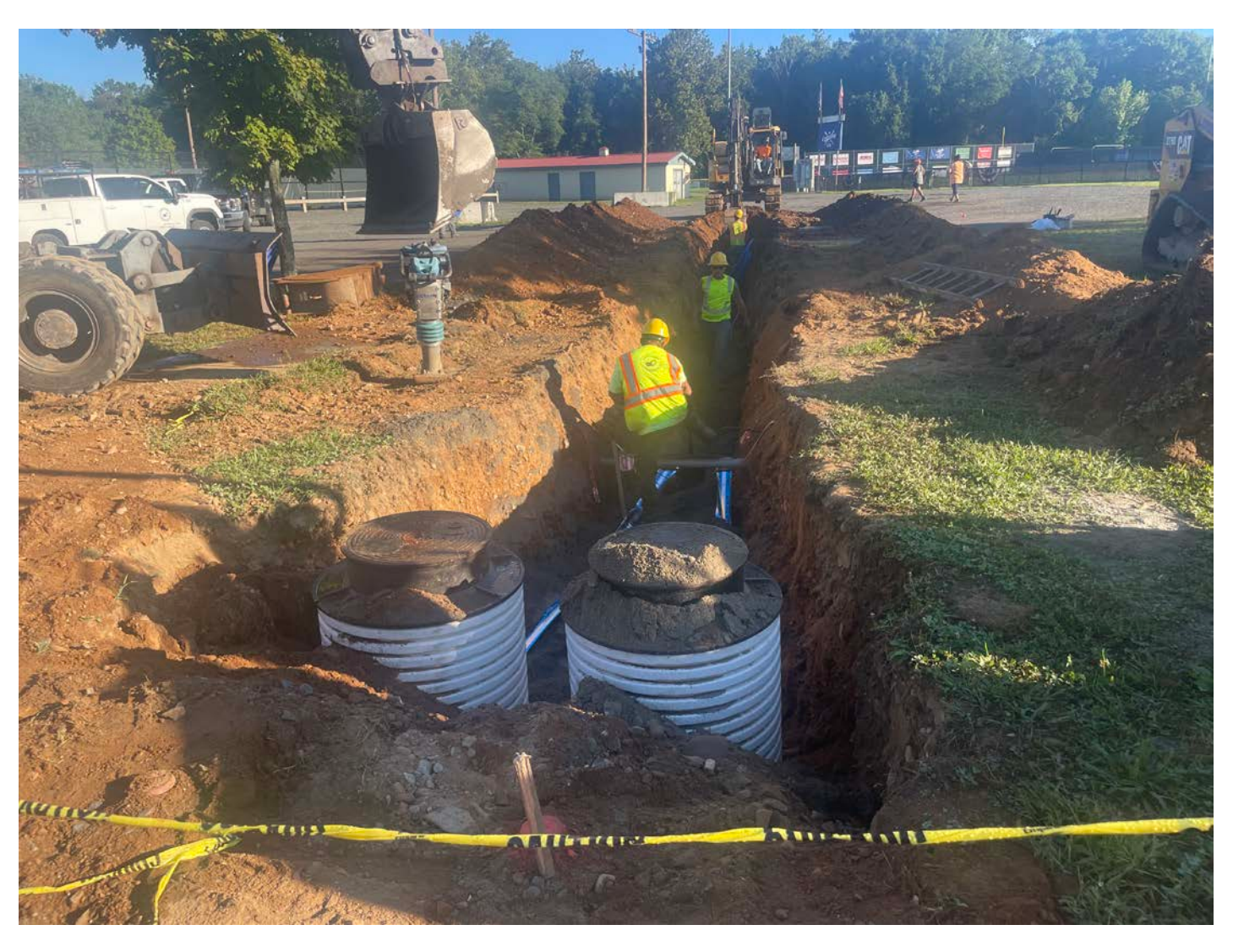
Picture 1: Ludlow installing two 1.5" polyethylene water lines to the north of the two meter vaults they installed at Station ~516+55. View to the north.

Contractor: Ludlow Construction Page: 3 of 14