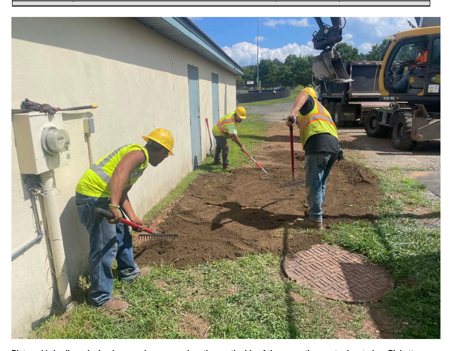
Picture 11: Ludlow placing loam and grass seed on the south side of the recreation center located on Pickett Lane after they installed two 1.5" polyethylene water lines. View to the east.

Contractor: Ludlow Construction Page: 13 of 14