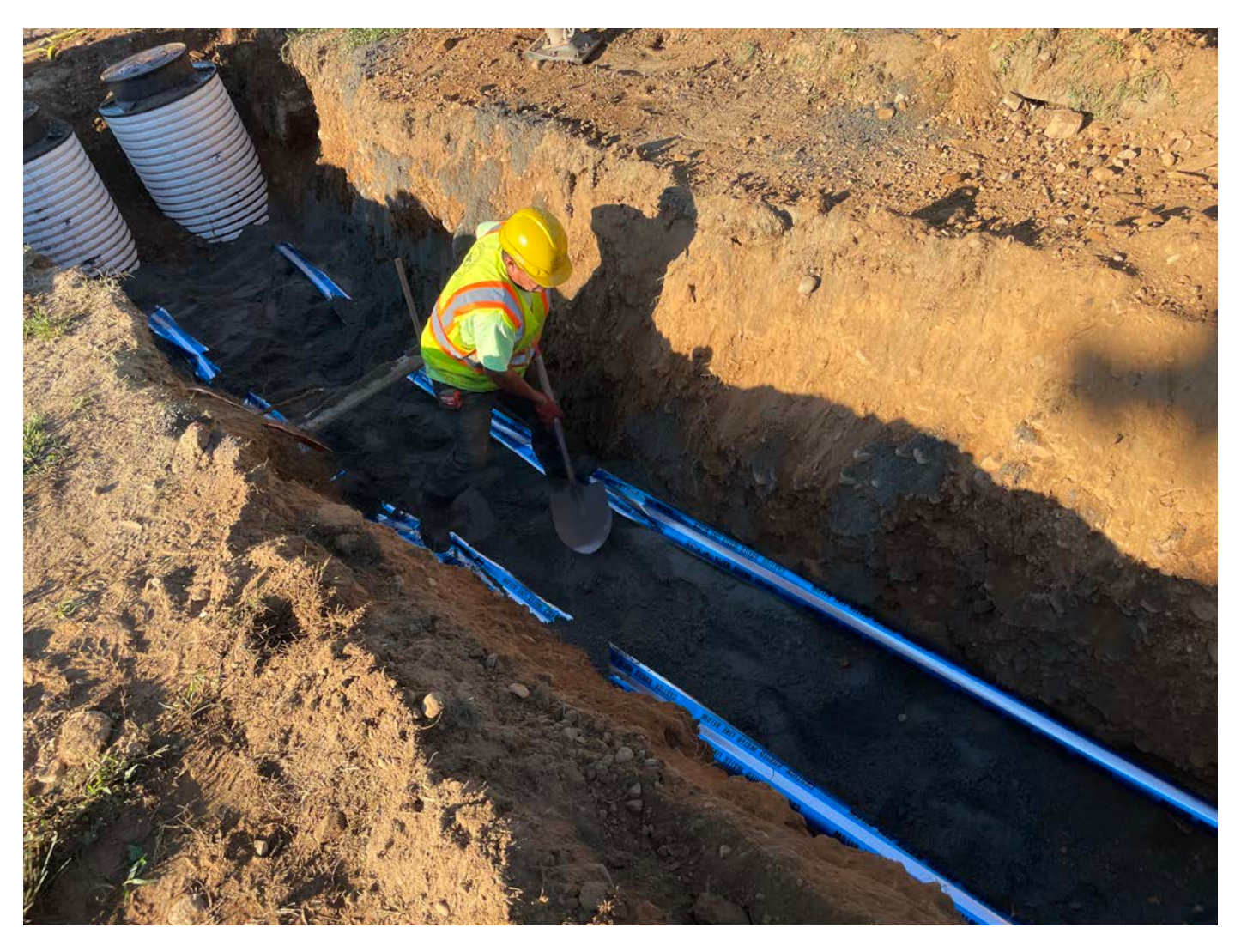
Picture 3: Ludlow placing sand followed by caution tape over the two 1.5" polyethylene water lines they are installing to the north of the two meter vaults they installed at Station ~516+55. View to the southwest.

Contractor: Ludlow Construction Page: 5 of 14