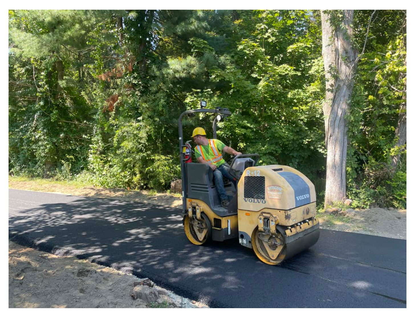
Picture 7: Ludlow using a rolling compactor on the second lift of asphalt they placed on the footprint of the driveway on the 212R Maple Avenue property. View to the northwest.

Page: 9 of 9 Contractor: Ludlow Construction