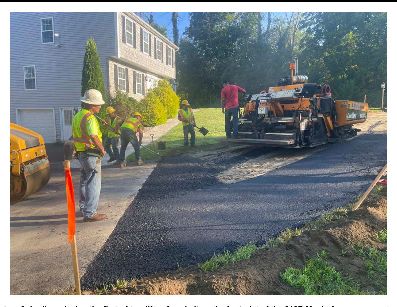
Picture 3: Ludlow placing the first of two lifts of asphalt on the footprint of the 212R Maple Avenue property driveway. View to the north.