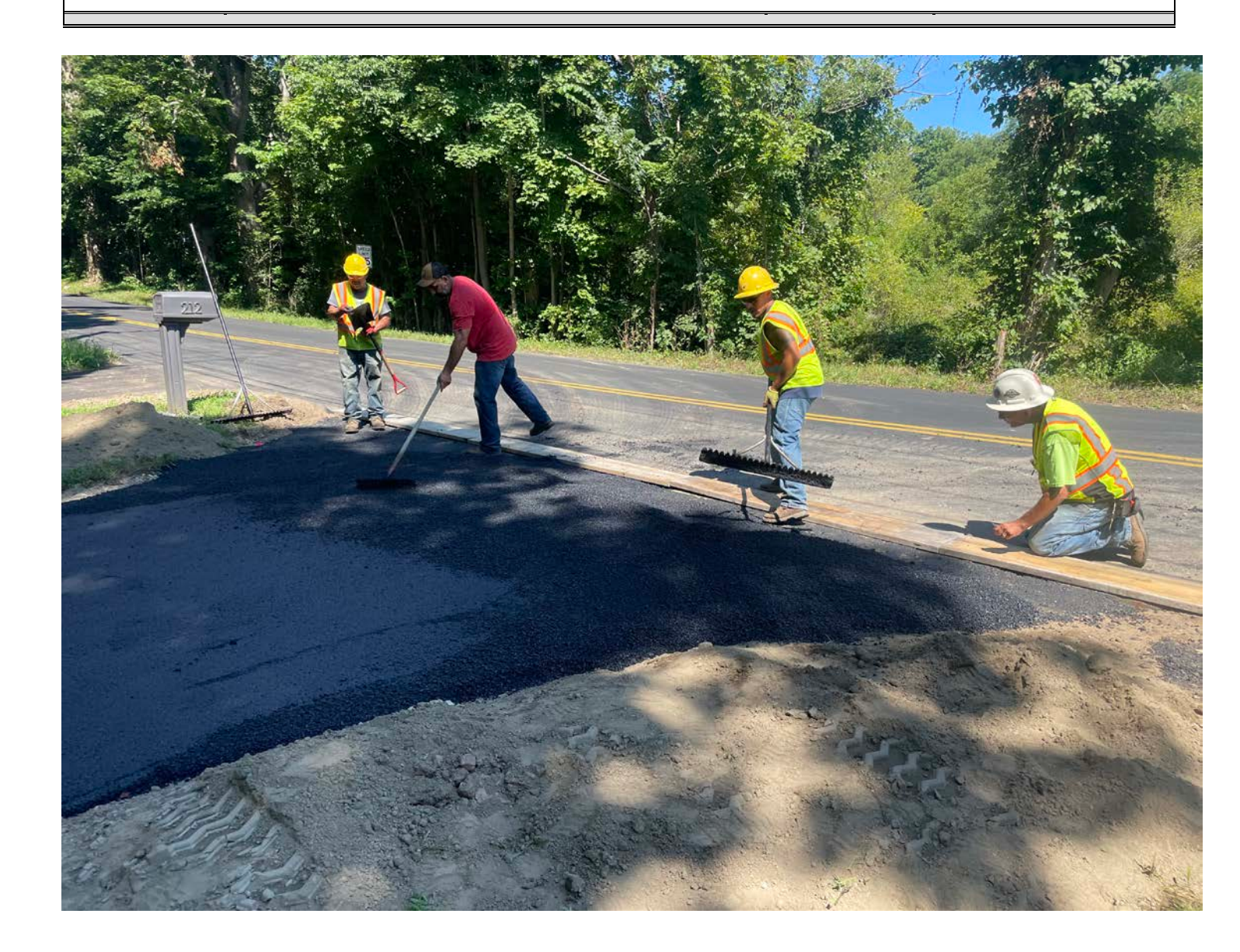
Picture 6: Ludlow placing the second of two lifts of asphalt on the footprint of the 212R Maple Avenue property driveway where it connects with Maple Avenue. View to the northeast.