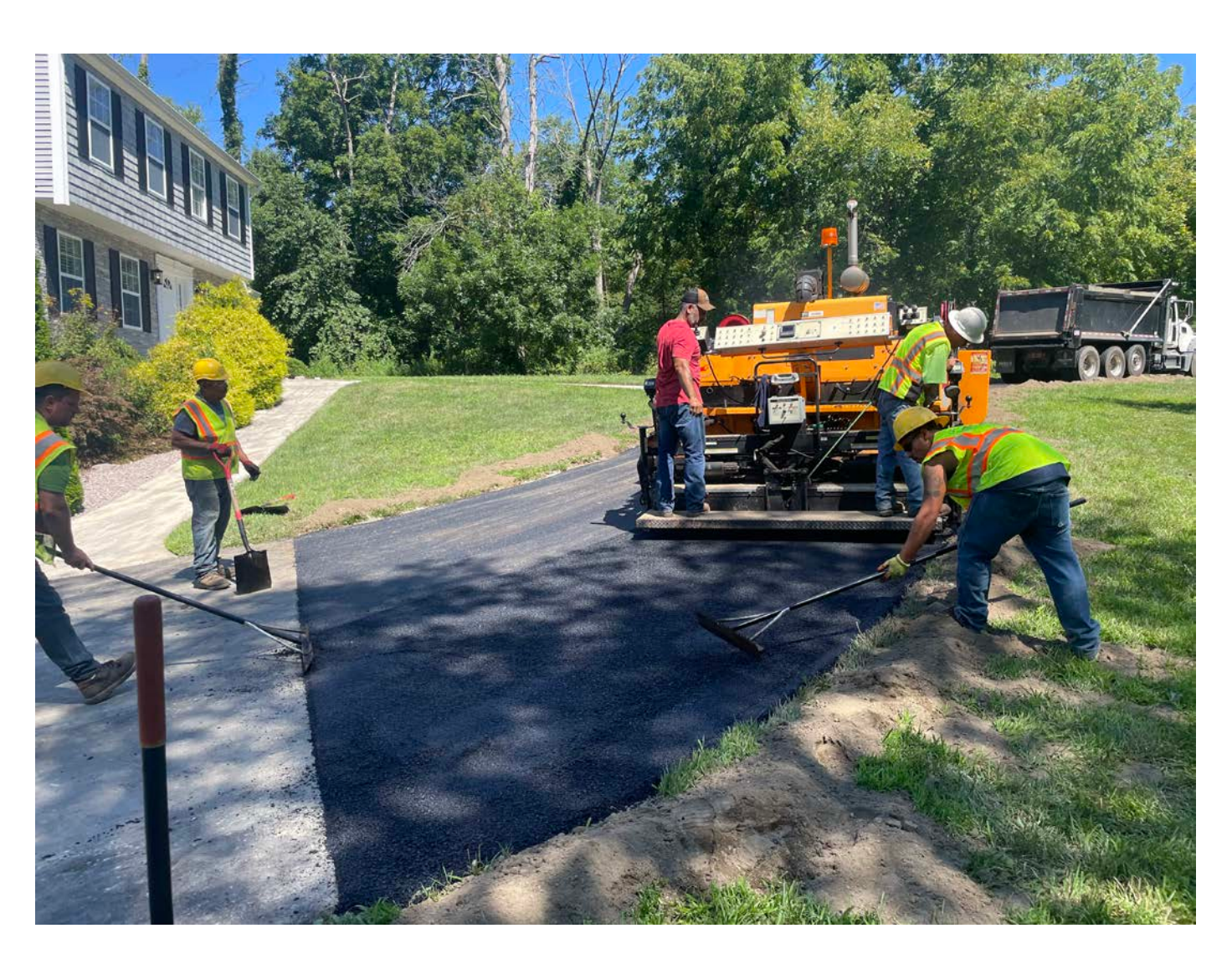
Picture 5: Ludlow placing the second of two lifts of asphalt on the footprint of the 212R Maple Avenue property driveway. View to the north.

Contractor: Ludlow Construction Page: 7 of 9