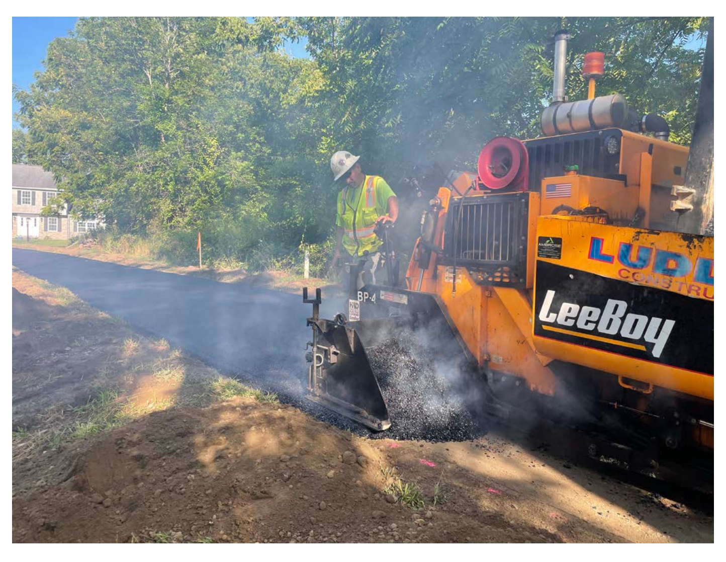
Picture 4: Ludlow placing the first of two lifts of asphalt on the footprint of the 212R Maple Avenue property driveway. View to the west.

Contractor: Ludlow Construction Page: 6 of 9