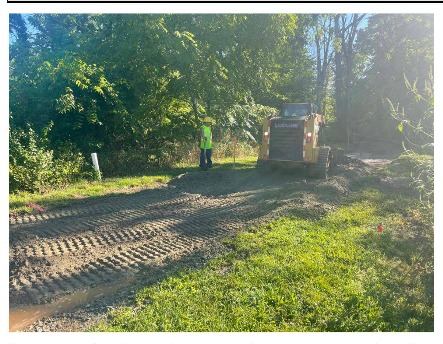
Picture 2: Ludlow grading 1.25" processed gravel on the footprint of the 212R Maple Avenue driveway. View to the east.