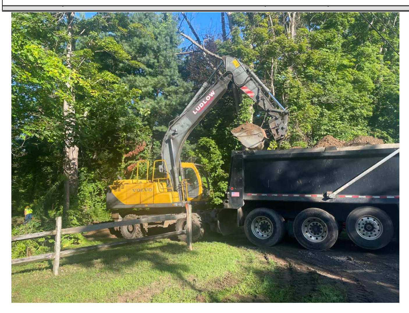
Picture 1: Ludlow is excavating fill on the east side of the driveway for the 212R Main Street property. View to the north.