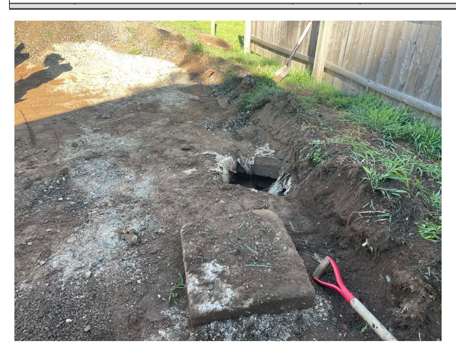
Picture 5: A second dry well that Ludlow daylighted when preparing the subgrade of the driveway footprint at the 257 Main Street property for paving tomorrow. View to the west.