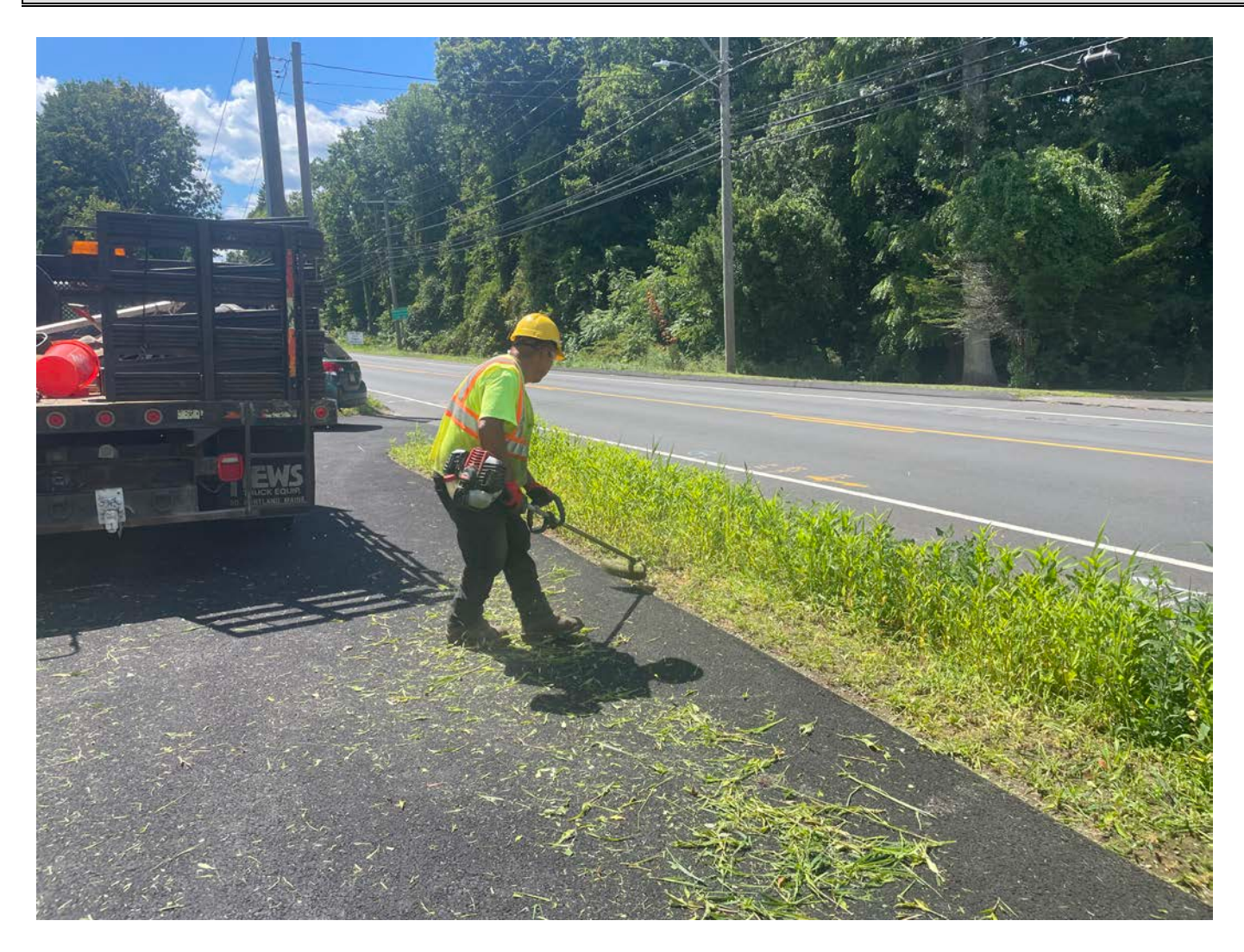
Picture 11: Ludlow cutting grass on the west side of the Water Meter Building located on S. Main Street in Middletown. View to the southwest.