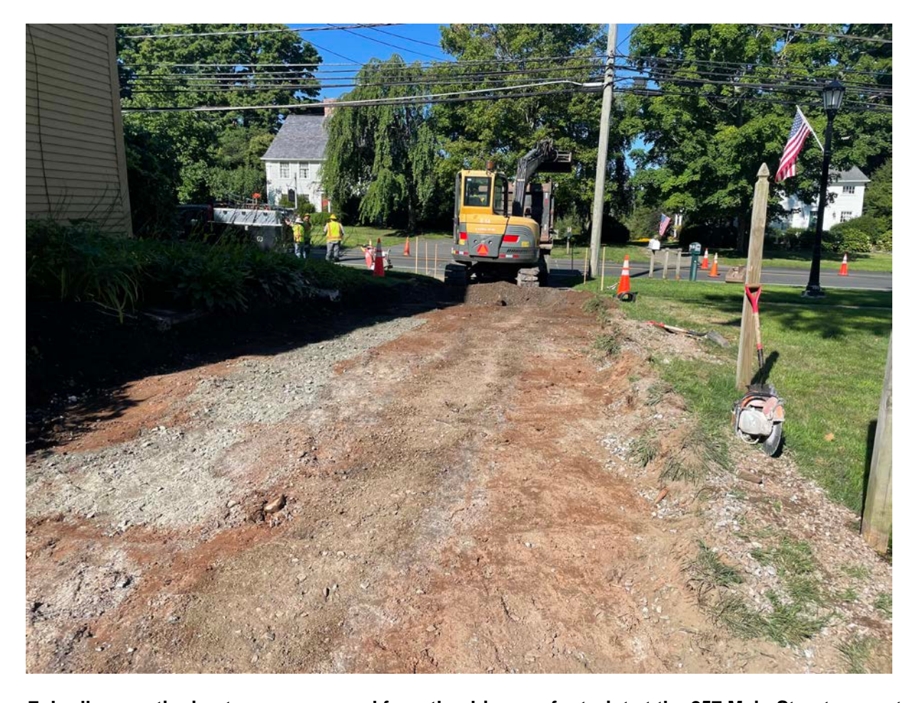
Picture 7: Ludlow continuing to remove gravel from the driveway footprint at the 257 Main Street property as they prepare to pave the driveway tomorrow. View to the west.

Contractor: Ludlow Construction Page: 10 of 14