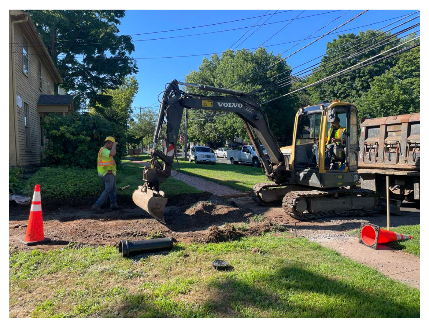
Picture 8: Ludlow placing and grading 1.25" processed gravel on the west side of the driveway at the 257 Main Street property as they prepare for paving tomorrow. View to the south.

Contractor: Ludlow Construction Page: 11 of 14