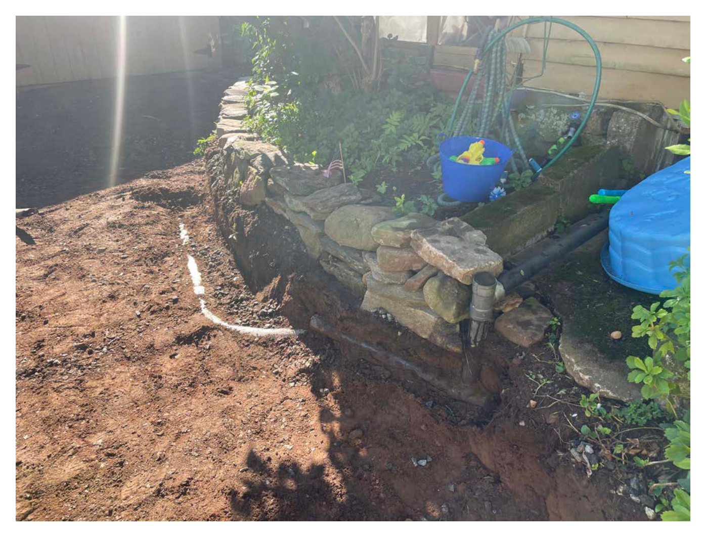
Picture 6: 2" PVC that Ludlow daylighted when preparing the subgrade of the driveway footprint at the 257 Main Street property for paving tomorrow. View to the southeast.

Contractor: Ludlow Construction Page: 9 of 14