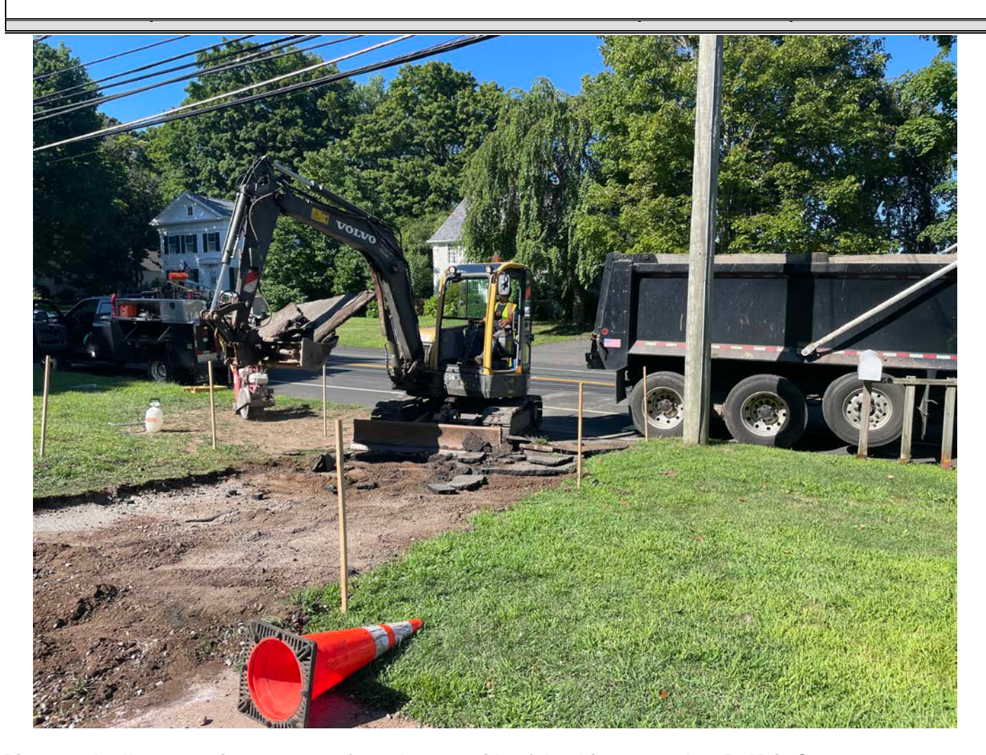
Picture 9: Ludlow removing pavement from the west side of the driveway at the 257 Main Street property. View to the southwest.