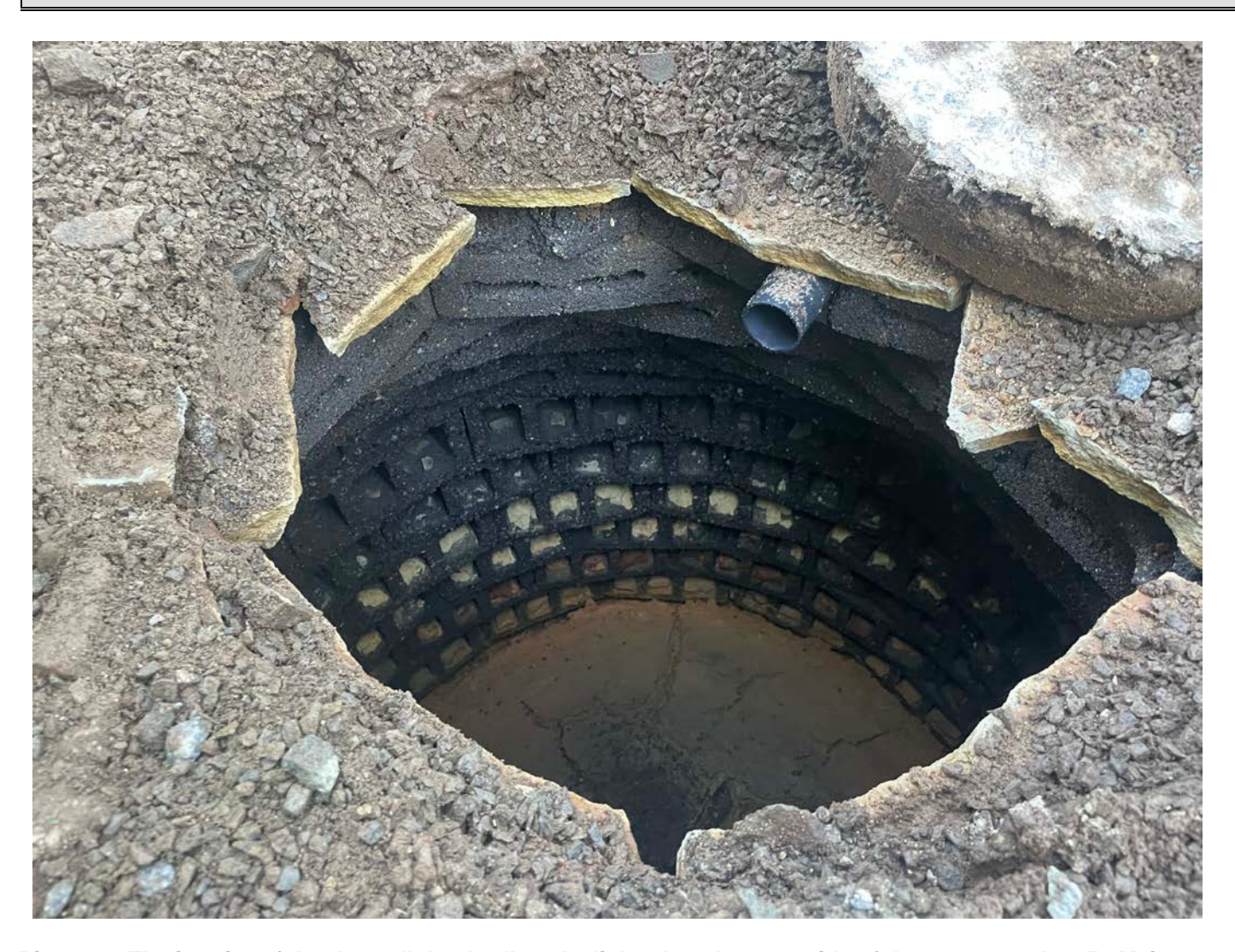
Picture 3: The interior of the dry well that Ludlow daylighted on the west side of the garage at the 257 Main Street property. View to the south.

Project #: AECOM: 6061487 Report No: 492 Page: 6 of 14