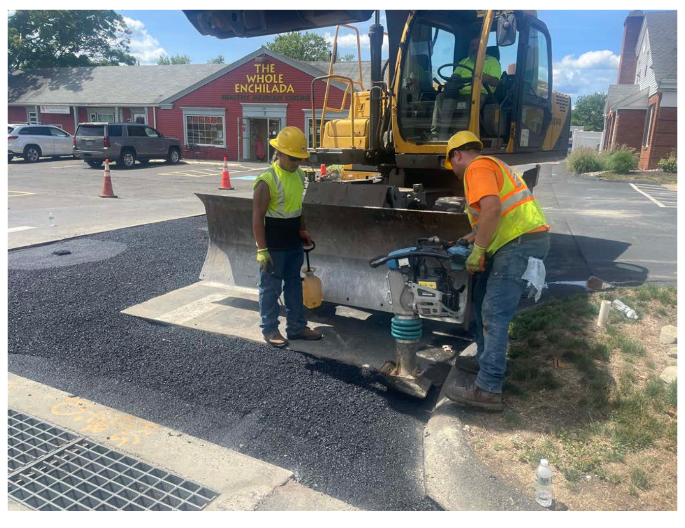
Picture 8: Ludlow compacting the first lift of asphalt that they placed within the footprint of the trench overcut and the shared driveway apron for the 370 and 376 Main Street, Durham, properties with a jumping jack. View to the west.

Contractor: Ludlow Construction Page: 10 of 11