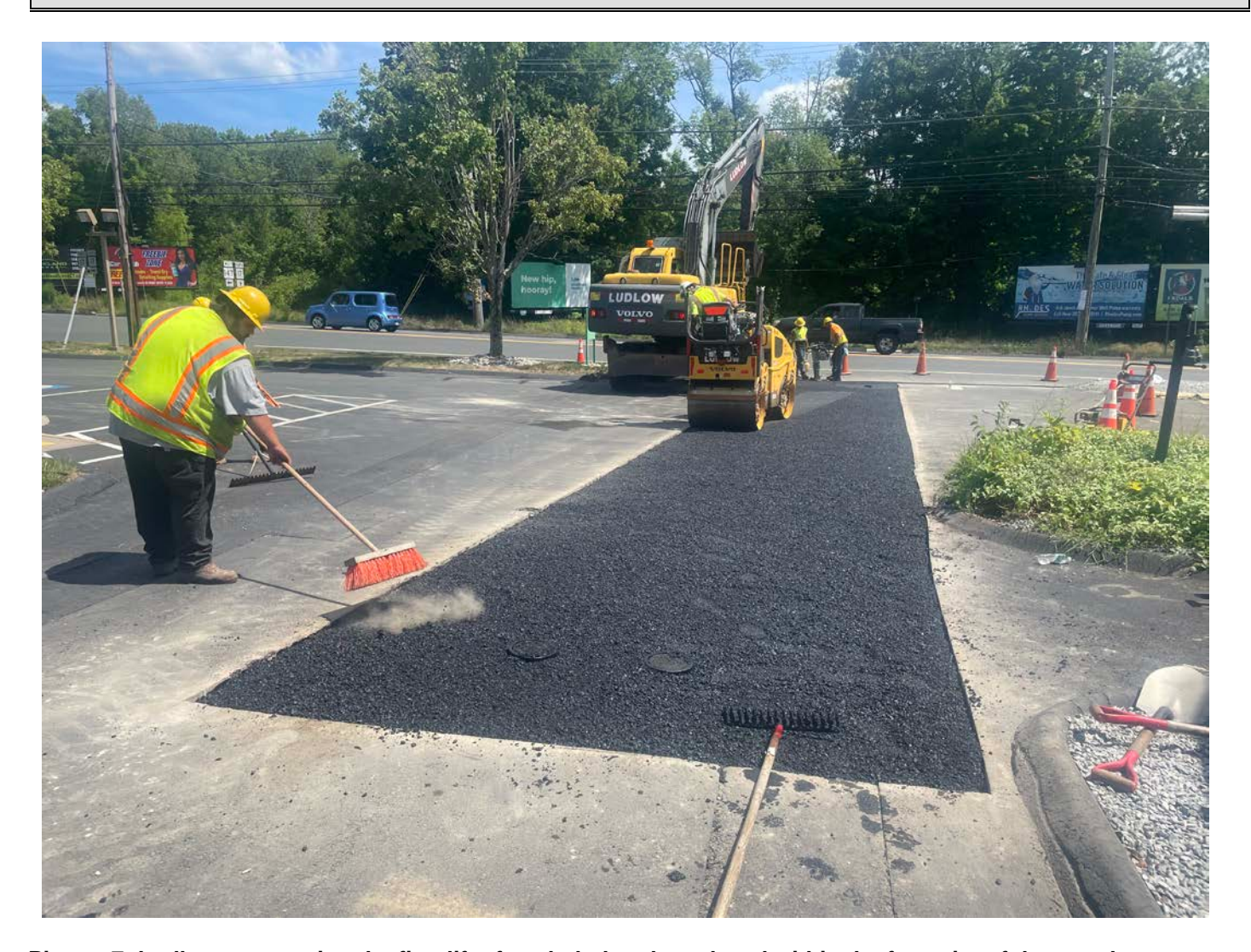
Picture 7: Ludlow compacting the first lift of asphalt that they placed within the footprint of the trench overcut and the shared driveway apron for the 370 and 376 Main Street, Durham, properties. View to the east.