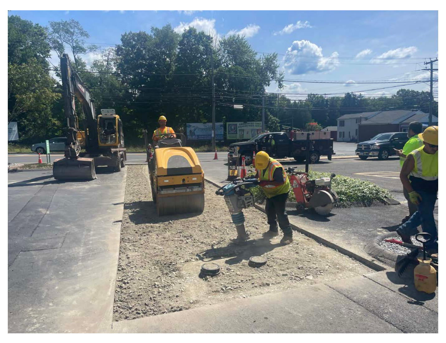
Picture 6: Ludlow compacting 1.25" processed gravel that they placed within the footprint of the trench overcut and the shared driveway apron for the 370 and 376 Main Street, Durham, properties. View to the east.

Contractor: Ludlow Construction Page: 8 of 11