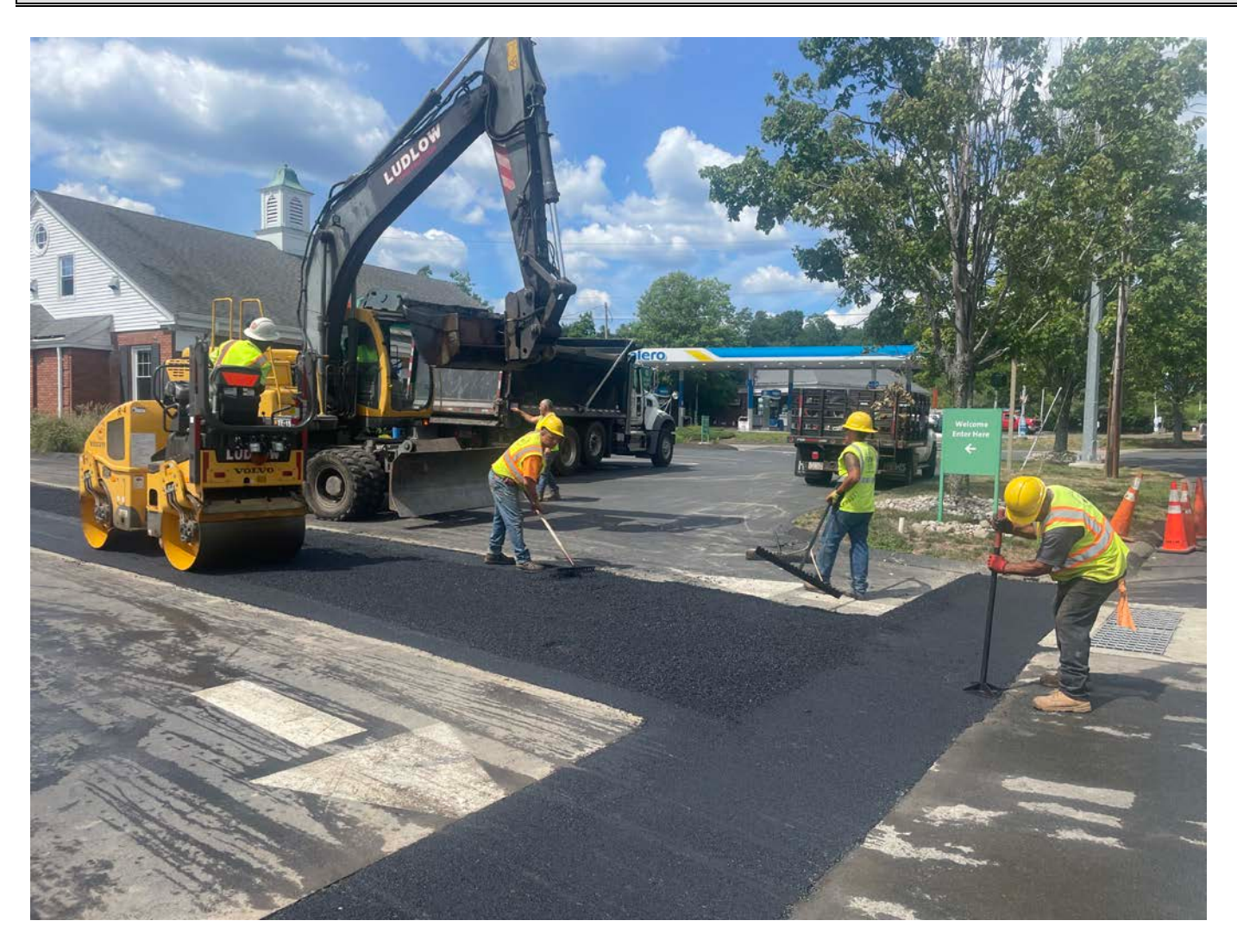
Picture 9: Ludlow grading and compacting the second lift of asphalt that they placed within the footprint of the trench overcut and the shared driveway apron for the 370 and 376 Main Street, Durham, properties with a jumping jack. View to the north.

Contractor: Ludlow Construction Page: 11 of 11