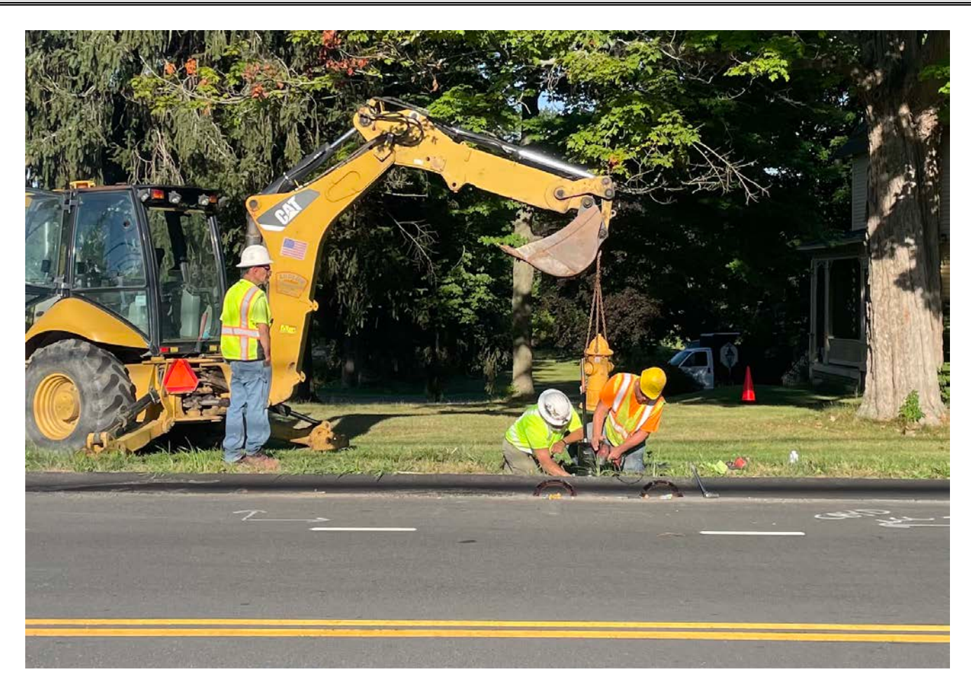
Picture 2: Ludlow installing a 1' extension on a hydrant located in front of 328 Main Street, Durham. View to the east.