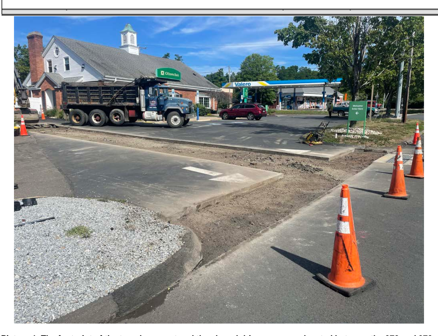
Picture 4: The footprint of the trench overcut and the shared driveway apron located between the 370 and 376 Main Street, Durham, properties after Ludlow removed the old asphalt from within the footprints. View to the northwest.