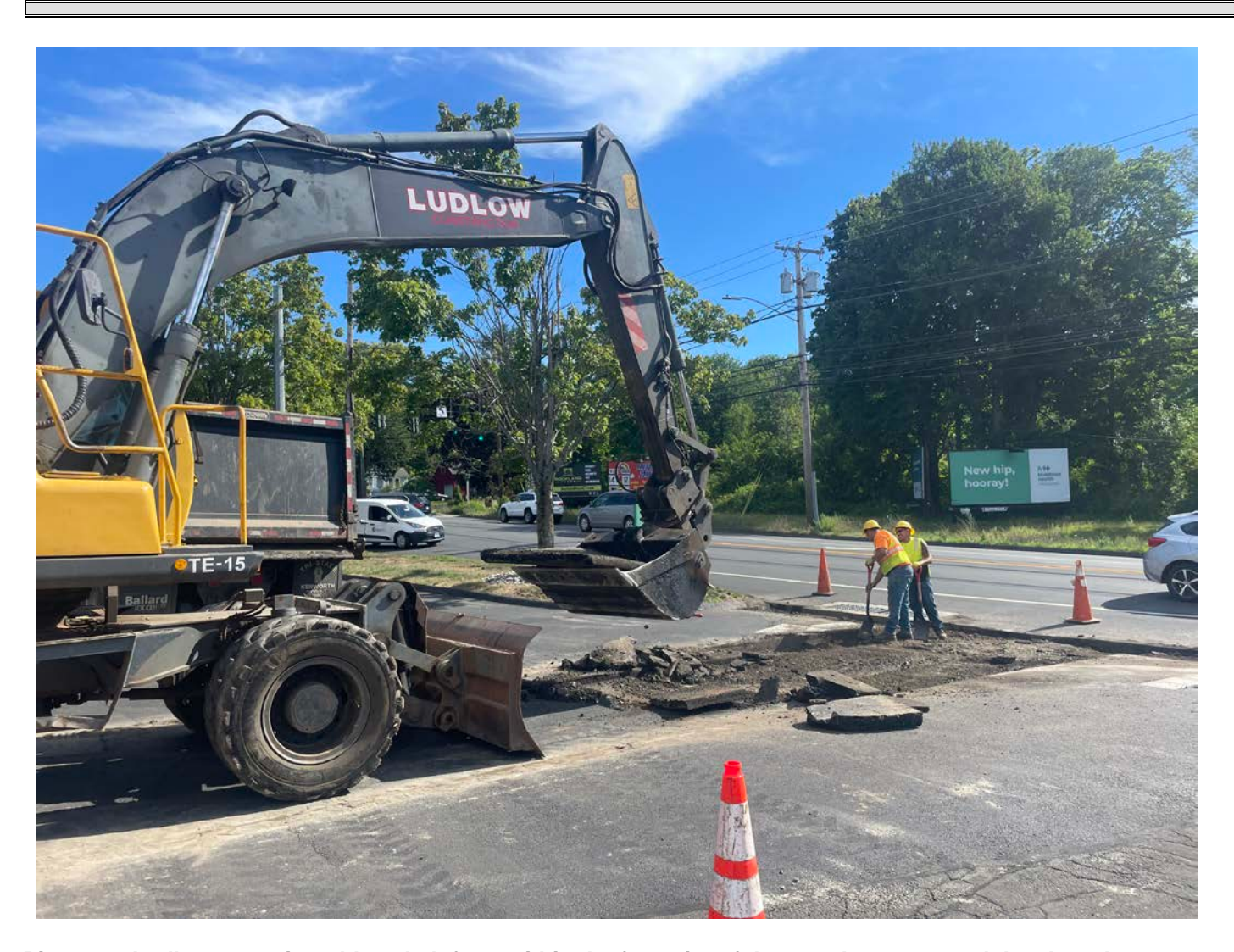
Picture 3: Ludlow removing old asphalt from within the footprint of the trench overcut and the shared driveway apron located between the 370 and 376 Main Street, Durham, properties. View to the northeast.