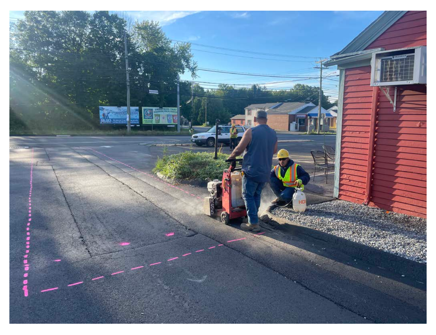
Picture 1: Ludlow saw cutting the footprint of a trench overcut located between 370 and 376 MainStreet in Durham. View to the east.

Contractor: Ludlow Construction Page: 3 of 11