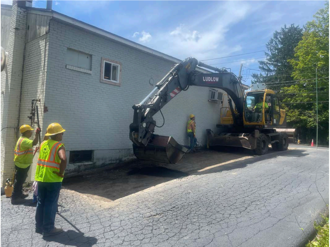
Picture 9: Ludlow placing the first of two lifts of asphalt on the footprint of the trench overcut located on the 325 Main Street, Durham, property. View to the west.