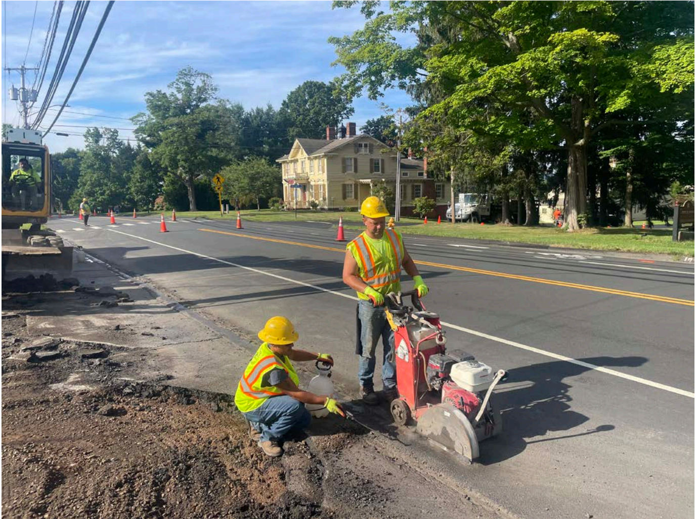
Picture 7: Ludlow saw-cutting pavement along the west side of the shared driveway apron for the 325 and 327 Main Street, Durham, properties. View to the southwest.