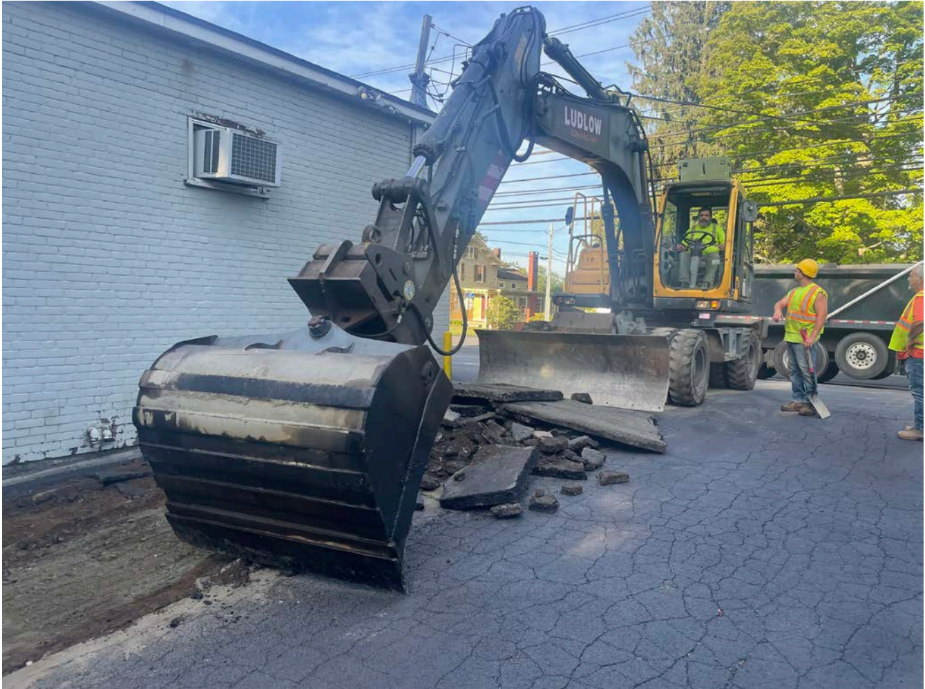
Picture 1: Ludlow stripping asphalt from within the footprint of the trench overcut located on the 325 Main Street, Durham, property. View to the west.