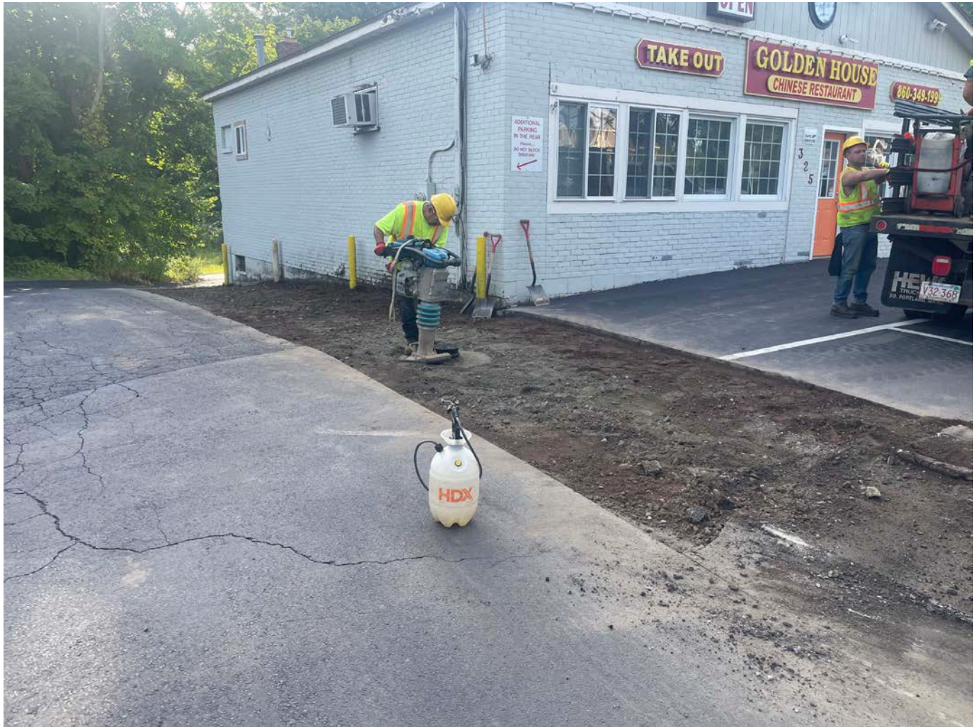
Picture 3: Ludlow compacting soil around a roadbox located within the footprint of the trench overcut located on the 325 Main Street, Durham, property. View to the southeast.