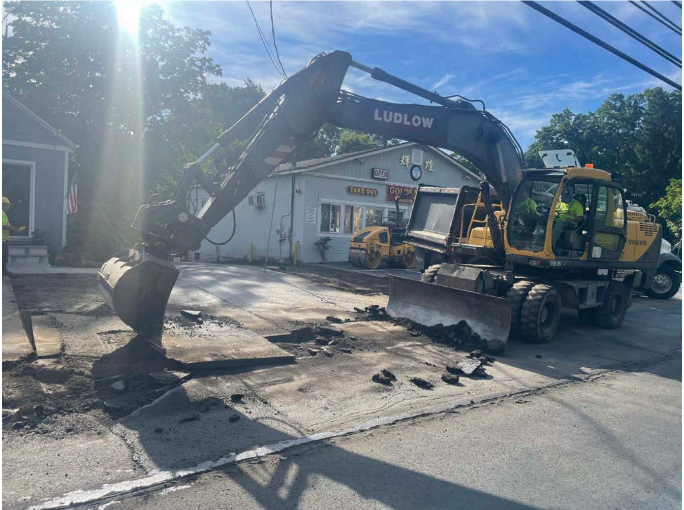
Picture 6: Ludlow stripping pavement from the footprint of the shared driveway apron for the 325 and 327 Main Street, Durham, properties. View to the southeast.