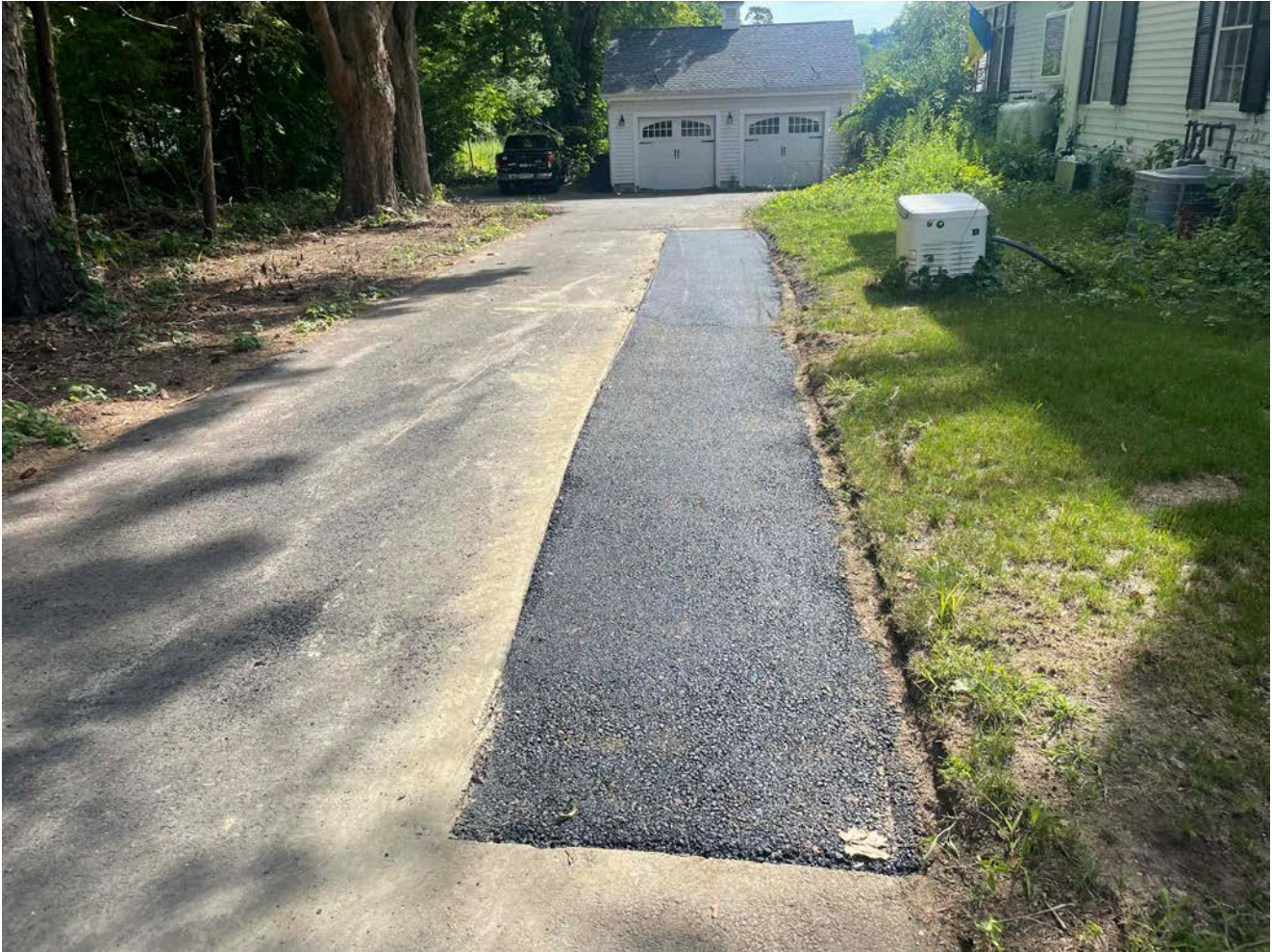
Picture 2: The south edge of the driveway of the 313 Main Street, Durham, property where Ludlow will place a second lift of asphalt today. View to the east.

Project: Durham Meadows Pipeline Installation Date: August 15, 2022 Location: Main Street, Durham Day of Week: Monday Project #: AECOM: 6061487 Report No: 489 Contractor: Ludlow Construction Page: 5 of 14