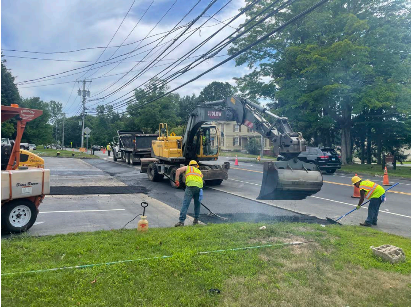
Picture 11: Ludlow placing the second lift of asphalt on the shared driveway apron for the 325 and 327 Main Street properties. View to the southwest.