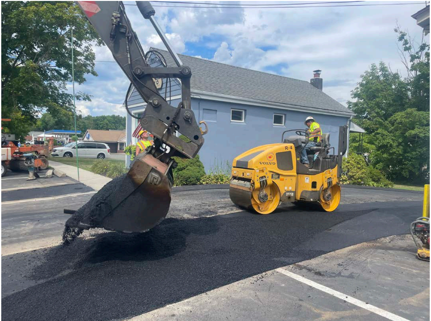
Picture 10: Ludlow placing the second lift of asphalt on the trench overcut footprint at the 325 Main Street, Durham, property. View to the northeast.