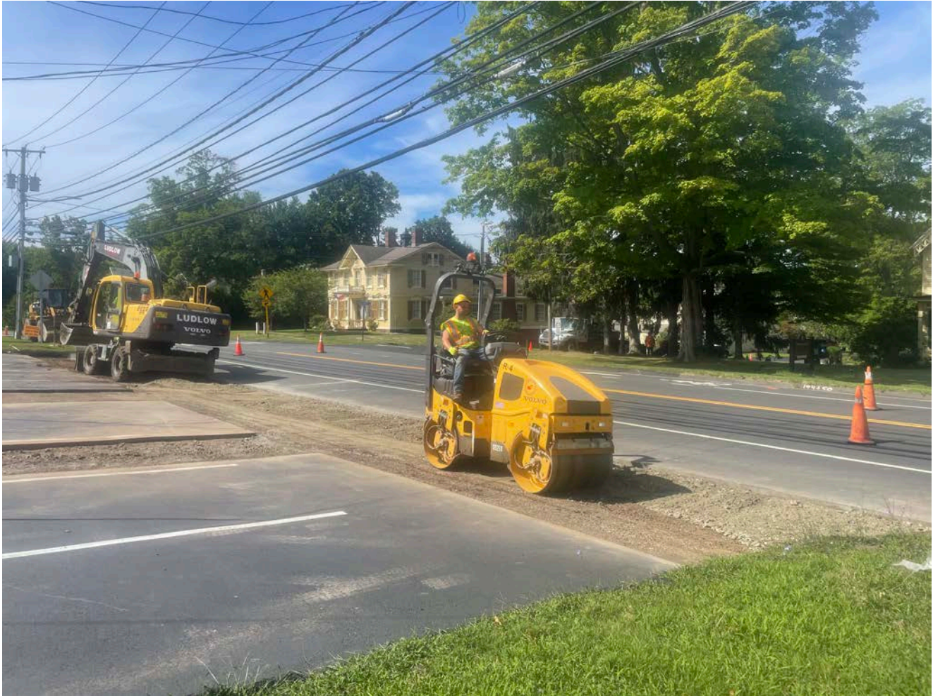
Picture 8: Ludlow compacting the fill located within the footprint of the shared driveway apron for the 325 and 327 Main Street, Durham, properties. View to the southwest.