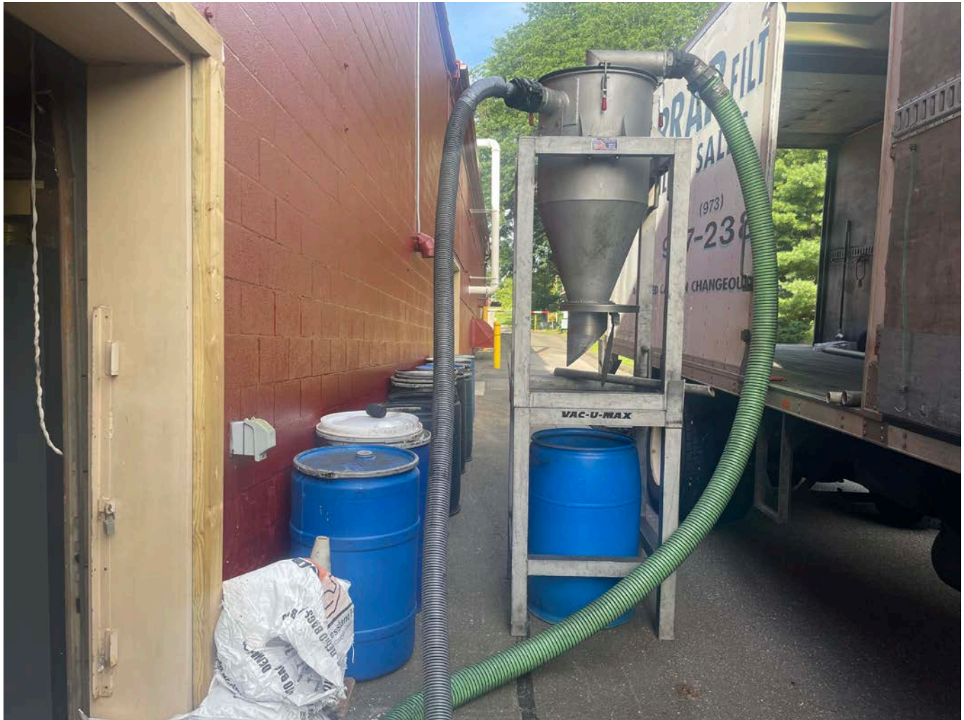
Picture 5: Farrar Filter Co. Inc. set up to transfer the carbon in two GAC vessels located at the Durham Manufacturing facility into poly drums for offsite disposal. View to the west.