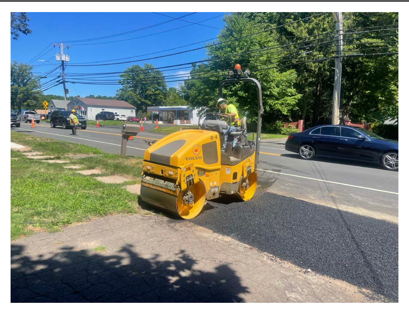
Picture 8: Ludlow using a rolling compactor on the first lift of asphalt that they placed within the footprint of the shared driveway apron for the 312 and 316 Main Street, Durham, properties. View to the northeast.