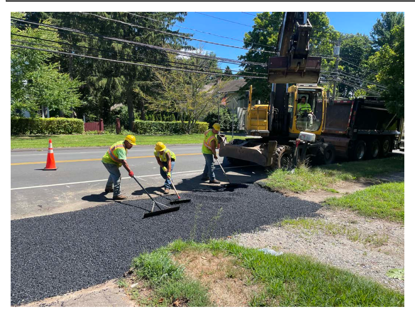
Picture 9: Ludlow grading the first lift of asphalt they placed within the footprint of the shared driveway apron for the 312 and 316 Main Street, Durham, properties. View to the northeast.