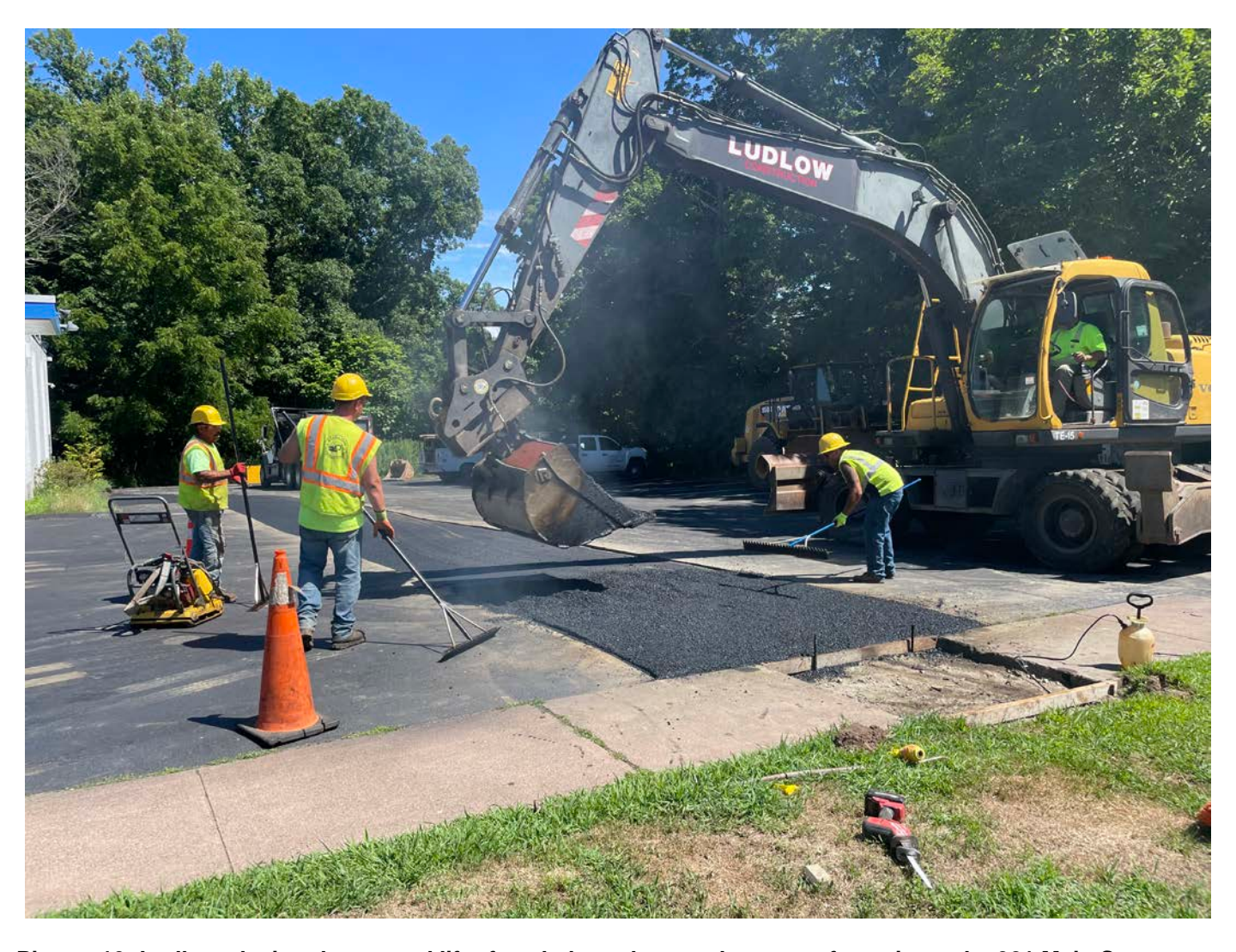
Picture 10: Ludlow placing the second lift of asphalt on the trench overcut footprint at the 321 Main Street, Durham, property. View to the southeast.

Contractor: Ludlow Construction Page: 13 of 13