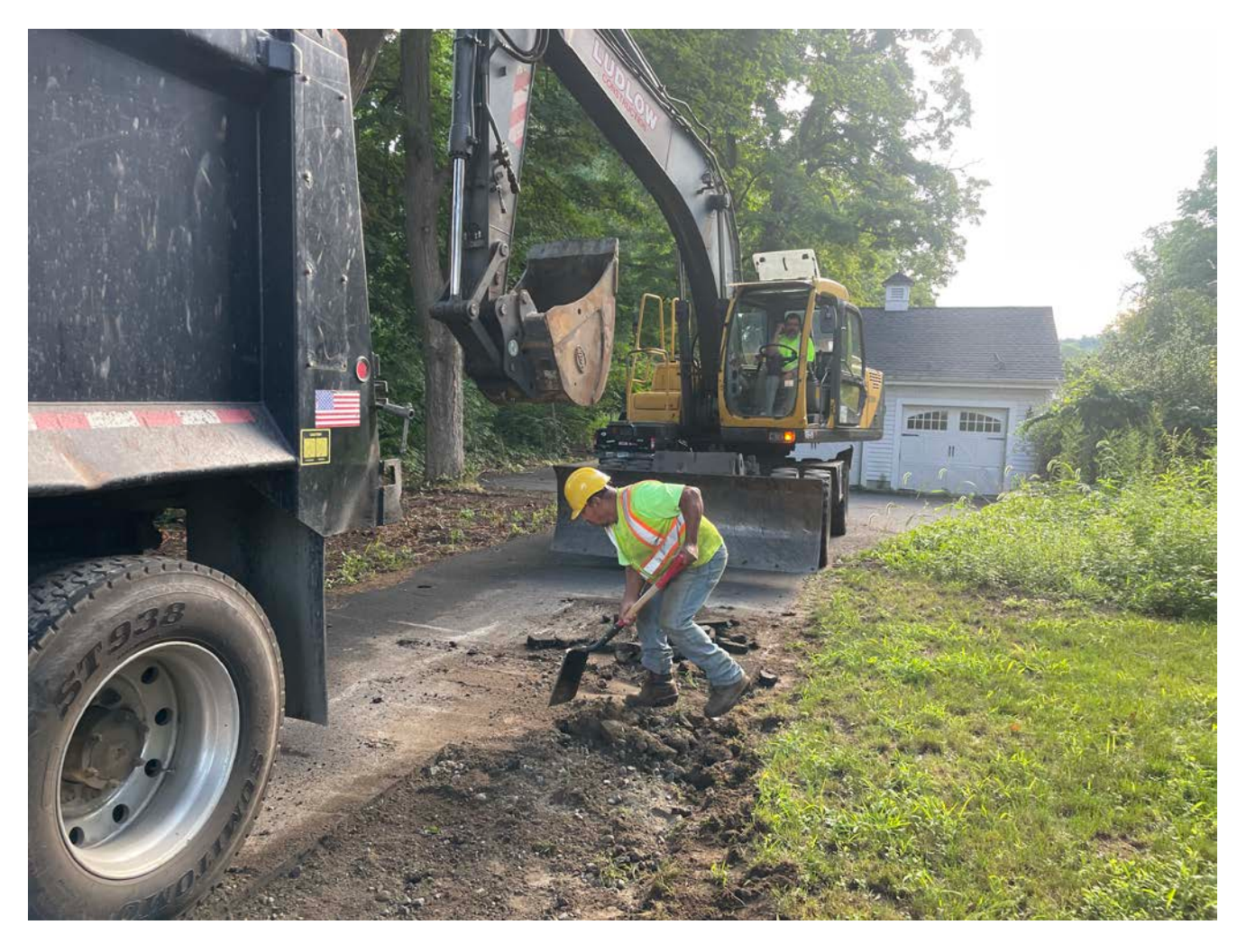
Picture 2: Ludlow excavating temporary paving on the south edge of the driveway of the 313 Main Street, Durham, property as they prepare to place permanent paving. View to the east.