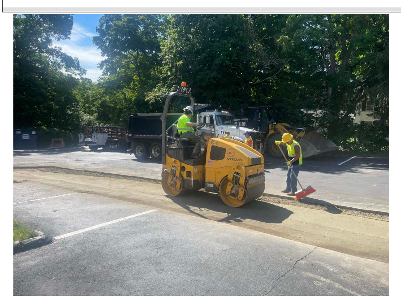
Picture 4: Ludlow compacting -1.25" processed gravel that they placed in the footprint of the trench overcut at the 321 Main Street, Durham, property. View to the southeast.