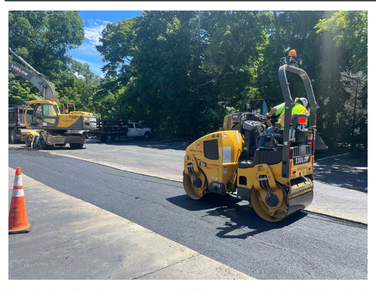
Picture 7: Ludlow using a rolling compactor on the first lift of asphalt that they placed within the footprint of the trench overcut at the 321 Main Street, Durham, property. View to the southeast.

Contractor: Ludlow Construction Page: 10 of 13