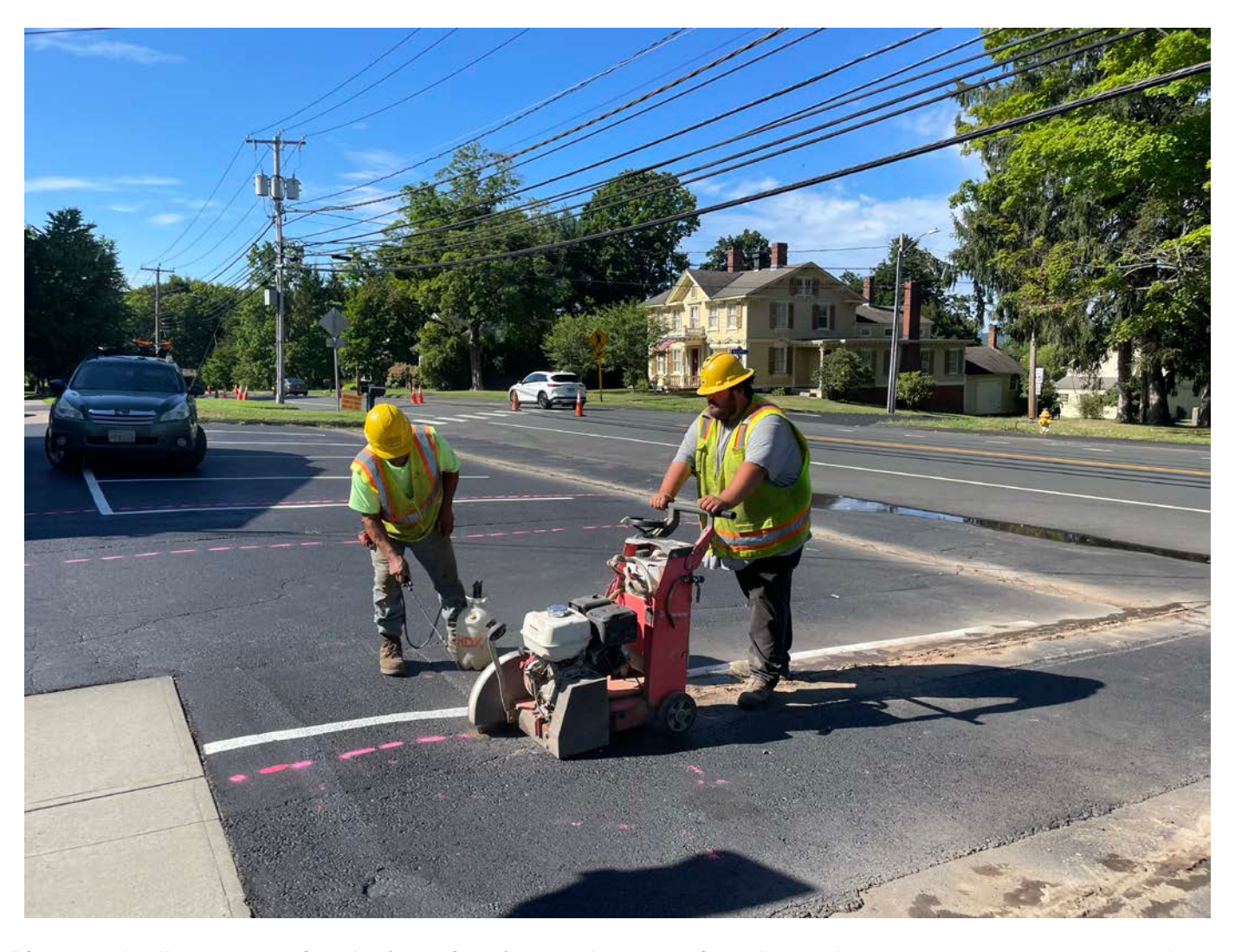
Picture 3: Ludlow saw-cutting the footprint of a trench overcut in order to place permanent pavement on the parking area of the 327 Main Street, Durham, property. View to the southwest.

Contractor: Ludlow Construction Page: 6 of 13