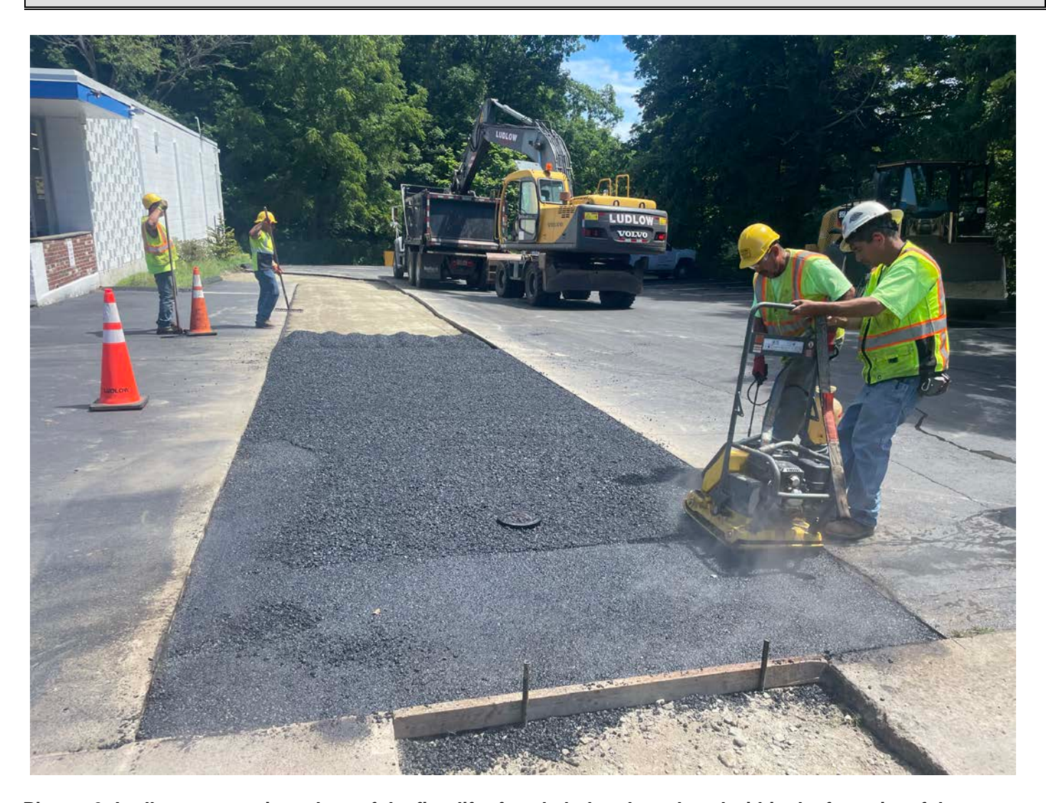
Picture 6: Ludlow compacting edges of the first lift of asphalt that they placed within the footprint of the trench overcut at the 321 Main Street, Durham, property. View to the east.