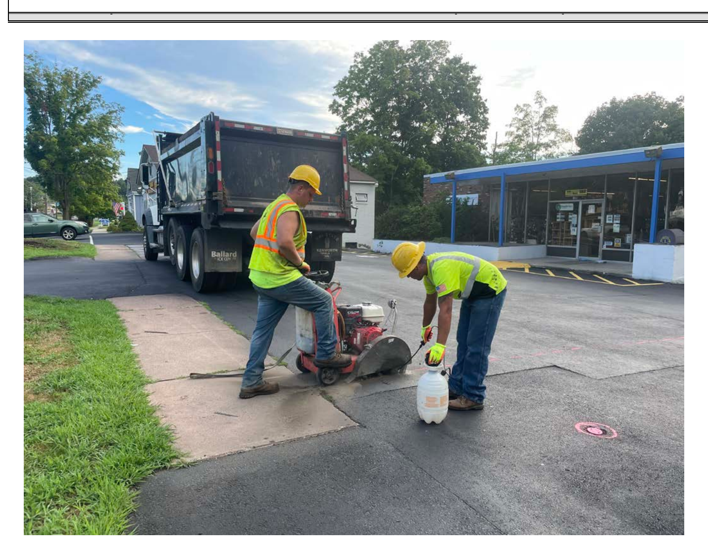
Picture 1: Ludlow saw-cutting the footprint of a trench overcut in order to place permanent pavement on the driveway of the 321 Main Street, Durham, property. View to the north.

Contractor: Ludlow Construction Page: 4 of 13