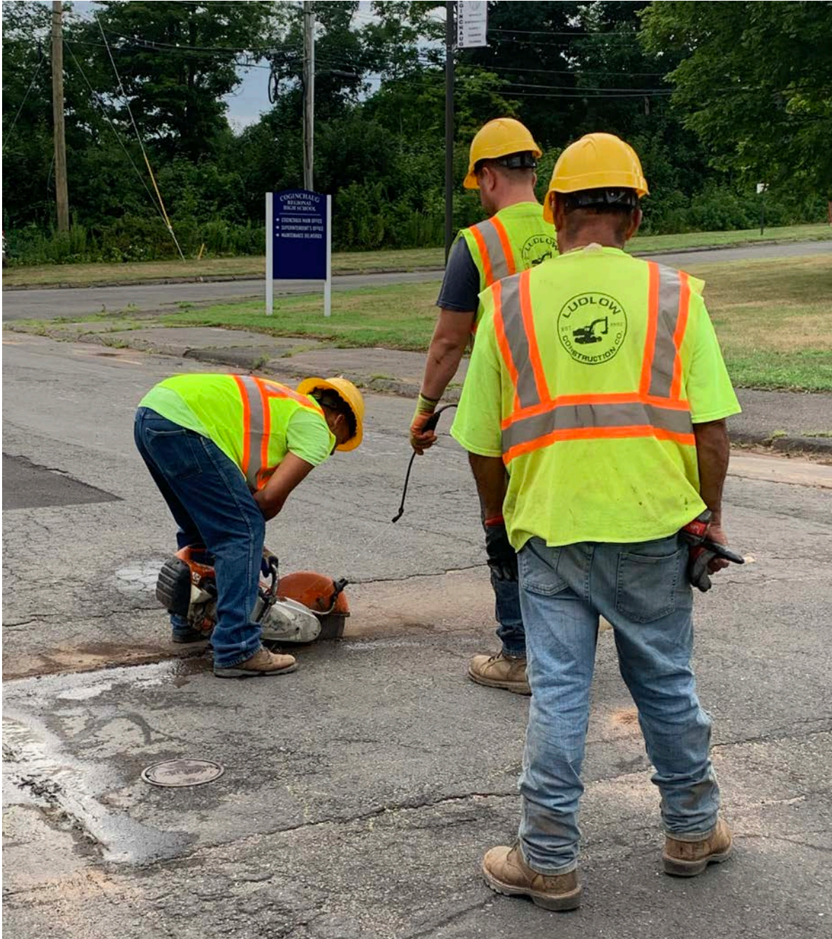
Photo 1: Ludlow Construction begins to cut a section of the road on Pickett Lane.