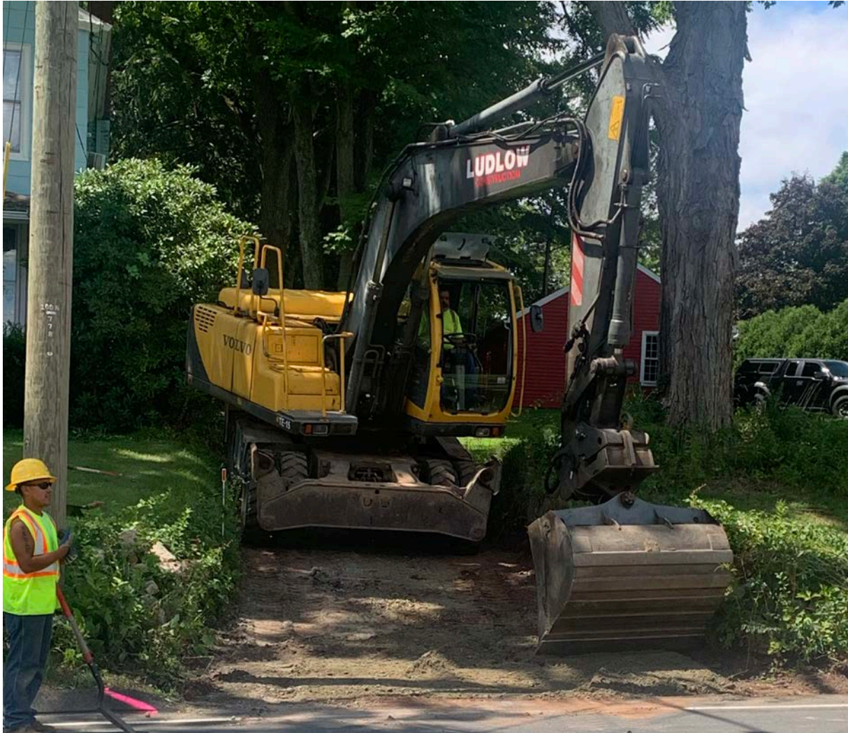
Photo 7: Ludlow Construction is removing the blacktop on 208 Main St.

Project: Durham Meadows Pipeline Installation Date: August 10, 2022 Location: Coginchaug Regional High School, Pickett Lane, Durham Day of Week: Wednesday Project #: AECOM: 60614871 Report No: 486 Contractor: Ludlow Construction Page: 9 of 11