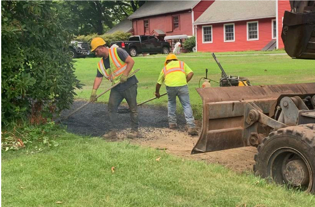
Photo 9: Ludlow Construction is laying asphalt at the 208 Main St. driveway.