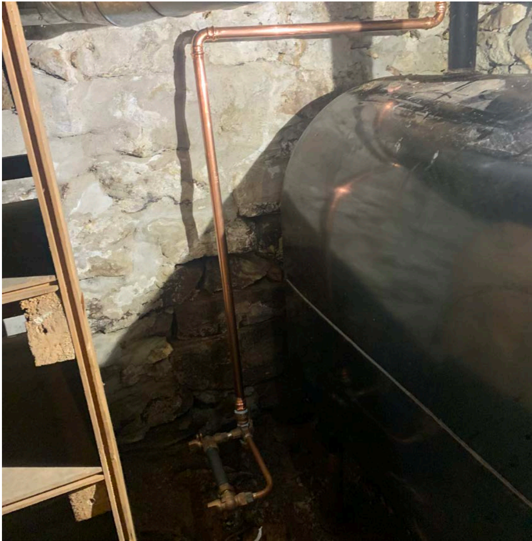
Photo 8: Fazzino Plumbing is at 63 Maiden Lane installing the final interior water service connection.