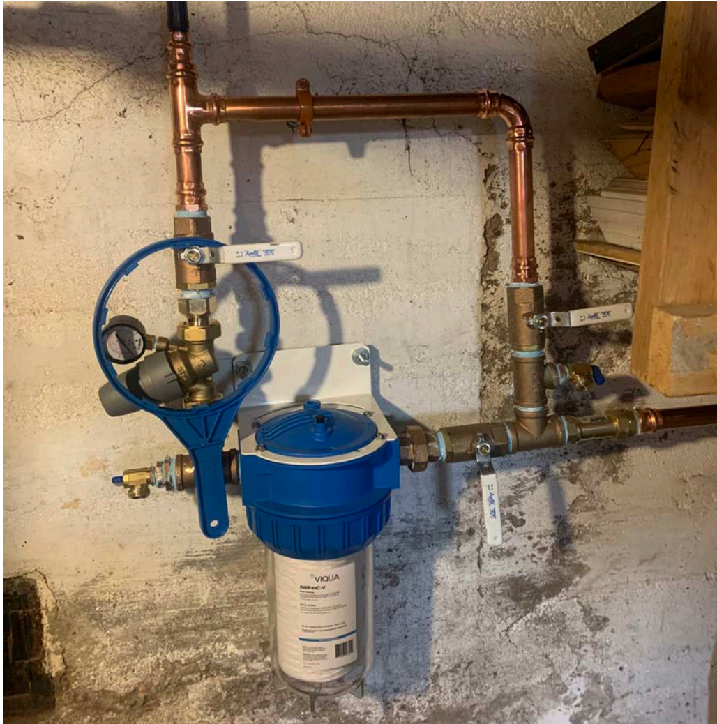
Photo 6: Fazzino Plumbing is at 200 Maple Ave installing the final interior water service connection.