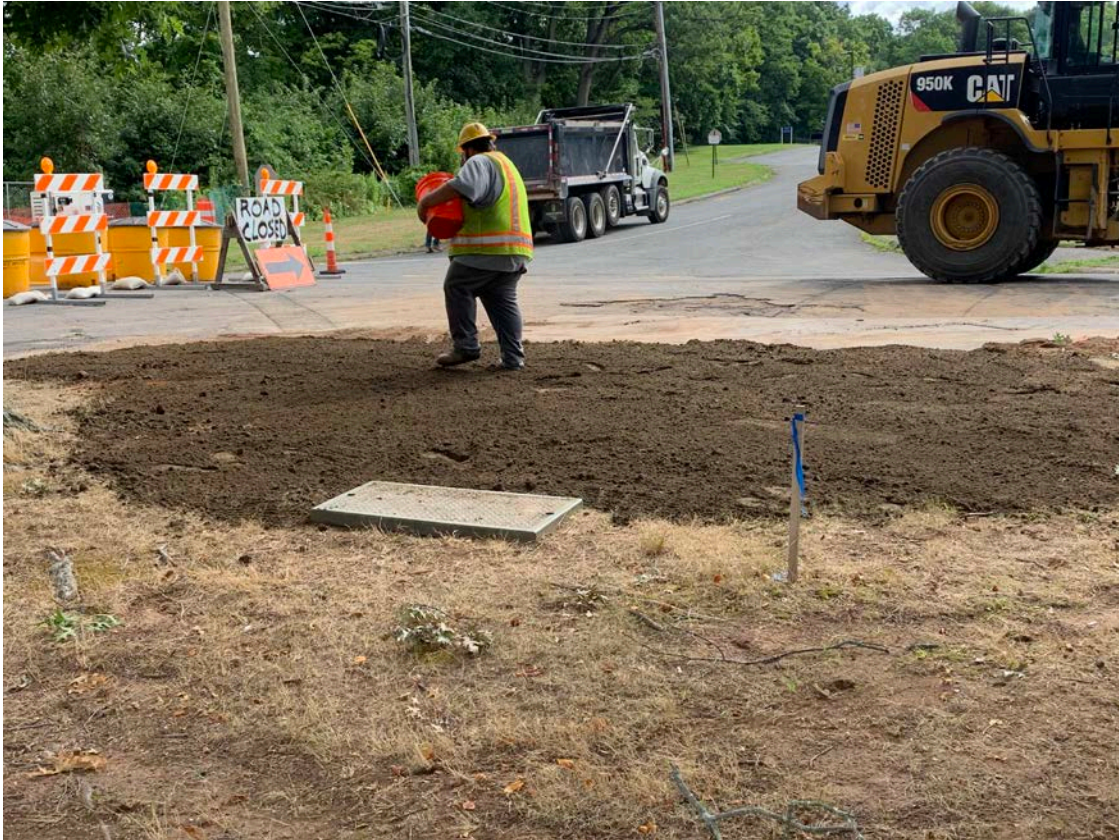
Photo 4: Ludlow construction placing loam and seed at Korn School.