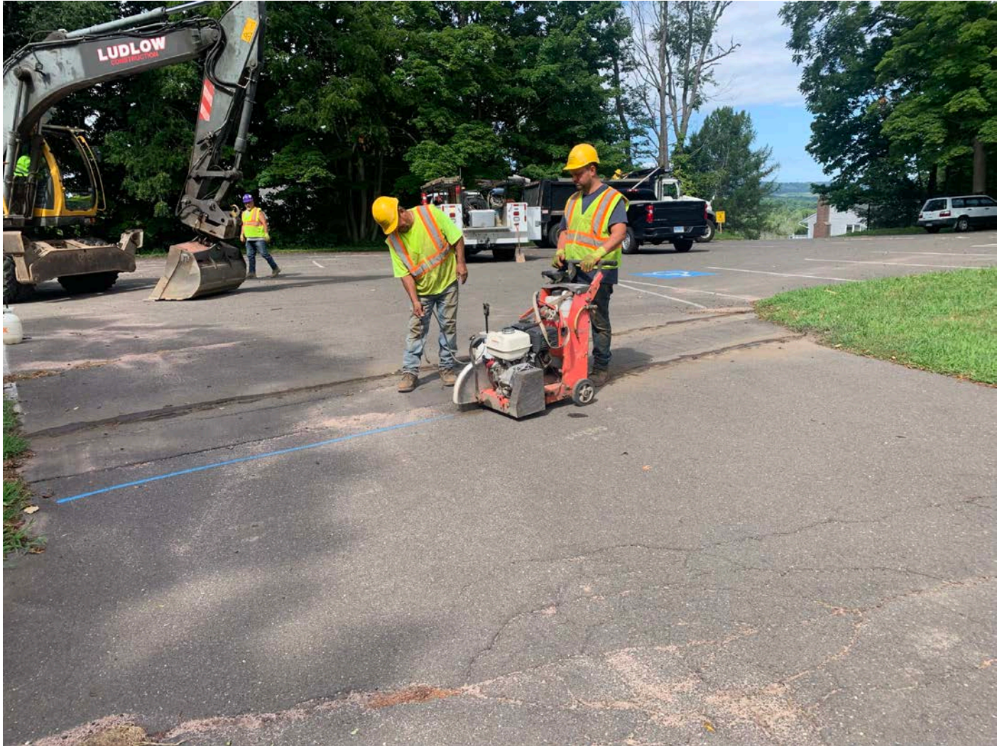
Photo 5: Ludlow Construction using a saw to cut the blacktop at United Methodist Church of Durham.