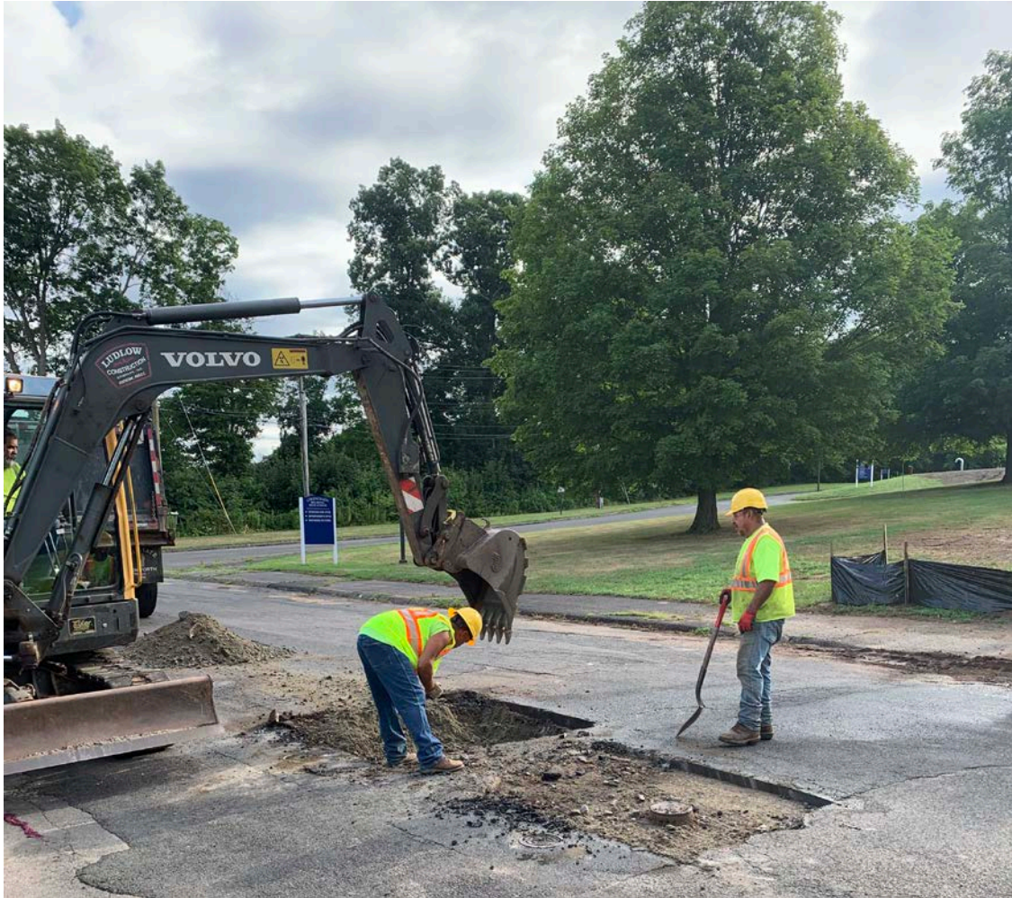
Photo 2: Ludlow Construction removes the blacktop of the two sections that were cut prior. Ludlow Construction begins the excavation to remove two blow-off valves in each of the respective locations.