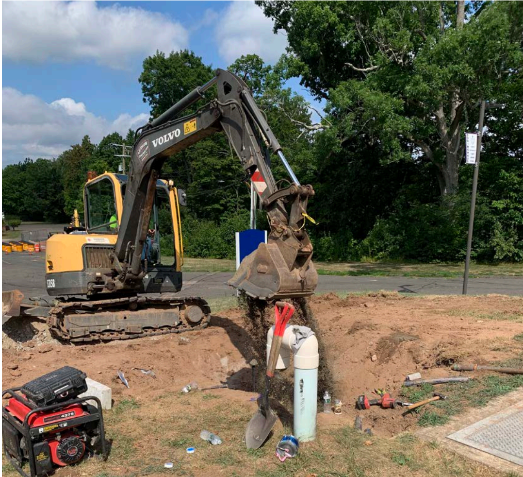
Picture 4: Ludlow Construction is backfilling the trench excavation near the District 13 sprinkler system vault with a combination of soil, gravel, and sand with an excavator.