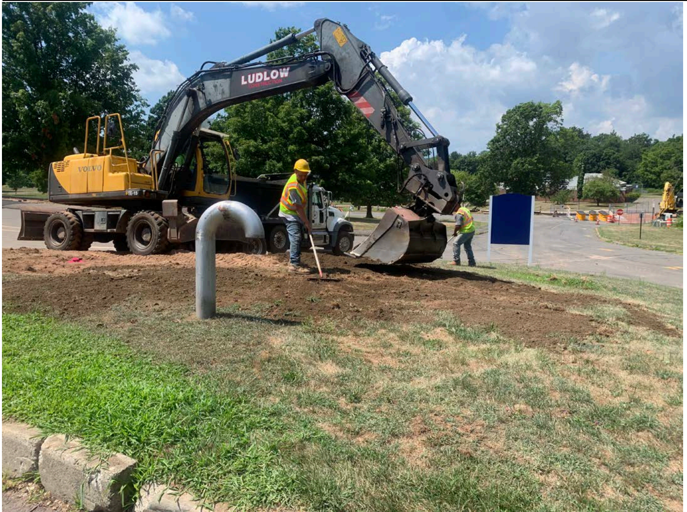
Picture 5: Ludlow Construction is at an excavation trench west of the District 13 regional superintendent parking lot and has fully backfilled the trench by topping it off with loam. Ludlow construction uses an excavator, and personnel to rake the topsoil.