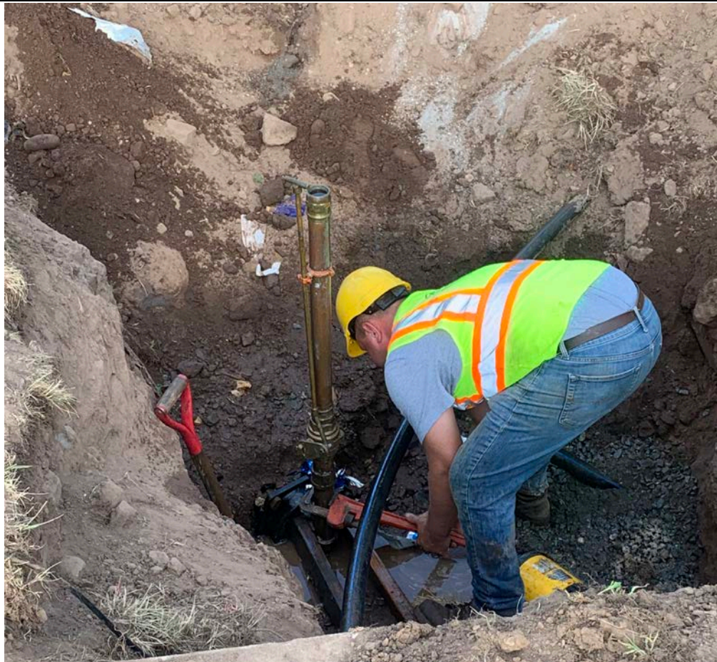
Picture 1: Ludlow Construction is disassembling a temporary blow-off valve that is in an excavation trench west of the District 13 regional superintendent parking lot.