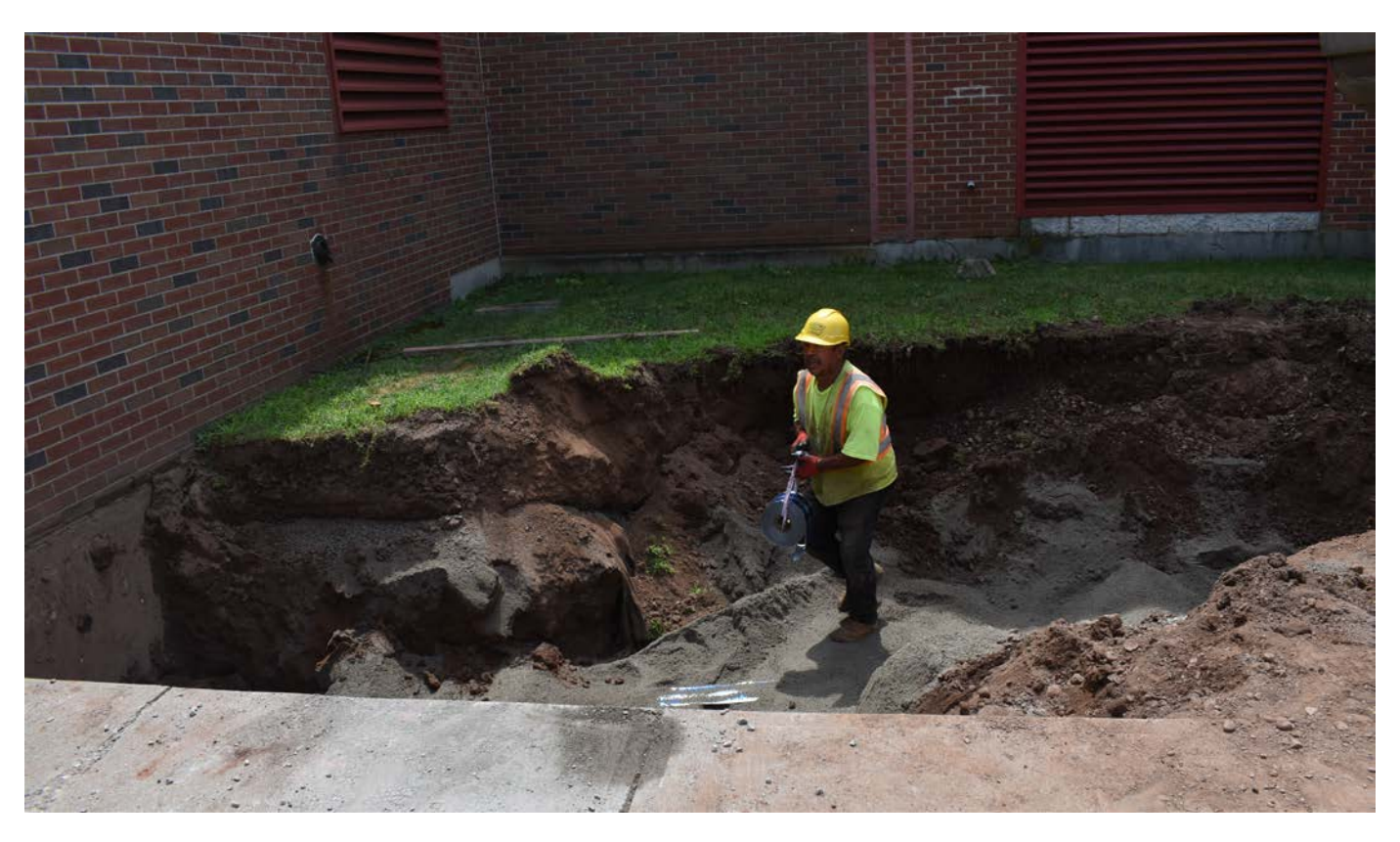
Photo 6: Ludlow laborer placing marker tape over new supply line. View to the south.

Contractor: Ludlow Construction Page: 8 of 9