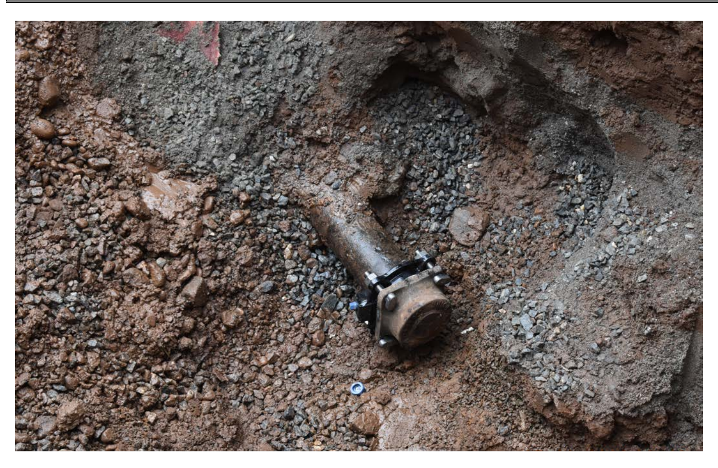
Photo 4: Capping completed at end of existing supply pipe adjacent to school. View to the northwest.

Contractor: Ludlow Construction Page: 6 of 9