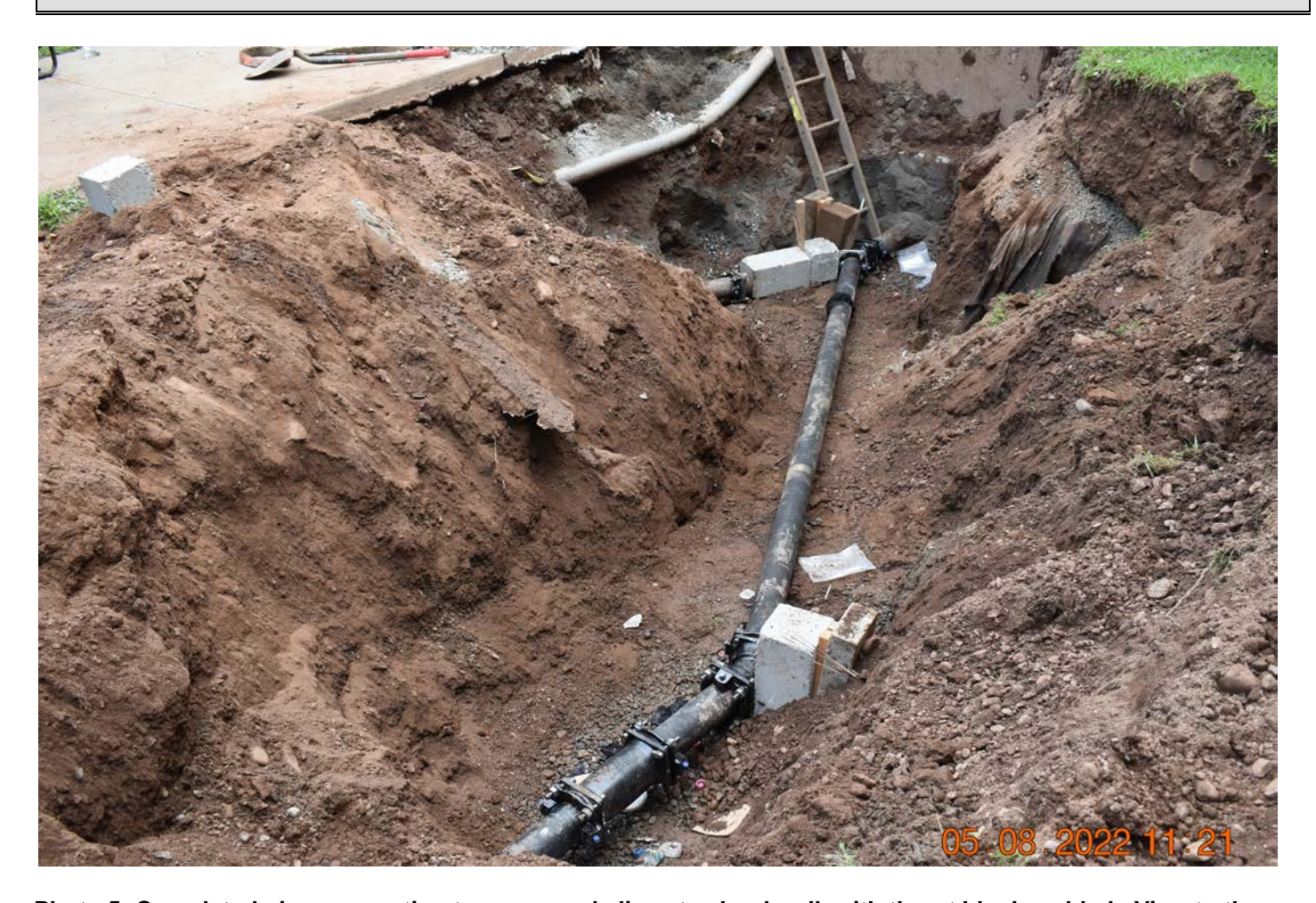
Photo 5: Completed pipe connection to new supply line at school wall, with thrust blocks added. View to the east.

Contractor: Ludlow Construction Page: 7 of 9